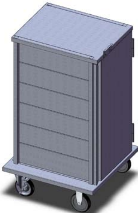
Shown with options