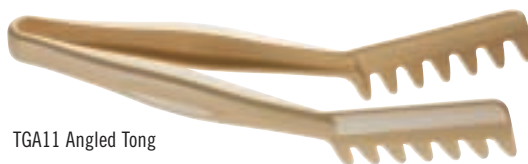
TGA11 Angled Tong