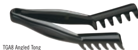
TGA8 Angled Tong