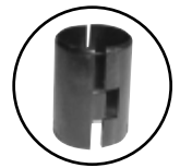
Tapered Split Sleeve