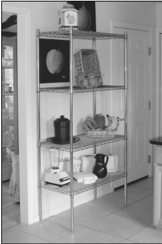
Includes 4 Shelves and 4 - 74" Posts