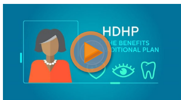
HDHP with HSA

All videos are available in Spanish. License costs include hosting, embedding and reporting.