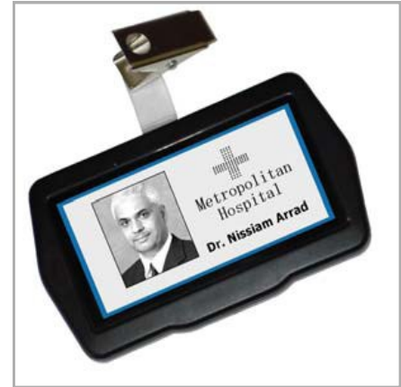
Stand-Alone Badge Configuration

Small in size (5.0cm x 8.3cm x 0.9cm) and weight (32 grams) the Active Identity Badge is housed in an epoxy potted, IP66 rated, weatherproof black thermoplastic outer casing. Powered by a single, replaceable lithium long life battery (five-year estimated usage), the badge's power efficient design ensures years of maintenance free deployments in harsh indoor and outdoor environments such as manufacturing operations, medical facilities or maximum security correctional institutions.