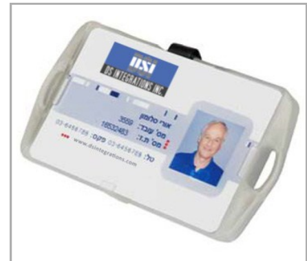
Open-Front Card Holder Configuration