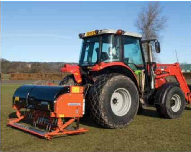
Dundee Council's new Wiedenmann Terra Spike XF8.