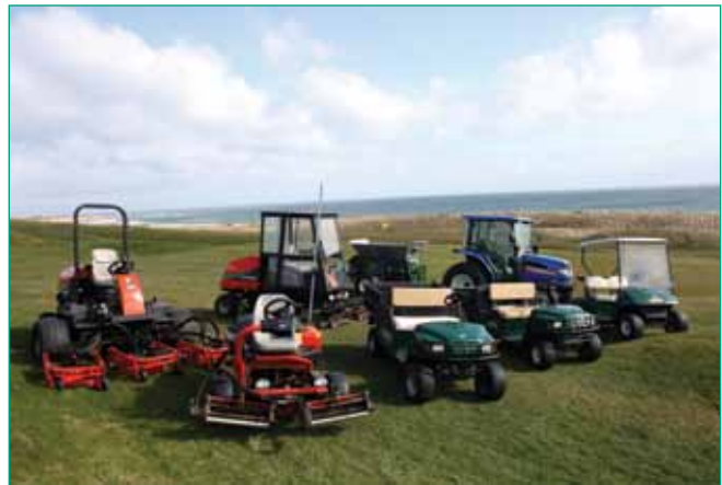
Peterhead Golf Club take delivery of their new fleet.

Heading further north, Fairways GM is the preferred partner for Peterhead Golf Club and the greenkeeping team have been making good use of the new additions to its fleet, including a Jacobsen LF 3400 fairways mower, an AR250 turbo rotary mower, a Turfco 1530 trailed top dresser, a G-Plex III , an Iseki tractor plus new E-Z-GO golf buggies and MPT workhorses.