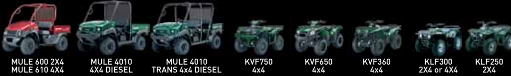
MULE 600 2X4 MULE 610 4X4