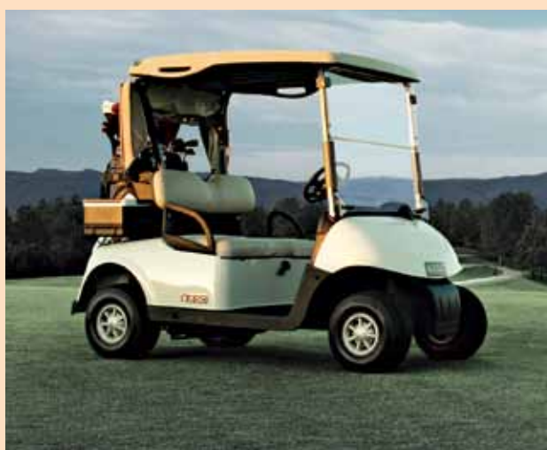
E-Z-GO RXV Golf Car.

"Since many golf courses replace their golf cart fleets every three to five years, the opportunity to invest in more efficient technology could show dramatic impacts in charging efficiency over a relatively short time horizon," the SCE report stated.