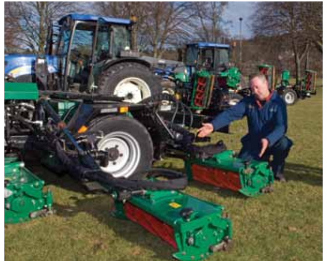
Hydraulic TG® Range at Perth & Kinross Council.

In the central belt, Fairways successfully secured the tender with Perth & Kinross Council to supply grass cutting equipment to the grounds maintenance team, supported by an ongoing service package. The deal covered the hydraulic TG® range by Ransomes, with three TG3400s and two TG4650s now tackling the local authority's parks, playing fields and grass verges. Quick to attach and disconnect from the tractor unit, the TG® range is popular with local authorities, grounds care contractors and turf growers as the cutting units can be folded in various configurations to suit the terrain being maintained.