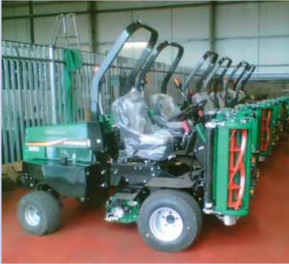
Falkirk Council's new Parkway 2250s.

Fairways continues to strengthen its links with the local authority sector and has worked with municipal clients throughout Scotland over the past 12 months. Here are some of the highlights of the past year.