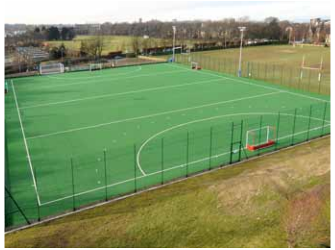
The new pitch at Mary Erskine and Stewart's Melville Schools.

Hockey appears to be the flavour of the month, as the Fairways Sportsgrounds team have also installed a world class hockey pitch at the sportscotland National Centre in Inverclyde. The new installation is a revolutionary water-based hockey pitch using the Triple-T™ synthetic