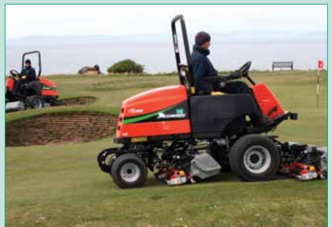
Gullane Golf Club's SLF 1880 fairway mower in action.