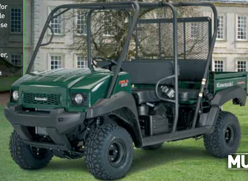
MULE4010 TRANS 4x4 DIESEL

Ask your Utility dealer today about the big difference only Kawasaki can make or call the Kawasaki Information Service on 0845 600 2442.