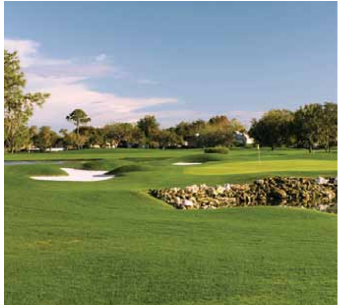
Bay Hill Club and Lodge.

"I have enjoyed working with the various companies for many years and remain a Textron fan because of the unmatched innovation and quality of its equipment as well as the top notch service. All of these qualities are extremely important to me when I purchase equipment or make recommendations to my golf course clients and no one does it better." Palmer said.