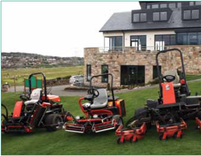
Swanston Golf Club's new fleet.

Coast to coast and from the orders to the north east, Fairways has worked with some key Scottish golf courses over the past 12 months and we would like to thank all our customers for their continued support.