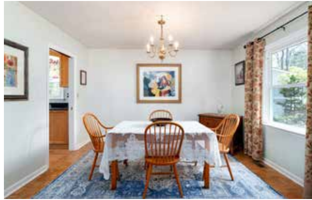
Dining Area off of Kitchen