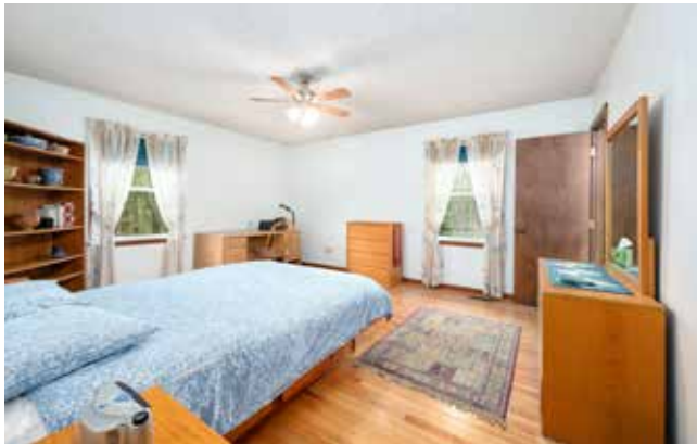
Spacious and Light-Filled Primary Suite