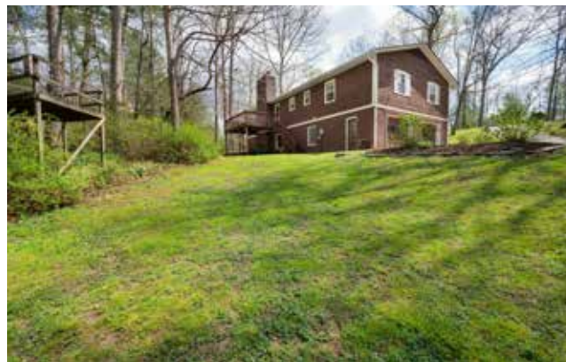
Room for Plants and Play in the Wildlife-Certified Yard

31 TURNBERRY DRIVE Lovingly Cared-for Turnberry Ranch Home Arden, NC 28704