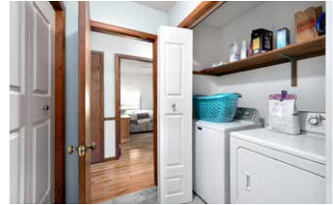
Laundry Closet on Main Level