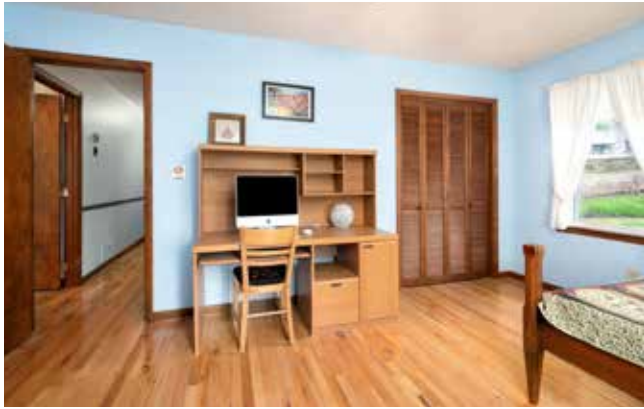
Third Bedroom Makes a Great Home Office