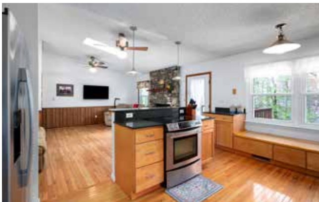
Island with Breakfast Bar