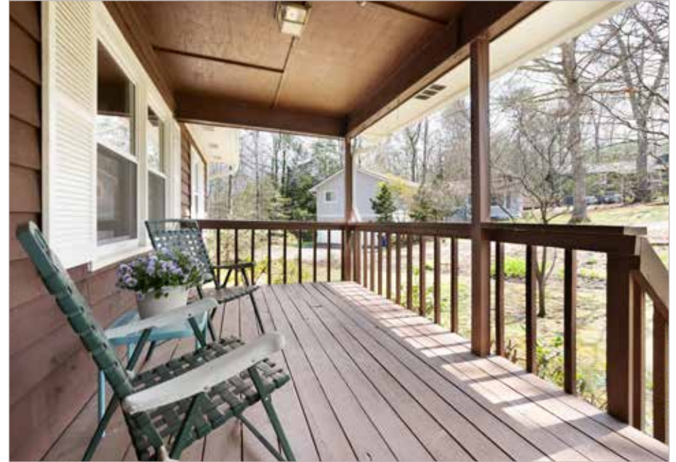
Covered Front Porch for Relaxing