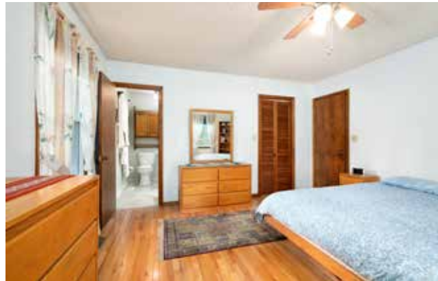
Walk-in Closet and Ensuite Full Bathroom