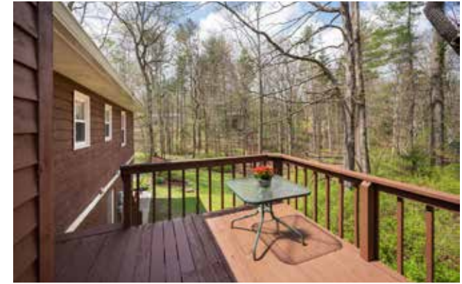
Sunny Back Deck for Al Fresco Dining