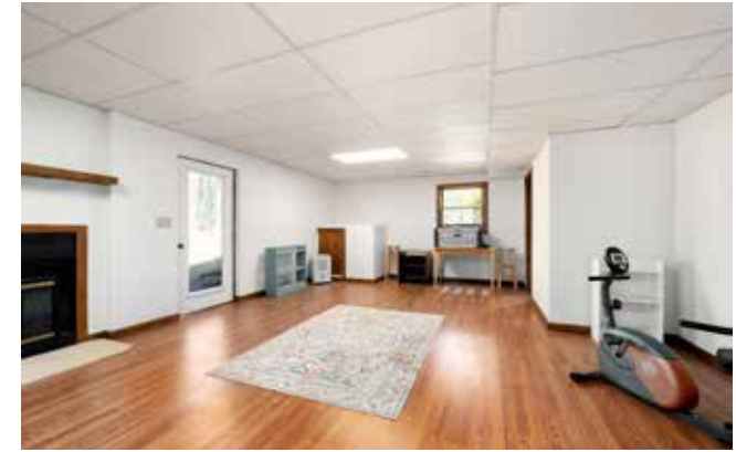
Basement Flex Room with Patio Access