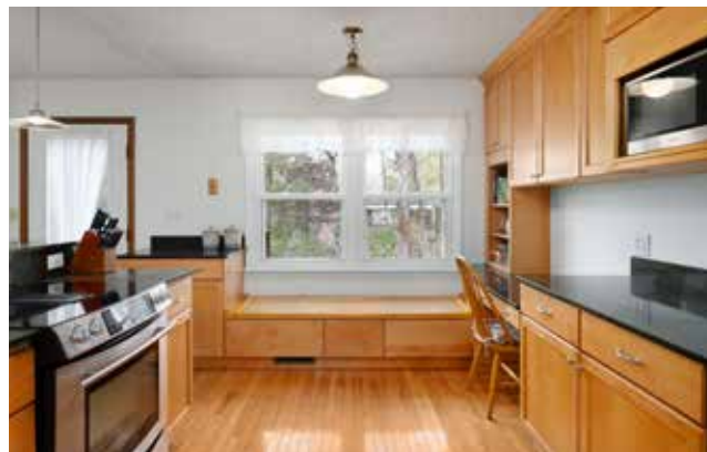
Window Bench Seat with Extra Storage