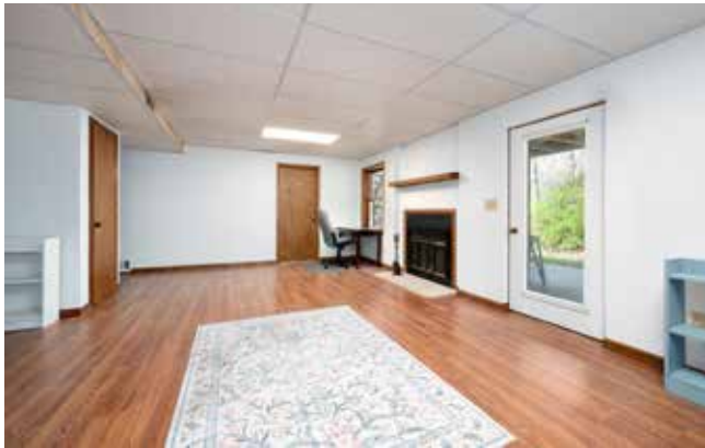
Wood-Burning Fireplace for Chilly Evenings