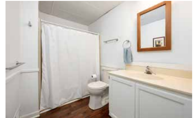
Full Bathroom in Basement