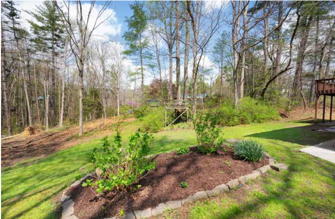
Established Garden Beds Highlight Spacious Yard