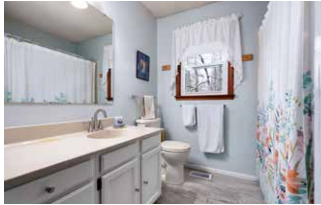
Full Bath with Vanity and Tiled Shower + Tub