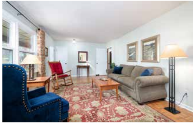
Space for Gathering