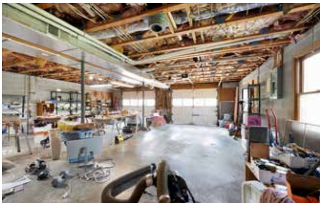
Oversized Garage • Tons of Storage • Space for Workshop