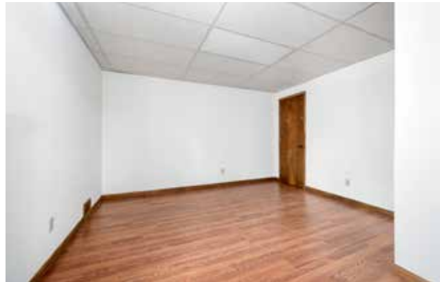
Bonus Room in Basement