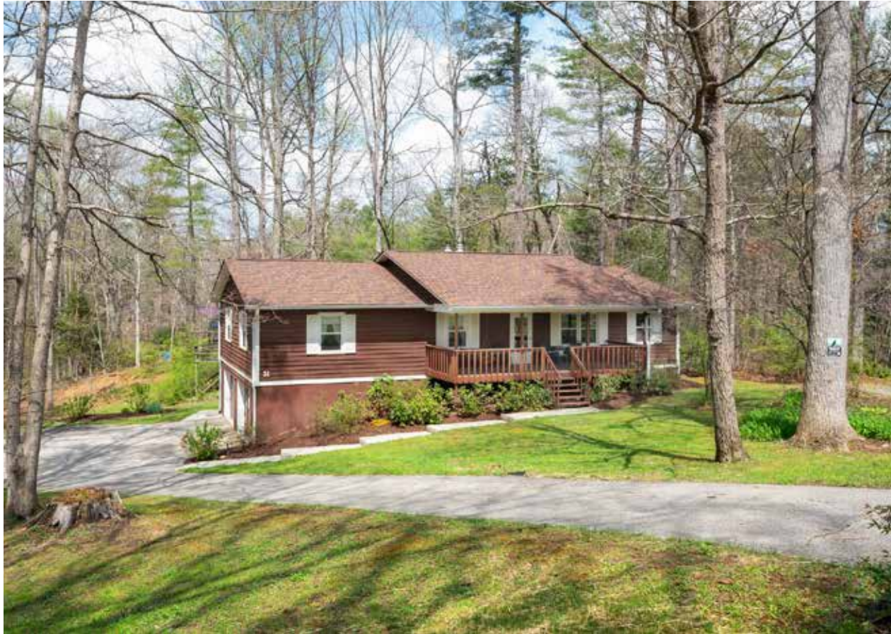
Peaceful and Quiet Setting

Peaceful ranch home nestled on a quiet cul-de-sac in Arden's Turnberry neighborhood. Conveniently located in the T.C. Roberson school district, this home sits at the doorstep of endless area amenities. Recent improvements include a newer roof, newer HVAC and hot water heater, an updated kitchen and a remodeled basement. This property boasts healthy outdoor living with established garden beds for the enthusiast, a covered front porch for relaxing, the sunny back deck for grilling, and a covered lower-level patio. Convenient main-level living includes a living room, family room, updated kitchen, dining room, three bedrooms, two full bathrooms, and a laundry closet. The spacious primary suite has a walk-in closet and a full bath. And there are two more main-level bedrooms, each with ample closet space. Fully finished walk-out basement includes a second living room, bonus room, and full bath. Oversized two-car garage with space for workshop + extra storage.