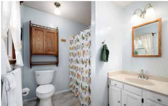
Ensuite Full Bathroom