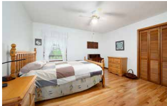
Second Bedroom Also Has Ample Closet Space