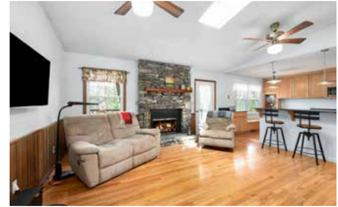
Cozy Family Room with a Stone Fireplace and Skylight