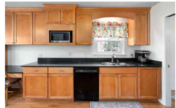
Cabinets with Crown Molding