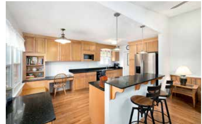
Kitchen Features Silestone Quartz Countertops