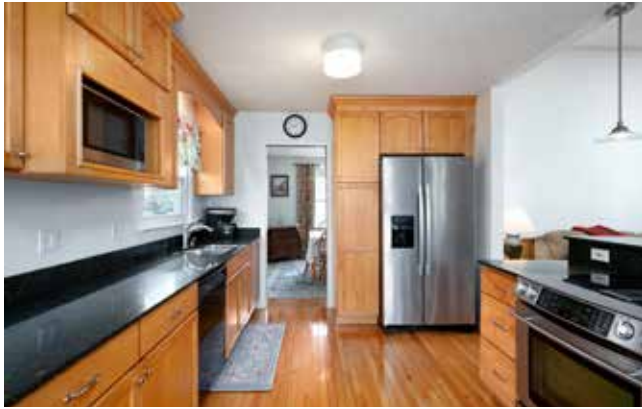
Ample Cabinet and Countertop Space