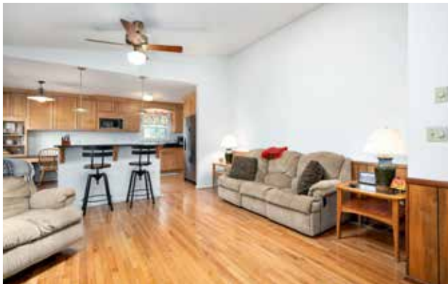
Vaulted Ceiling and Gleaming Hardwood Floor