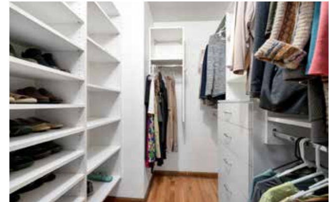
Organizational System in the Walk-in Closet