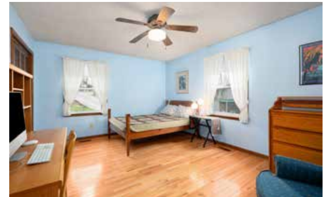
Third Bedroom on Main Level