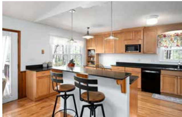
Entertain from the Updated Kitchen