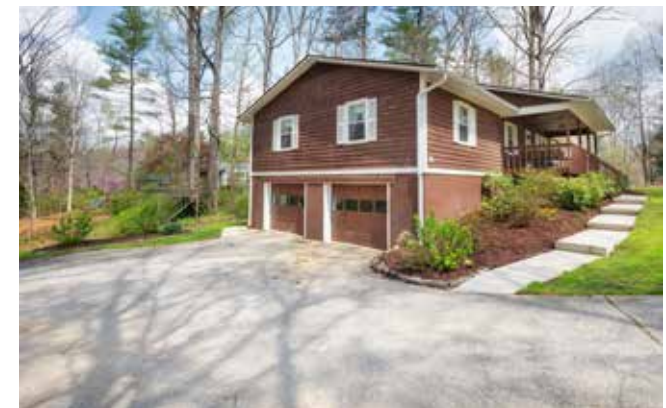
Plenty of Parking in Garage and Driveway