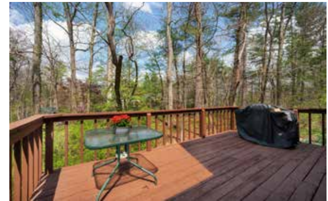
Great for Grilling • Stairs Connect to the Yard