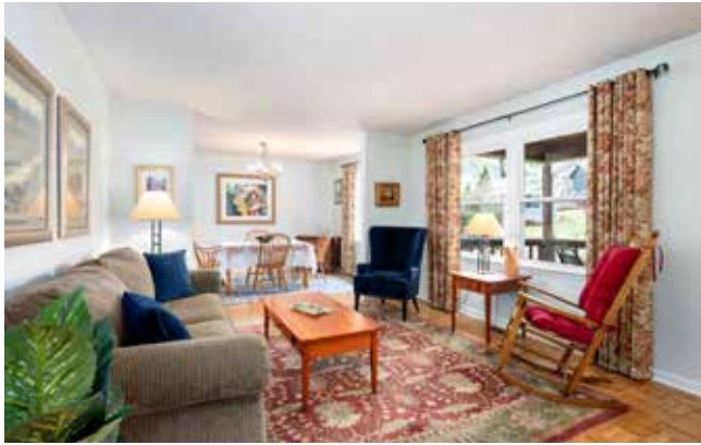
Bright Living Room