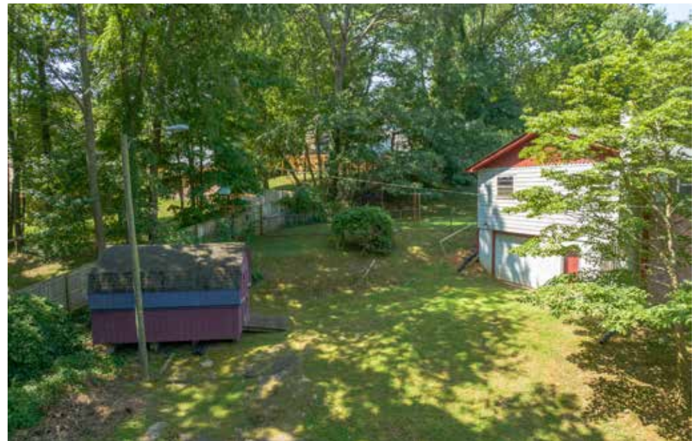
Garage Access and Spacious Storage Unit