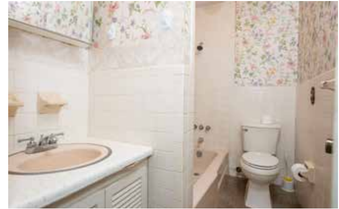
Ensuite Primary Full Bathroom