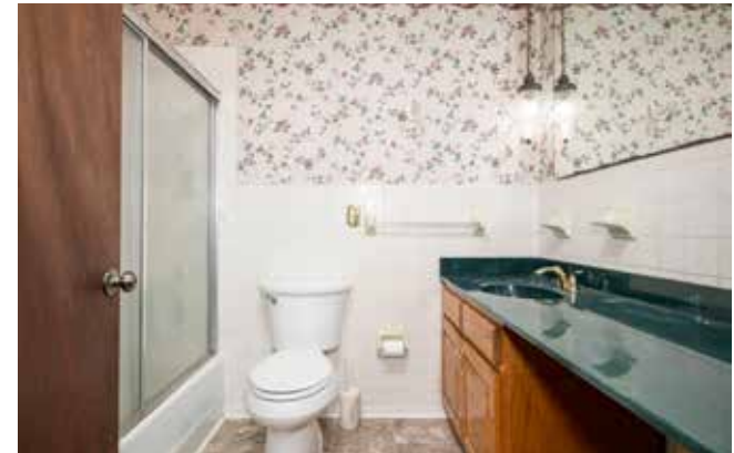
Second Full Bathroom