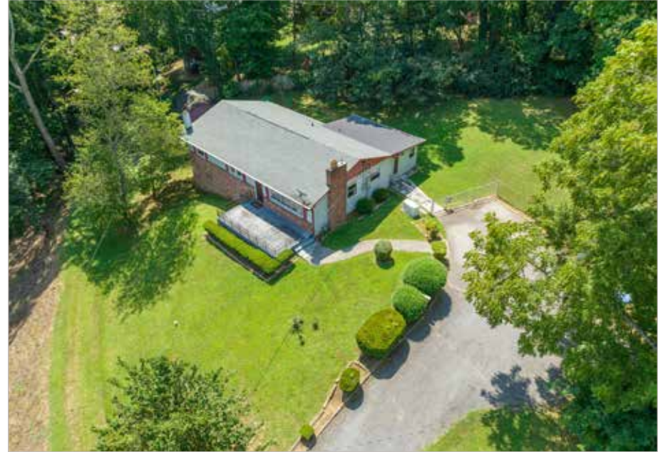
Aerial Shot of House and Property