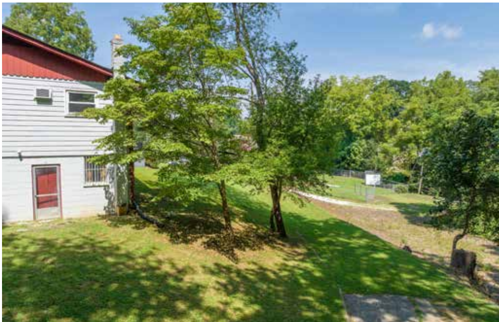
Drive Cut-in for Garage and Storage Unit Access