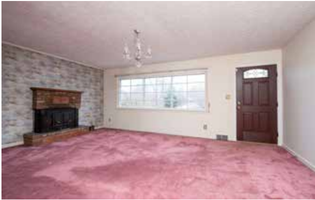
Living Area Boasts Tons of Natural Light