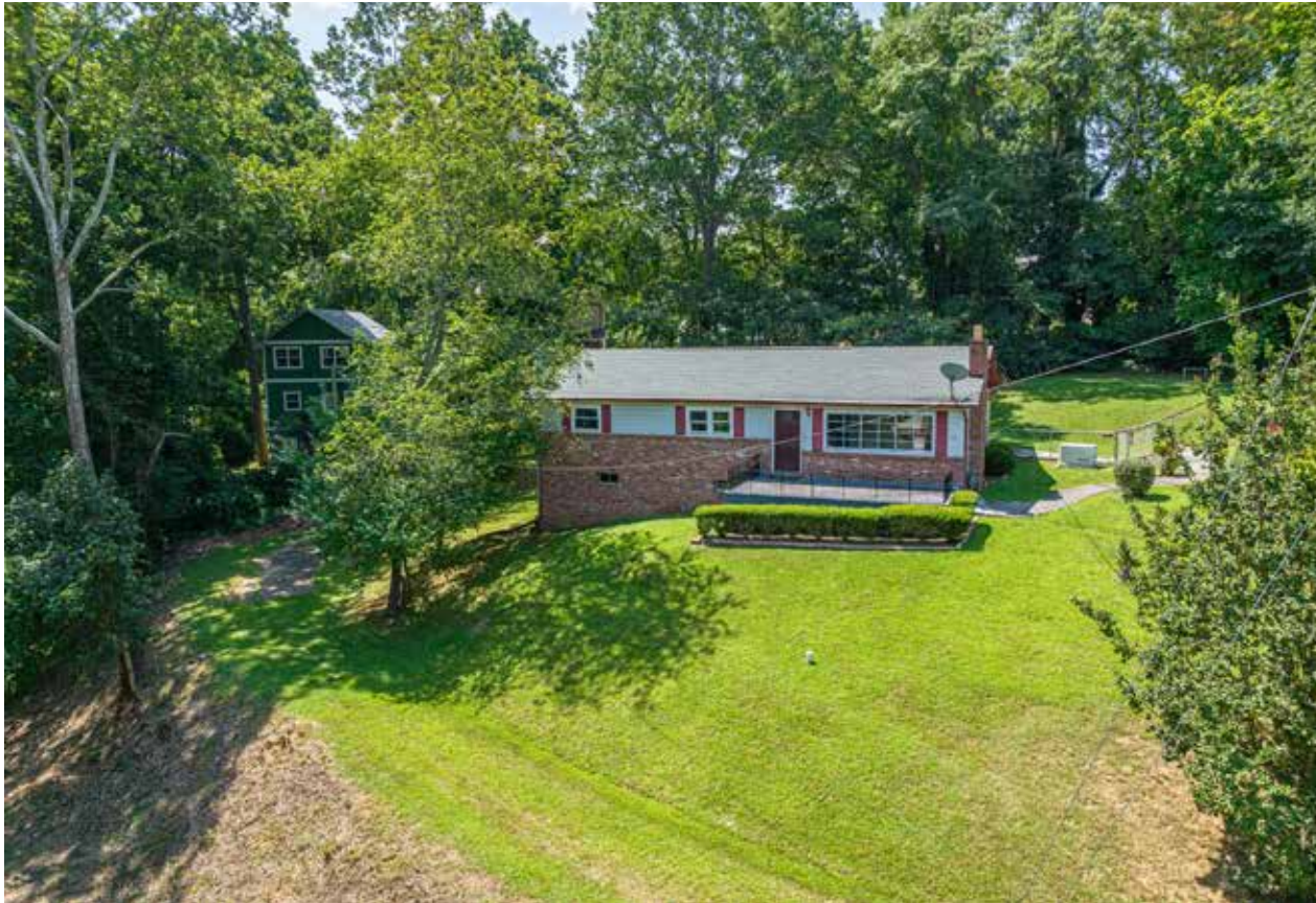
Solid House on a Large Lot in West Asheville

Seller to provide $15,000 concession for flooring and painting updates! Incredible value for this unique and rare property with amazing end-of-street privacy! House and large 0.78-acre lot is located just a short walk, drive or bike ride from all of the happenings of Haywood Road and the River Arts District. A well-maintained single family home with immense potential awaits mostly cosmetic updates, with plenty of space for additional structures, ADU, or simply one of the largest private lots in all of West Asheville! A whole-home generator, spacious storage unit, and seller-paid concession for new flooring and paint are just a few of the features that make this property such an amazing investment. Wonderful street with friendly neighbors and community vibe — properties like this truly don't come around often!