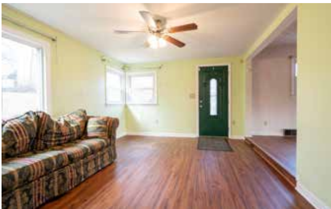
Sitting Area with Exterior Access