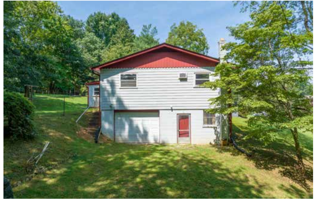
Side Garage and Basement Access