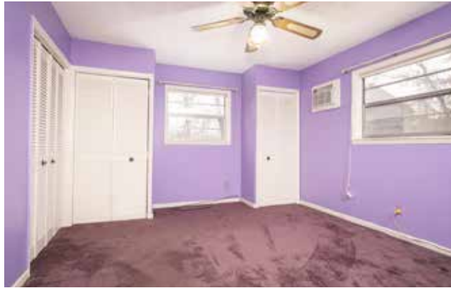
Primary Bedroom with Ensuite Bathroom