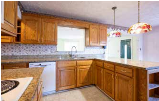
Sizable Kitchen with Granite Countertops