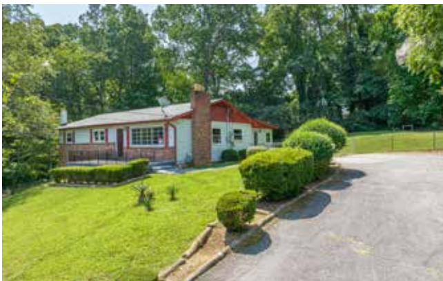
Easy and Spacious Parking and Home Access