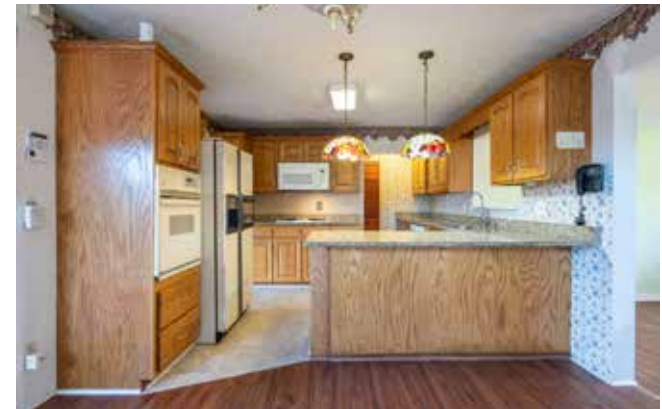
Plenty of Cabinet Space and Bar Seating