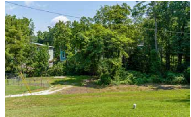
Spacious Front of Property