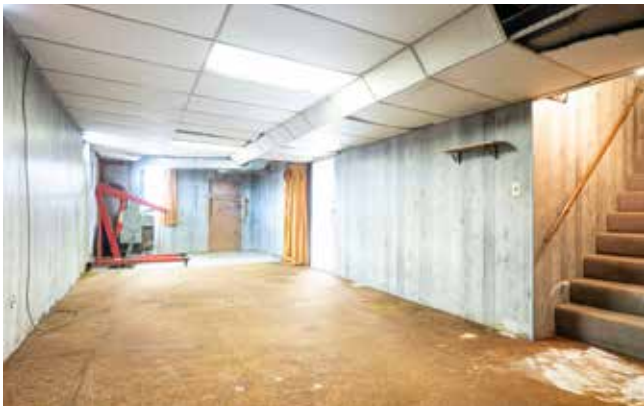
Partially Finished Basement • Ready for Improvements