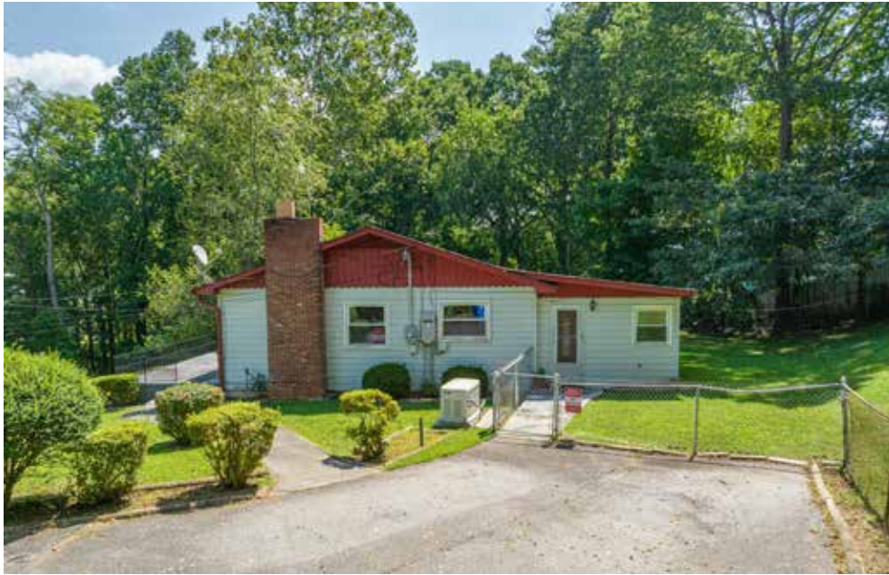
Plenty of Parking and Whole-Home Generator