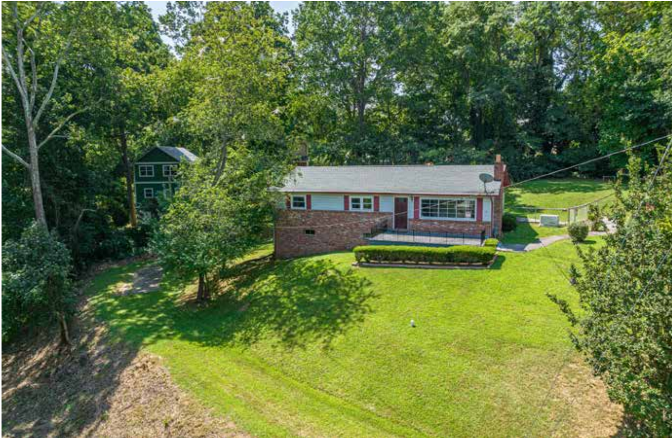
Entire Property Is at End of Street for Maximum Privacy and Property Use