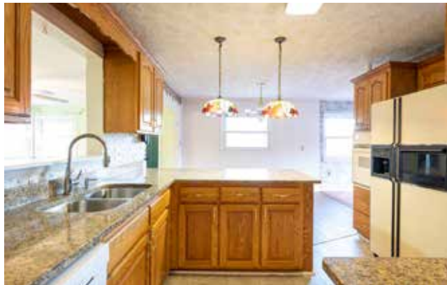
Updated Countertops and Ample Cabinetry