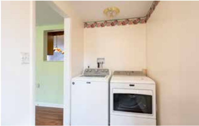
Convenient Main-Level Laundry Room Space