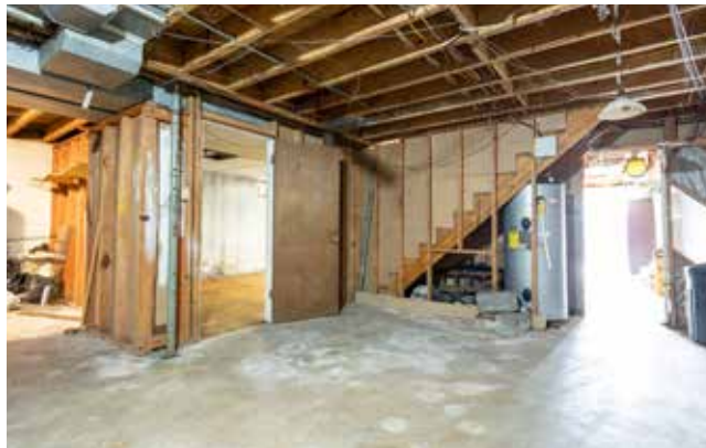
Additional Square Footage Potential or Storage Space