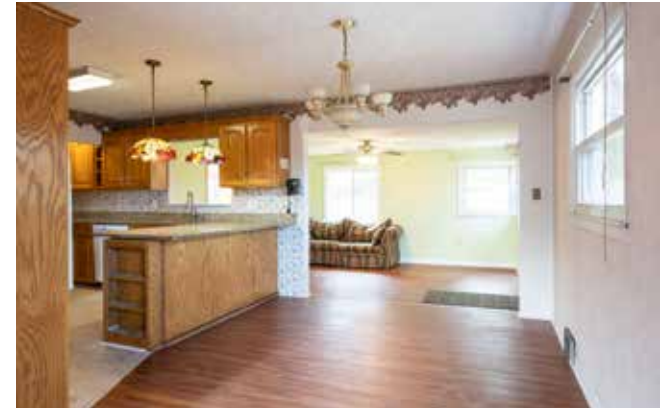
Convenient Dining and Sitting Room Access