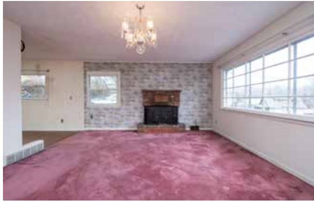
Spacious Living Area with Wood Stove