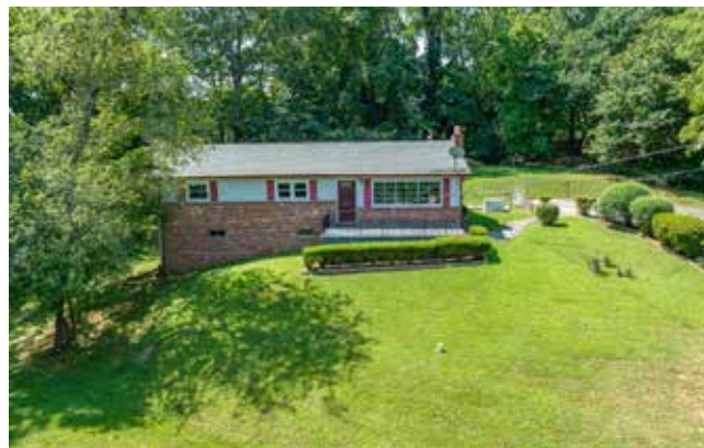
Room for ADU or a Huge Garden!