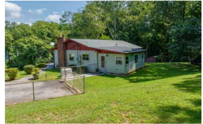
Fenced Portion of Backyard