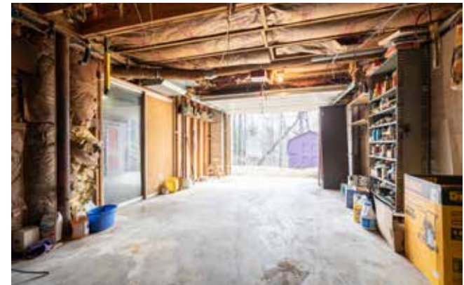
Oversized One-Car Garage