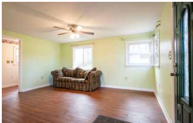
Second Living/Sitting Room Space with Exterior Access

49 YALE STREET Rare West Asheville Property on 3/4 Acre Lot Asheville, NC 28806