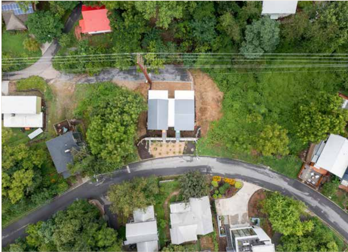
Aerial Shows Parking Area in Rear

Modern urban getaway! Beautifully designed, new-construction townhouse located in Asheville's historic WECAN/Chicken Hill neighborhood. Three levels of living space feature a stunning, open floor plan, vaulted ceilings, large custom windows, multiple decks, bedroom suites, and elevated design details throughout. Elegant kitchen features leathered granite countertops, custom cabinetry and breakfast bar, custom built-ins, and is perfect for entertaining. The lower level offers two bedroom suites, laundry, and a second deck. Spacious studio suite on the basement level features a designated, private entrance, kitchenette, large windows, and roomy full bathroom — ideal as a homestay rental or guest suite. This location can not be beat! Just one mile to downtown Asheville and a short stroll to The Radical Hotel, Baby Bull, Mother Bakery, New Belgium Brewing, The Grey Eagle and more. Move-in ready, with low-maintenance landscaping.