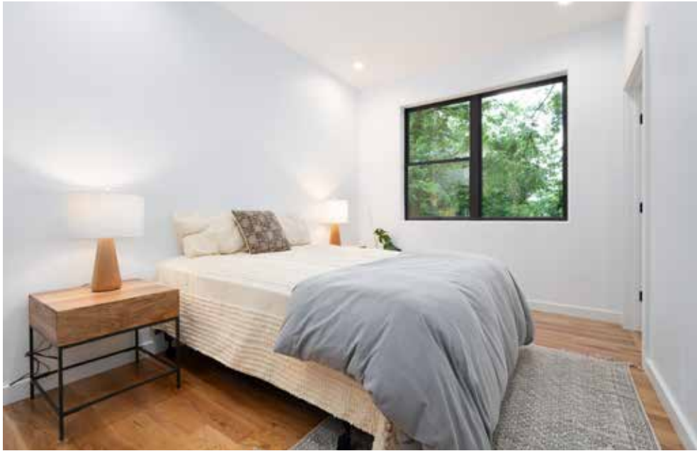
Lovely Second Bedroom Suite on Lower Level