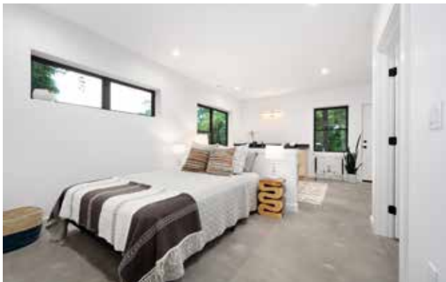
Ample Room for a Bed on the Other Side of the Half Wall