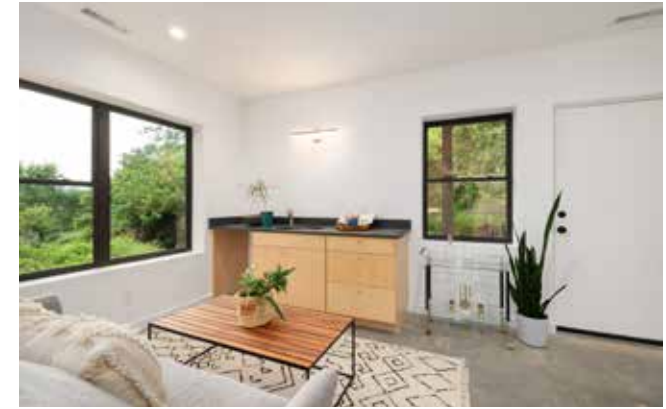
Private Entrance • Huge Windows