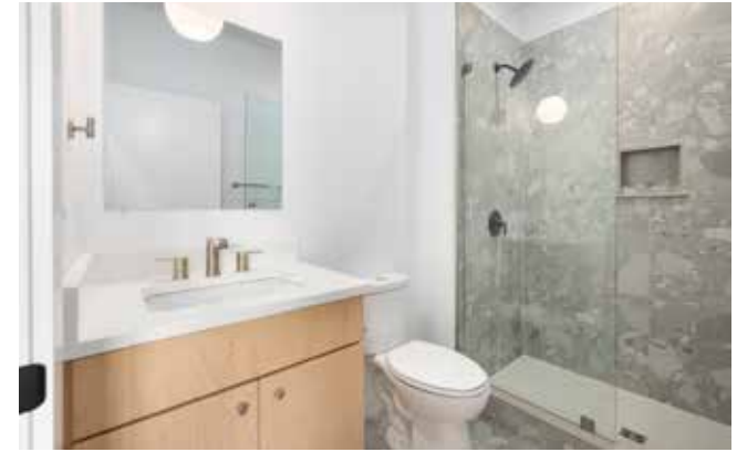
Full Bathroom with Step-in Shower