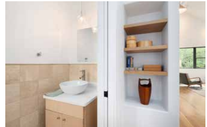
Elevated Design Details Throughout