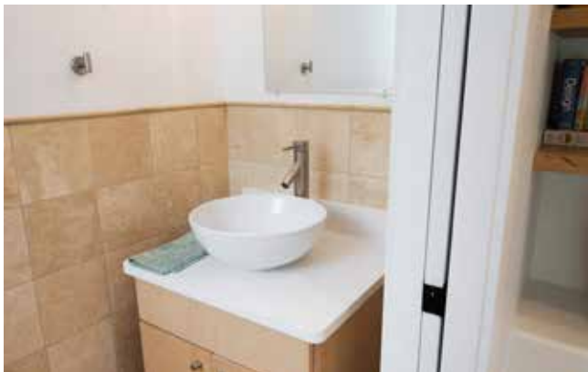
Powder Room on Main Level