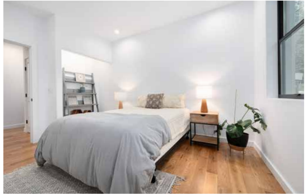
Gorgeous Hardwood Floors