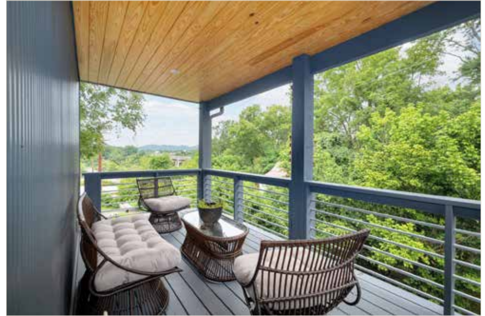
Enjoy Urban and Mountain Views