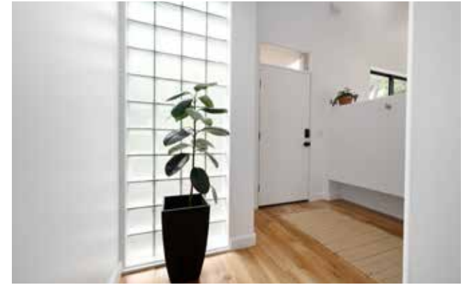
Beautifully Designed Foyer