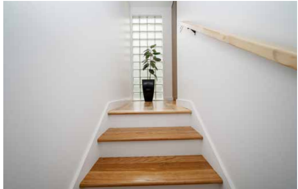
Stairs Lead to Main Level