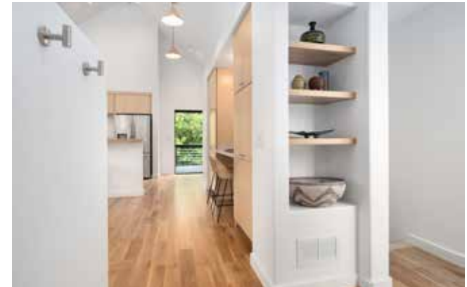
Foyer Flows to Living Area