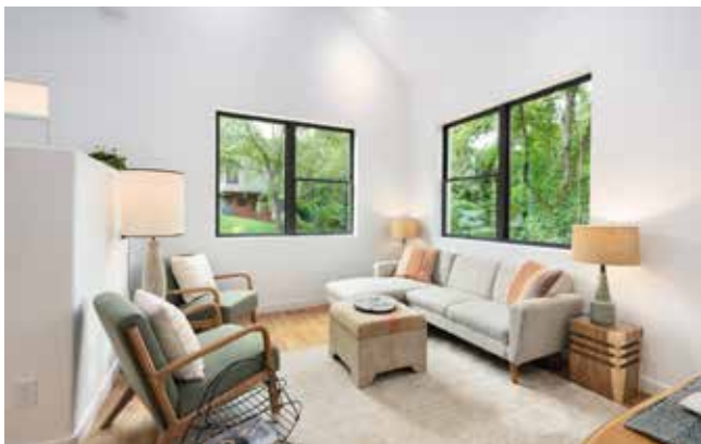
Light-Filled Living Room