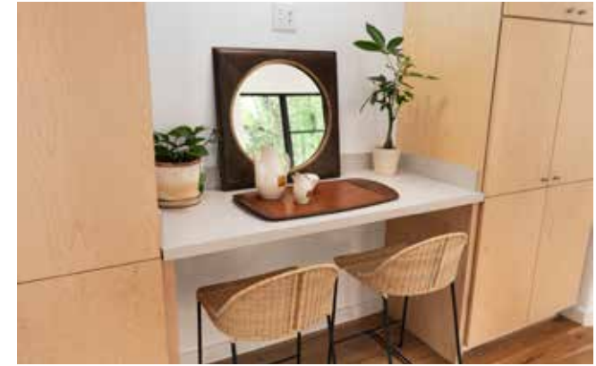
Perfect Desk or Buffet Space