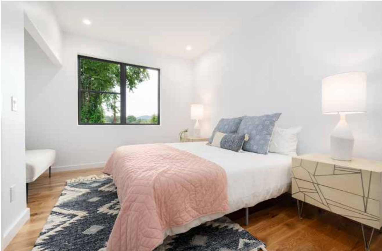
Lower Level: One of Two Bedroom Suites