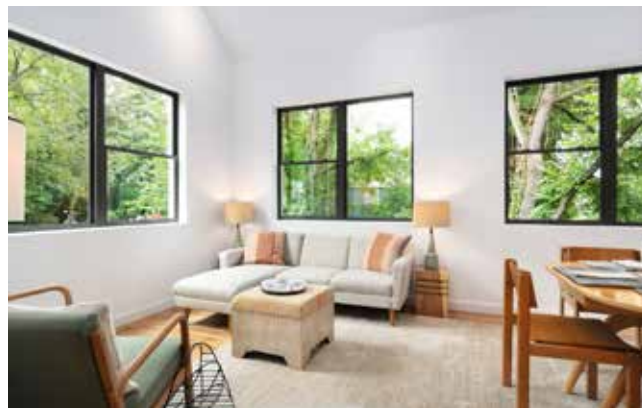
Custom Windows Create a Treehouse Feel