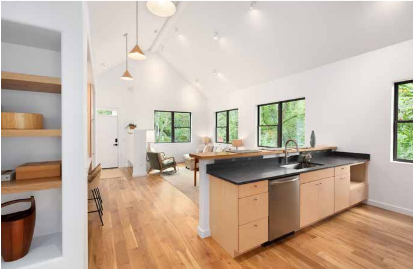
Stunning, Open Floor Plan