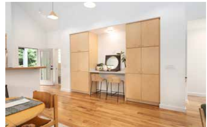
Elegant, Custom Built-in Cabinets