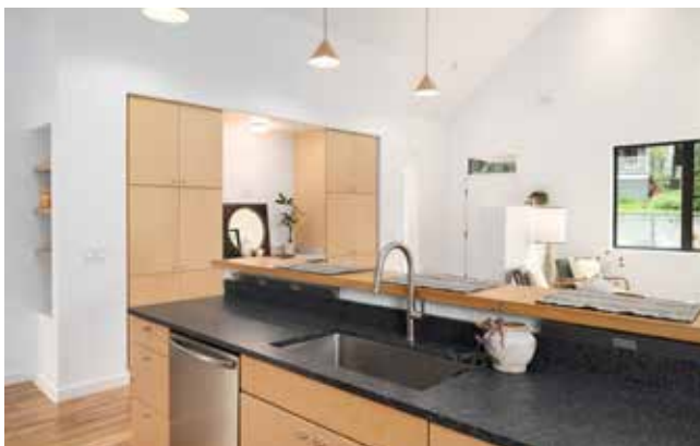
Ideal Floor Plan for Entertaining