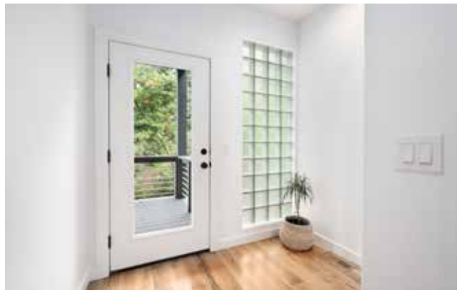
Door Opens to Lower Level Deck