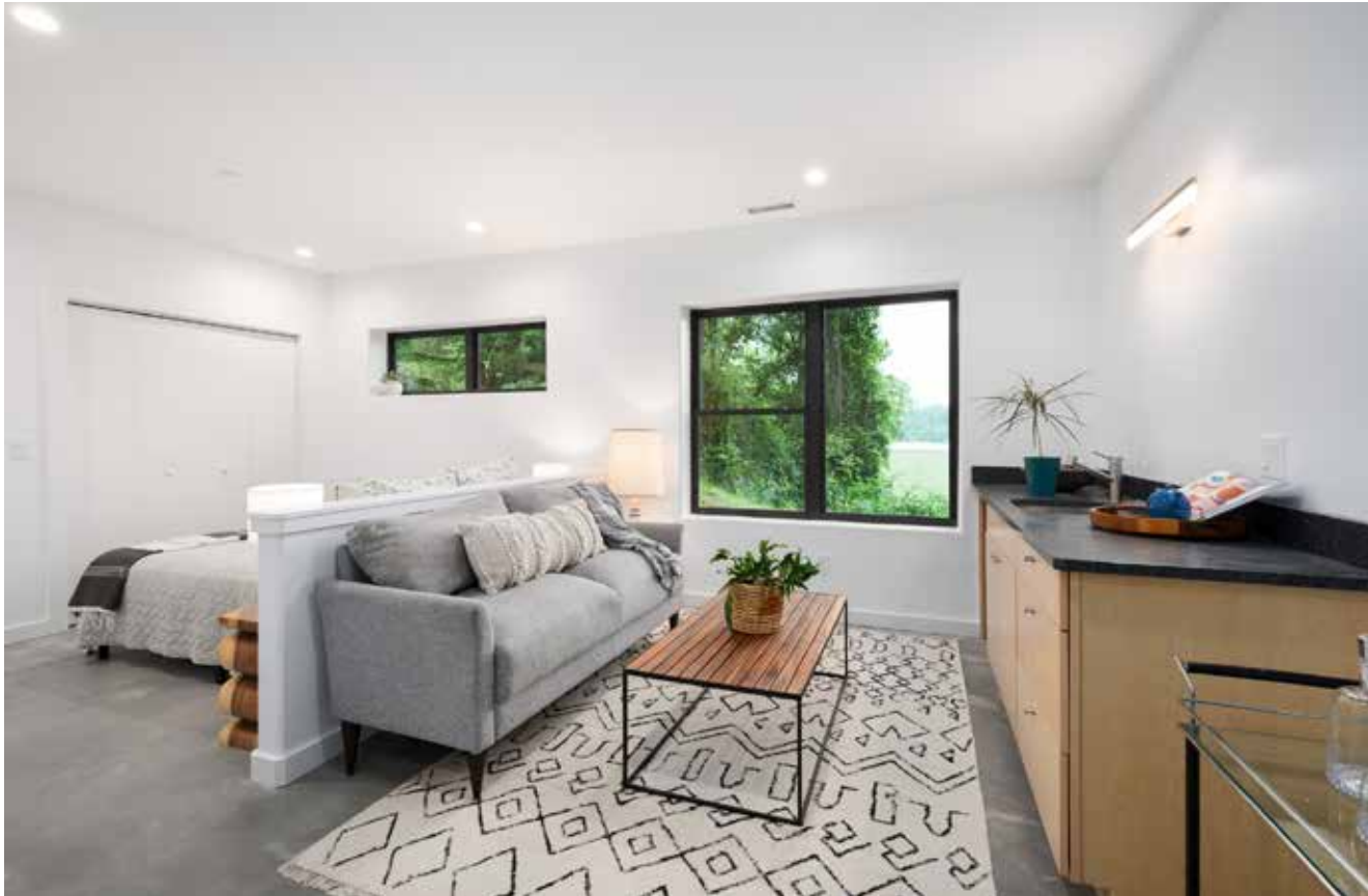
Basement: Perfect Rental or Guest Suite