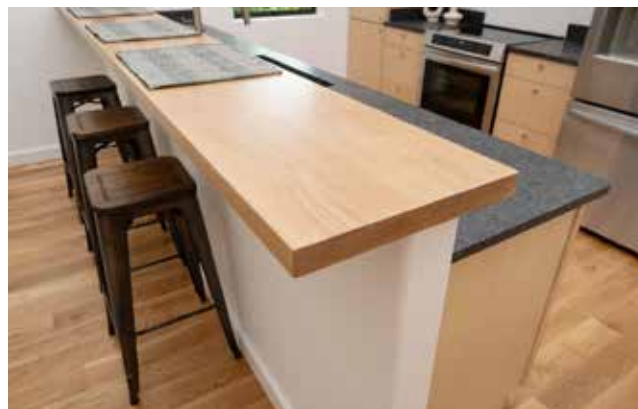
Leathered Granite • Custom Breakfast Bar