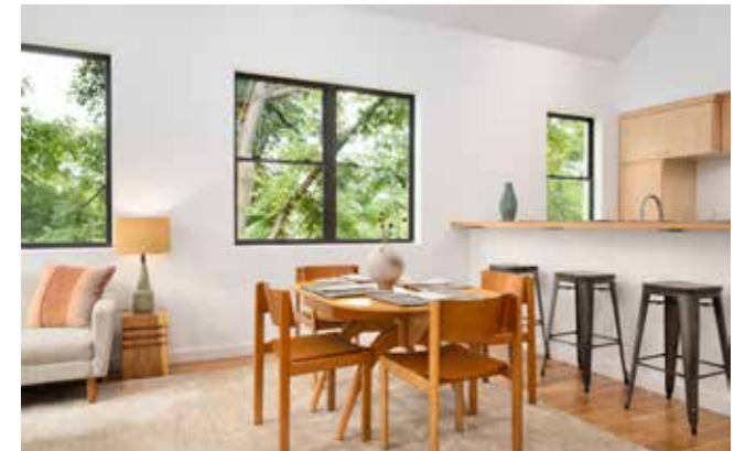
Generous Dining Area