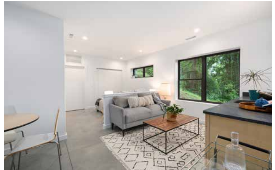
Basement Level: Spacious Studio Suite