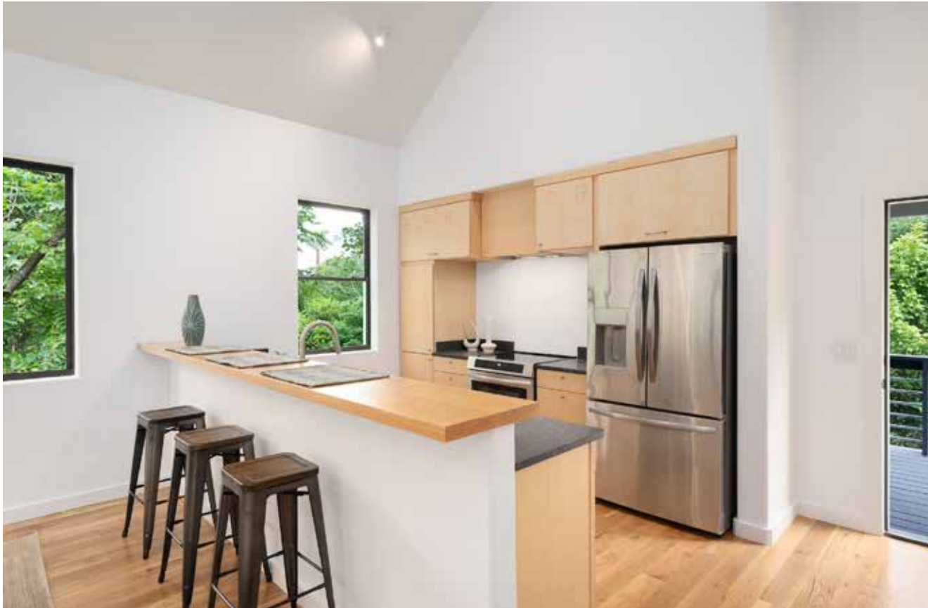
Airy, Eat-in Kitchen