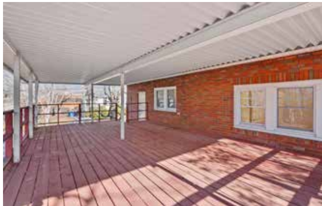
... and a Large, Covered Back Deck