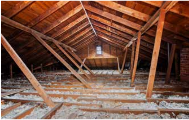
Attic Would Make a Great Storage Area ...