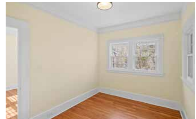
Another Angle of the Back Bonus Room