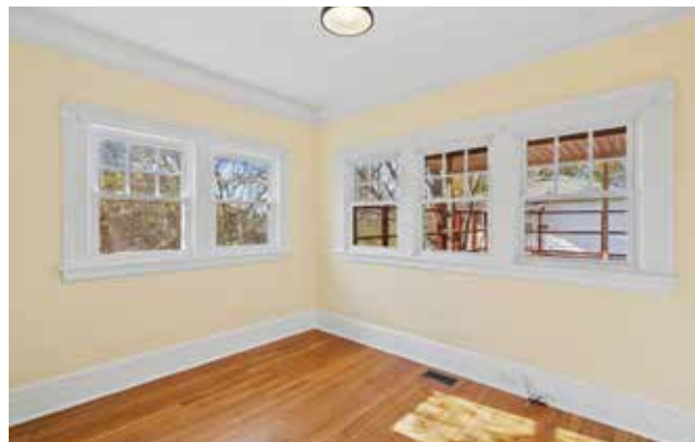
Sunny Bonus Room Is Perfect for a Nursery or Office