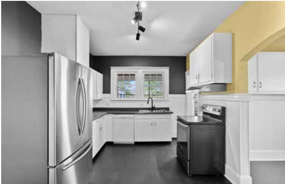
Adjacent to Breakfast Room