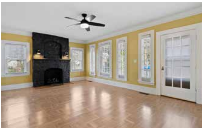
Living Room Facing Front of House