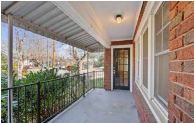
Outdoor Living Includes a Side Porch off the Dining Room