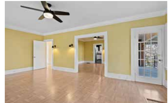
Fifteen-Paned Door Offers Porch Access, More Light