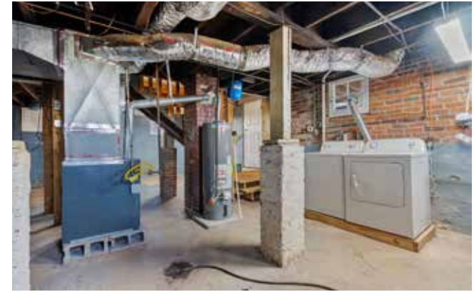
Basement Also Holds the Washer and Dryer