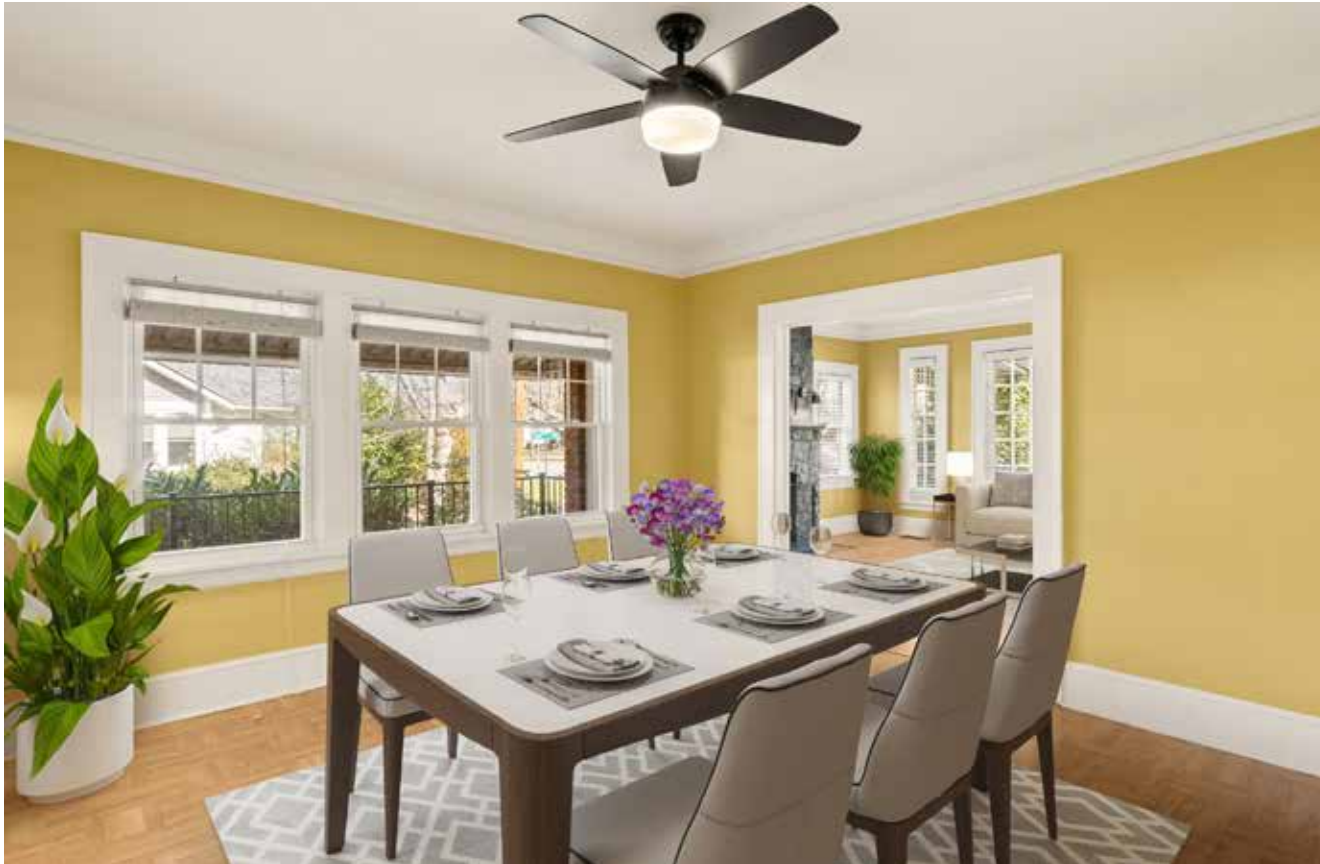
Dining Room (VIRTUALLY STAGED)