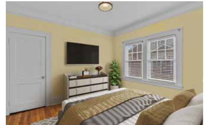
Back Bedroom (VIRTUALLY STAGED)