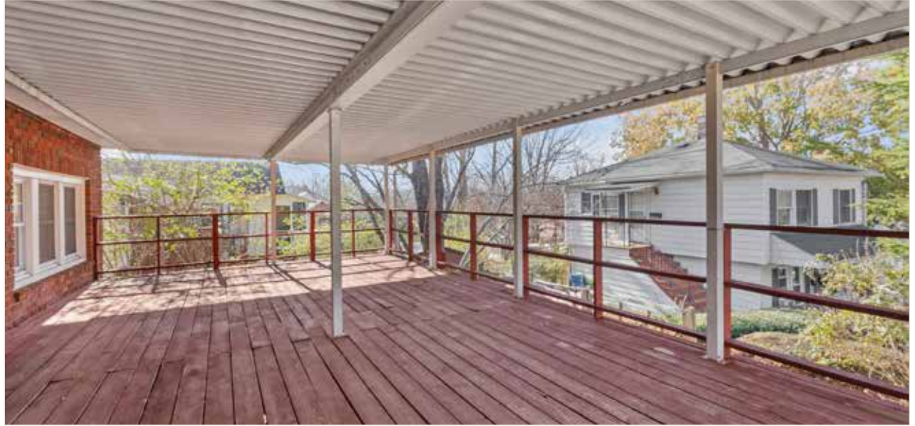
Back Deck View to Rear of Property