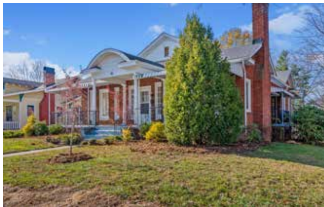
Front and North Side View of House