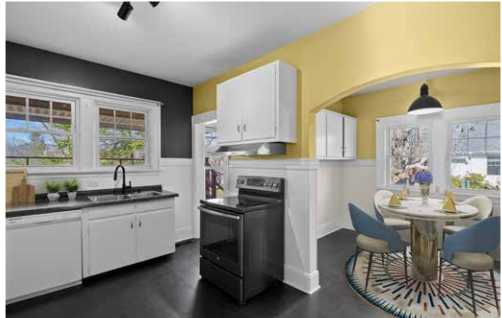
View of Kitchen and Breakfast Room (VIRTUALLY STAGED)