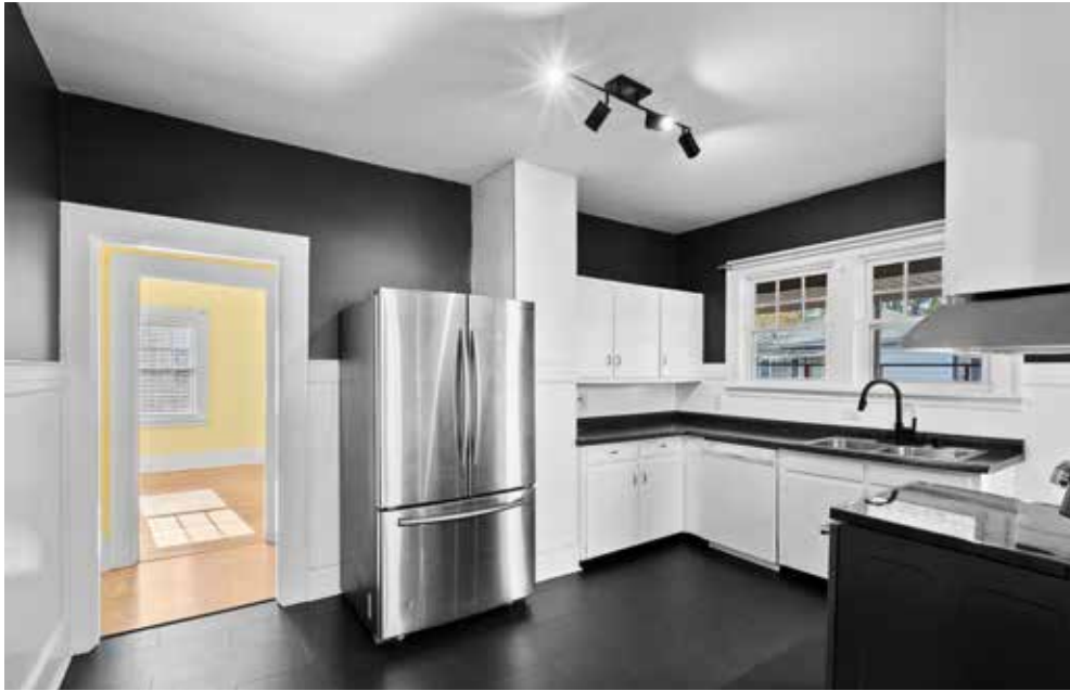
Beautifully Renovated Kitchen Has a Great Flow