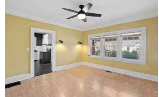
Bright and Cheery • Triple Window