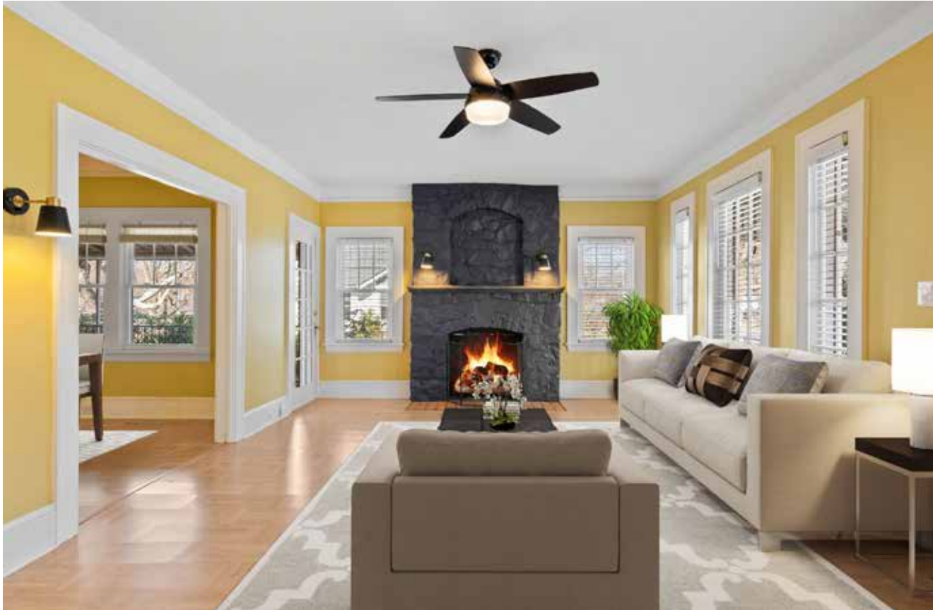
Living Room Facing Fireplace (VIRTUALLY STAGED)