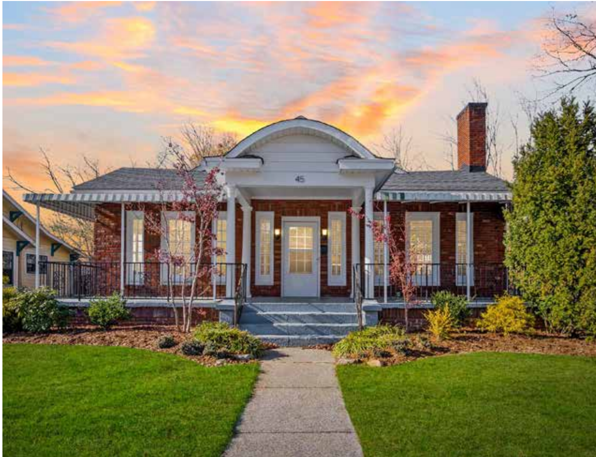
Sunset at 45 Vermont Avenue

This 2 BD/1 BA architectural brick Arts & Crafts bungalow is located one block south of the Haywood corridor, on a corner lot with a large front porch, a small, covered side porch and a large, covered deck at the rear of the property. It has been well maintained as a rental, with regular upgrades done over the years (see property improvement list). Loads of charm and architectural elements, like the dramatic front windows, the large living room with a fireplace, a breakfast nook off the kitchen, a formal dining room, and a bonus room off the back bedroom. Lots of potential for future value-adding improvements by finishing the basement and the walk-up attic (neither are included in the current square footage). If you're looking for a prime location in a historic home, this could be the one.