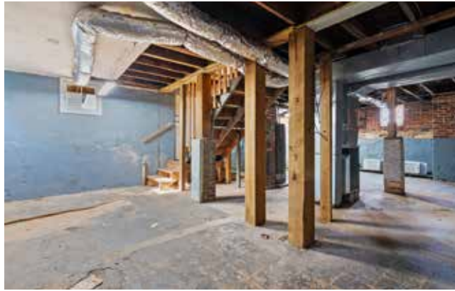
... as Would the Basement