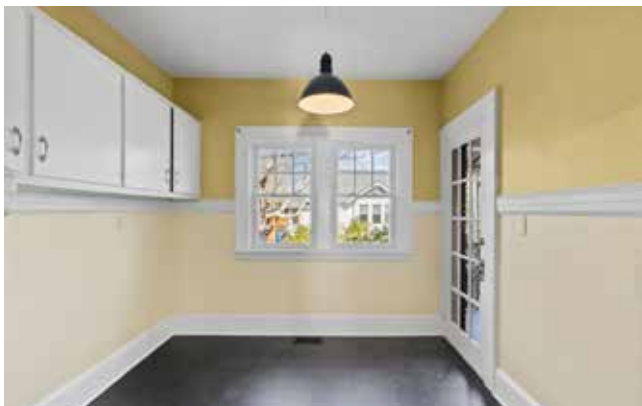
Breakfast Room Has Built-in Cabinets, Double Window