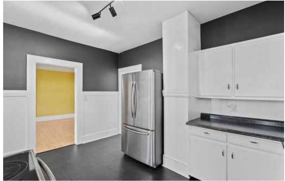
Plenty of Cabinet and Countertop Space