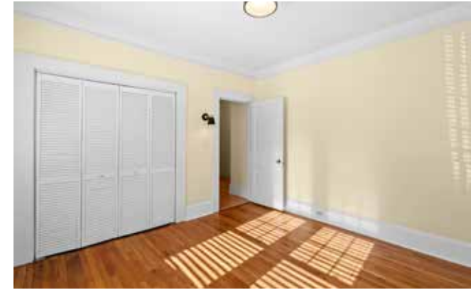
Good Closet Space