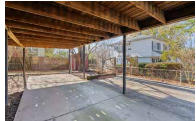
Off-Street Parking under the Carport