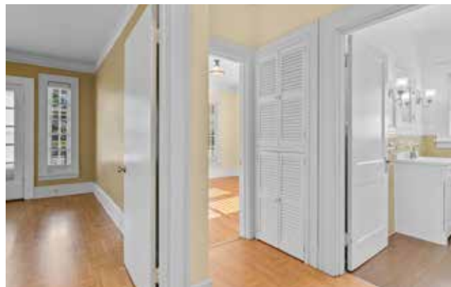
Hallway by Bathroom