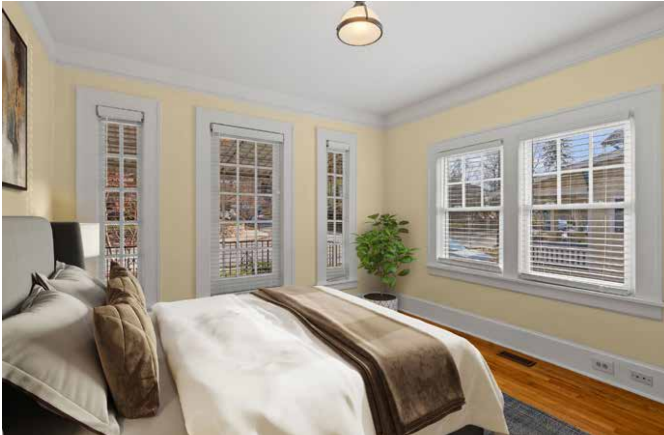
Light-Filled Front Bedroom (VIRTUALLY STAGED)