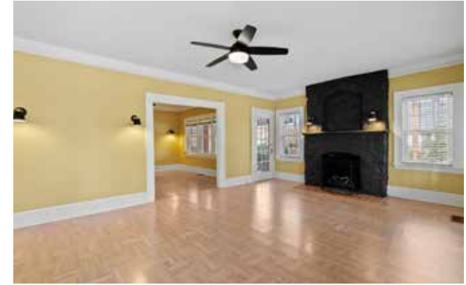
Living Room Facing Dining Room