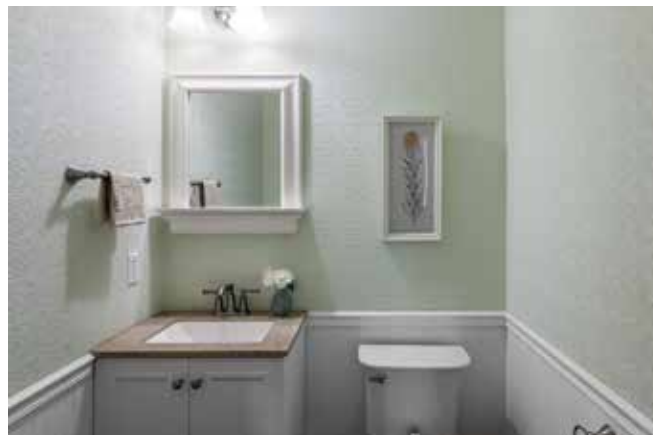
10 TERRAPIN TRAIL Updated Cape Cod-Style Home Flat Rock, NC 28731