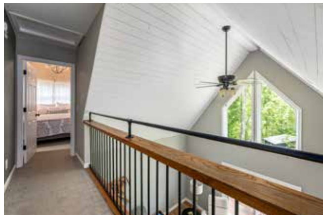
10 TERRAPIN TRAIL Updated Cape Cod-Style Home Flat Rock, NC 28731