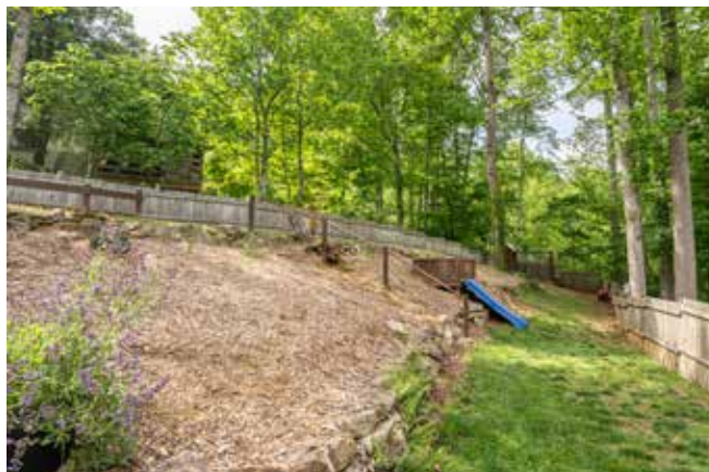
10 TERRAPIN TRAIL Updated Cape Cod-Style Home Flat Rock, NC 28731