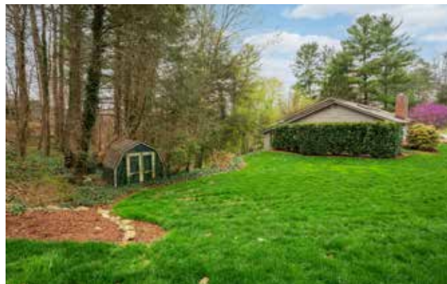
Even More Storage in Outdoor Shed