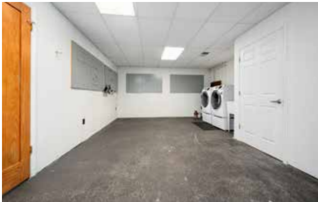
Large Basement Laundry Room