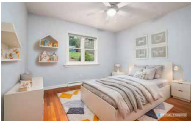
Light and Bright (Virtually Staged)