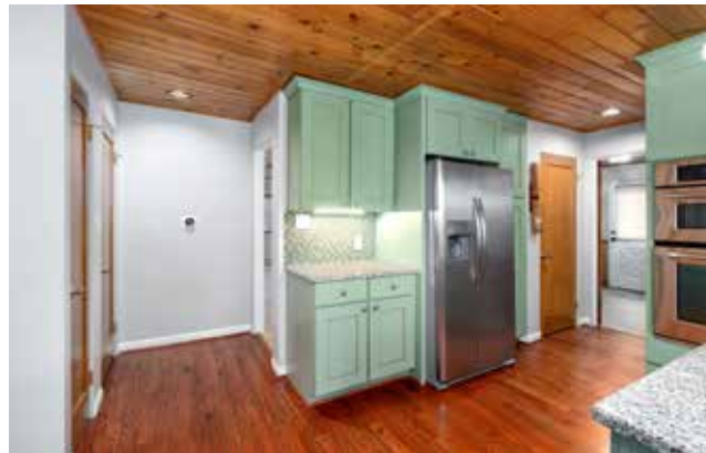
Pantry Closet and Cabinets