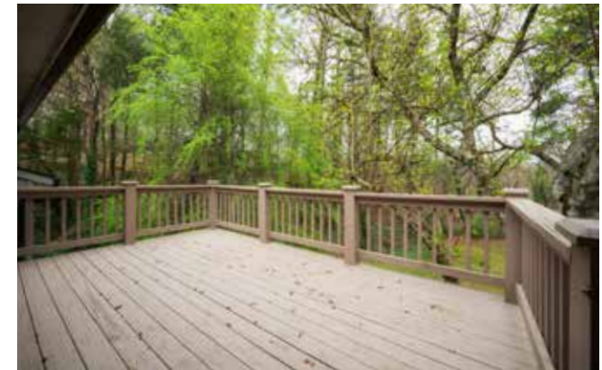
Back Deck Looks Out Into Private Backyard