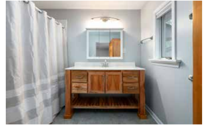
Ensuite Bathroom Has Wood Vanity, Shower/Tub Combo