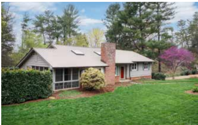
Beautiful and Mature Landscaping