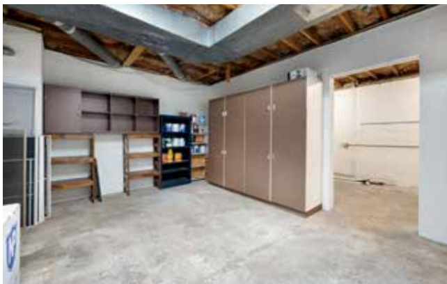
Plenty of Storage on Property