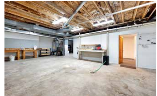
Ideal for Car Lovers or Workshop Space