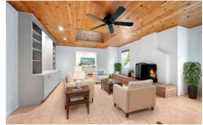
... Built-in Bookshelves and a Tile Floor (Virtually Staged)