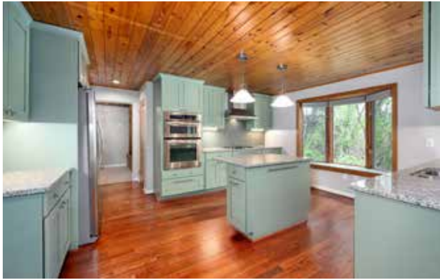
Pine Ceiling Extends Into the Kitchen