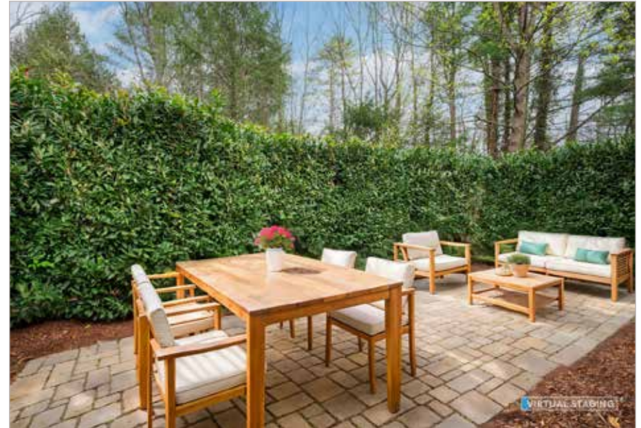
Numerous Outdoor Spaces For Hosting (Virtually Staged)