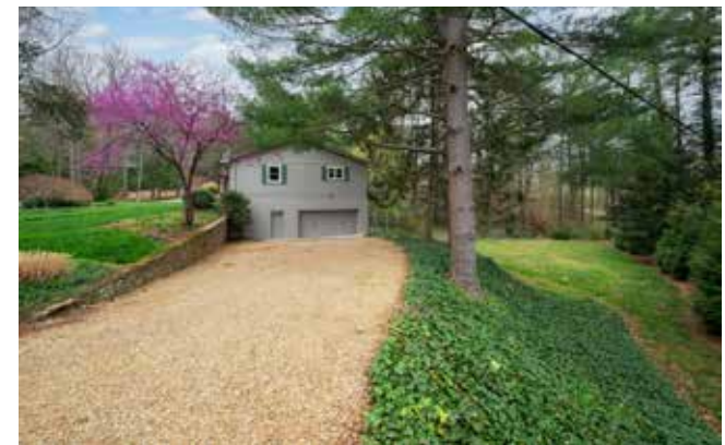
Level Outdoor Spaces for Play and Gardening