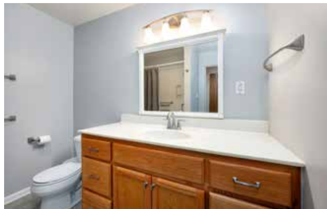
Hall Bath Has Shower/Tub Combo

48 STRATFORD ROAD One-Level Living on 1.1 Acres in Lakeview Park Asheville, NC 28804