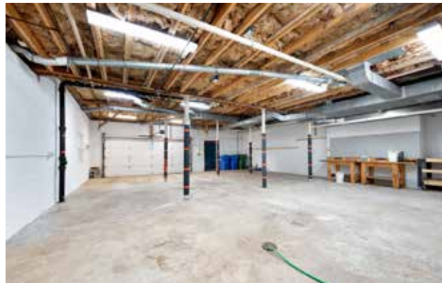
Massive Basement Garage