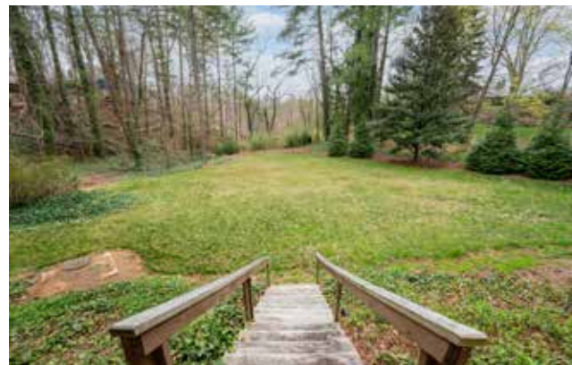
City Living with Privacy

48 STRATFORD ROAD One-Level Living on 1.1 Acres in Lakeview Park Asheville, NC 28804