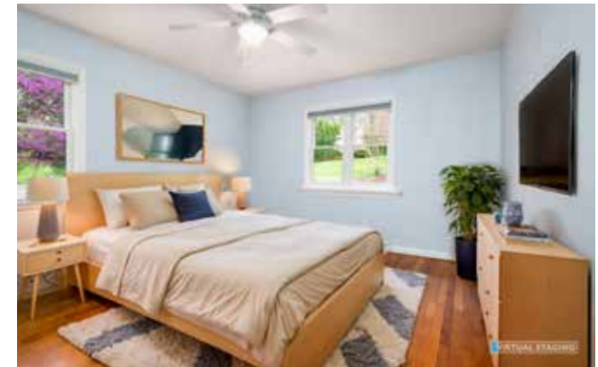
All Bedrooms Have Hardwood Floors, Fans (Virtually Staged)