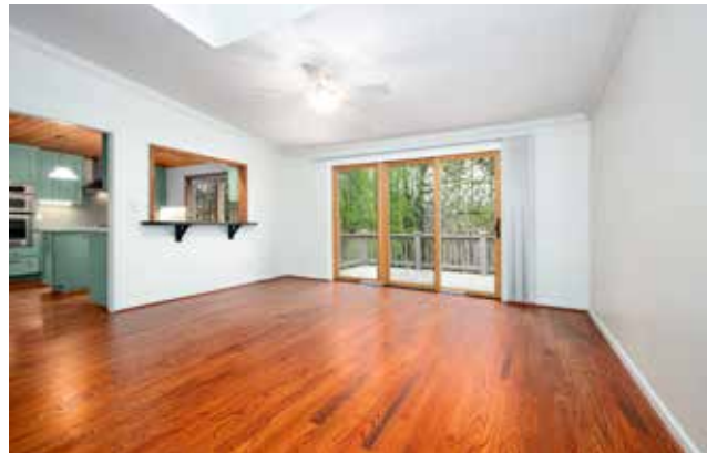
The Other Living Room ...