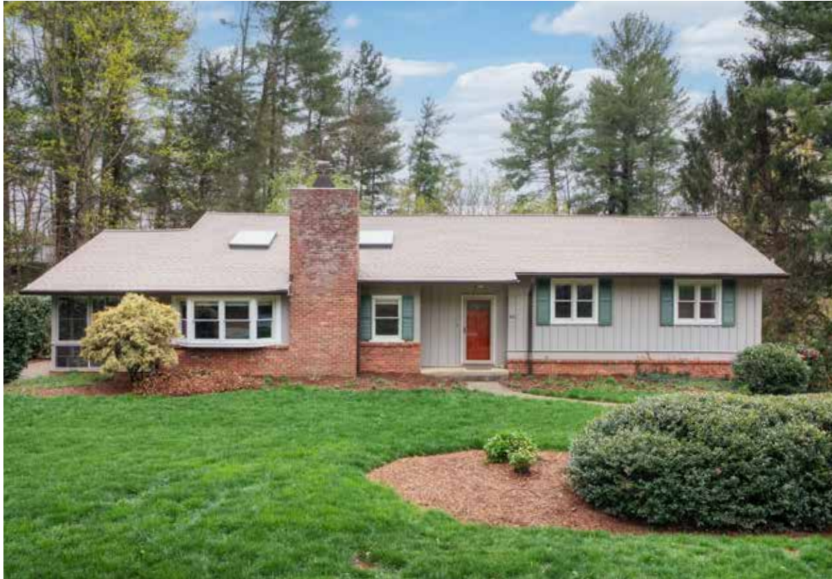
2021 Architectural Shingle Roof and Skylights

Fantastic opportunity for one-level living in North Asheville's Lakeview Park, on a spacious and private 1.1-acre property, just steps to Beaver Lake's walking trails, The Country Club of Asheville, and only about three miles to downtown Asheville. This lovely home includes a massive basement garage ideal for a workshop/ car storage — or to expand the finished square footage of the home. Interior features include a stunning pine ceiling and skylights in the living and dining room, multiple dens/living rooms, a spacious and bright kitchen, plus a private primary suite with its own deck. Level and private backyard offers plenty of space to play or garden, and a lovely screened-in porch and outdoor stone patio with fire pit await company. This home is truly an opportunity to either move in now and enjoy it, or remodel it to suit your preferences. Asheville City Schools district.