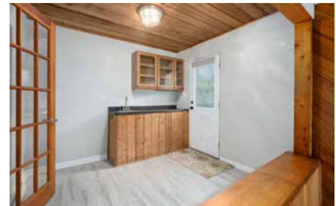
Wet Bar and Exterior Access in the Adjacent Bonus Room