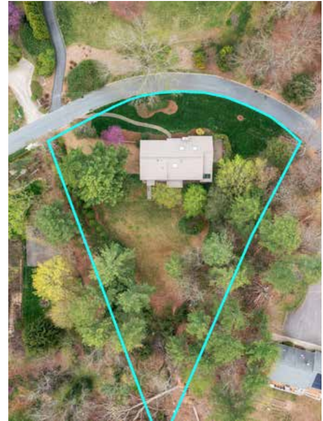
1.1 Acre Property