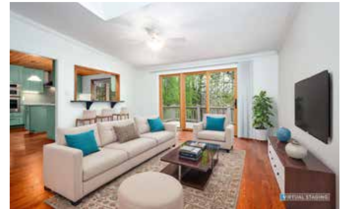
... Is a Hangout Near the Kitchen (Virtually Staged)