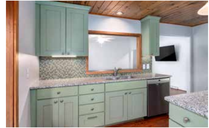
Peek into the Second Living Room