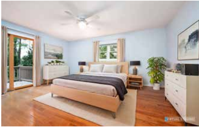
Spacious Primary Suite with Its Own Deck (Virtually Staged)