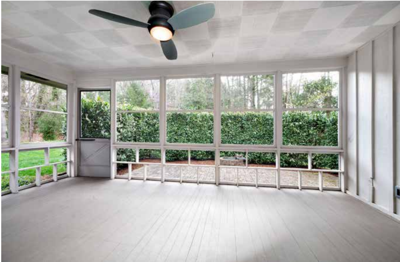
Screened-in Porch off the Dining Area