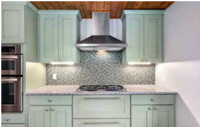
Lovely Green Cabinetry and Stainless Steel Vent Hood