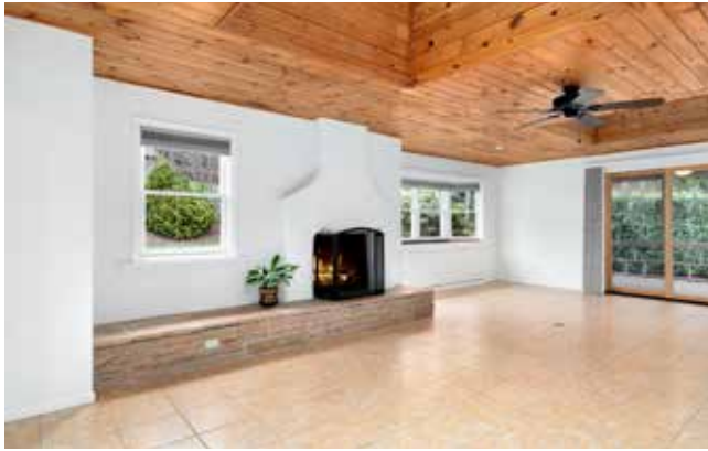
Two Living Rooms: One with a Wood-Burning Fireplace ...