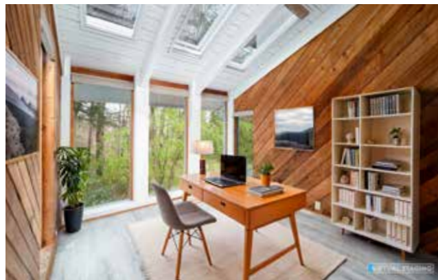
Perfect Space to Work from Home (Virtually Staged)