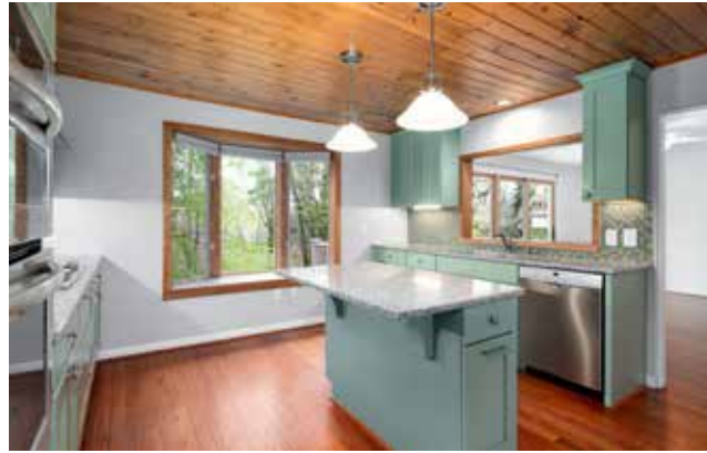
Eat-in Island and Granite Countertops