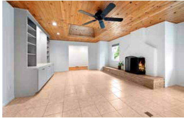
... a Stunning Pine Ceiling and Skylights, Plus ...