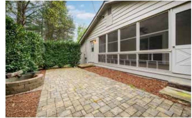
Built-in Fire Ring • Stone Patio