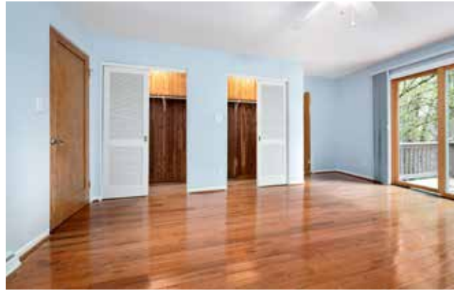
Two Cedar Closets in Primary Suite