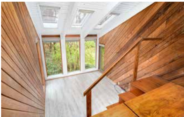
Sunken Space Includes Skylights