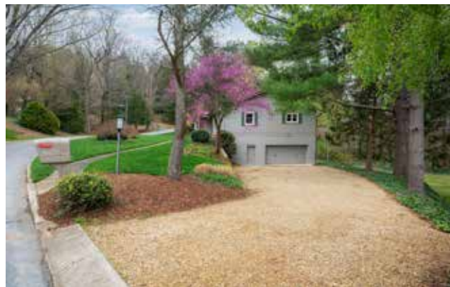
Outside the Garage Is a Spacious Gravel Driveway

48 STRATFORD ROAD One-Level Living on 1.1 Acres in Lakeview Park Asheville, NC 28804