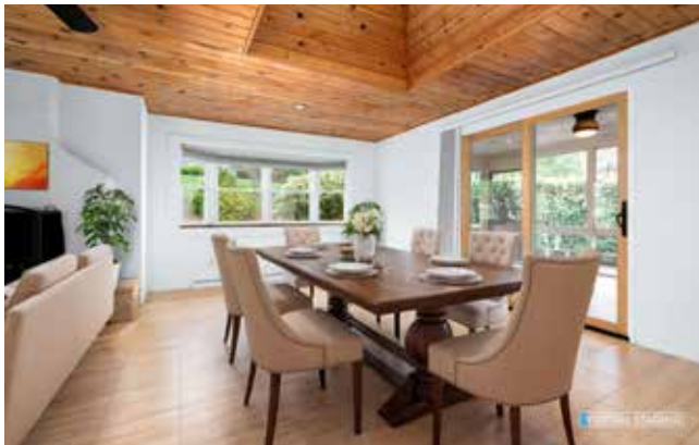
Inviting Dining Space with a Bay Window (Virtually Staged)