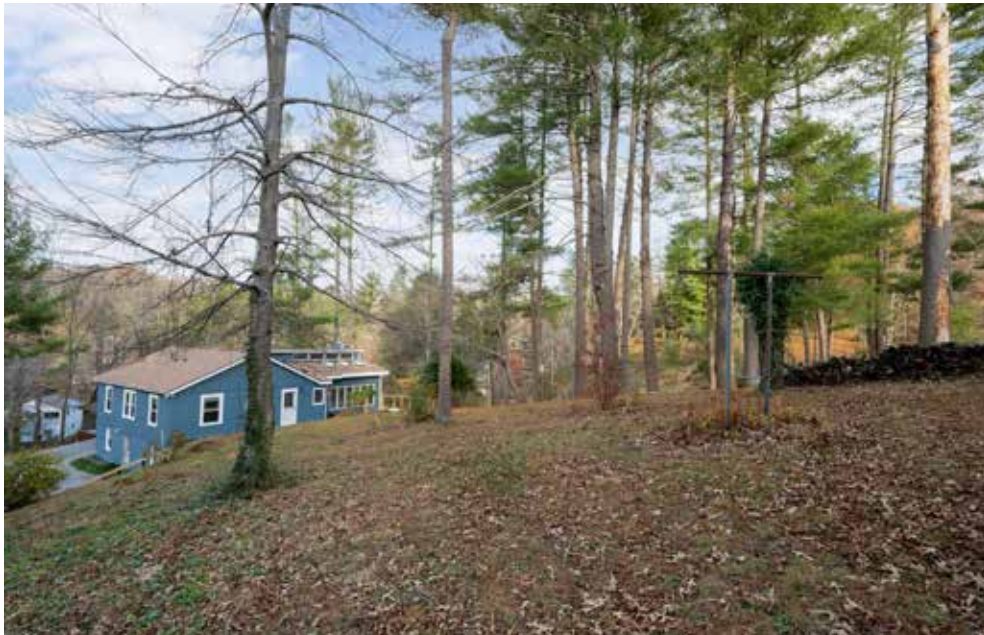
Gentle Terrain with Long-Range Views