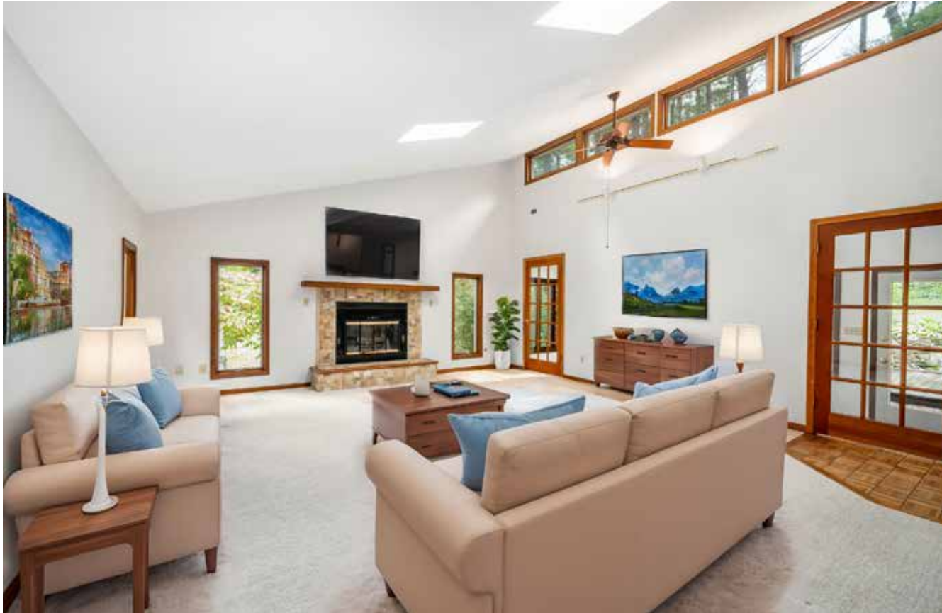
Bright Living Room Features Skylights and Transom Windows (VIRTUALLY STAGED)