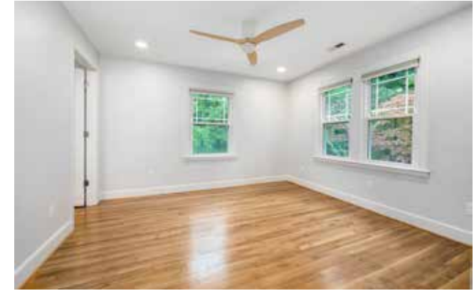
New Recessed Lighting and Ceiling Fan