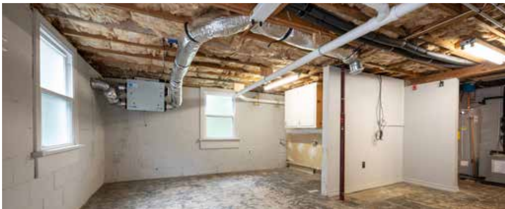
Secondary Laundry Hook-Ups