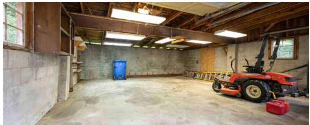
Two-Car Garage Offers 20/40/50-Amp Power