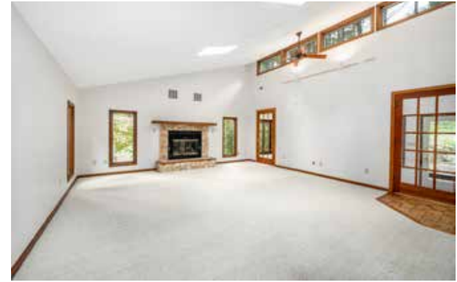
Vaulted Ceiling, New Carpet and Fresh Paint