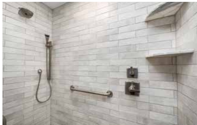
New Tile Shower Has Shelves and Grab Bars