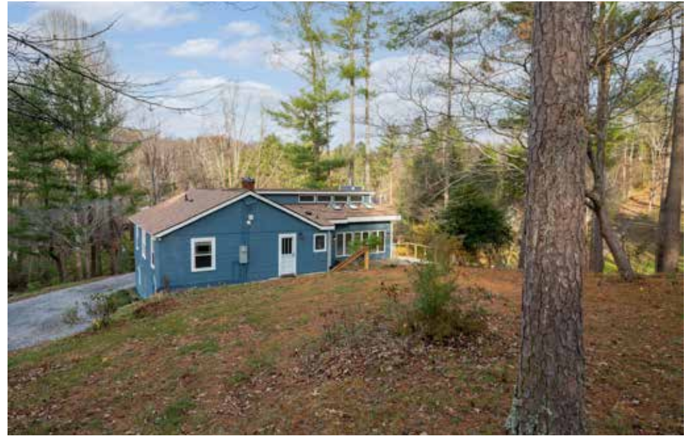
Nice Buffer of Land Surrounds the Home