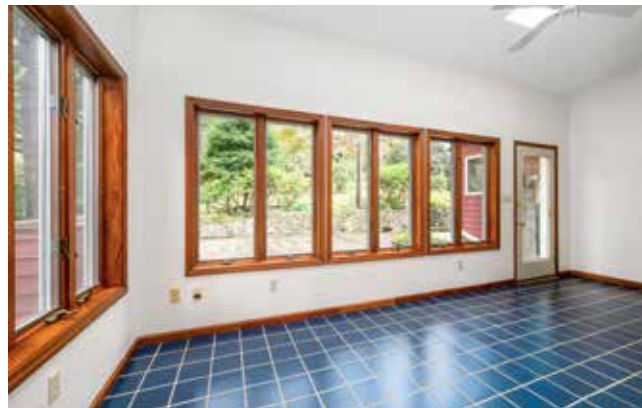
Light-Filled and Inviting •Deck Access