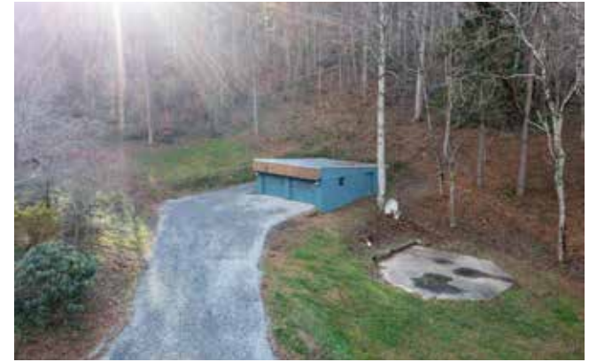
Basketball Court and Rec Space