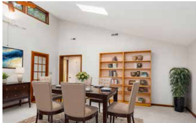
Dining Area off Kitchen, Living Room (VIRTUALLY STAGED)