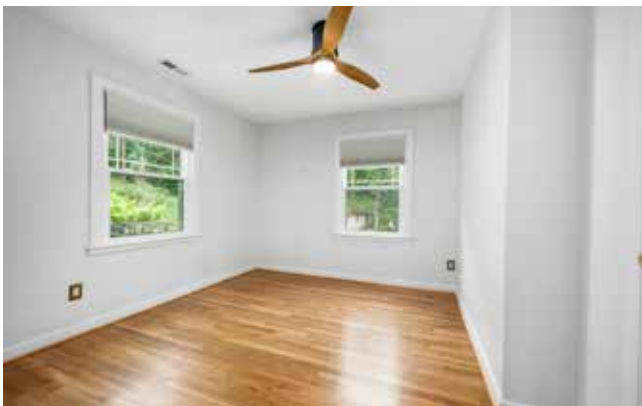
Front-Corner Bedroom Overlooks Backyard