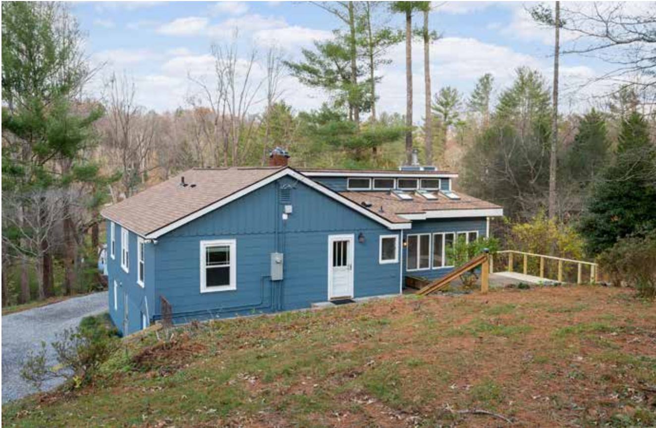
Home's Exterior Was Professionally Painted, Including Trim, Soffits, and Fascia