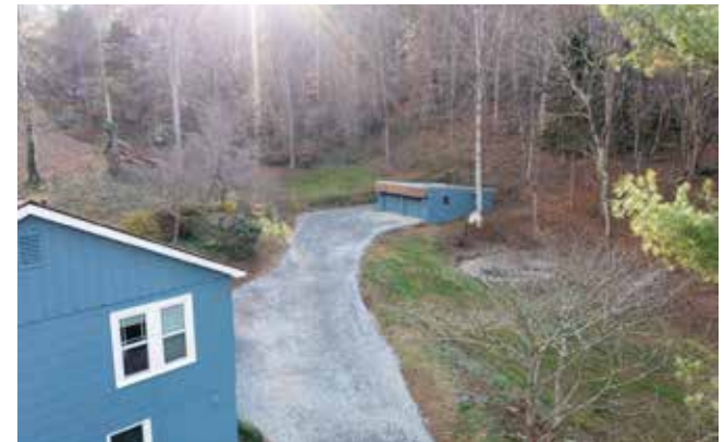
Plenty of Parking for All Vehicles and Equipment