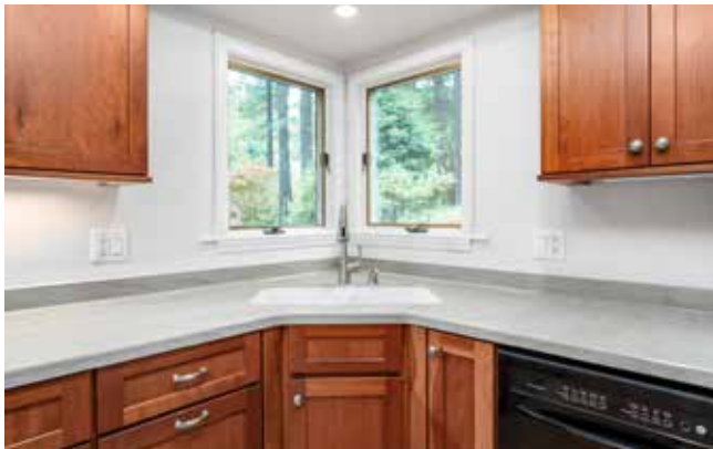
Seamless Corner Sink with New Faucet