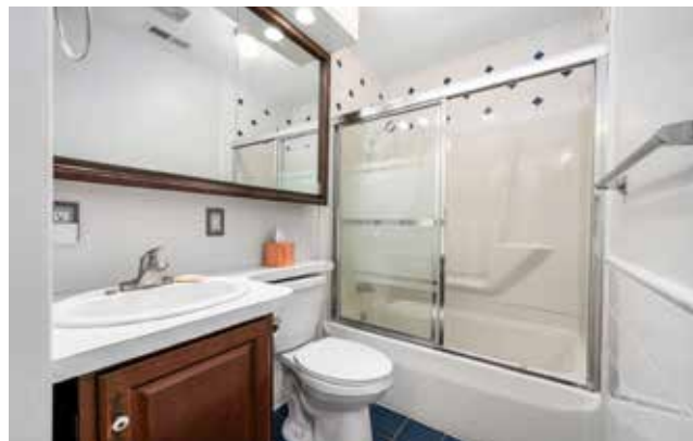
Shared Hallway Bathroom