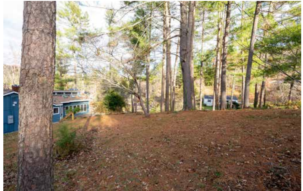
Property Goes to the Top of the Ridge