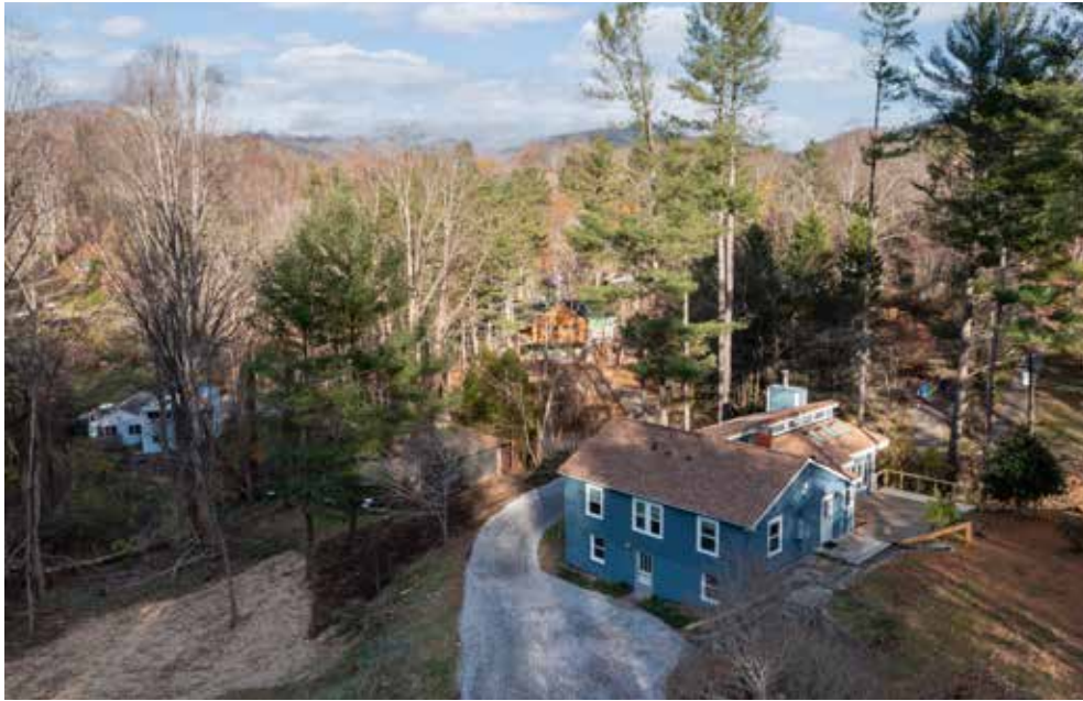
New Roof and Gutters