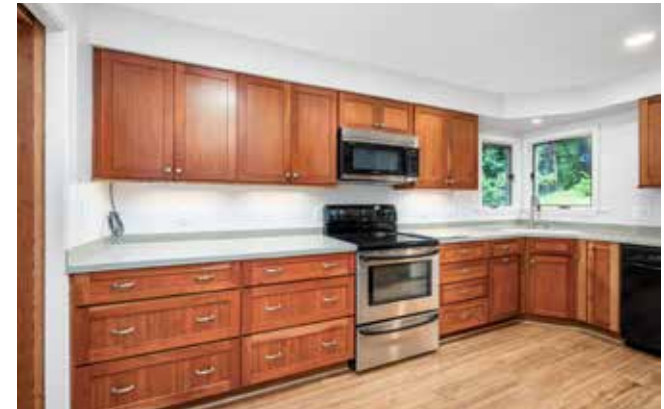
Corian Countertops with Integrated Backsplash and Sink