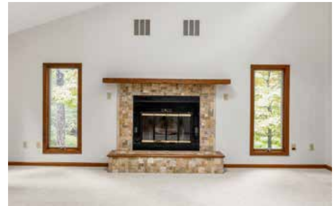
Wood-Burning Fireplace with Tile Surround, Sidelights