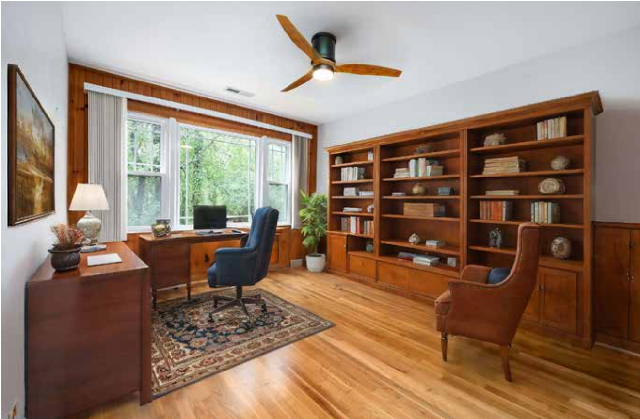
Bedroom with Paneling Would Make a Great Office (VIRTUALLY STAGED)