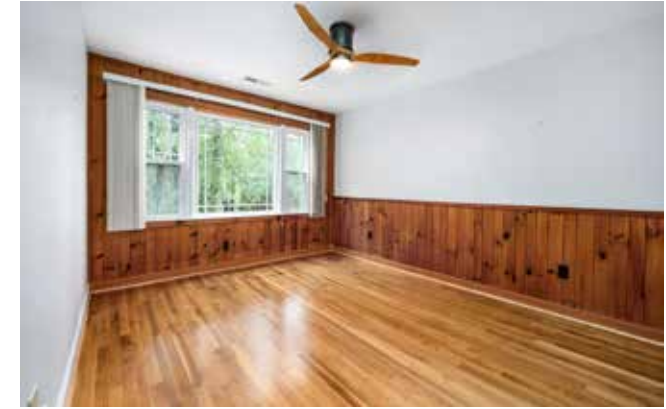
Great Windows • Knotty Pine Paneling