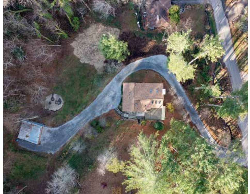
Rare and Hard-to-Find Property with Endless Possibilities