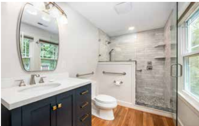
Ensuite Bathroom • Step-in Shower with Glass Enclosure