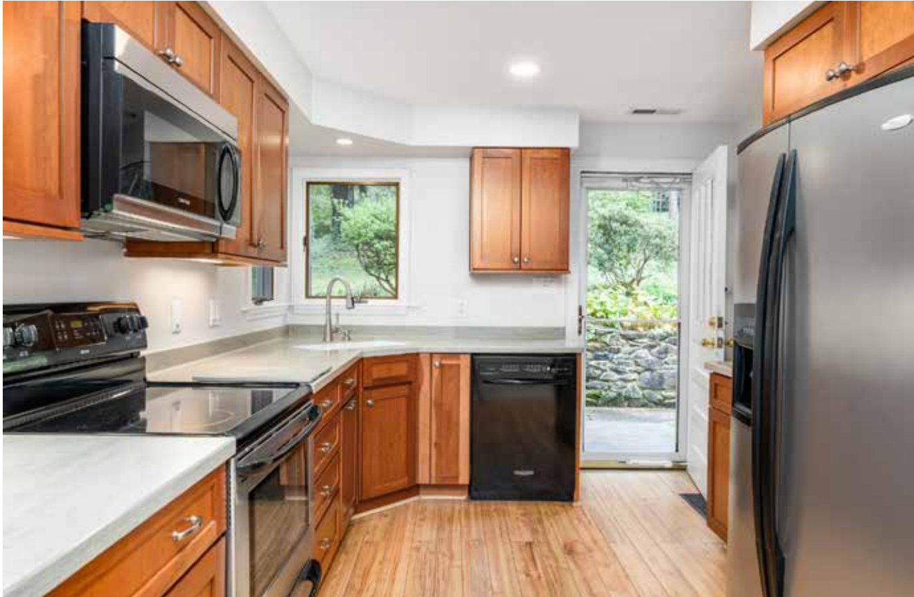
Kitchen with Patio Access