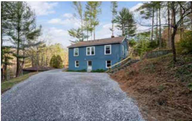
House Sits on a Gentle Knoll