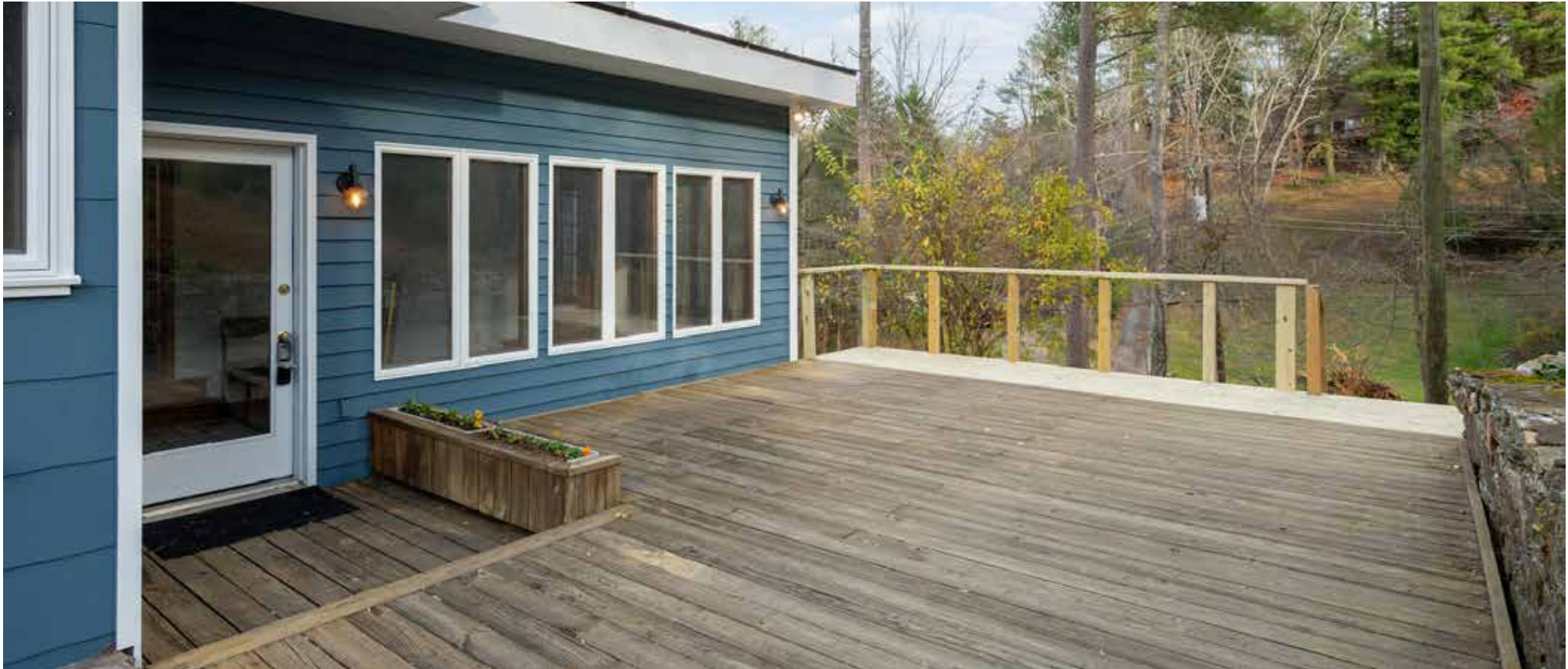
Large, Private Deck with Built-in Planter Box