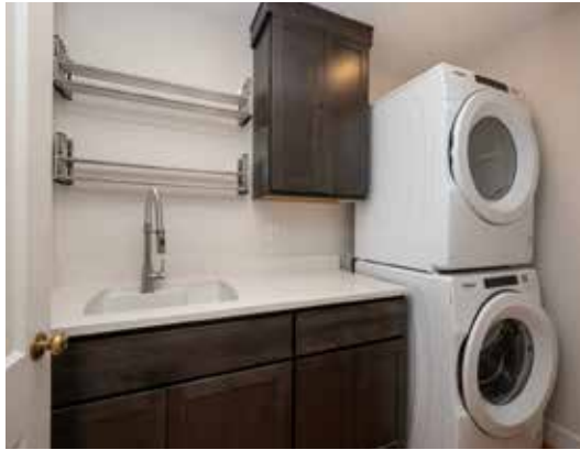
New Laundry Room on Main Level