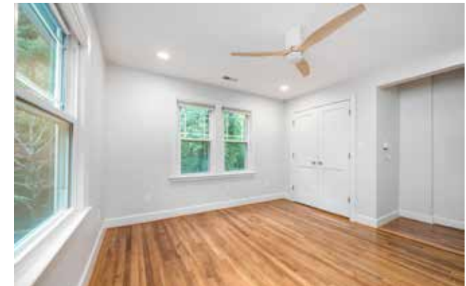
Sizable Closet • Refinished Hardwood Floors