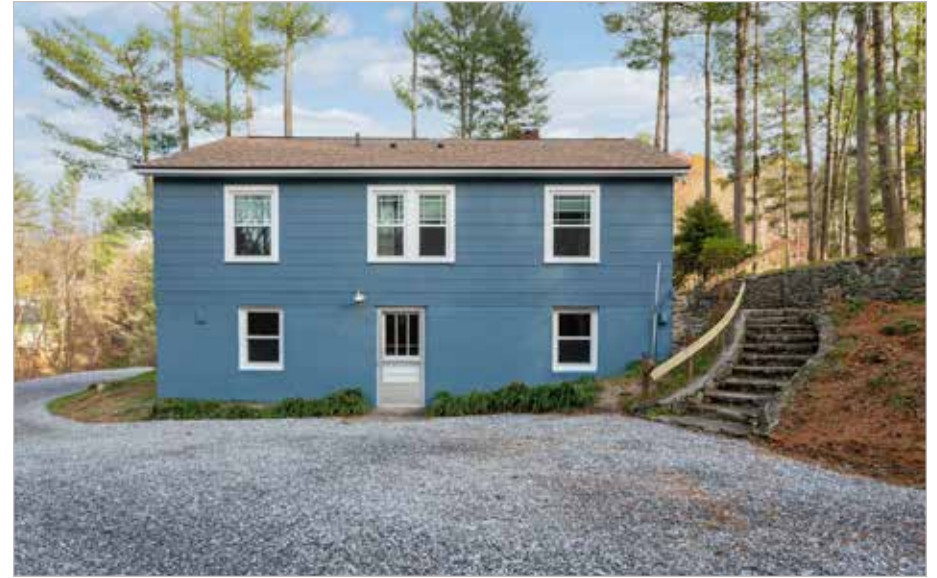
Basement Door Access into Home