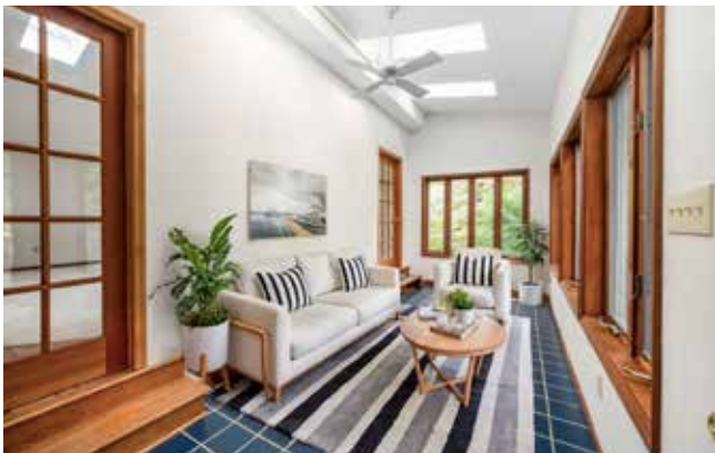
Sunroom Is a Perfect Place for Relaxing (VIRTUALLY STAGED)