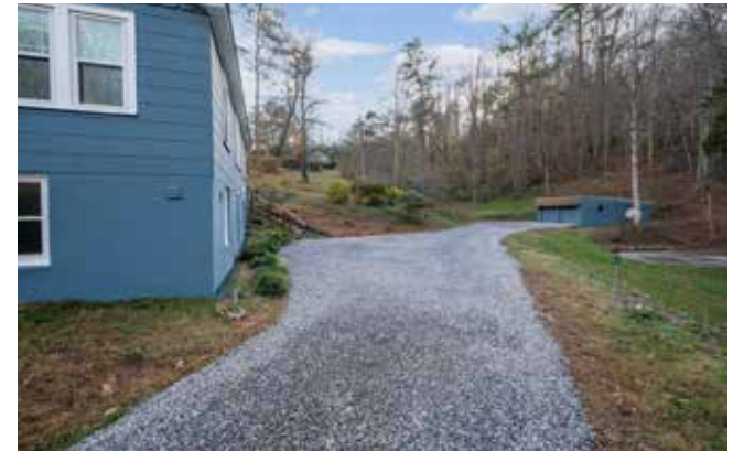
Level Driveway around Home and Garage