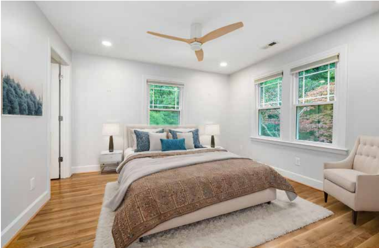
Inviting Primary Bedroom Suite (VIRTUALLY STAGED)