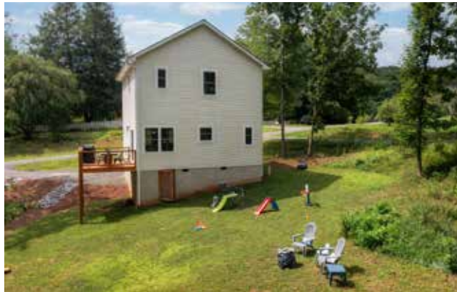
Durable Siding and Crawl Space Access