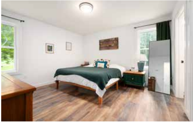
Primary Suite Features Gleaming Luxury Vinyl Floors