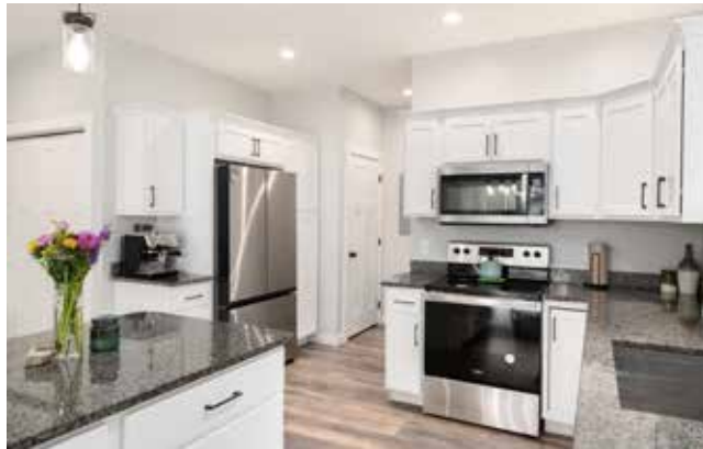
Granite Countertops and Sparkling Stainless Steel