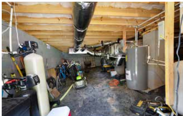
Tall Crawl Space for Extra Tool + Toy Storage

52 SHULER ROAD New Custom Home with Unique Finishes Candler, NC 28715