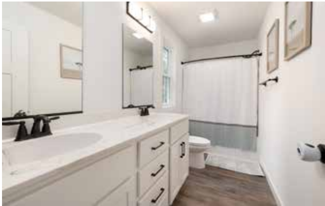
Double Vanity in the Ensuite Bathroom