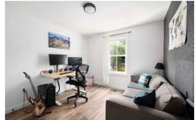
Third Bedroom Upstairs Makes a Great Home Office