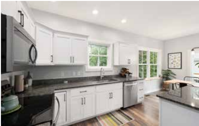
Lots of Cabinet and Countertop Space