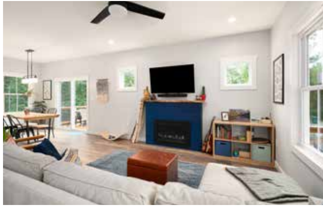
Living Room with Shiplap-Surround Electric Fireplace