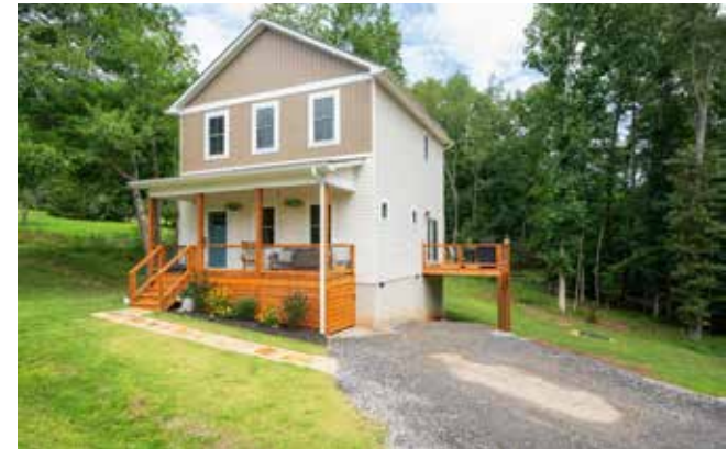
Plenty of Parking