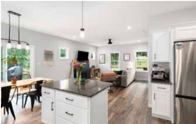
Flowing Floor Plan for Entertaining