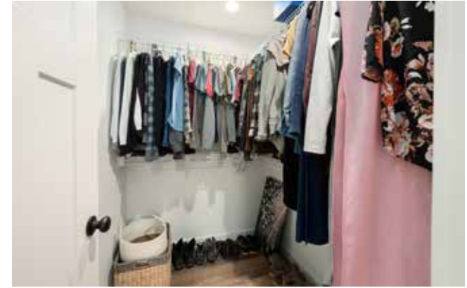
Large Walk-in Closet