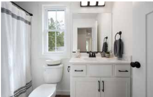
Second Full Bathroom Upstairs