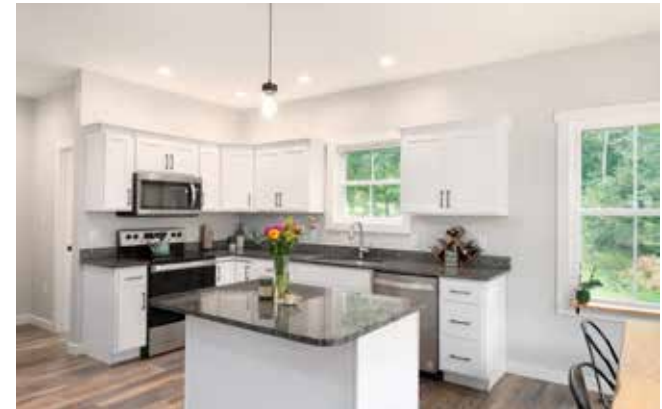
Well-Appointed Kitchen with Large Island/Breakfast Bar