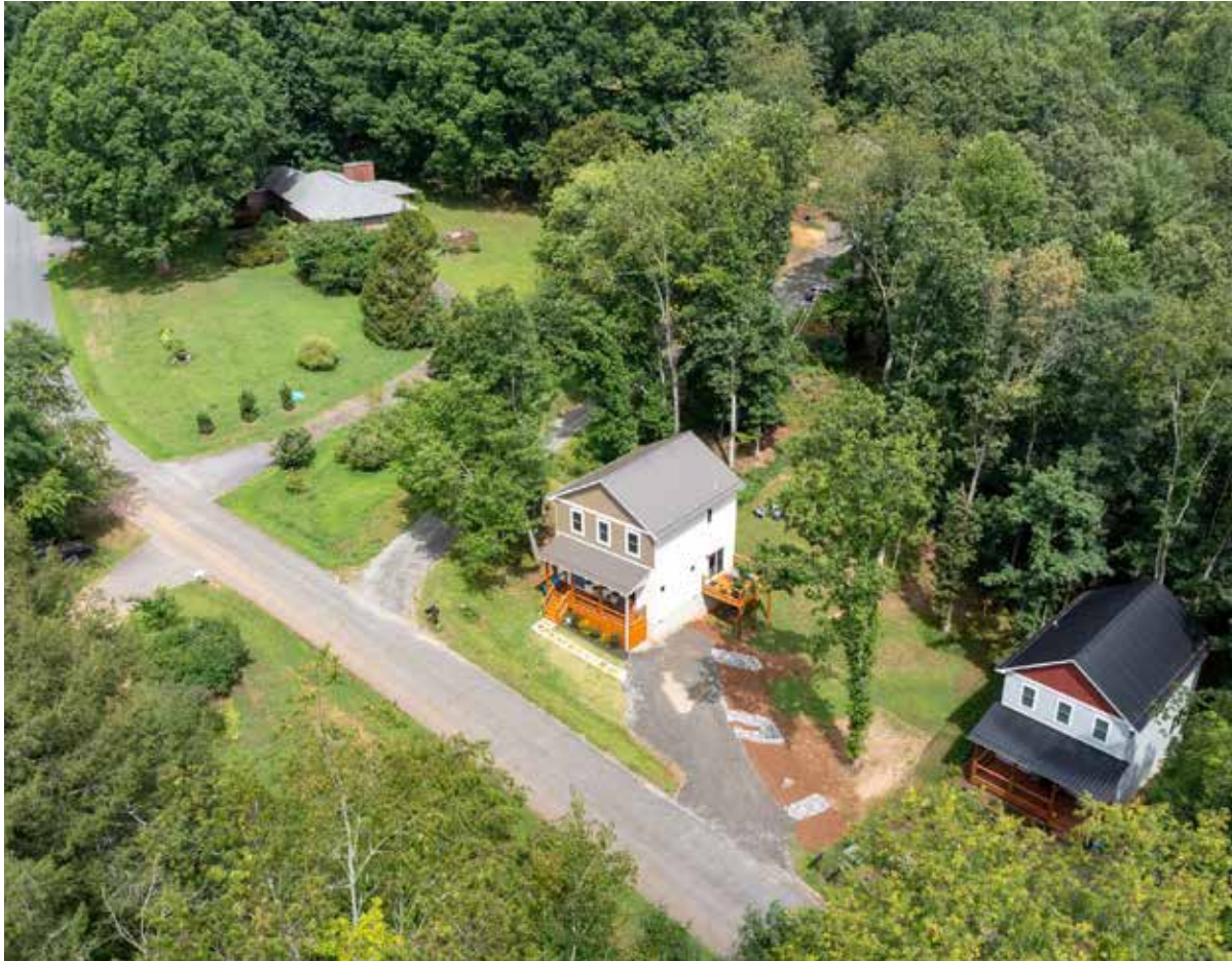
Located on a Quiet, No-through Street

Beautiful and well-maintained 3 BR/2.5 BA home on a large lot in picturesque Candler — adjacent to Biltmore Lake, and only 20 minutes to West Asheville and downtown Asheville. Enjoy an excellent location in a quiet neighborhood, boasting mountain living in a private setting, with easy trail access only 1.5 miles away into Bent Creek recreation area — ideal for the hiker/ biker enthusiast. Entertain from the bright and airy living room, well-appointed kitchen, dining area, and two decks (a covered front porch and a sunny side deck). The upstairs hallway connects three bedrooms and two full bathrooms, and includes the primary bedroom that features a large walk-in closet, and ensuite full bathroom. Powder room and laundry closet on main level. The spacious yard is ready for a multitude of outdoor activities, including gardening, and gathering with friends, pets and family. Plenty of parking + lots of extra tool + toy storage.