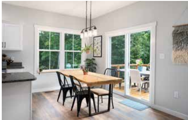
Dining Area off of Kitchen