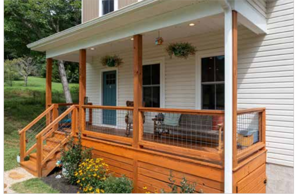
Covered Front Porch Welcomes You Home