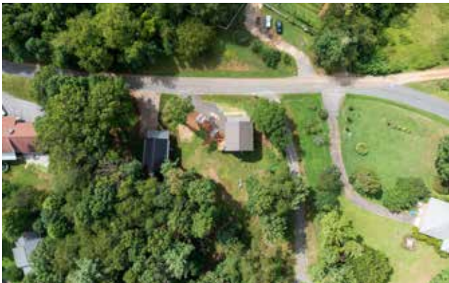
Country Setting Close to Asheville