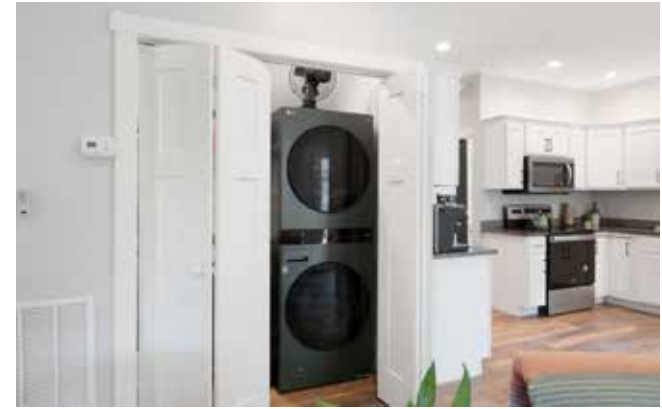
Laundry Closet on Main Level