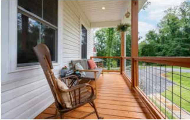
Room for Relaxing on a Lazy Summer Day