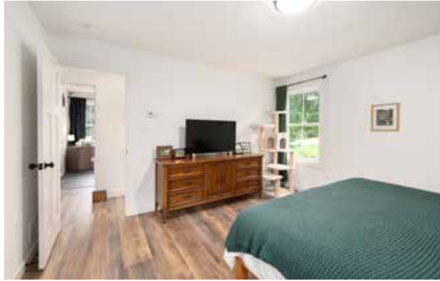
Natural Light Floods the Home