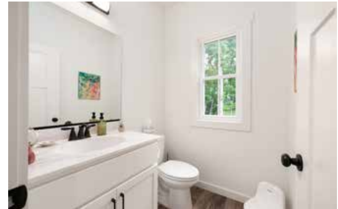
Powder Room on Main Level