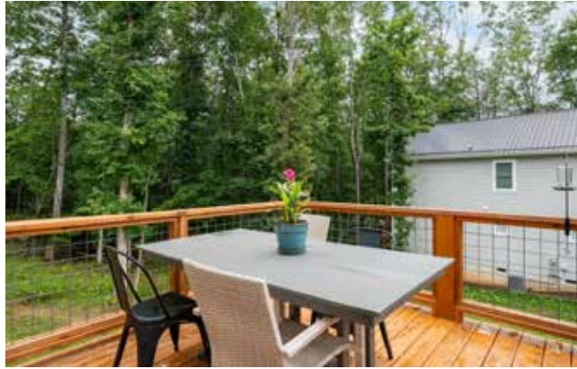
Sunny Back Deck Is Perfect for Al Fresco Dining