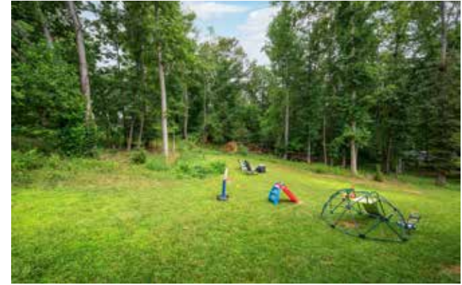
Tons of Outdoor Living