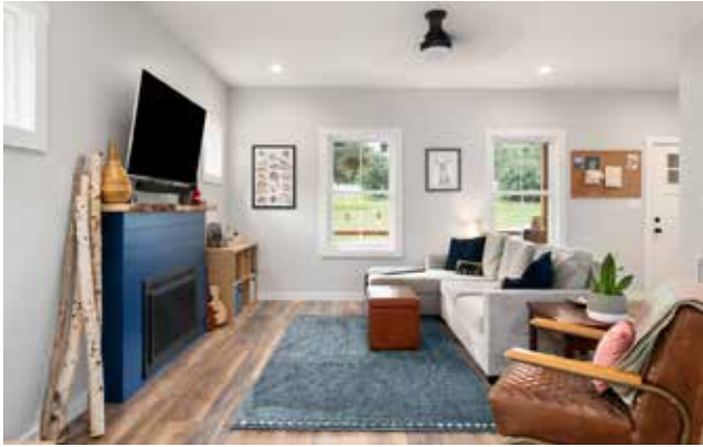
Open and Airy