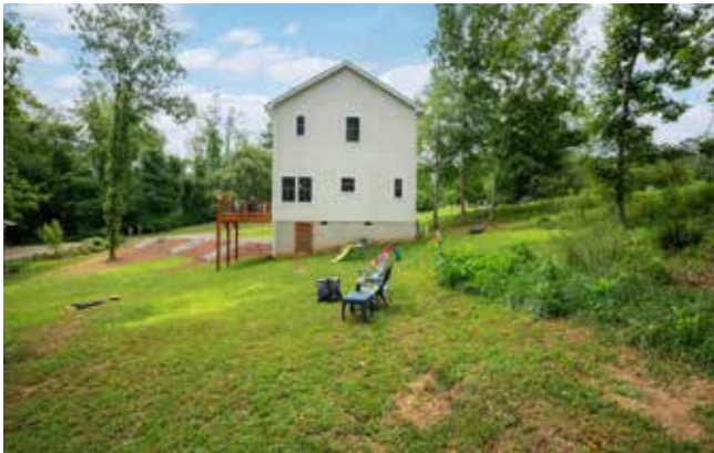
Ideal Space for Gathering