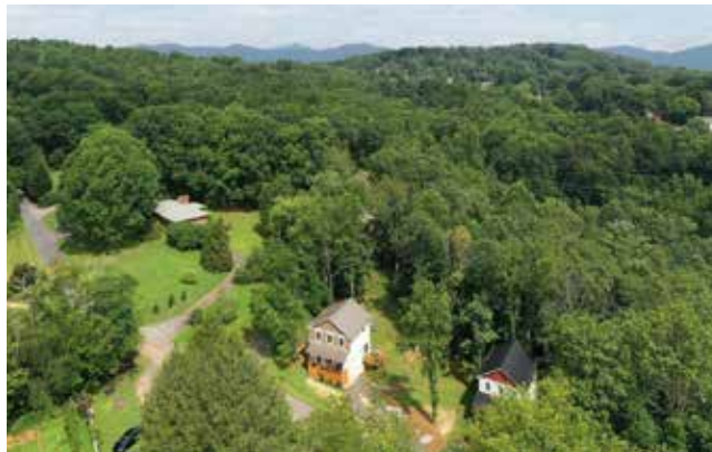
Easy Living in Western North Carolina

52 SHULER ROAD Lovingly Maintained Home in Candler Candler, NC 28715