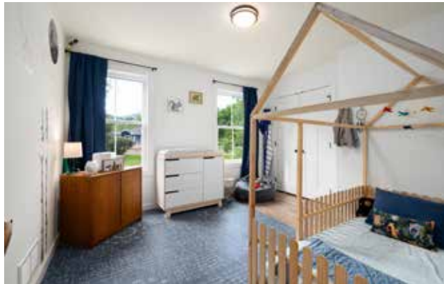
Second Bright Bedroom