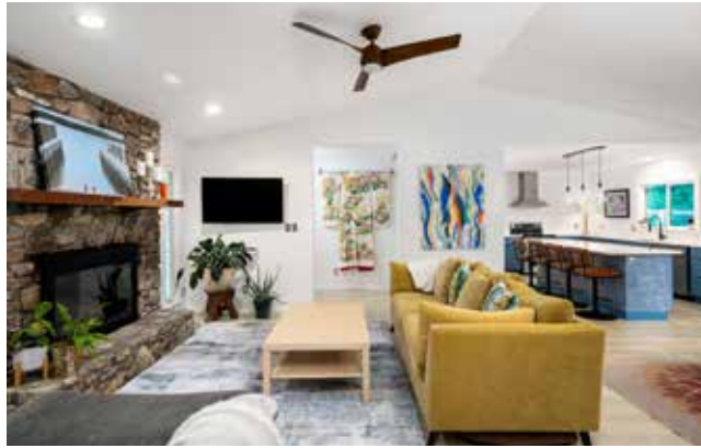
Vaulted Ceilings with Recessed Lighting in Living Room