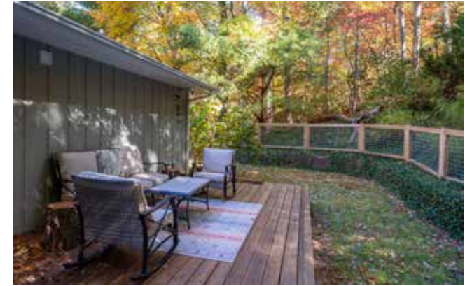
Private Space for Enjoying Nature