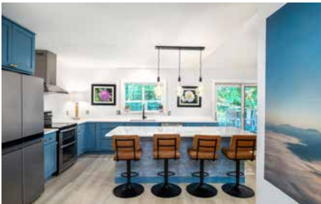
Chef's Kitchen with All-New Appliances