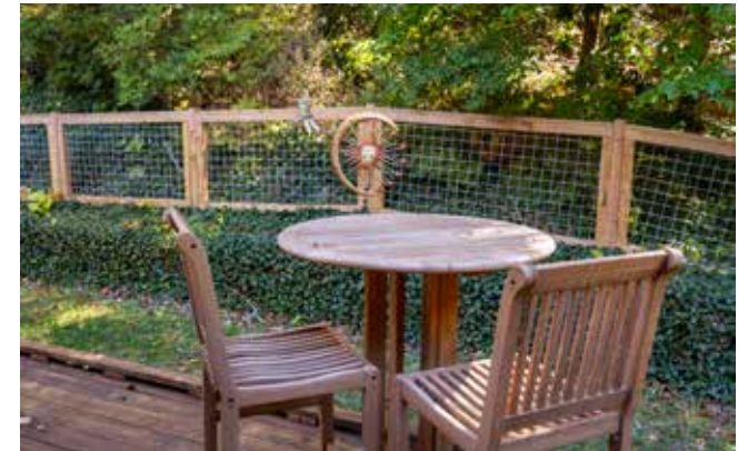
Perfect for Al Fresco Dining