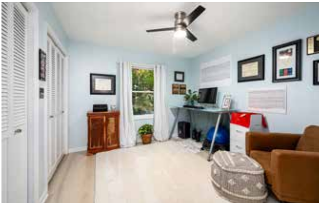
Fourth Bedroom Makes a Great Office Space