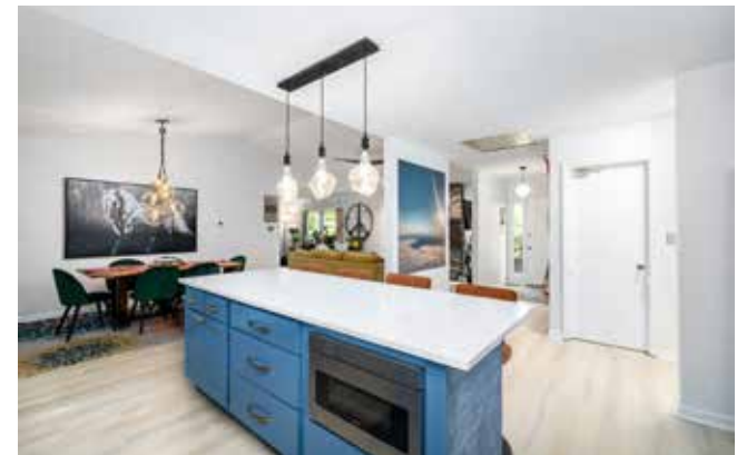
Microwave Drawer and Plenty of Cabinet Space