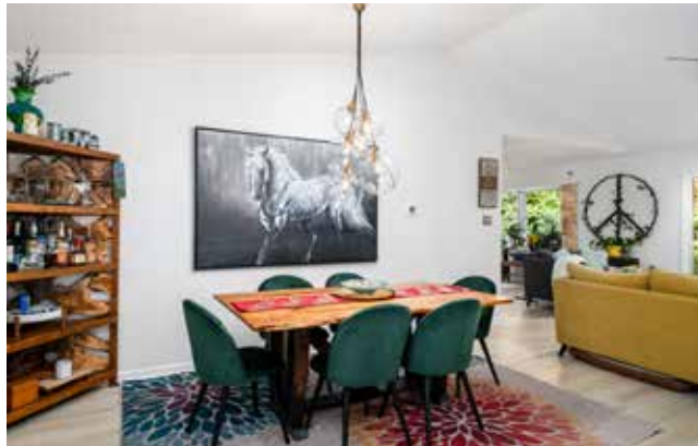
Custom Touches throughout House