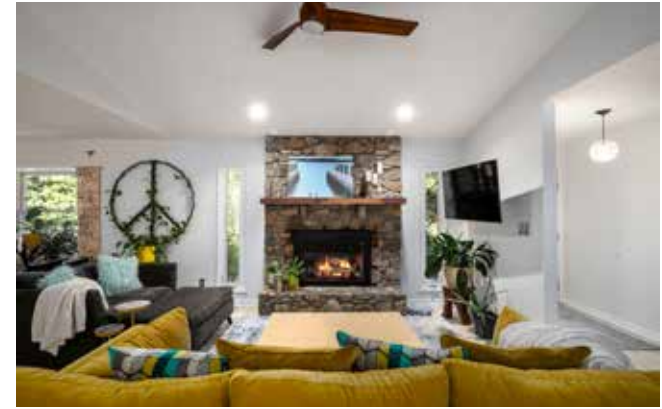
Stone Hearth with New Flue Liner, High-End Glass Door