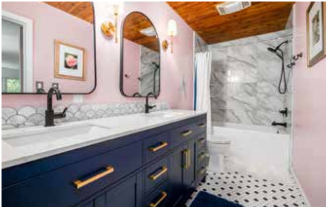
Double Vanity in Primary Bathroom