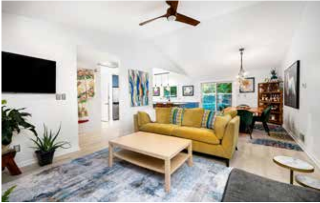
Gentle, Flowing Floor Plan