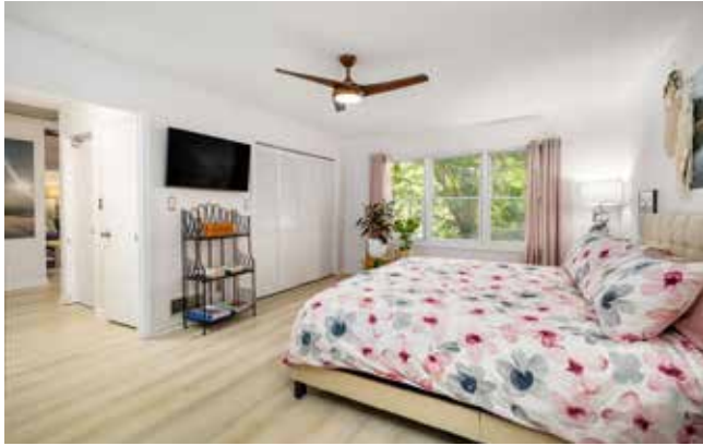
Cozy Primary Bedroom