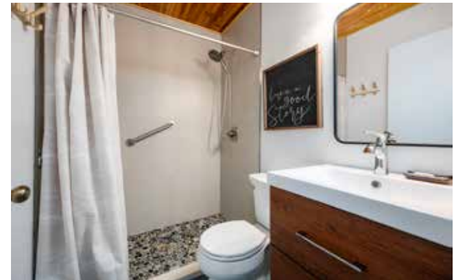
Creative Bathroom Design with River Stones