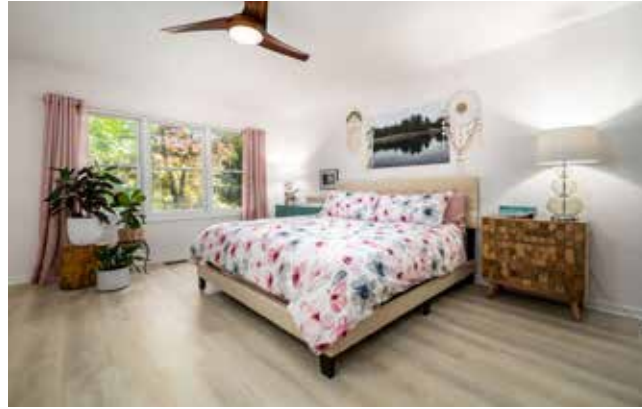
Great Seasonal Views through the Triple Window