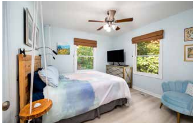
All Bedrooms Have Ceiling Fans with Lights