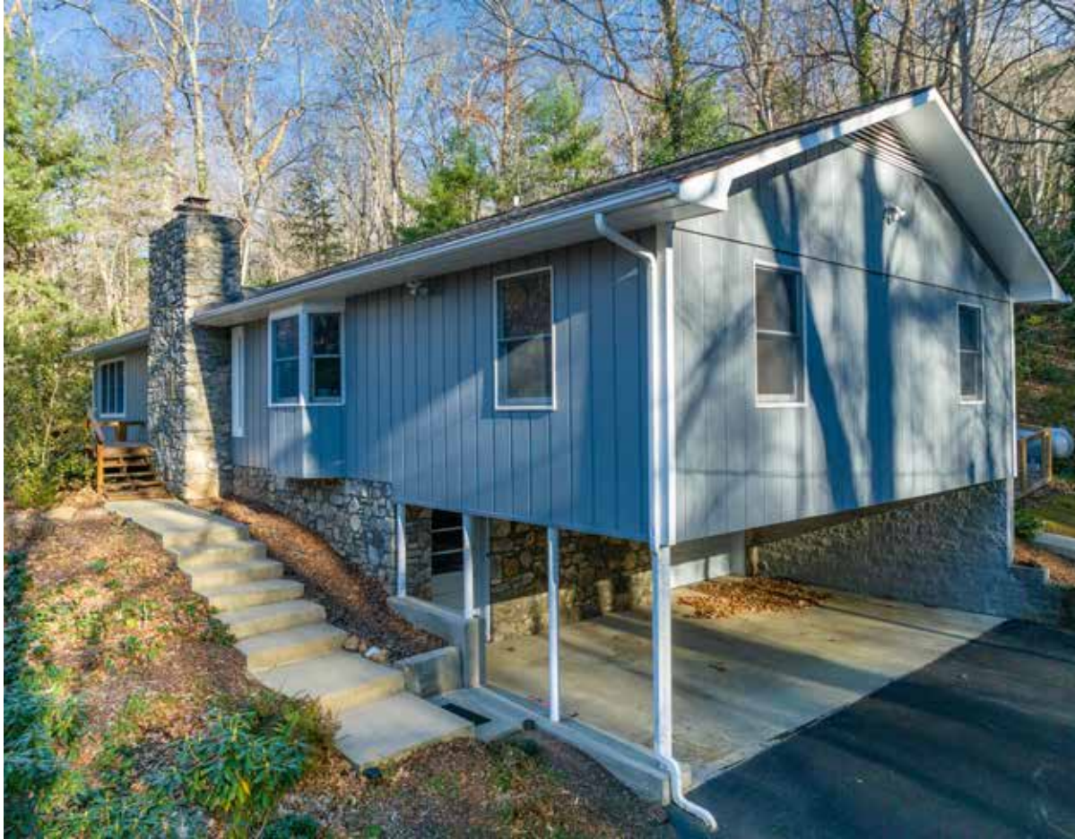
Newly Remodeled Home

Recombination of parcel (with new price and lot configuration) is pending county approval; road maintenance agreement and some deed restrictions will apply. Love where you live in this private home, nestled in the mountains of East Asheville. Rare-to-find, premium property with gentle terrain and buildable land holds a stunning 4 BR/3 BA home with a convenient split-bedroom floor plan. The centerpiece is the chef's kitchen with new stainless steel appliances, quartz counters, and an oversized island, perfect for entertaining. Living/dining areas have a vaulted ceiling, plus access to the back deck and fenced-in yard. Enjoy a cozy fire in your living room this winter — or bundle up and head out to enjoy the surroundings. Large, unfinished basement on slab offers expansion options. Other features include established trails, a paved driveway, and a Generac generator. National forest at the end of the road. Less than 15 minutes to downtown Asheville. No drive-bys, by appointment only!