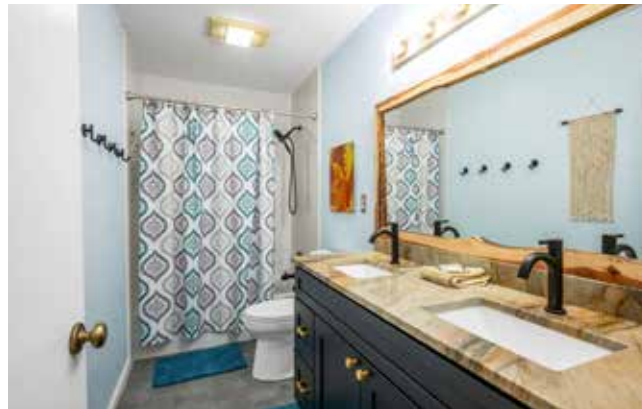
Double Vanity and Shower/Tub in Hallway Bathroom