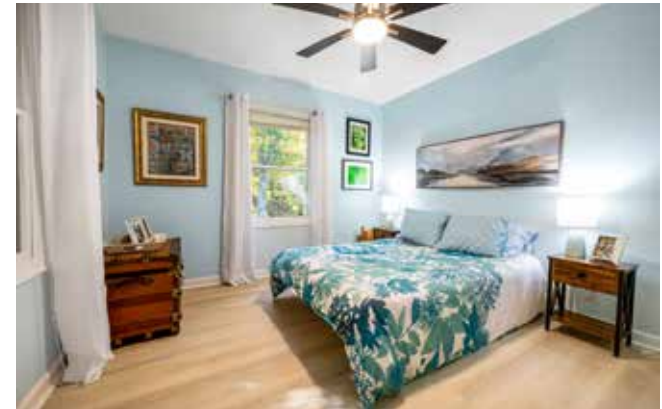
Treehouse Feel in Back Bedroom