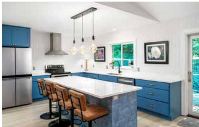
Enjoy Bar-Top Dining