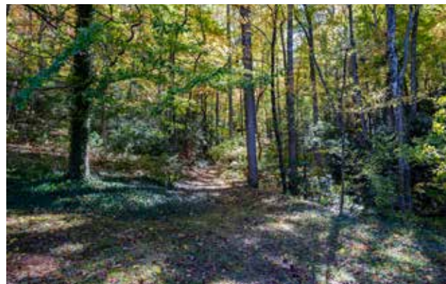
Established Walking Trails