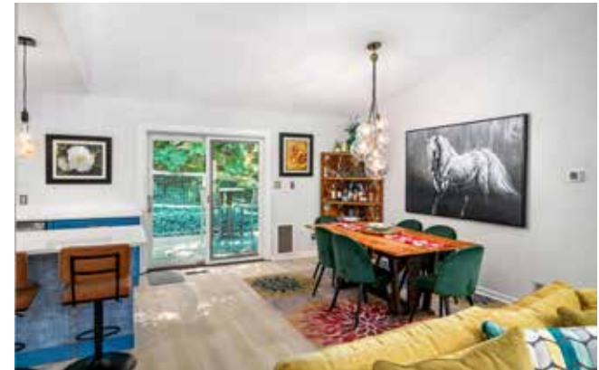
Back Deck Access off Kitchen