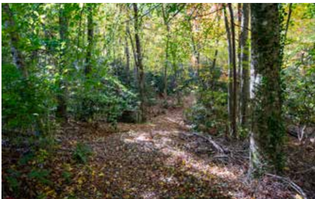
Property Shares a Border with Buffalo Mountain Estate