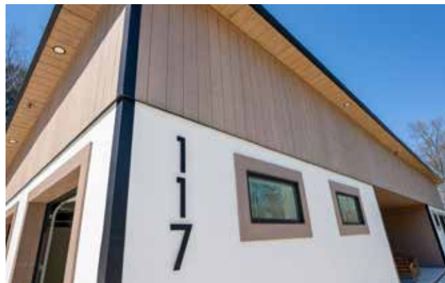
Attractive and Durable Siding