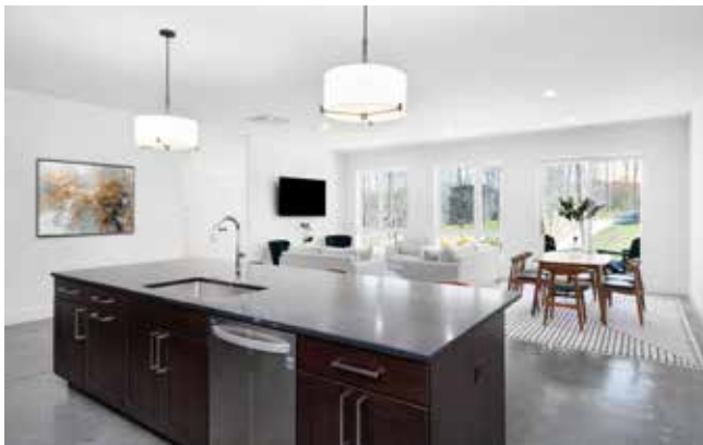
Expansive Island Connects Kitchen and Living Area