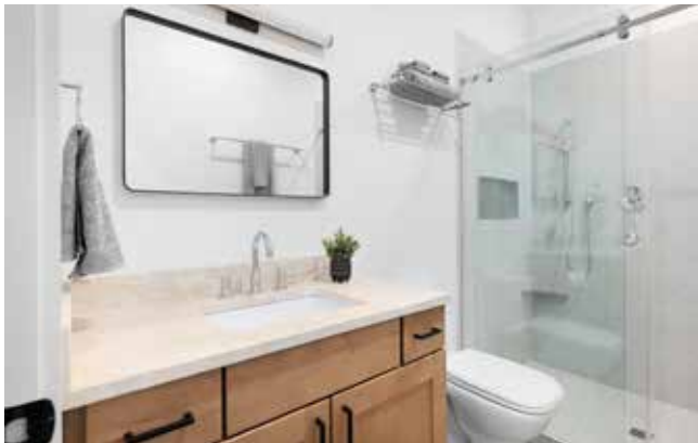
Second Full Bathroom