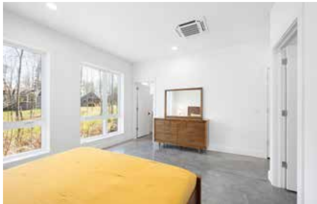
Primary Bedroom Features an Ensuite Full Bathroom ...