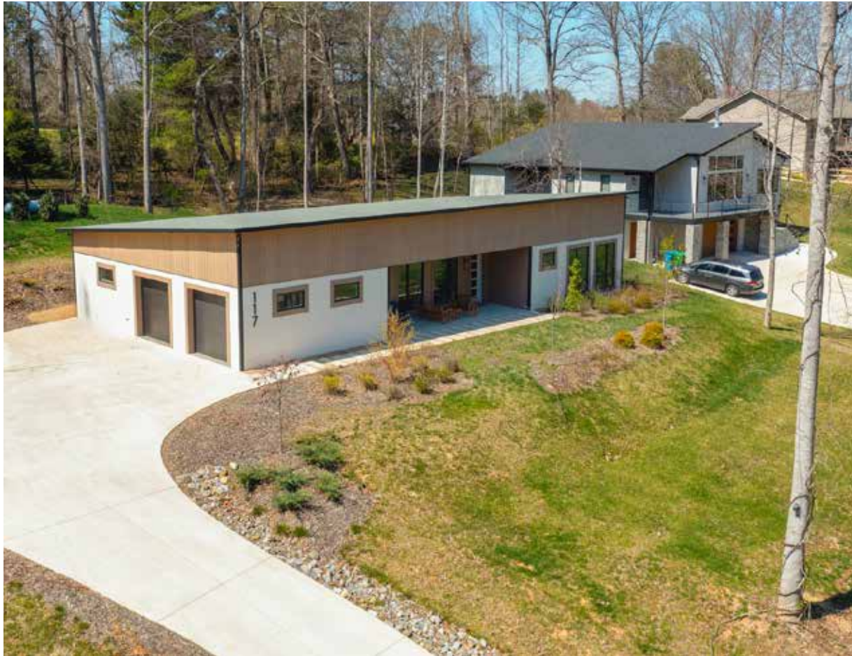
Stunning Curb Appeal and Plenty of Parking, Including the Attached Two-Car Garage

Modern and sophisticated home in a private pocket neighborhood with spacious lots and a blend of stunning architectural styles. Nestled close to Woodfin and downtown Asheville, this home boasts ideal one-level living with no-step entry. The expansive, covered front patio, open floor plan, and oversized windows blend inside and outside for healthy living — and provide a front-row seat to the blooming springtime mountains and a thoughtfully landscaped yard that requires minimal maintenance. Entertain friends and family from the chef's kitchen, bright living room, and spacious dining area. Hallway connects three bedrooms and includes the luxurious primary suite with two large closets and a well-appointed full bathroom. Second full bathroom with tiled, zero-entry shower, and granite-topped vanity. Powder room, laundry nook, and extra storage closets on the main level. Oversized two-car garage with extra storage space is plumbed for EV charging station.