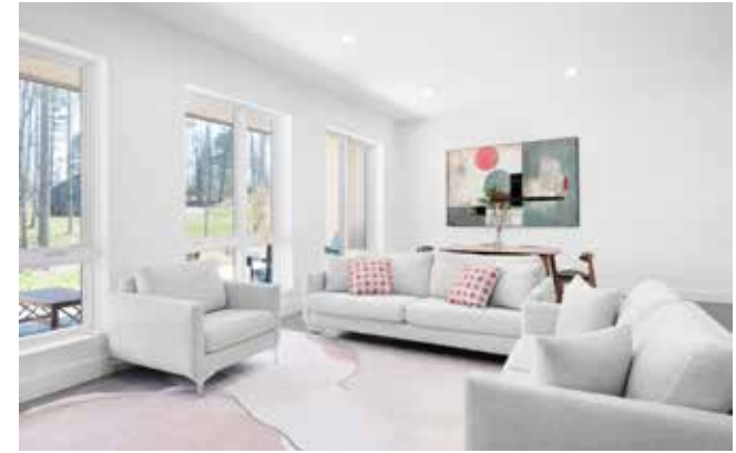
Lovely Space to Gather with Friends and Family