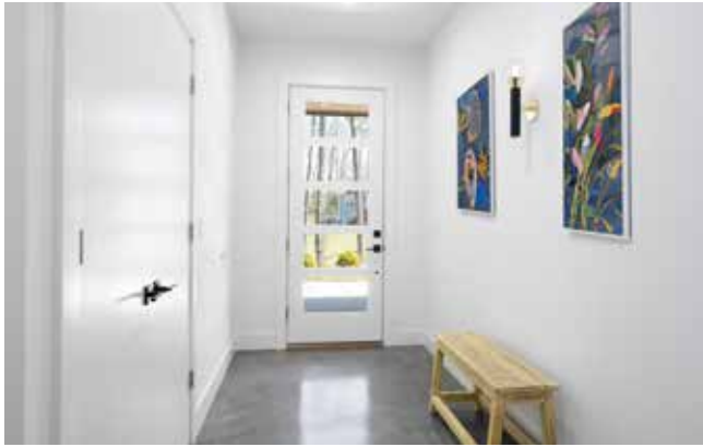
Inviting Foyer with Coat Closet