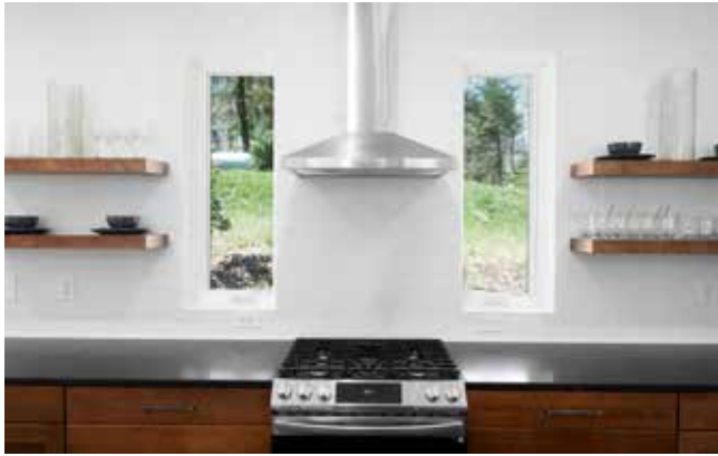
Vented Five-Burner Gas Range