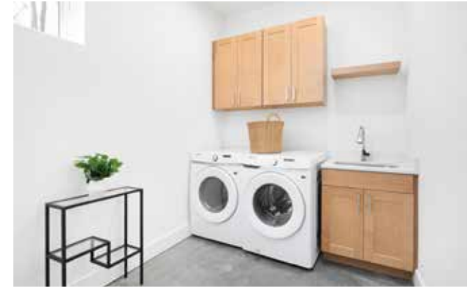
Laundry Nook with Cabinet Storage and a Utility Sink