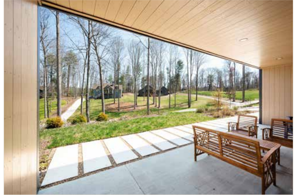
Large-Stone Pavers Highlight Intelligent Landscape Design