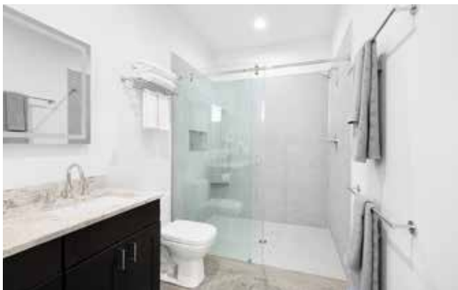
... a Tiled, Zero-Entry Shower ...