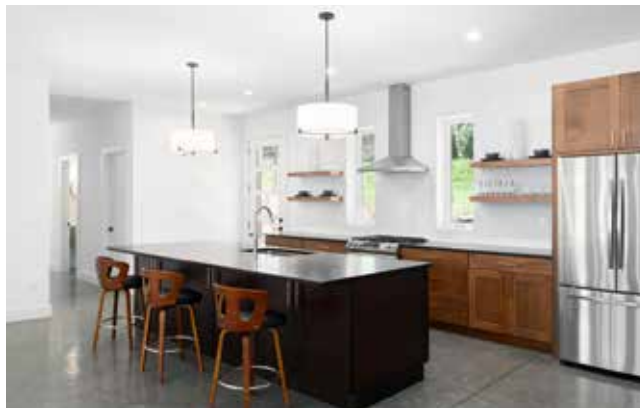
Kitchen Features Honed Granite and Stainless Steel