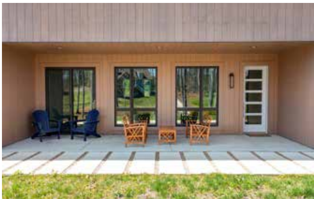
Clean Lines and Thoughtful Design