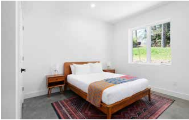
Second Bedroom with Private View