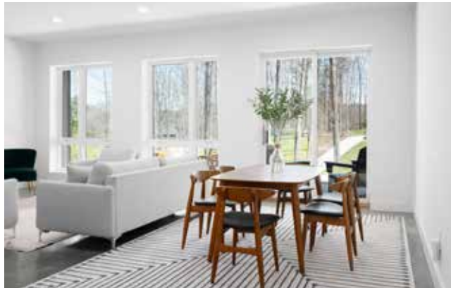
Oversized Windows Flood the Home with Natural Light