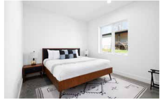
Third Bedroom on Main Level