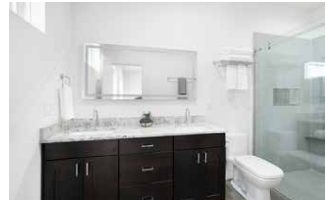
... with a Granite-Topped Double Vanity ...