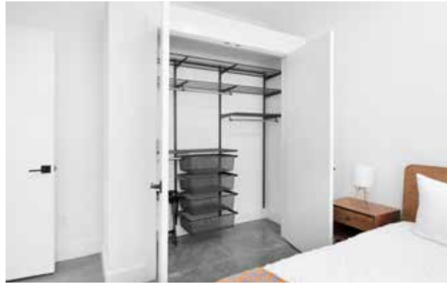
Ample Closet Space in All Main-Level Bedrooms