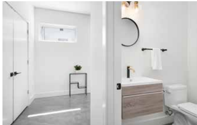
Powder Room Complements Attention to Detail