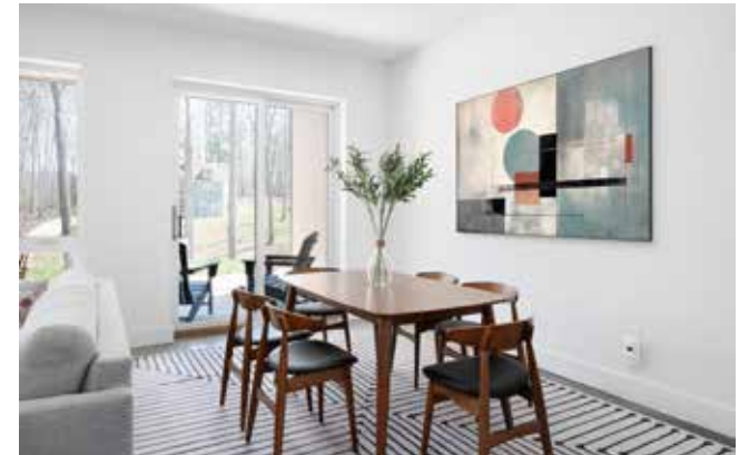
Dining Area with Space for Large Table