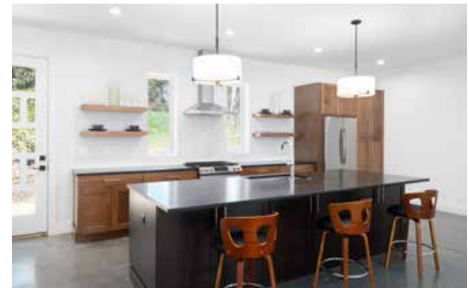
Large Breakfast Bar, Modern Fixtures, Floating Shelves