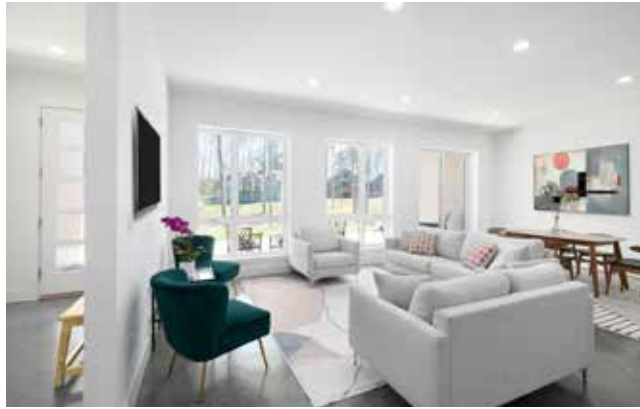
Spacious Living Room with Heated Concrete Floors