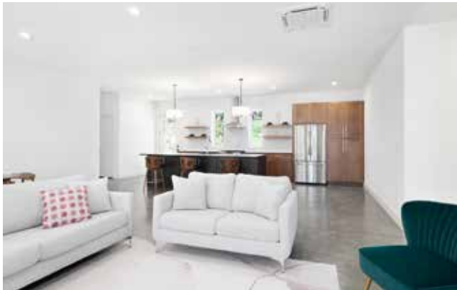
Seamless Transition Creates Great Flow