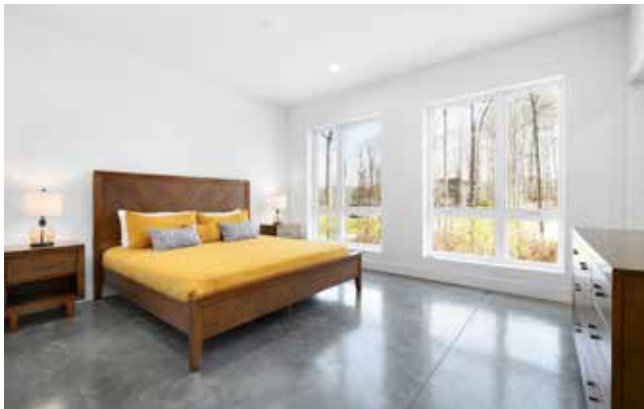
Primary Suite Gets Great Sun