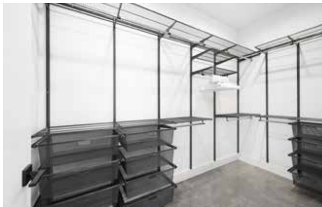
... and a Huge Walk-in Closet