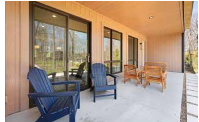
Covered Patio Beckons Meaningful Conversations