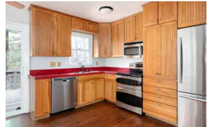
Stainless Steel Appliances and a Backyard View