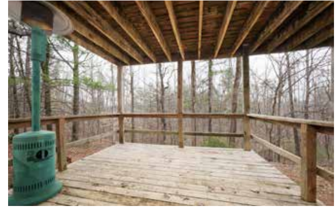
... on both Upper- and Lower-Level Decks