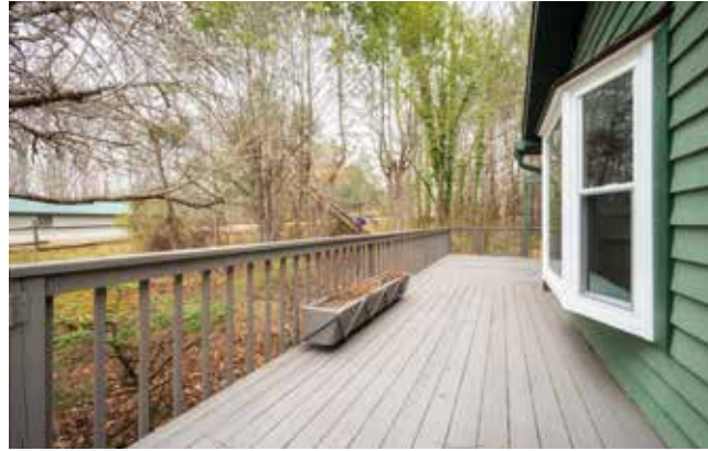
Plenty of Room for Relaxing and Entertaining ...