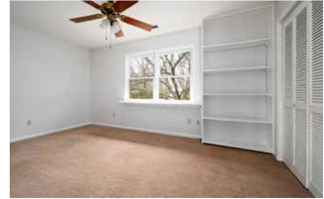
Bedrooms Equipped with Ceiling Fans