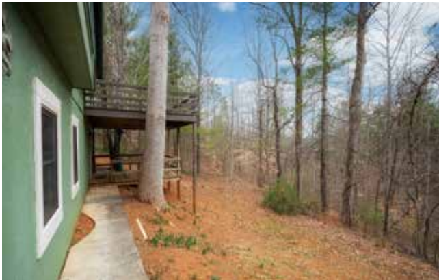
Decks Overlook the Private Backyard