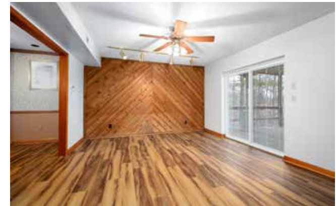
Wood-Paneled Accent Wall