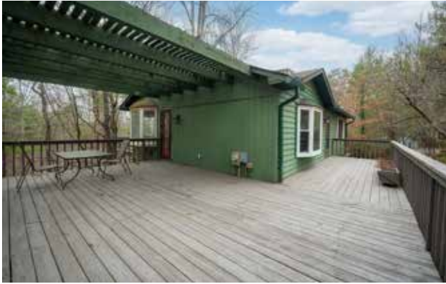
Enjoy the Outdoors with This Large Wraparound Deck