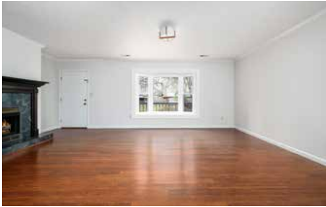
Front Door Opens to Living Room