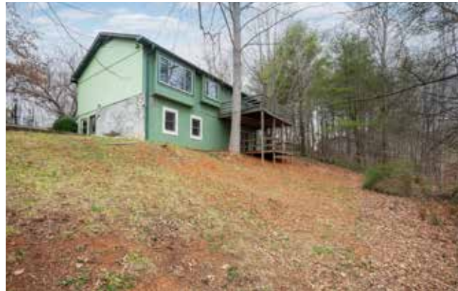
Rear View of Home