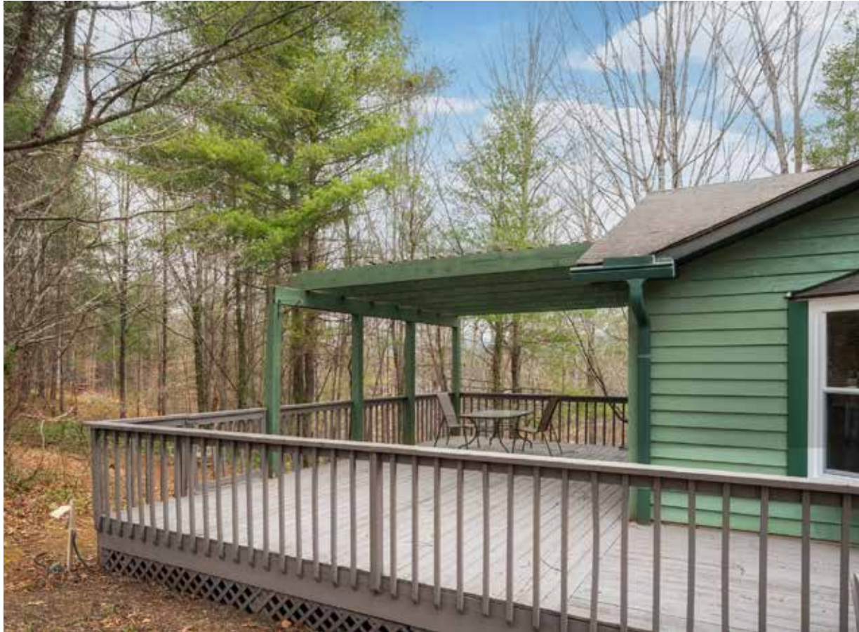
Great Spot for Morning Coffee

Updated 1980 home with a fully finished basement and expansive outdoor living areas on 1.49 wooded acres with mountain views. Located on a quiet, dead-end street in a peaceful, woody neighborhood; only a short drive to Weaverville and downtown Asheville. Three bedrooms, two full bathrooms, a basement bonus room with wet bar, and more than 2,000 SF of heated living space inside; a wraparound deck, upper and lower porches, a shed, and a circular driveway outside. Upgrades include bamboo flooring, gas fireplace, interior paint, recent deck repairs, many replacement windows/doors, and more, including a fully remodeled lower-level bathroom with a walk-in shower. Only small additional repairs and light maintenance are needed to make this property shine. If you're looking for a fantastic first home, a long-term residence, or an investment property in a tranquil and private setting enveloped by nature, this home is for you. Mature landscaping. NO HOA. Open-use zoning. Same owner since 2006.