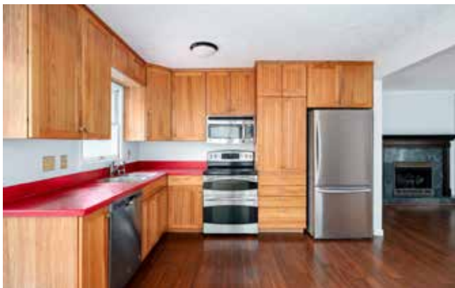
Bright, L-Shaped Workspace and Ample Cabinetry