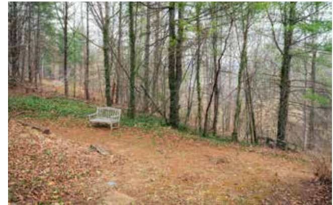
Peaceful, Quiet, Rolling 1.49-Acre Setting