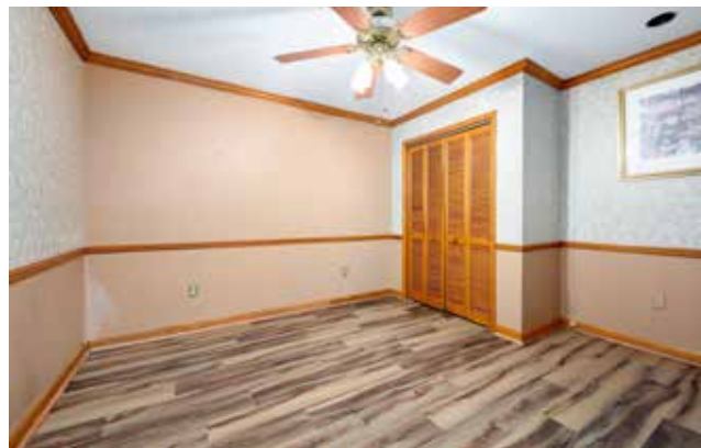
... and a Large Closet for Even More Storage