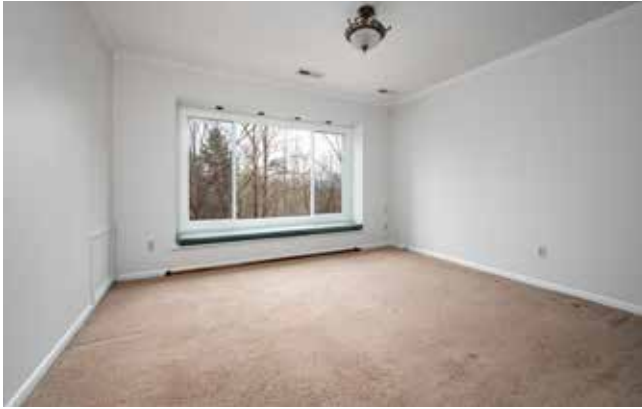
Nice-Sized, Main-Level Bedroom