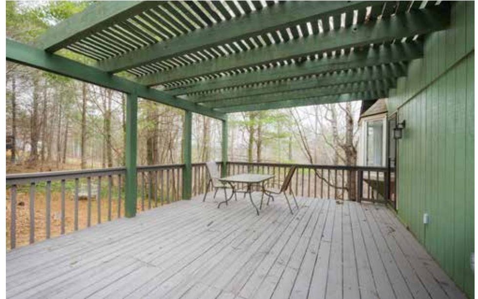
Great Outdoor Areas for Entertaining