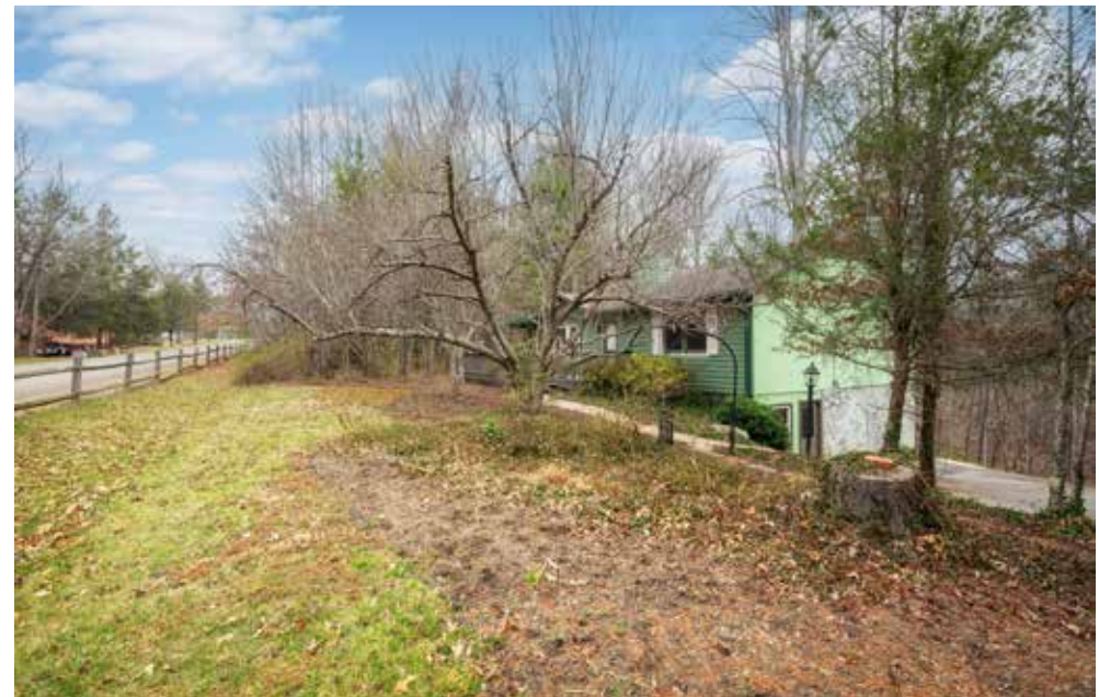
Level Front Yard