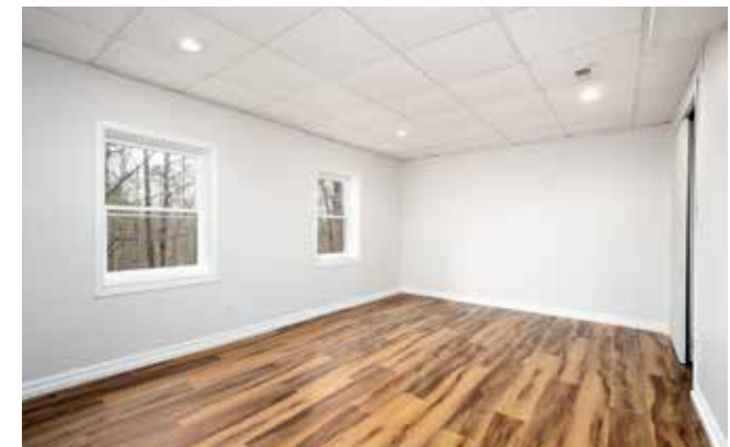
Light and Bright Lower-Level Bedroom