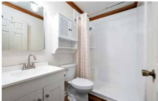
Hall Bathroom with Walk-in Shower