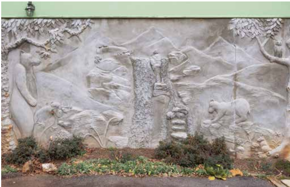
Artistic Concrete Entry Wall