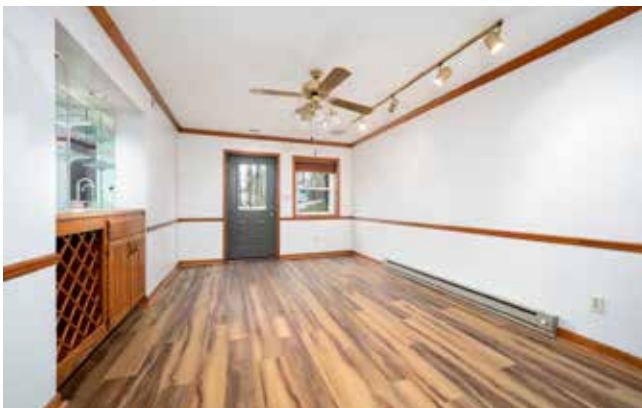
Basement Has a Wet Bar and Outside Access ...