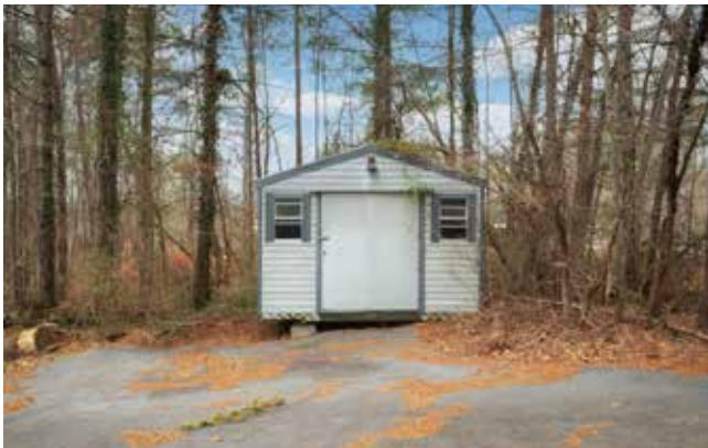
Outbuilding for Hobbies or Storage