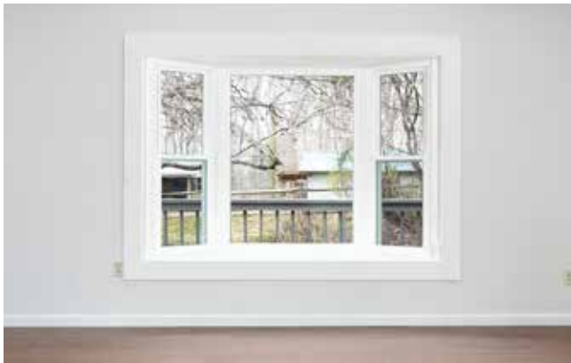
Bay Window in the Living Room