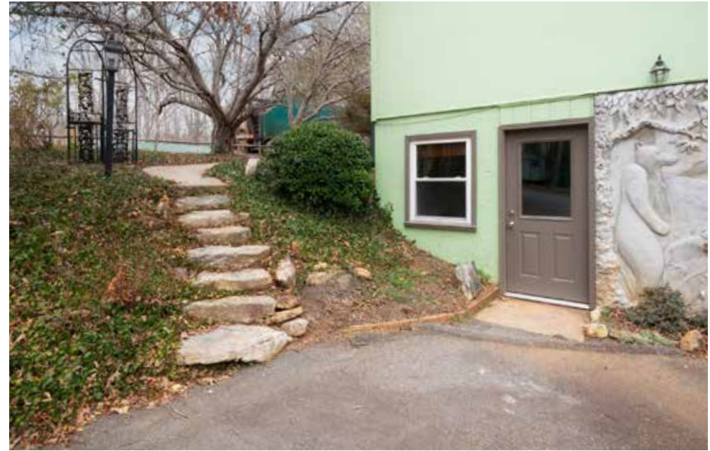
Custom Rock Stairs