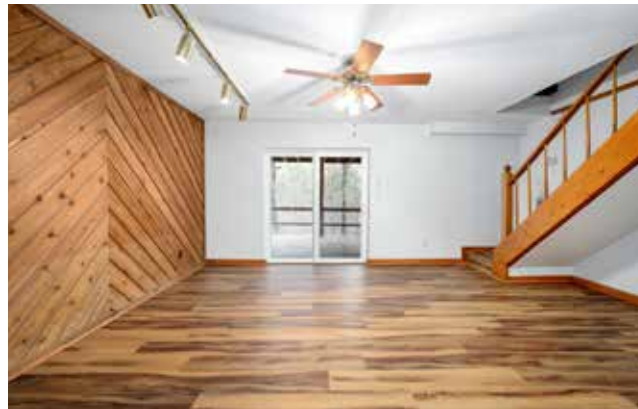
Bonus Room in Basement