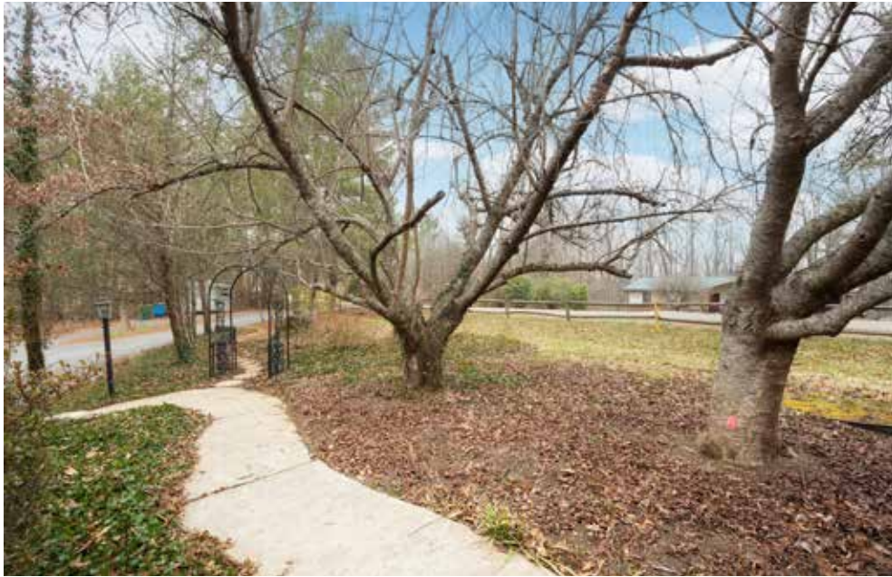
Large Wooded Lot with Mountain Views Is Private and Tranquil