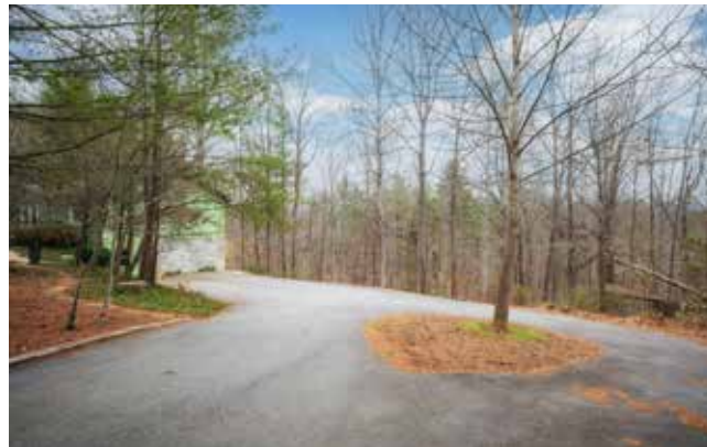
Located on a Quiet Cul-de-Sac