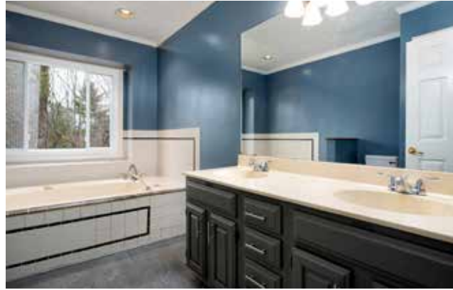
Double Vanity and Soaking Tub in Primary Bathroom