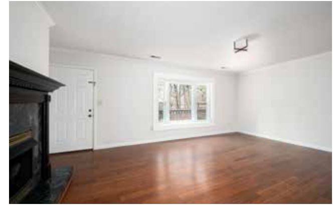
Bamboo Flooring • Propane Fireplace