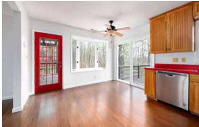
Eat-in Kitchen Has a Bay Window and Easy Deck Access