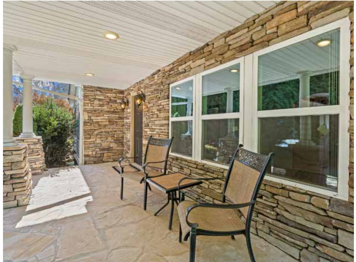
Awesome Front Porch

Candler cutie for less than $300k! About a mile to the I-40 on-ramp and less than 15 minutes to downtown Asheville, this 1950s cottage is ready for your vision. Warm wood floors and white walls (except for the kitchen) await your personalization and energy to transform this charmer to suit your style. Check out the retro-tiled bathroom with a laundry chute! And the red corner kitchen, complete with west-facing double windows over the sink. One of the biggest (literally!) perks of this property is the unfinished basement, where you can create an art studio, arrange your adventure gear, wet your workshop whistle, or use it in whatever endeavors you desire. And Candler's on the rise, with its own appealing destinations like the revitalized Buncombe County Sports Park, Ferguson YMCA, Wicked Weed Brewing, a sprawling Ingles, and a plethora of restaurants and retail shops. Head over to Oak Hill and take a look today!