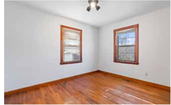
Ready for You to Paint Your Colors