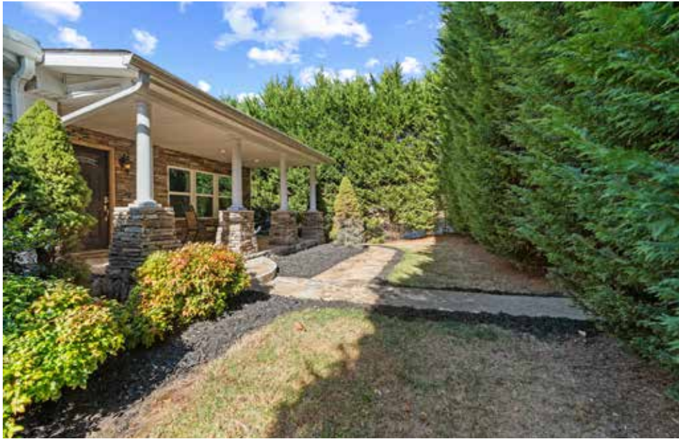
Evergreen Screen for Year-Round Privacy