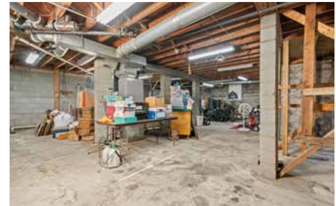
What Will You Do in All This Space?