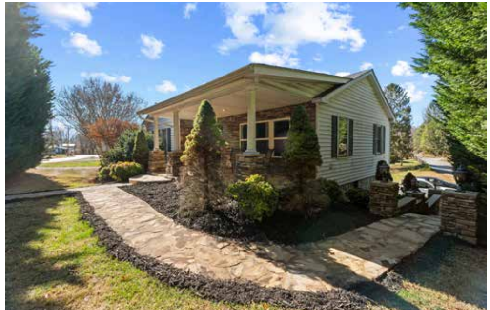
Cute Candler Starter Home