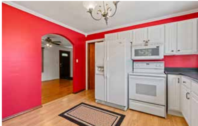
Arched Detail Leads to the Living Room