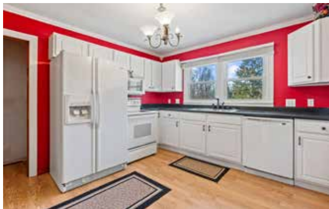
Double Window over the Kitchen Sink