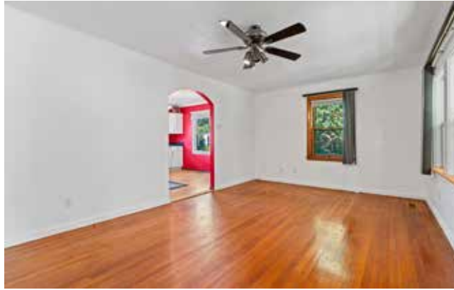
Where Will the Sofa Go?