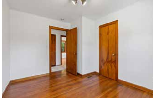
Warm Wood Floors