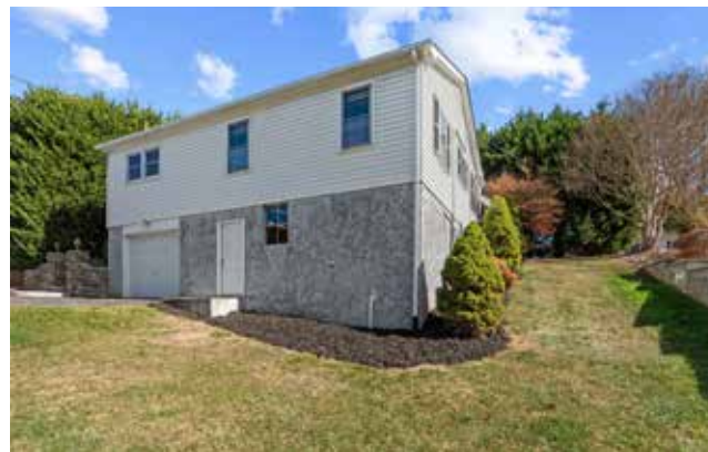
Low-Maintenance Vinyl Siding