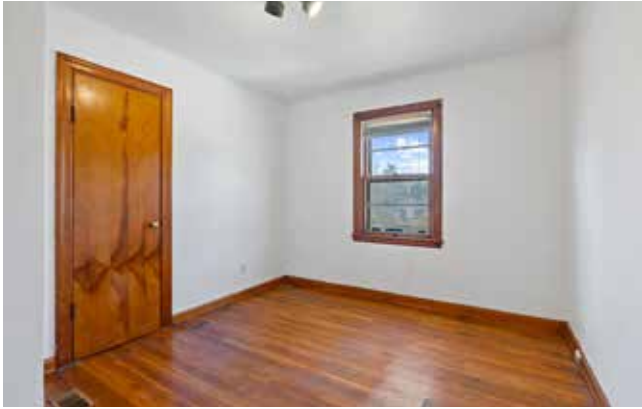
Three Bedrooms on the Main Level