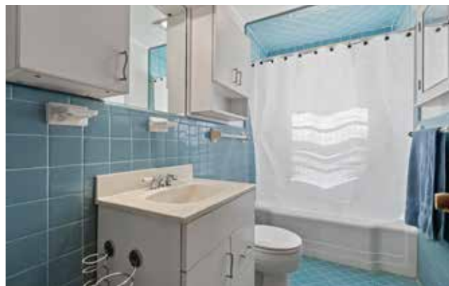
Full Bathroom with Retro Tile