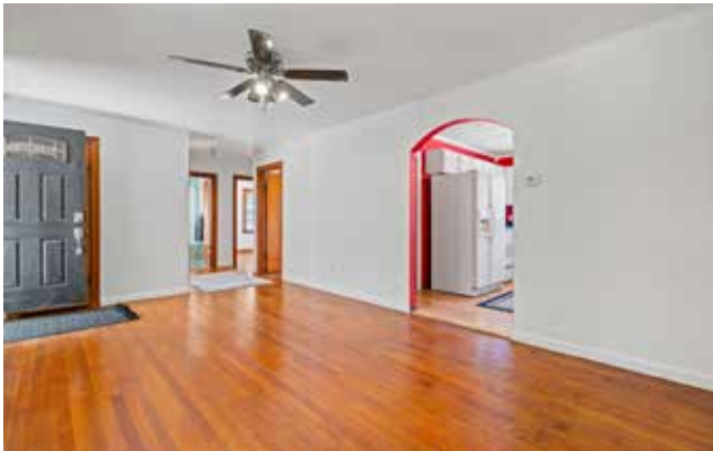
Central Living Room Connects to Kitchen and Bedrooms