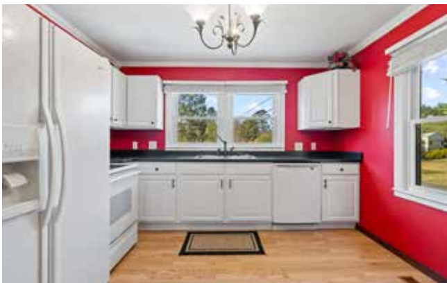
Cute Corner Kitchen