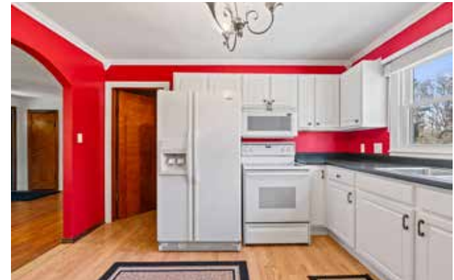
Access to the Basement through the Kitchen