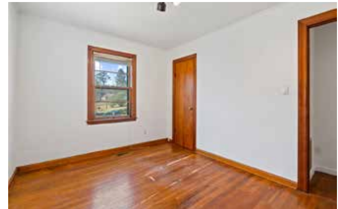
Rear Corner Bedroom