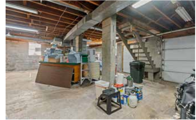
Spacious, Unfinished Basement