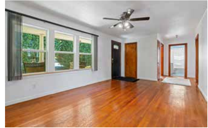
Fresh Paint and Ready to Decorate