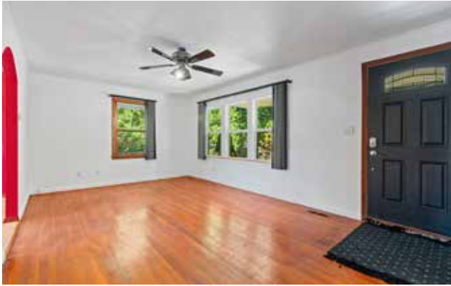
Living Room with Wood Floors and Nice Light