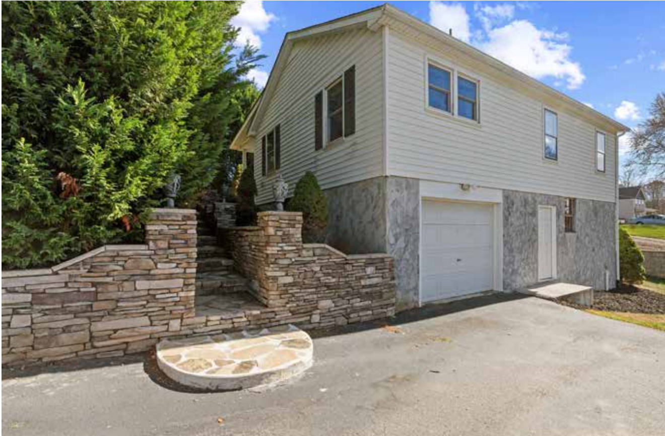
Charming Stone Accents