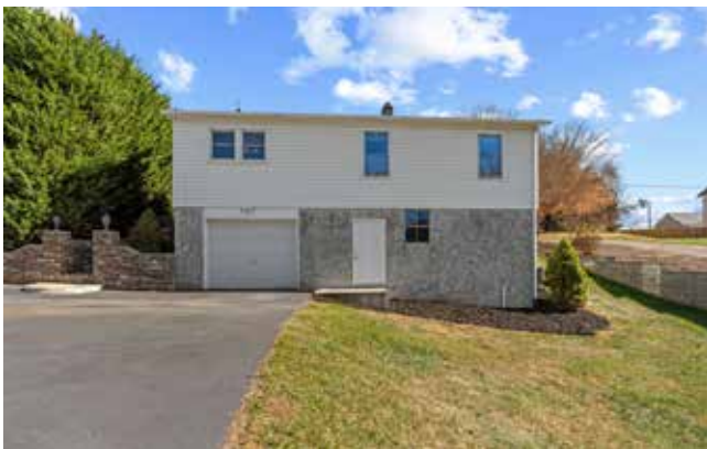
Large Basement for Storage, Studio or Flex Space