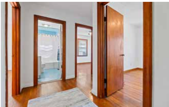
Open Hallway Access to Bedrooms and Bathroom