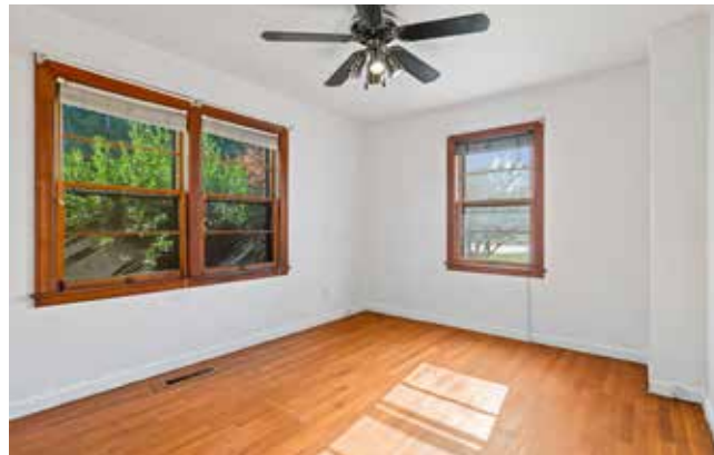
Corner Windows for Nice Light