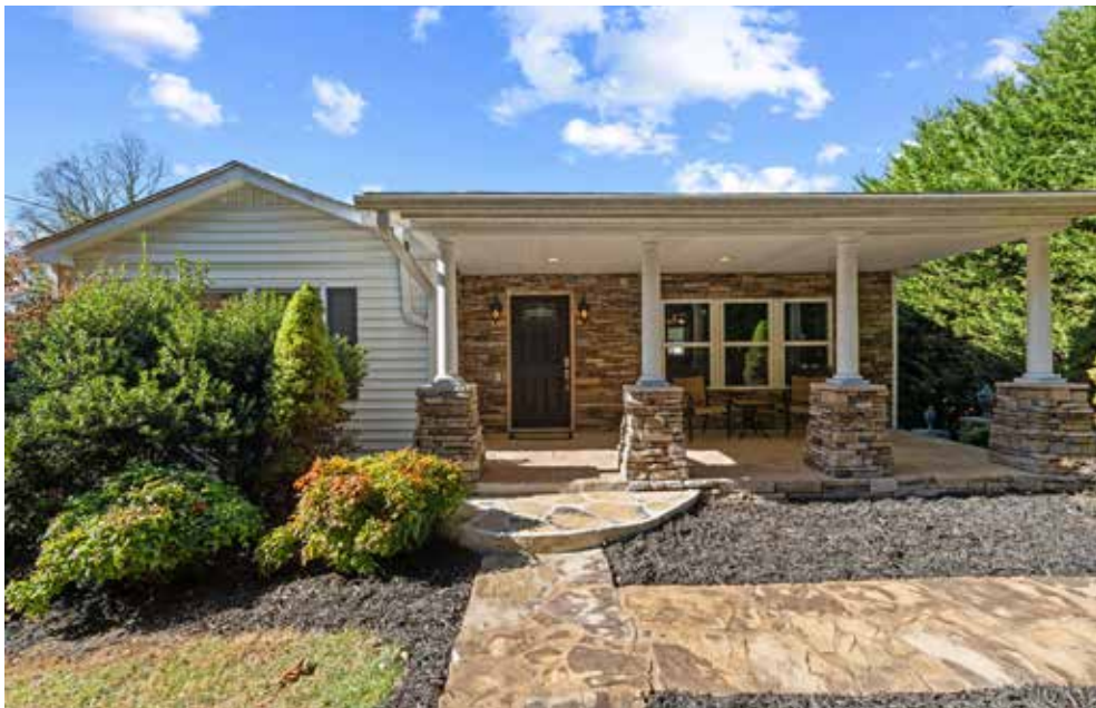
Shade-Covered Front Porch