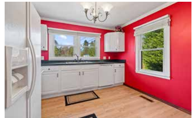
Room for a Table in the Right Corner of the Kitchen