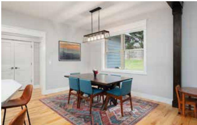
Located between Living Area and Kitchen