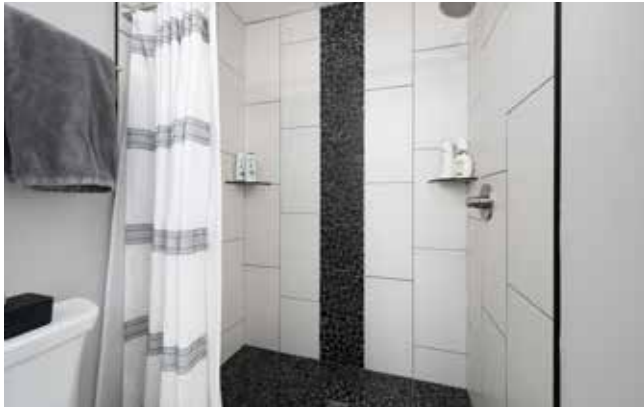
Tile Accent in the Shower