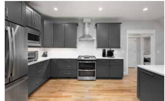
Ample Countertop and Cabinet Space