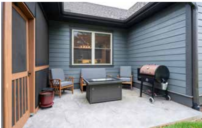
Adjacent Grill and Firepit Area