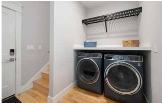
And a Laundry Area