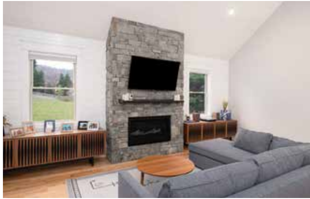
Modern Fireplace with Floor-to-Ceiling Stone Surround