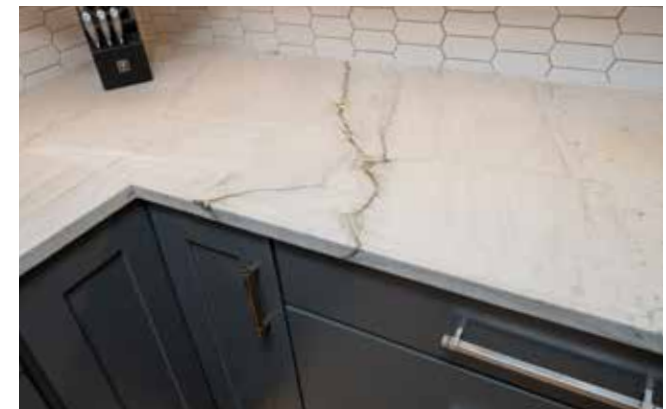
Macabus Quartzite Countertops