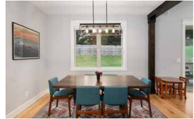
Light-Filled Dining Area