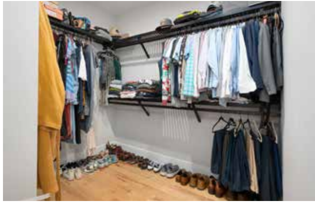
Primary Suite's Walk-in Closet