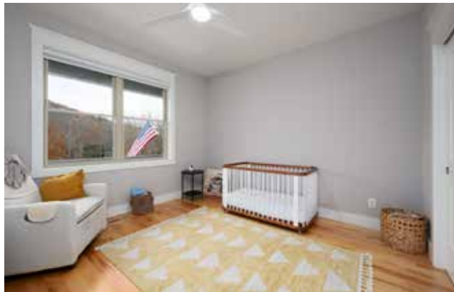
Second Main-Level Bedroom • Easterly Mountain Views