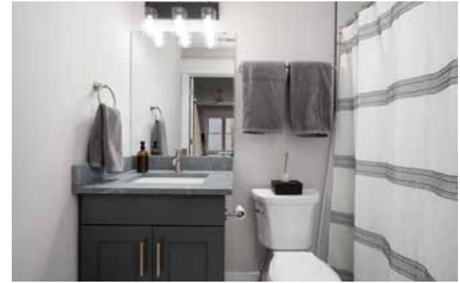
Ensuite Full Bathroom