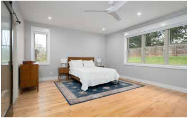
Primary Bedroom with Oversized Windows