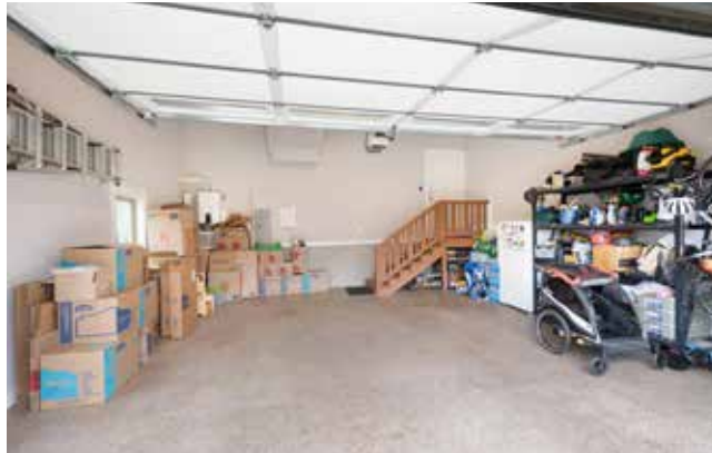
Spacious Garage with Epoxyed Floor