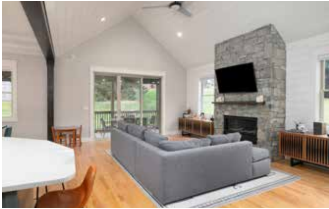
Vaulted Ceiling with Tongue-and-Groove Wood