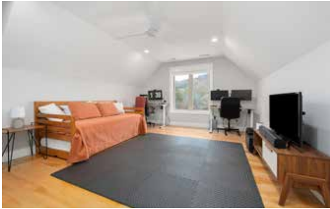
Bonus Room over Garage