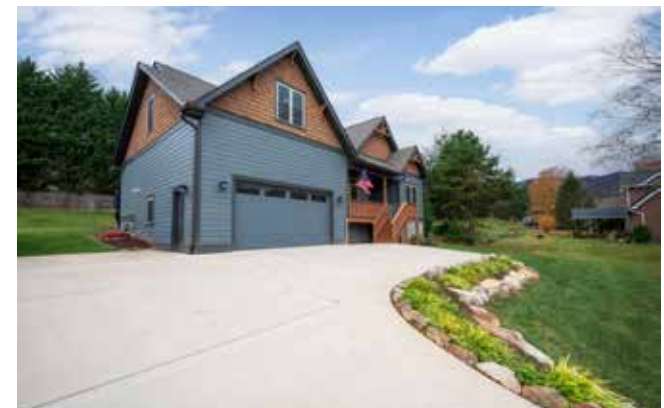
Tons of Parking