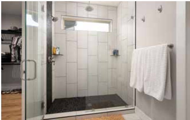
... and a Step-in Shower with Large Tile