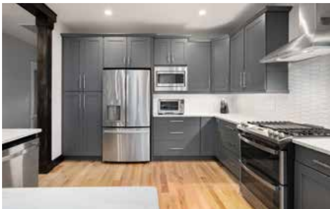
Stainless Steel Appliances Include a French-Door Fridge ...