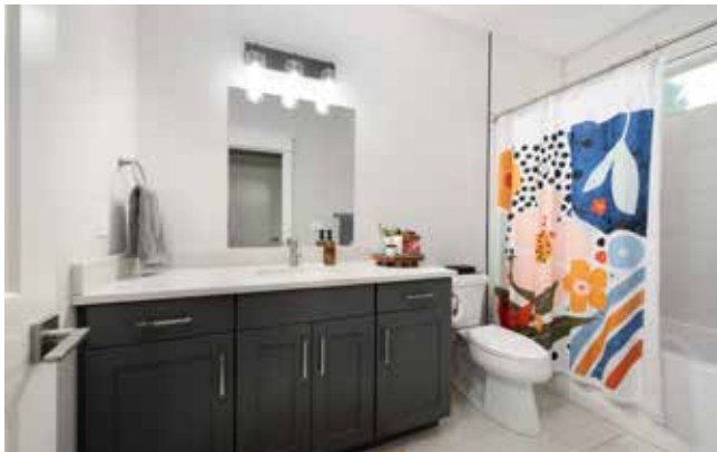
There's Also a Guest Bathroom on the Main Level