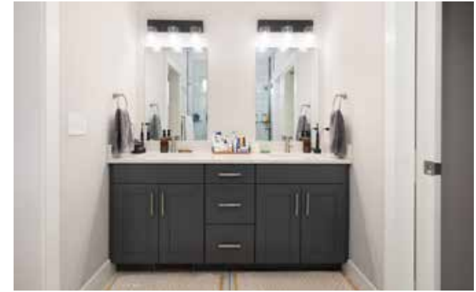
Ensuite Bathroom Features a Dual Vanity ...