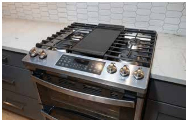
... and a Gas Range with a Double Oven