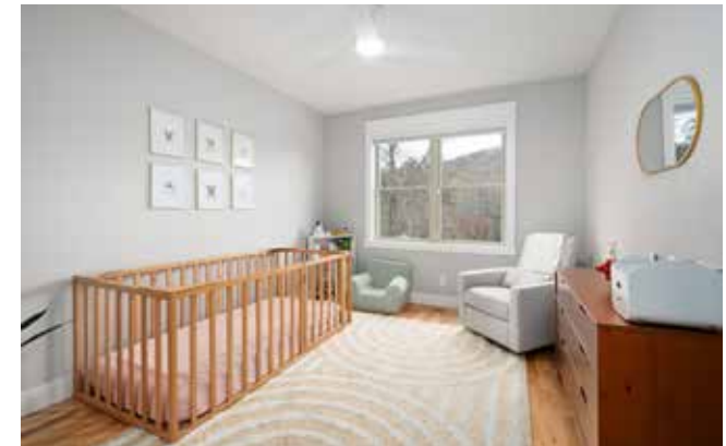
Third Main-Level Bedroom with Views