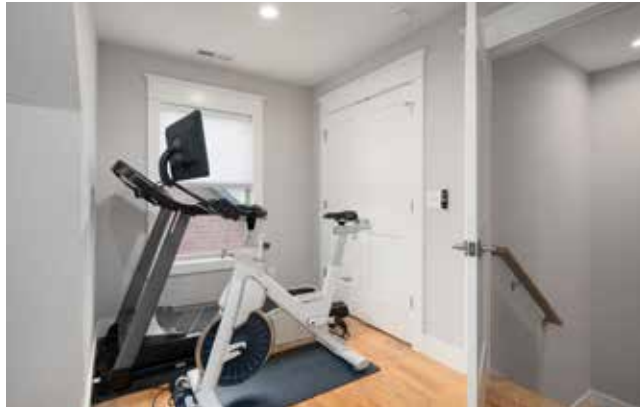
Makes a Great Gym, Office, or Fourth Bedroom