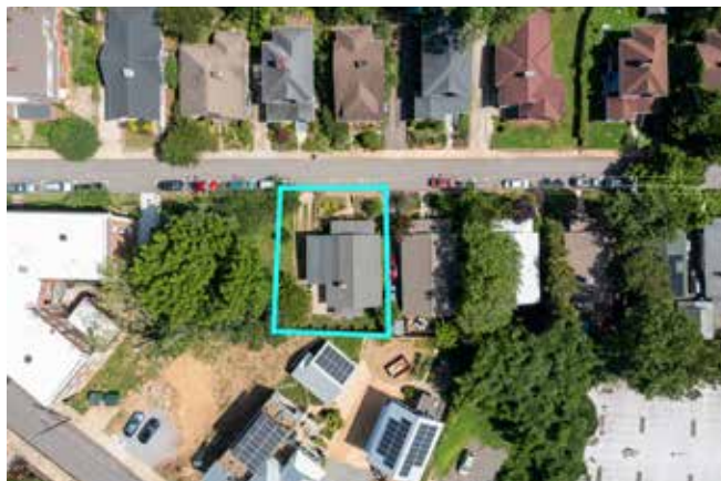
30 MONROE PLACE Classic Bungalow in the Heart of Five Points Asheville, NC 28801