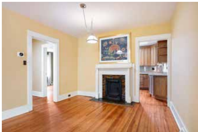
30 MONROE PLACE Classic Bungalow in the Heart of Five Points Asheville, NC 28801