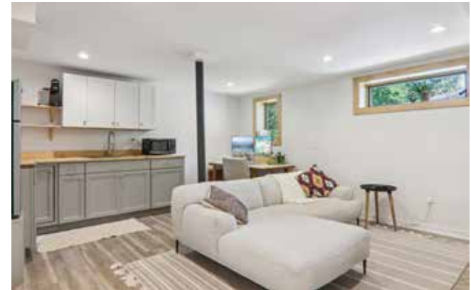
Space for Desk or Dining in the Corner