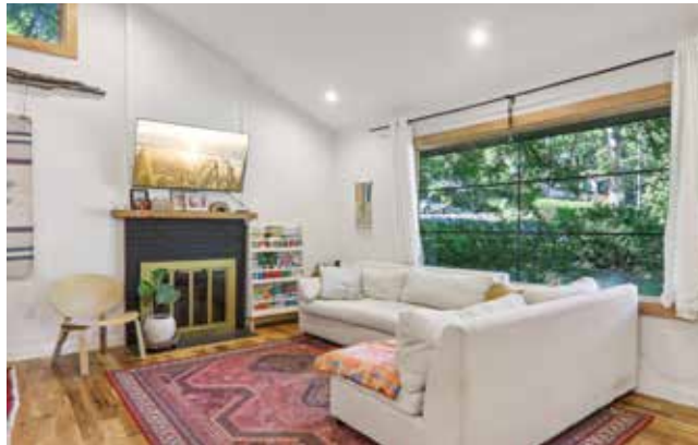
Vaulted Ceiling, Modern Fixtures