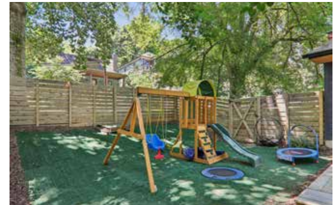
Swingset Is Negotiable