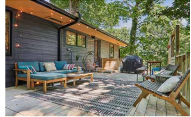
Shady Spot for Some R&R