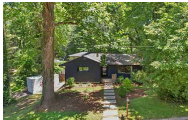
Majestic Trees and Woody Setting