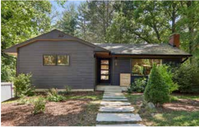
Welcome to 1 Melbourne Place!