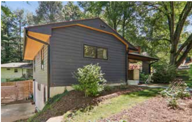
Slick Modern Renovation to the Studs in 2020