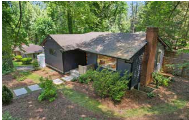
Roof's Recent Professional Cleaning Has a 5-Year Warranty