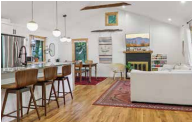
Open Living, Dining and Kitchen