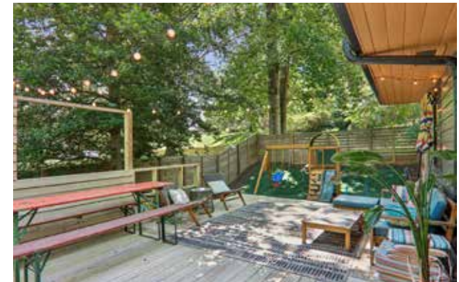
Spacious Deck Flows from the Kitchen