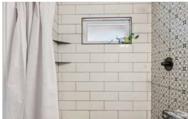
Subway + Fashionable Bathroom Tiles

1 MELBOURNE PLACE 1955 Stylishly Renovated Cottage in Montford Asheville, NC 28801