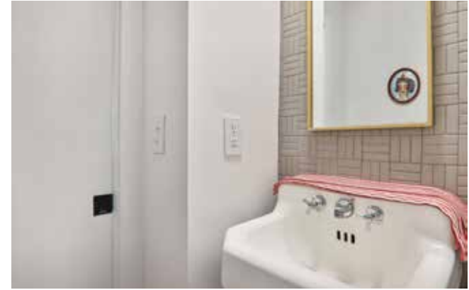
Half Bath with Repurposed Porcelain Sink