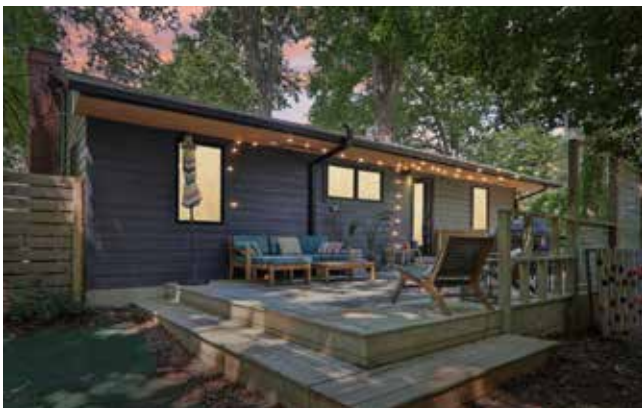
Sunset Vibes on the Back Deck