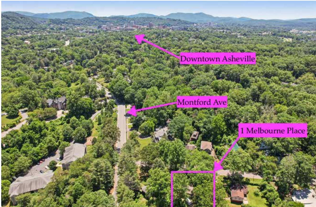
One Mile to the Bridge!