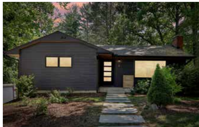
1 Melbourne Place at Sunset

1 MELBOURNE PLACE 1955 Stylishly Renovated Cottage in Montford Asheville, NC 28801