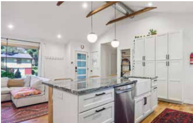
Clean and Stylish Design