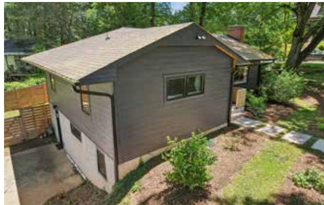
Plenty of Off-Street Parking

1 MELBOURNE PLACE 1955 Stylishly Renovated Cottage in Montford Asheville, NC 28801