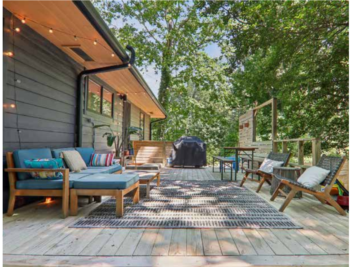
Relaxing and Private Outdoor Spaces

This house is soooooo cool! Vintage 1950's vibes mesh with contemporary chic in a Montford cottage destined to steal your heart. Stripped to the studs in 2020 and stylishly rebuilt for modern living, embrace easy living and entertaining inside and out, just over a mile from downtown Asheville. A vaulted ceiling and exposed beams grace the open living area, where a sleek, efficient kitchen is ready for your creative cuisines. Gather with friends at the large island, or spill out onto the privacy-fenced rear deck to enjoy the outdoors. Clever custom touches surprise you, blended with thoughtful and intentional design. A coat closet by the front door, a wall of cabinets for dishes and pantry items, downdraft venting to the exterior, natural wood-trimmed windows, recessed lights on dimmers in all bedrooms. Should you rent the downstairs or keep it for visiting family and friends? You decide. Two beds, a full bath, and a kitchenette await your decision. This is the one!