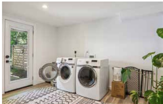
Lower-Level Exterior Entrance and Laundry