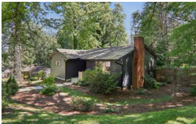
Large Corner Lot with Mature Landscaping