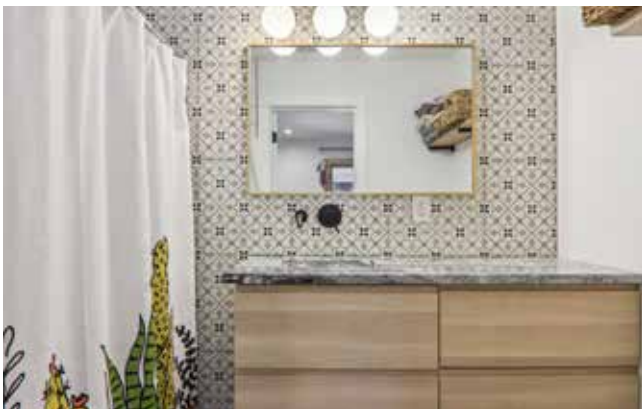
Ensuite Bathroom Retreat