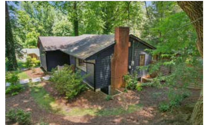
Gutters Recently Cleaned and Beds Freshly Mulched