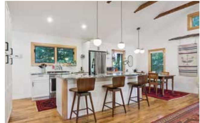
Great Sense of Volume