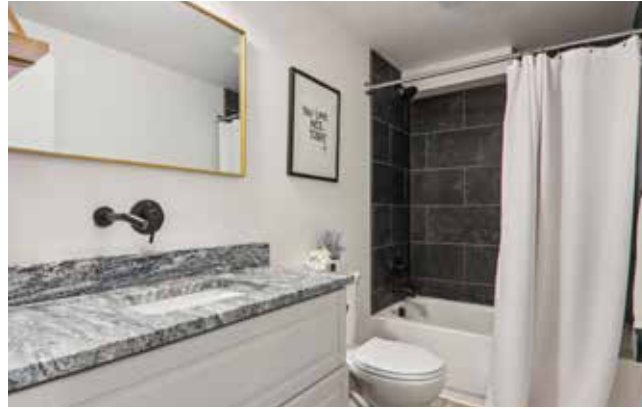
Lower-Level Full Bathroom with Tile and Chic Fixtures