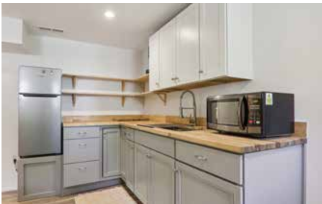
Kitchenette for Guests or Perhaps a Rental Tenant