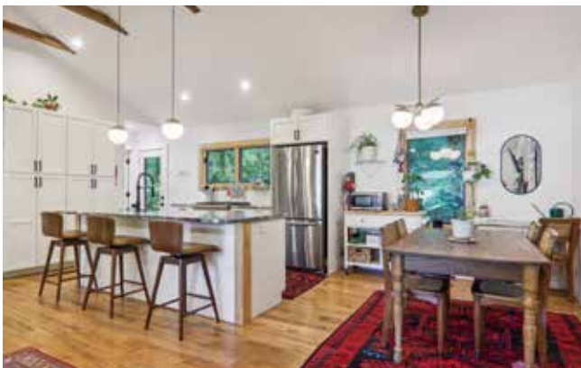
Light, Bright, and Open Entertaining