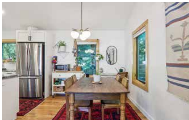
Space for Dining by the Kitchen