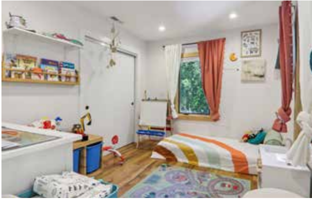
Second Main-Floor Bedroom