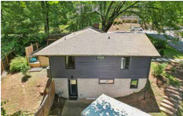
Great Angles and Hipped Roof