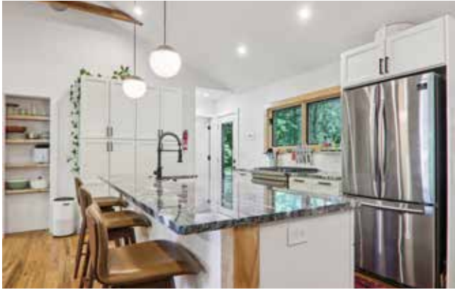
Dream Your Cuisine Here