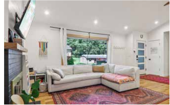
Coat Closet at Entry • Huge Windows for Natural Light