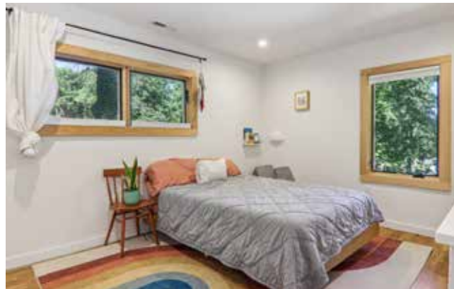
Primary Suite on Main Level with Corner Windows