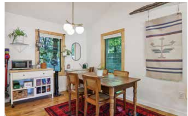
Wood Trim Accents