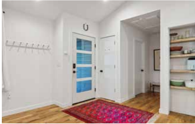
Front Entrance • Primary Suite, Half Bath off Short Hallway