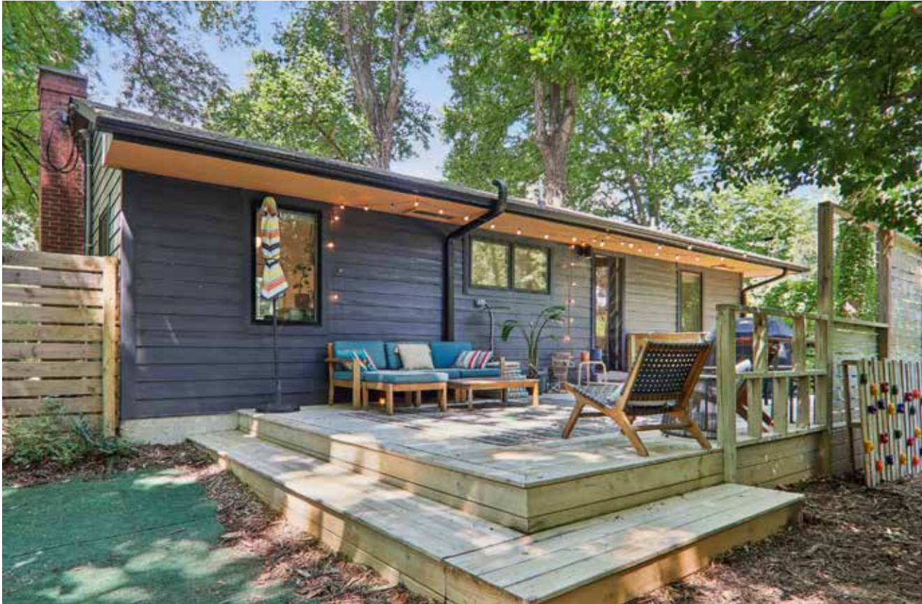
Not a Bad Place to Get Some Work Done. Or Not.