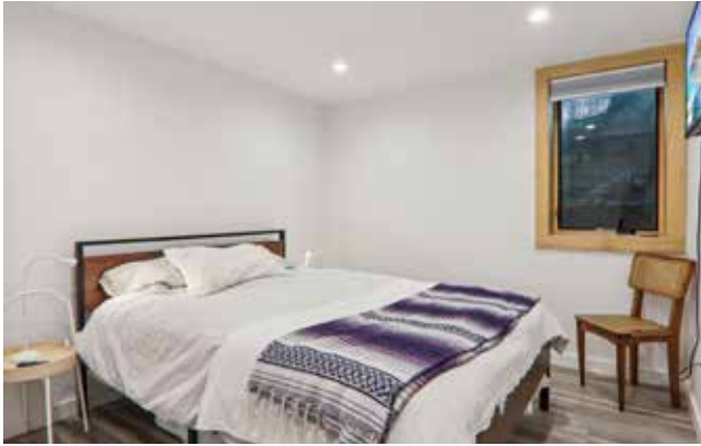
Second Lower-Level Bedroom • Vinyl Plank Flooring