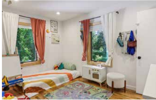
... But the Cute Mobile Kitchen Does Not Convey ;)