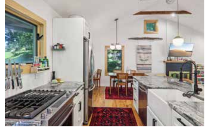
Smart and Sophisticated Layout