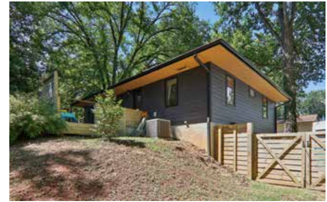
Fenced Portion of Backyard with Dual-Gate Access