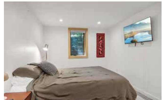
One of Two Lower Bedrooms, Each with Window Egress