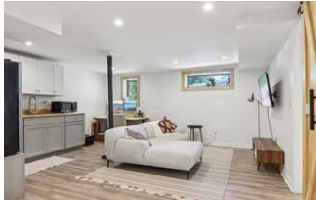
Lower-Level Den and Kitchenette