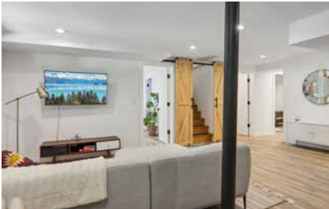
Custom Barn Doors Separate Upstairs from Down