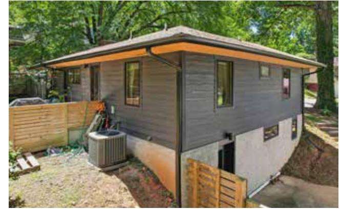
Outside, There Are Oversized, Shady Soffits