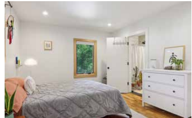
Subtle Touches Include Recessed Lights in the Bedrooms