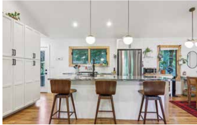
Huge Kitchen Island and Cabinet Wall Storage