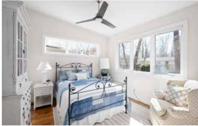
Third Upstairs Bedroom with Vaulted Ceiling