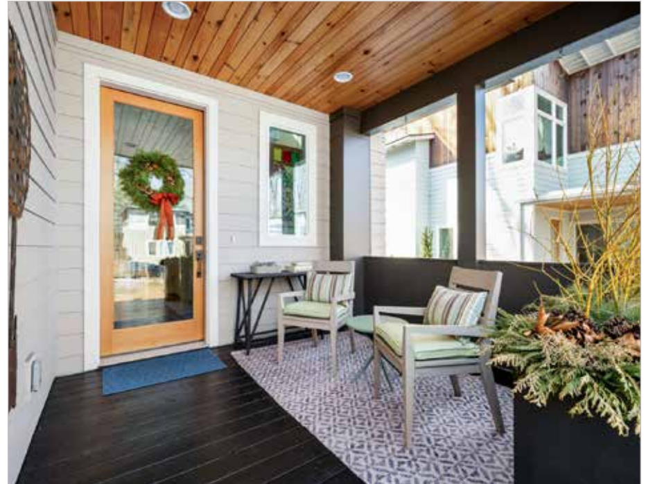
Covered Front Porch