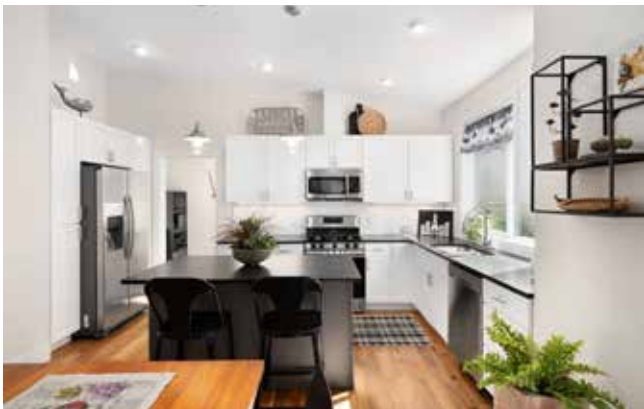
Lots of Cabinet and Counter Space