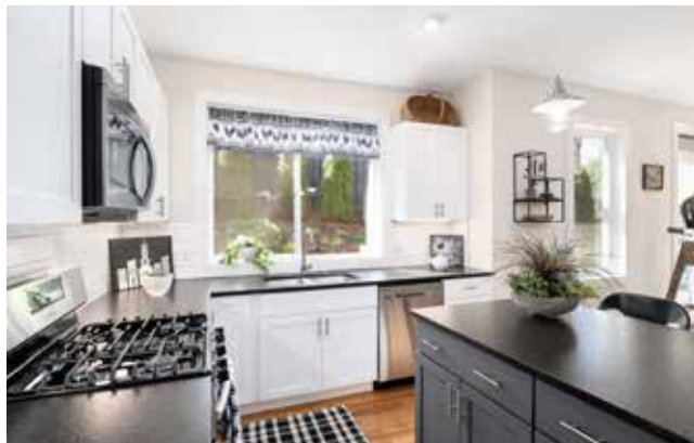
Leathered-Granite Countertops and Modern Subway Tile