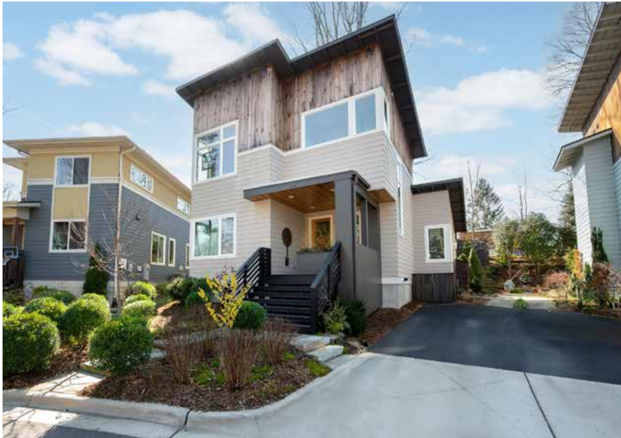
Durable Materials and Convenient Off-Street Parking

Highly customized, modern GreenBuilt and Energy Star home by JAG Construction in Craggy Park with world-class landscaping and hardscaping worthy of an arboretum! Ideally located in West Asheville's most popular green community, enjoy streamside trails connecting to the Falconhurst eight-acre nature preserve trails, a greenway to walkable West Asheville, organic gardens, and a private park. This gorgeous home, designed by award-winning Wilson Architects, features vaulted ceilings downstairs and upstairs, a gourmet kitchen, spacious living area with a floor-to-ceiling gas fireplace surround, gorgeous hardwood floors, and oversized windows for an abundance of natural light. The main-level primary suite features a walk-in closet and modern bathroom. Two additional bedrooms and a well-appointed bathroom are located upstairs. Relax and enjoy the secret garden and outdoor living from your sunny back patio or say hello to your neighbors from your covered front porch.