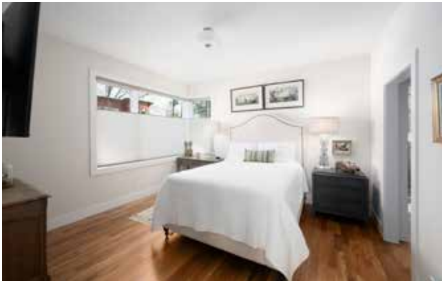
Primary Suite with Gleaming Hardwood Floors