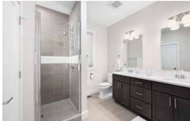
Bath with Quartz Dual Vanity and Tiled, Walk-in Shower