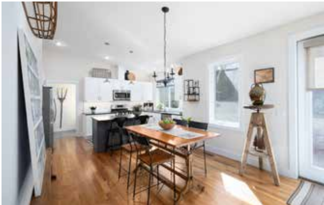
Dining Area off of Kitchen