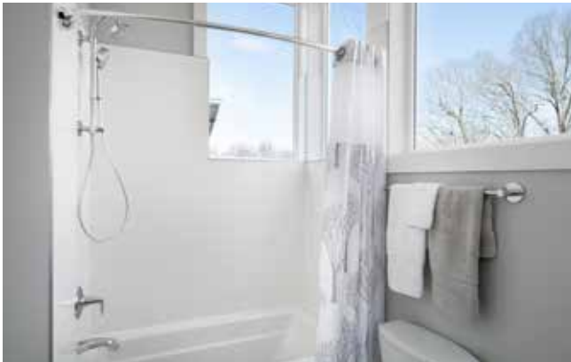
Tiled Shower + Tub and Oversized Windows for Daylight