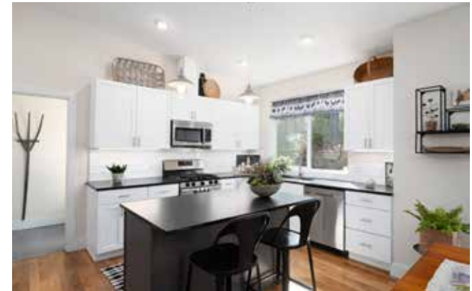
Gourmet Kitchen • Large Island with Breakfast Bar