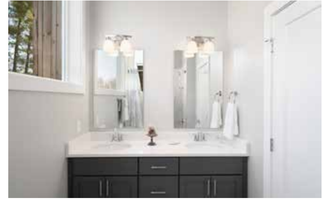
Well-Appointed Modern Upstairs Bathroom