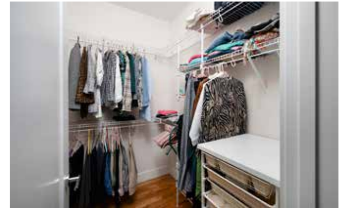
Primary Suite Walk-in Closet