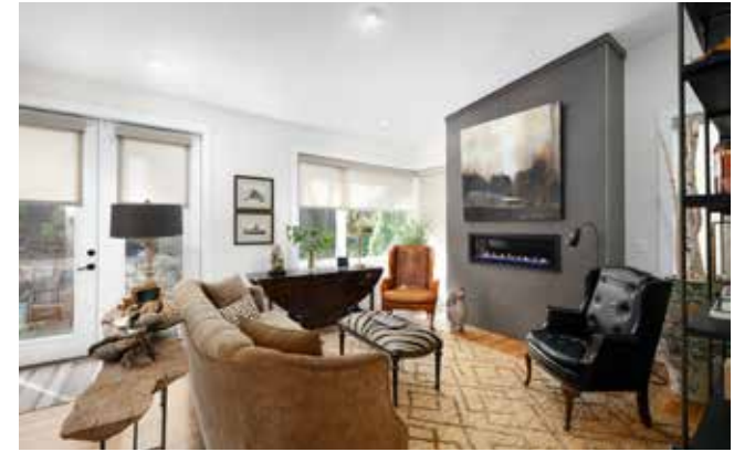
Vaulted Ceiling and Modern Gas Fireplace