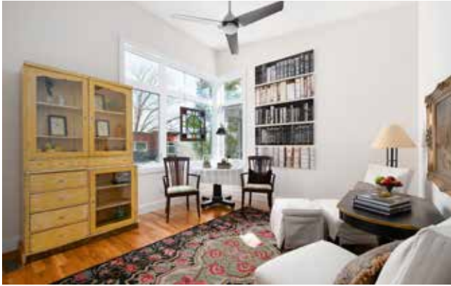
Upstairs Room with Vaulted Ceiling, Great Natural Light