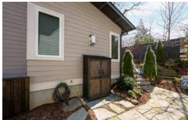
Stained Wood Storage Unit