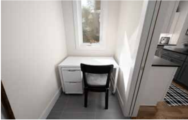
Walk-in Pantry Currently Used As a Home Office