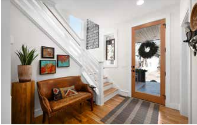
Inviting Entry with Eight-Foot, Full-Light Front Door