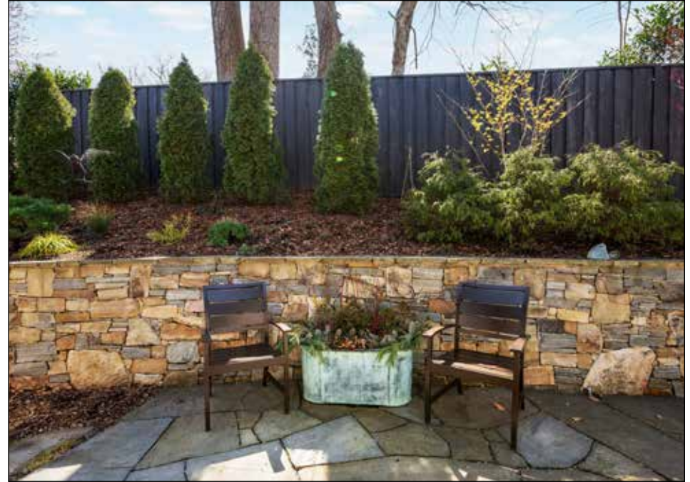
Beautiful Stacked Stone Wall and Partial Privacy Fence Frames Lush Landscaping