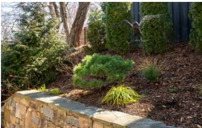
Mature Landscaping (Yard Sculpture Does Not Convey)