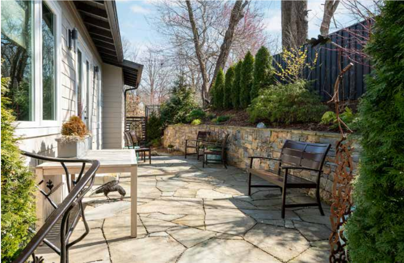
Sunny Back Patio with Secret Garden Vibe