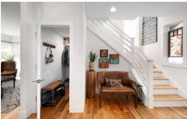
Coat Storage in the Under-Stair Closet