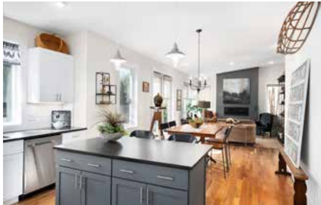
Open Plan with Space for Entertaining