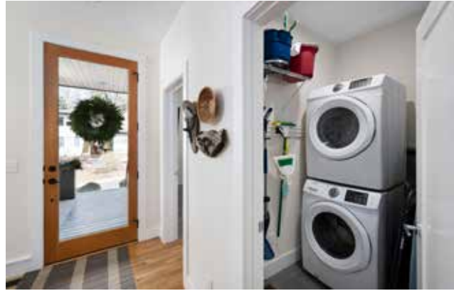
Laundry Room on Main Level near Entry