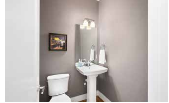
Powder Room on Main Level