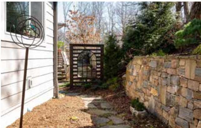
Laid-Stone Path and Landscape Mirror