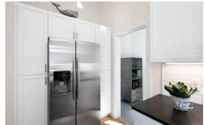
Stainless Steel Appliances and Generous Cabinet Space