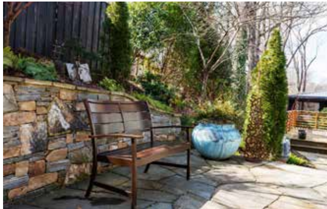
A Peaceful Place to Rejuvenate