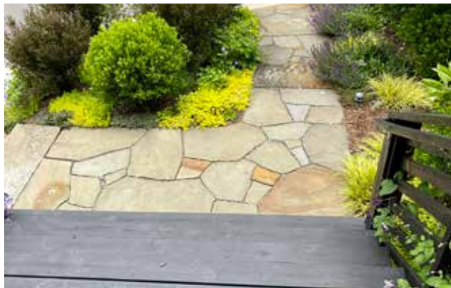
Hand-Cut Stone Walkways