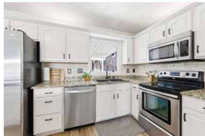
14 LYNWOOD CIRCLE Contemporary Split-Level with a Large Den Asheville, NC 28806