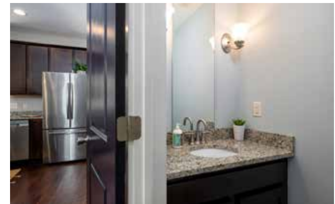
Half Bathroom on Main Level