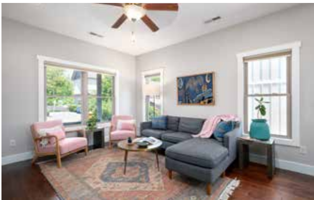
Great Corner Windows