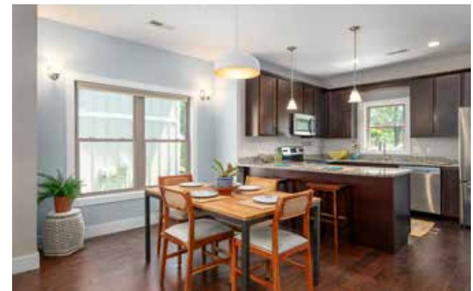
Dining Is Conversationally Convenient to Kitchen