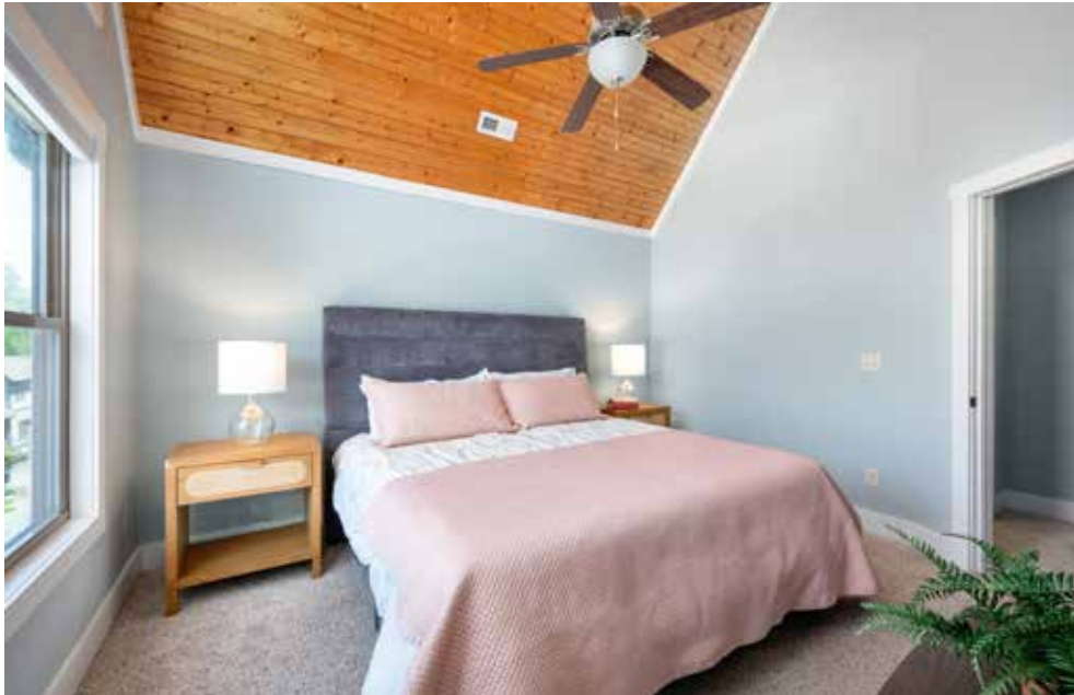
Incredible Natural Light in the Primary Suite