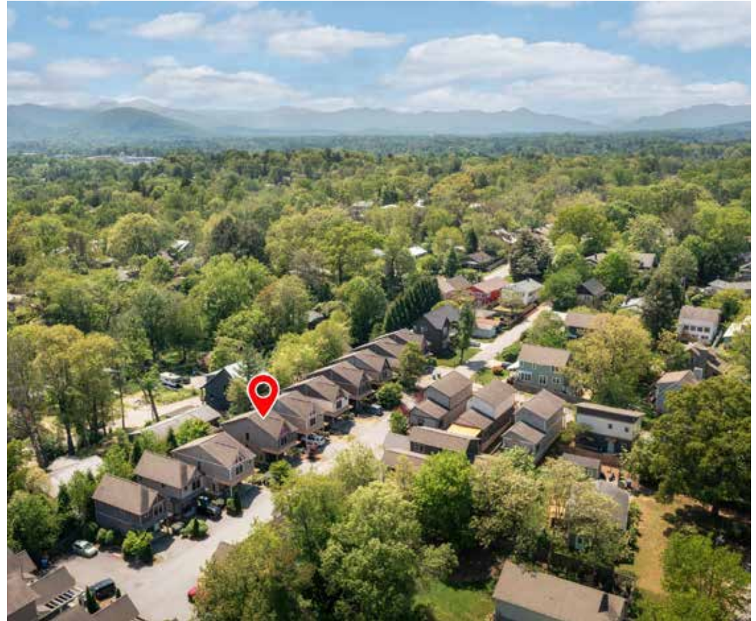
Awesome Location in Stunning West Asheville

Tucked into a quiet cul-de-sac just steps from the energy of Haywood Road, this stylish cottage combines Arts and Crafts accents with the ease of everyday modern comforts—without the burden of HOA dues. Inside, sunlight pours through the open-concept main level, where nine-foot ceilings, warm wood floors, and clean, timeless finishes create a bright and welcoming feel. The kitchen features granite countertops, stainless appliances, and a central peninsula—ideal for casual cooking and conversation. Upstairs, the primary suite offers a peaceful retreat with its tongue-and-groove vaulted ceiling, walk-in closet, and private tiled bath. Two additional bedrooms provide flexibility for guests, remote work, or hobbies. Whether you're sipping coffee on the front porch or enjoying dinner on the back deck, this home blends character, convenience, and charm—no HOA dues, no hassle, just the right balance of style and connection in one of West Asheville's most vibrant neighborhoods.