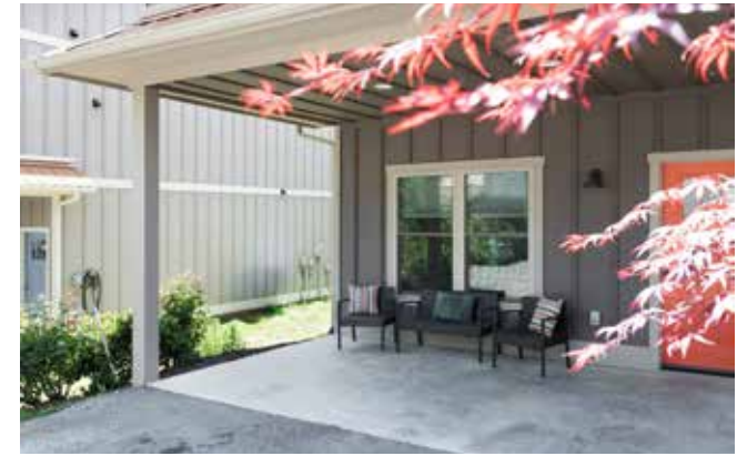
Beyond the Japanese Maple Is a Shady Front Patio