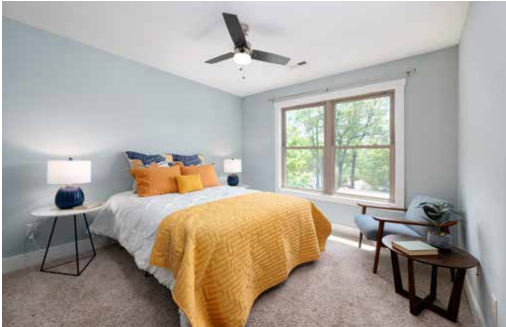
One of Two Guest Bedrooms Upstairs