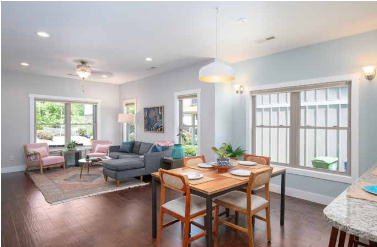
Open-Concept Living Downstairs; All Bedrooms and Laundry Upstairs