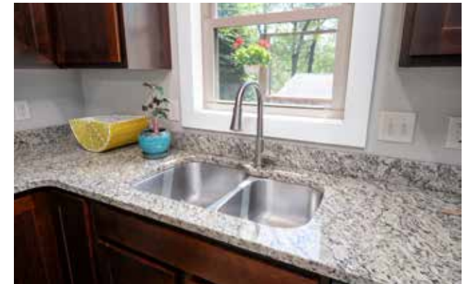
The Proverbial Kitchen Sink Window View