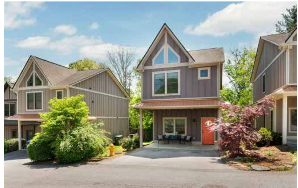
Ideal West Asheville Location • Just a Half-Mile Walk to Sunny Point