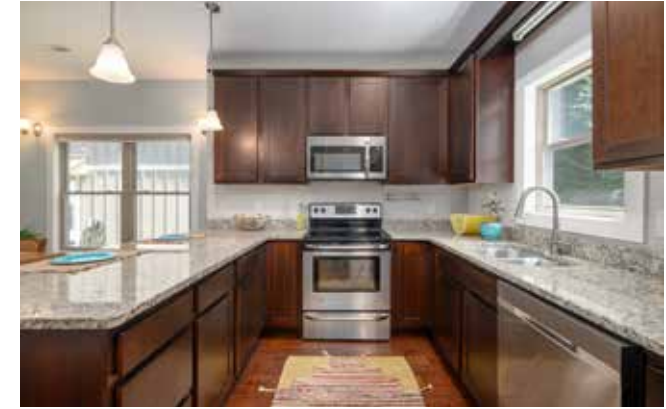
Stylish and Functional Kitchen with Abundant Storage