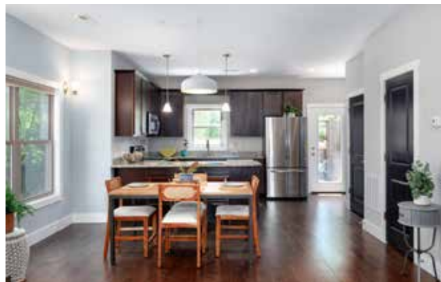
Slab Foundation for Easy Living • Closets, Attic for Storage