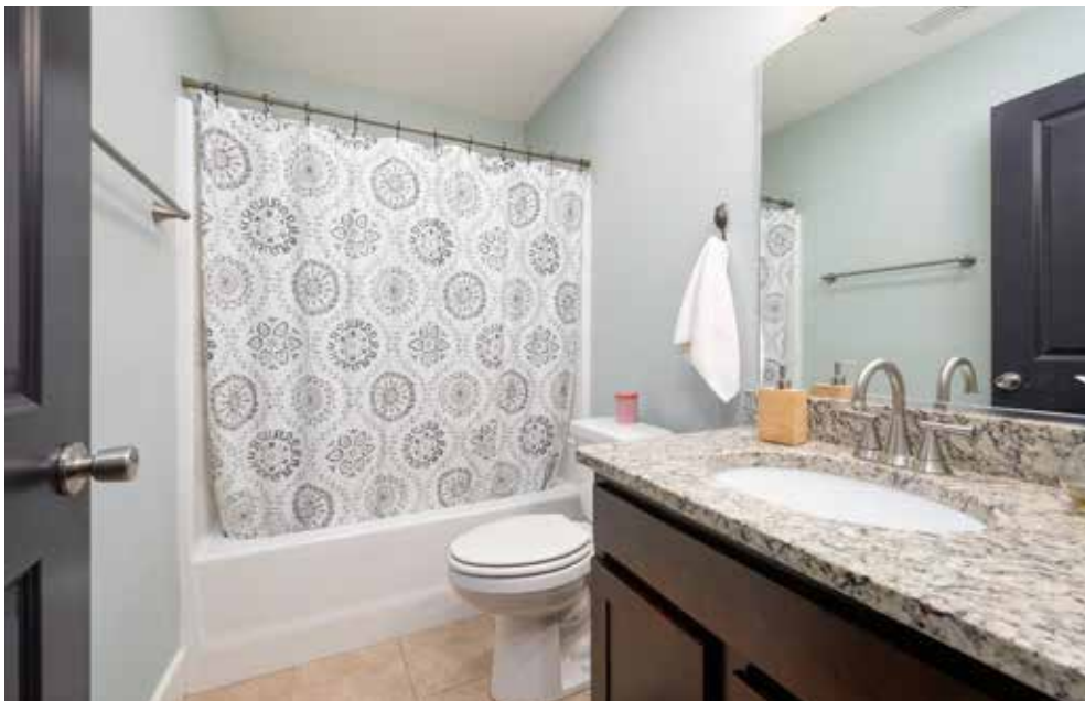
Shared Full Bathroom Upstairs