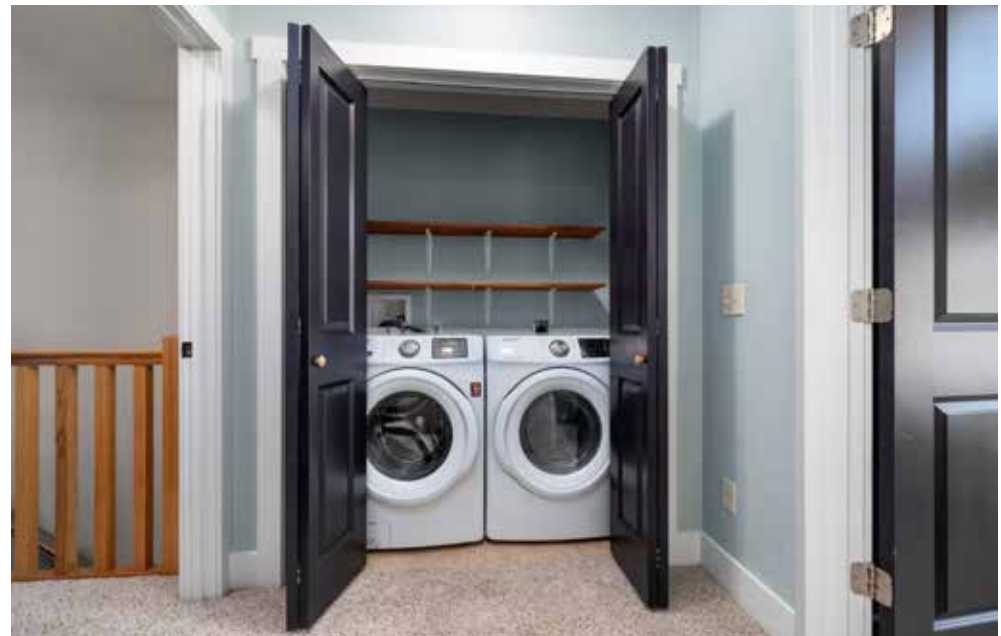
Convenient Upstairs Laundry • Appliances Included