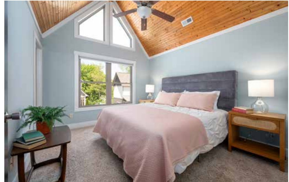
Spacious Primary Suite with Amazing Tongue-and-Groove Vaulted Ceiling