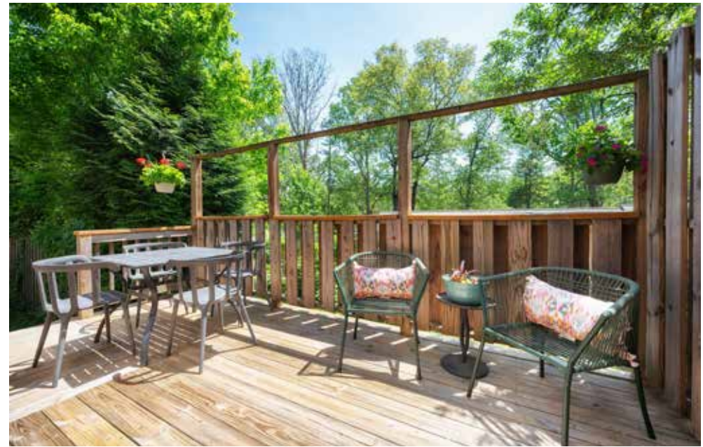
Cute, Private Back Deck