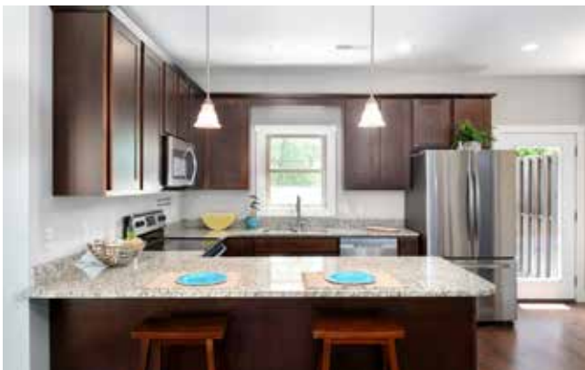
Granite and Stainless Finishes