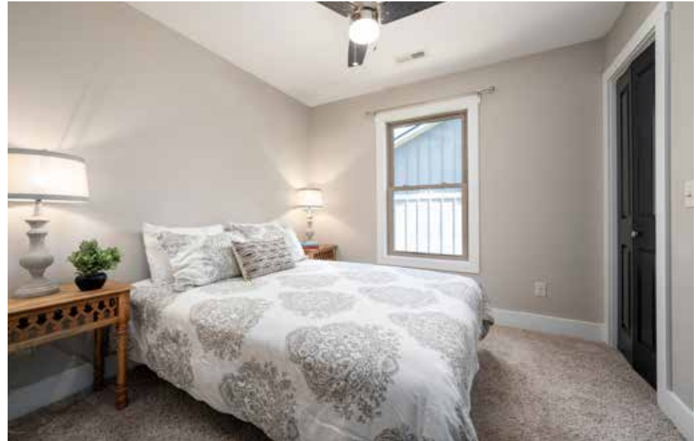
Second Upstairs Guest Bedroom