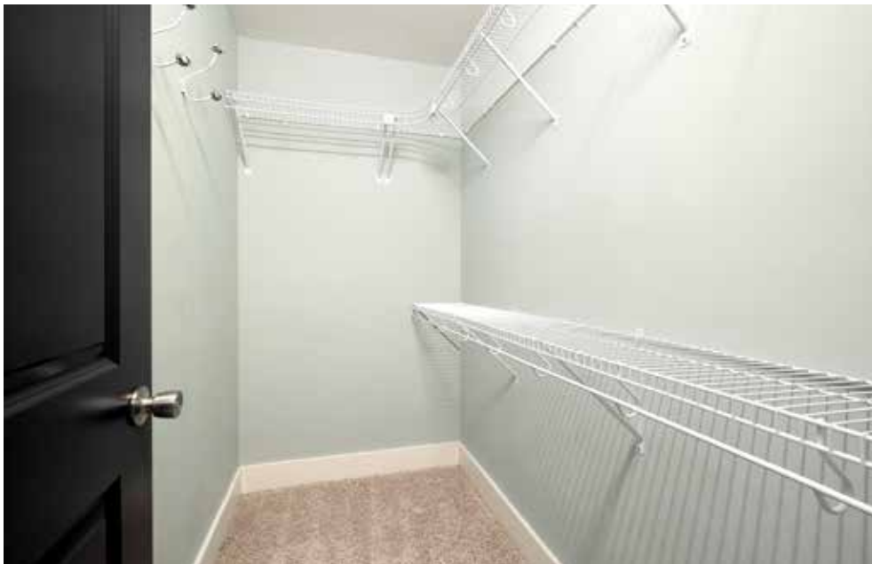
Large Walk-in Primary Closet