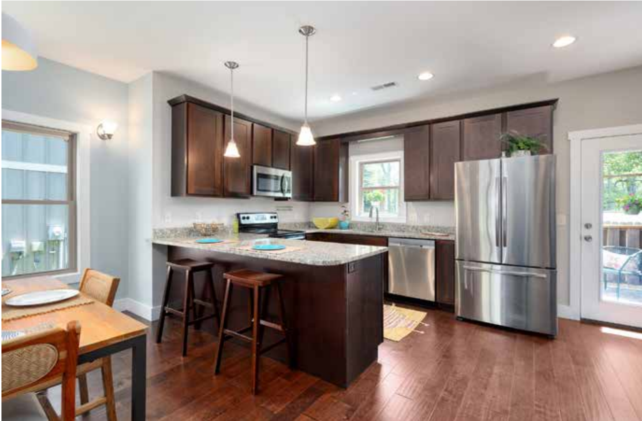
Open Kitchen for Entertaining