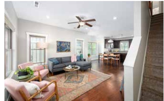
Bright and Airy Layout