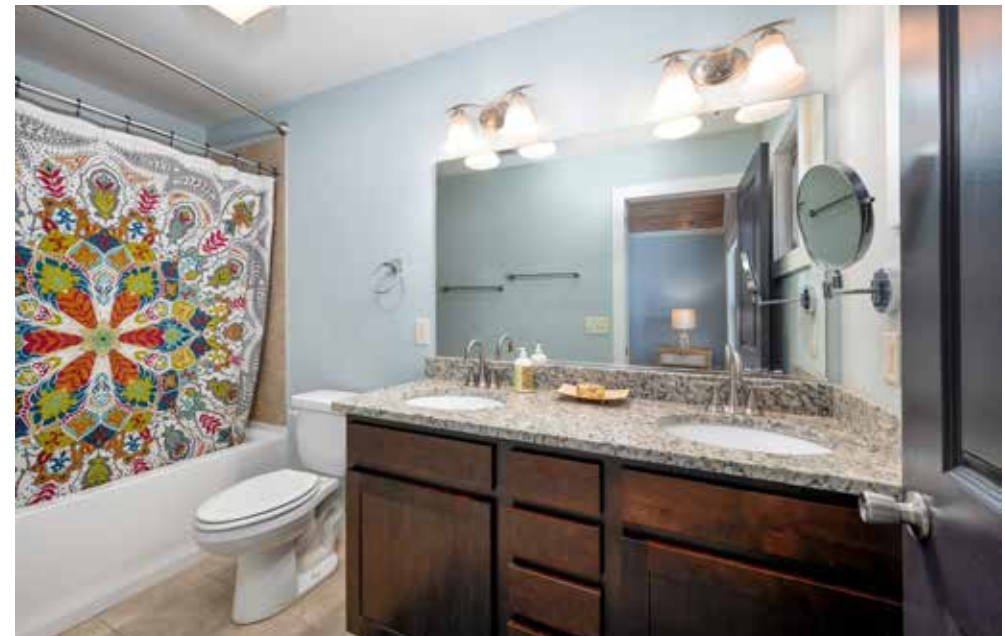
Ensuite Bathroom with Dual-Sink Vanity