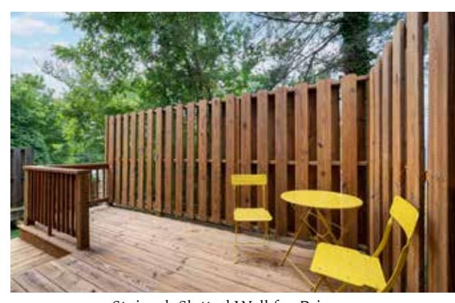
Stained, Slatted Wall for Privacy