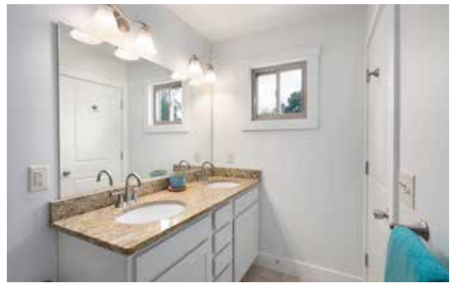
Granite-Topped Double Vanity in Ensuite Full Bathroom