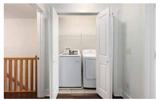
Laundry Closet on Second Level