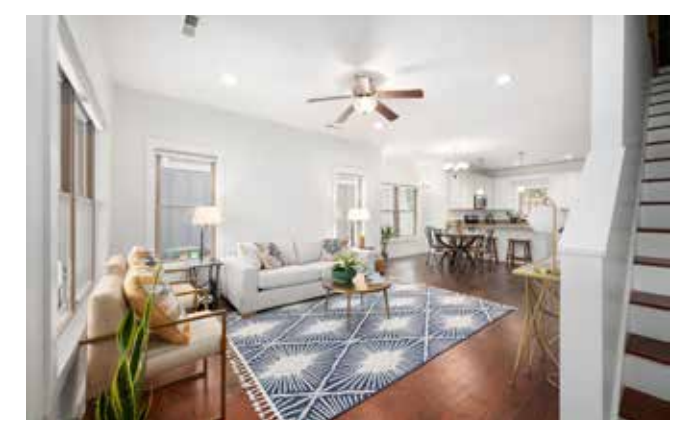
Spacious Living Room