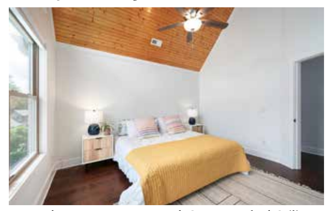
... and Features a Tongue-and-Groove Vaulted Ceiling