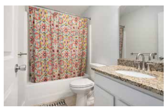
Second Full Bathroom Upstairs