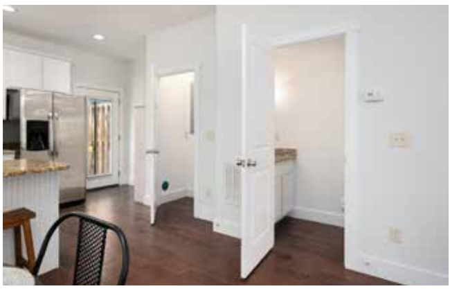
Powder Room and Extra Storage Closet