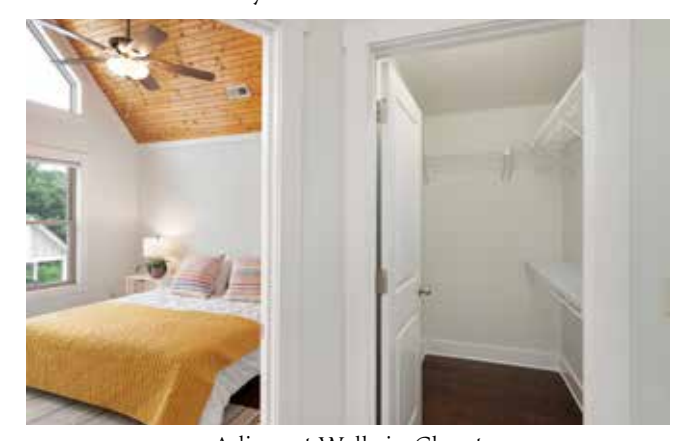
Adjacent Walk-in Closet