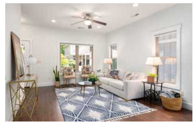
Space for Entertaining