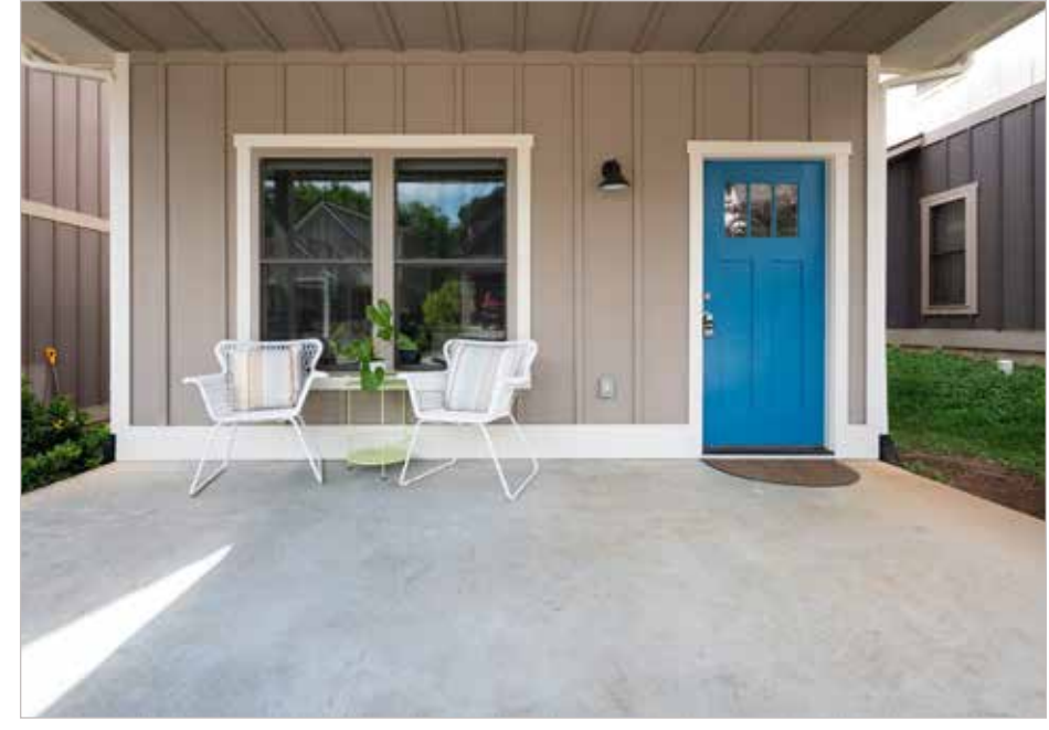
Covered Front Patio for Relaxing