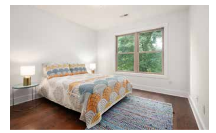
Bright Second Bedroom