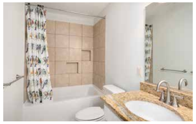
Large-Tiled Shower + Tub