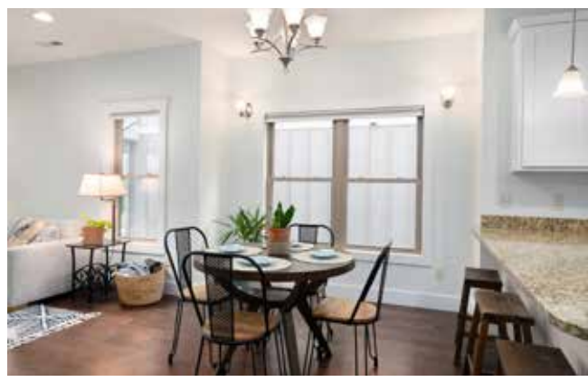
Dining Area off of Kitchen