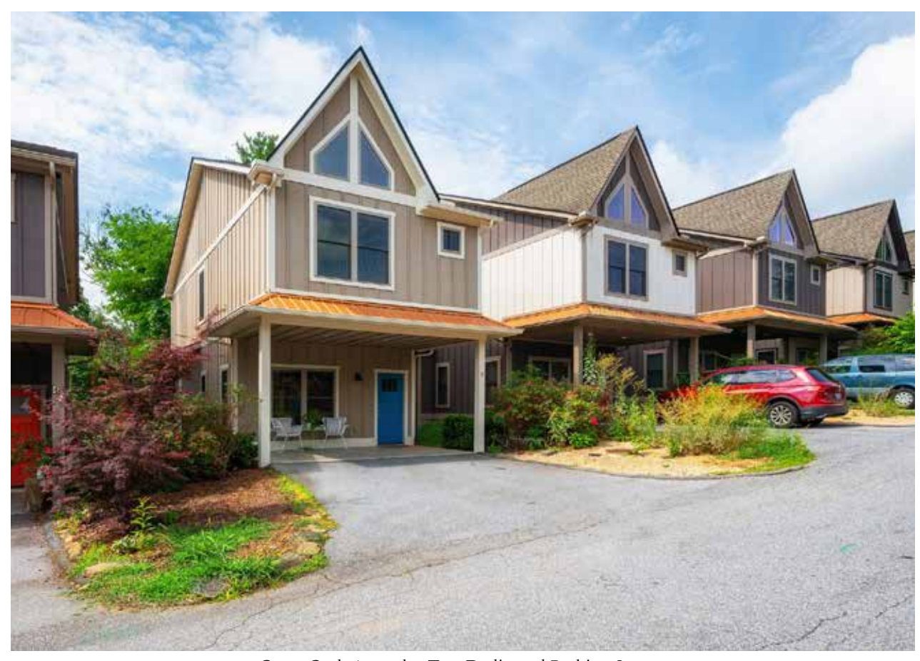
Great Curb Appeal + Two Dedicated Parking Spaces

Meticulously maintained home in West Asheville's desirable West End Cottages community. Excellent location in the heart of West Asheville — walkable to Haywood Road's thriving business district, including numerous popular cafés, restaurants, breweries and more. Thoughtful construction and design, quality materials, and attention to detail create a lasting new-home feel. Low-maintenance yard and durable materials for easy upkeep. Relax on the covered front patio or sunny back deck with stained-wood privacy wall. Open main-level floor plan features a spacious living room, wellappointed kitchen with wraparound breakfast bar, and bright dining area. Upstairs hallway connects three bedrooms, two full bathrooms, and a laundry closet. Primary bedroom features a stunning tongue-and-groove vaulted ceiling, and ensuite full bathroom. Third bedroom on the second level also makes a great home office. Plenty of parking with two dedicated spaces + extra on-street parking.