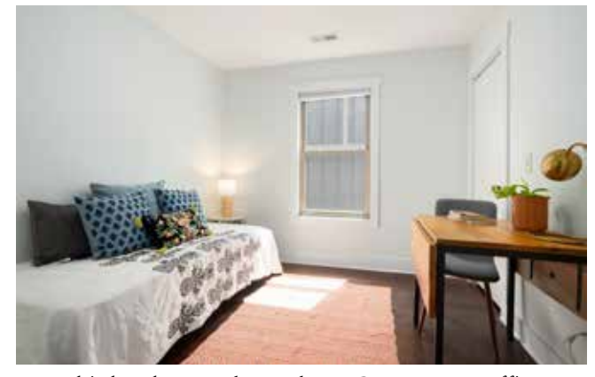
Third Bedroom Also Makes a Great Home Office