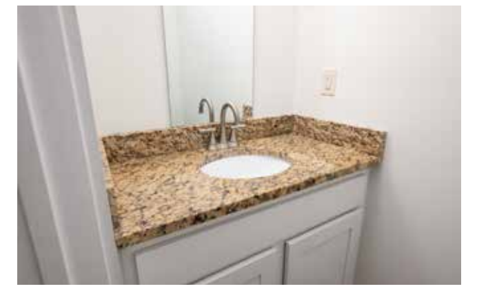
Granite-Topped Vanity in Main-Level Powder Room