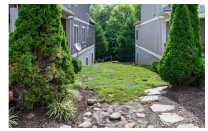
Green Spaces throughout the Neighborhood