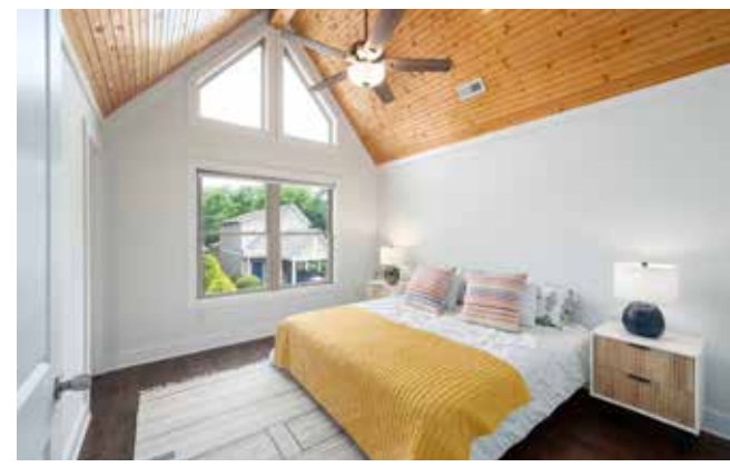
Primary Suite Gets Great Light ...