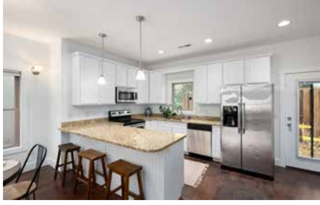
Sparkling Kitchen • Wraparound Counter, Breakfast Bar