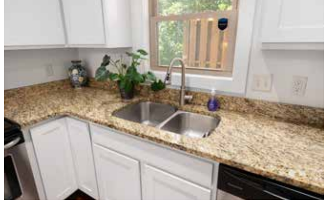
Window over Sink • Corner Lazy Susan Cabinet