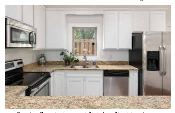
Granite Countertops and Stainless Steel Appliances