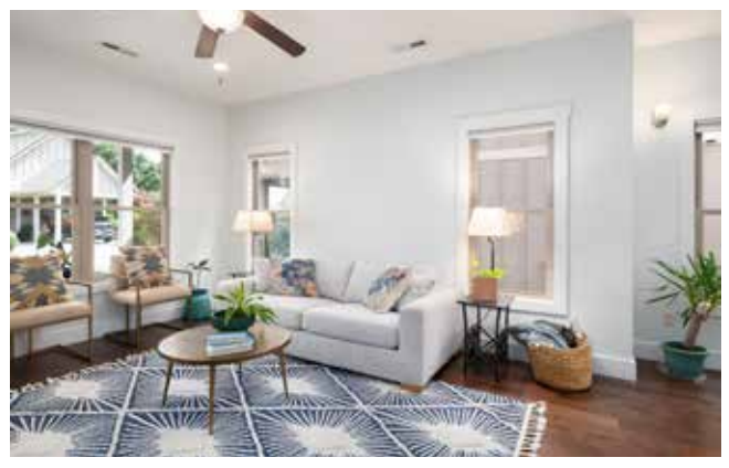
Oversized Windows for Great Natural Light