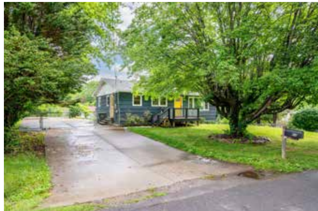
65 FARLEY STREET Character, Comfort, and Thoughtful Updates Waynesville, NC 28786