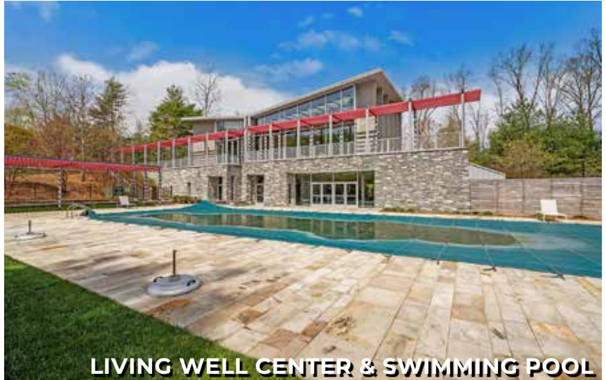
LIVING WELL CENTER & SWIMMING POOL