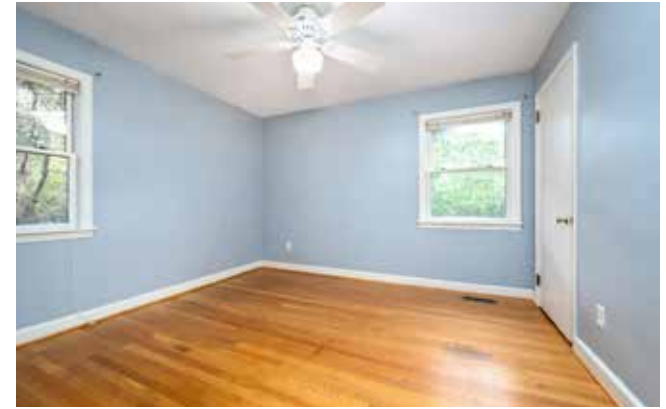
Second of Three Bedrooms — All on Main Level