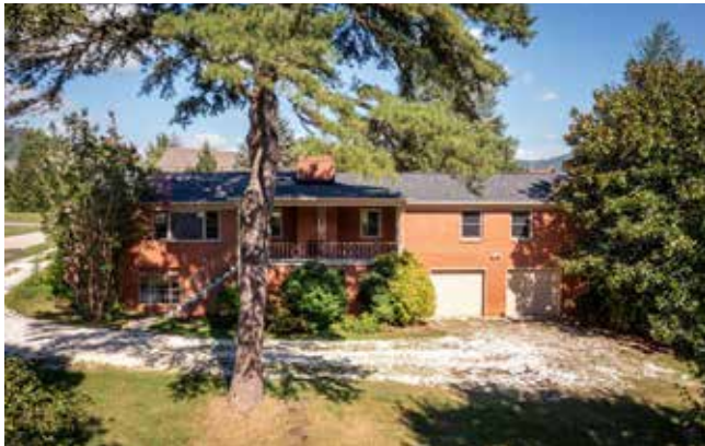
Back Porch and Two-Car Garage