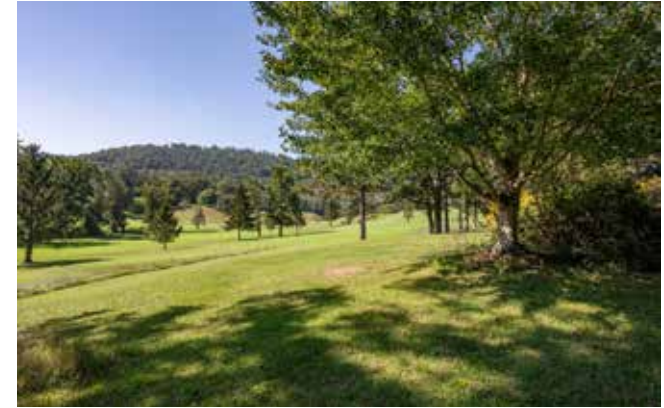
Across from the Gated Thoms Estate