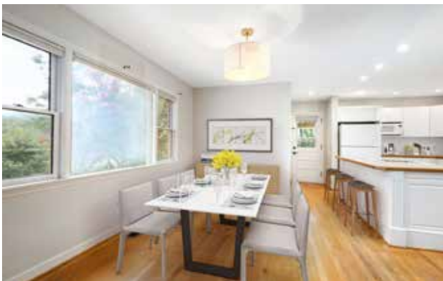
Multiple Dining Spaces in Kitchen (Virtually Staged)