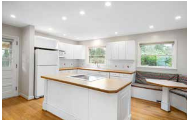
Oversized Island with Oven-Range