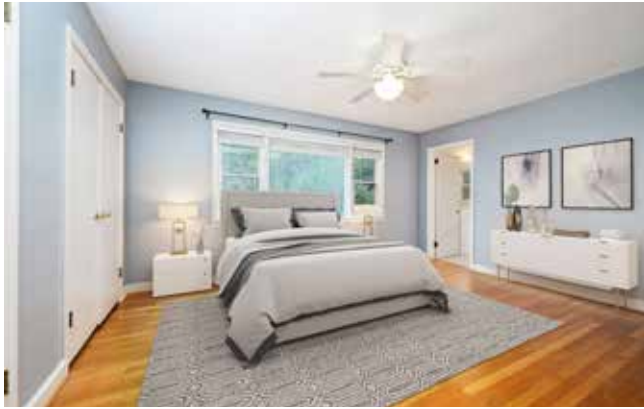
Primary Bedroom (Virtually Staged)