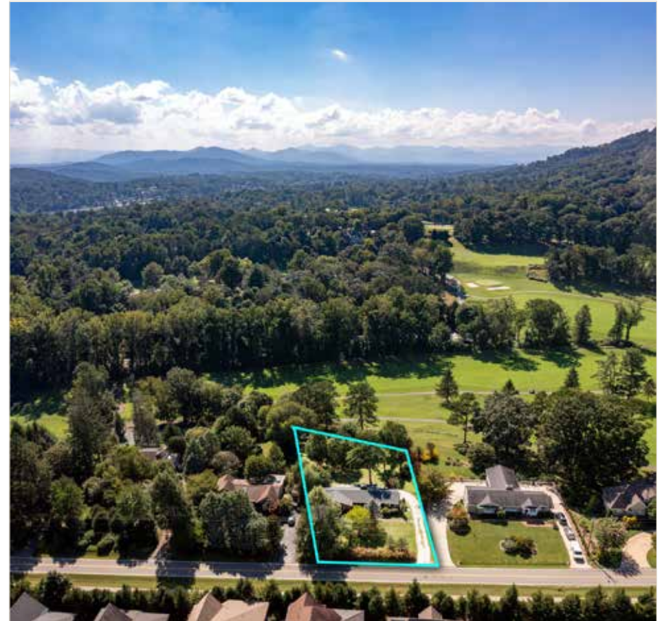
Views of the Stunning Golf Course and Rolling Hills