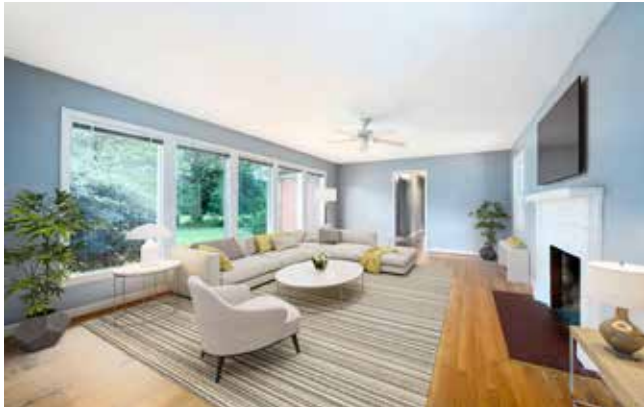
Huge Picture Windows in Living Room (Virtually Staged)