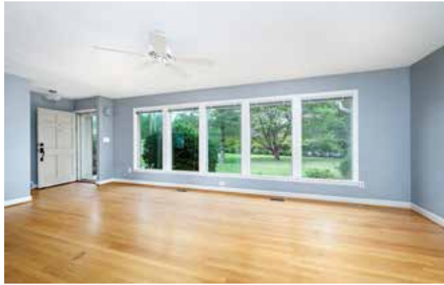
Beautiful Hardwood Floors