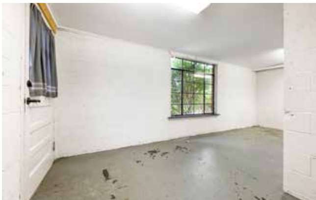
Basement Has Exterior and Interior Access