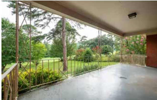
Covered Back Porch Overlooks Gorgeous Backyard