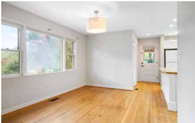
Abundance of Windows Throughout Home