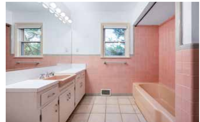
Full Bathroom — Enjoy the Charm or Renovate