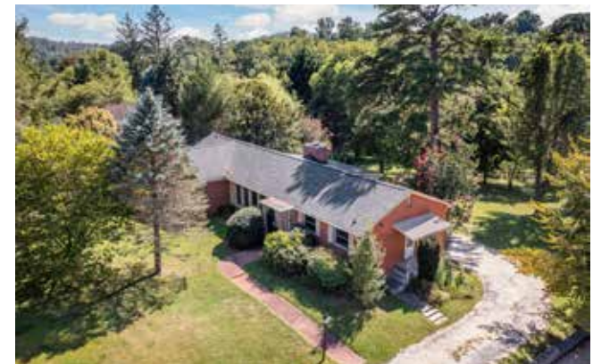
Ready for Renovation or Just Move In