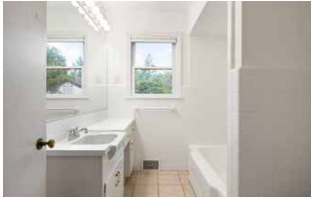
Primary Ensuite Bath