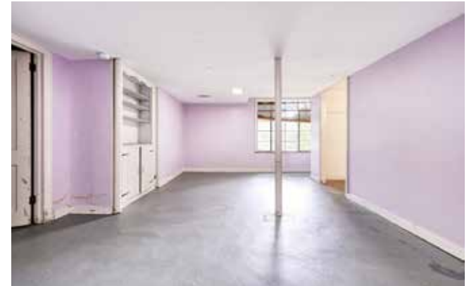
Partially Finished and Heated Basement Space