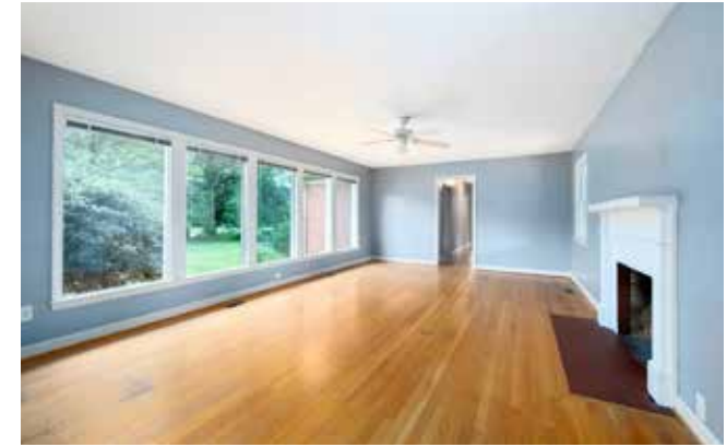
Fireplace Ready for Gas Logs Includes Lovely Mantel