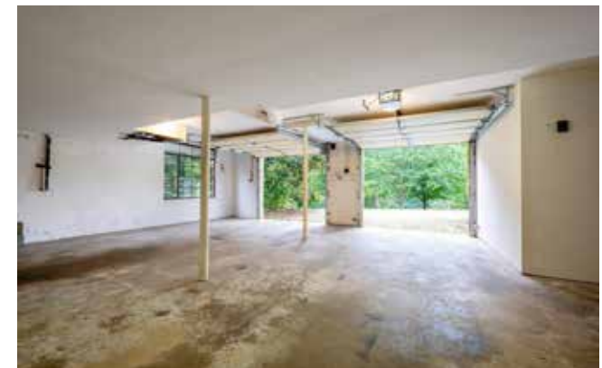
Double Car Garage in Basement