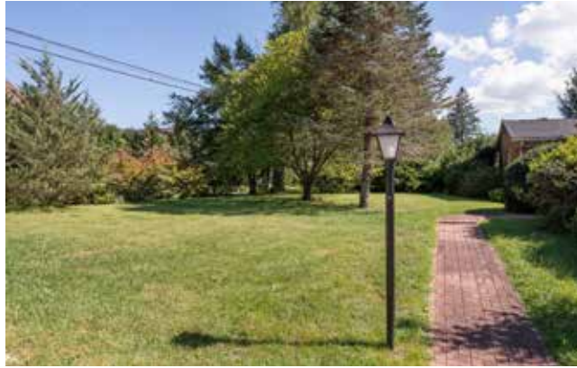
Home Sits One Mile from Merrimon Avenue Amenities