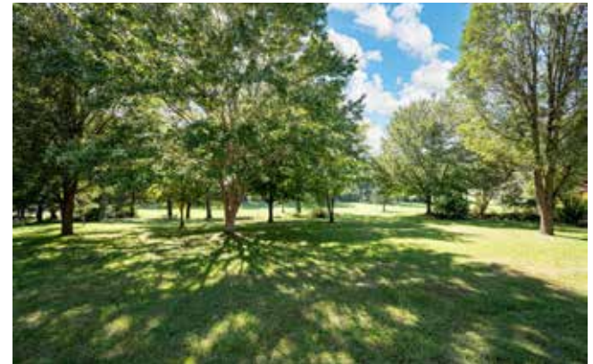
Massive Yard Provides Expansion Possibilities