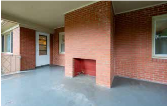
Back Porch with Fireplace for Cozy Evenings