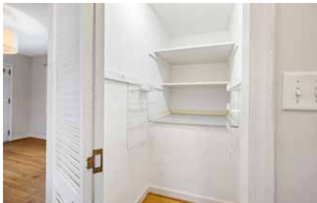
Spacious Walk-In Pantry