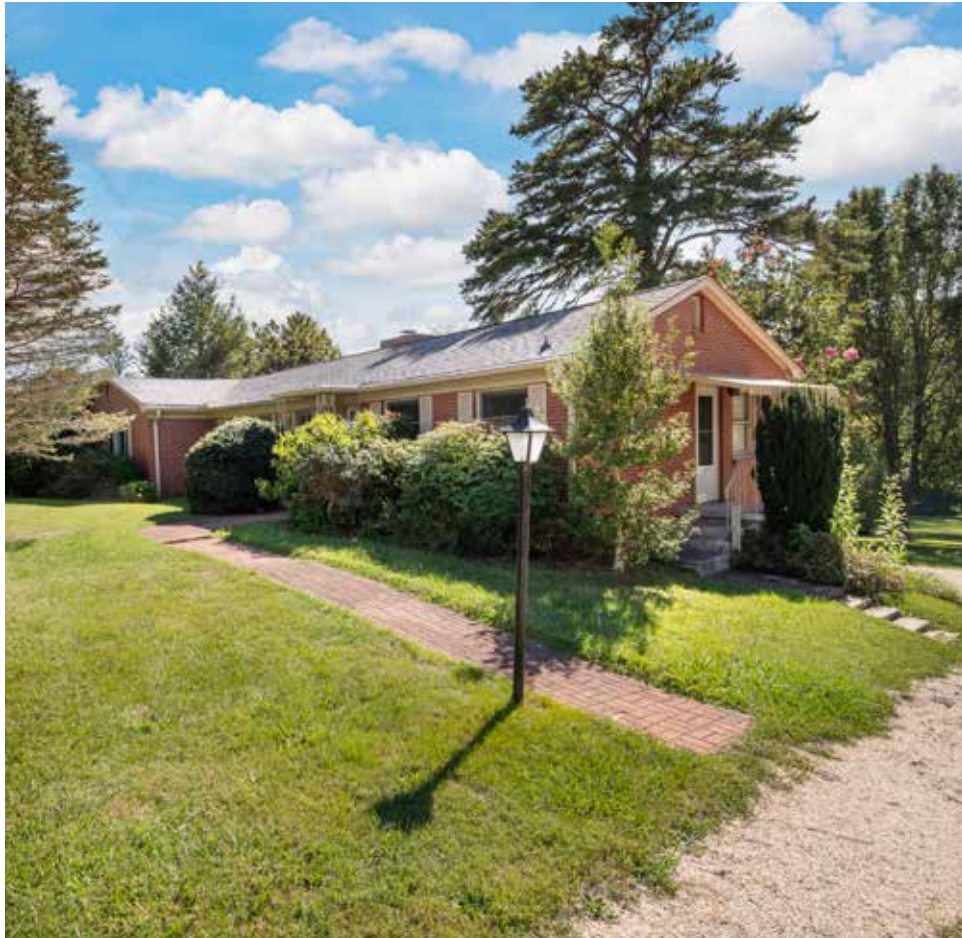
Beautiful Home, Bordering the Golf Course and Close to Amenities