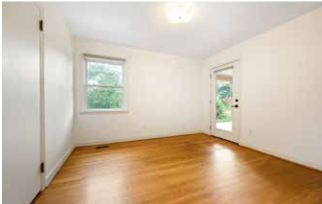
Third Bedroom has Access to Back Porch