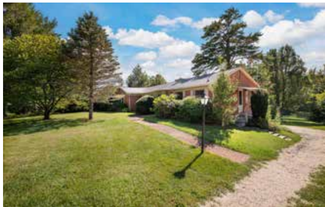
Plenty of Parking in Garage and Driveway