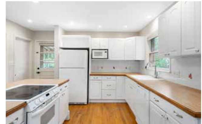
Kitchen Window Looks Out Into Green Front Yard