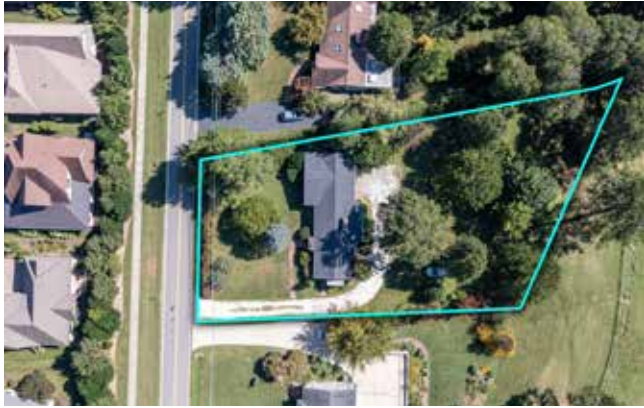
0.62 Acre Property in North Asheville