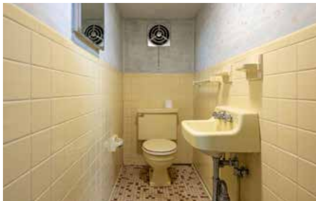
Vintage Yellow Half Bath in Basement