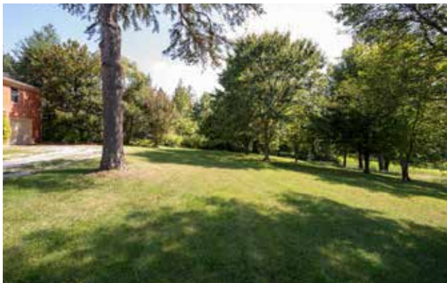
Numerous Trees Provide Shade and Privacy