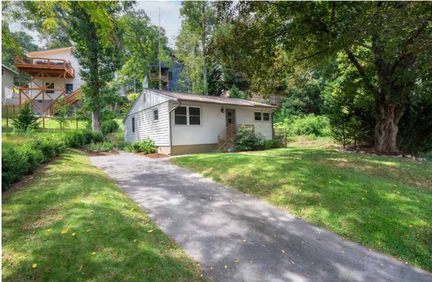
Abundant Parking — a West Asheville Rarity!