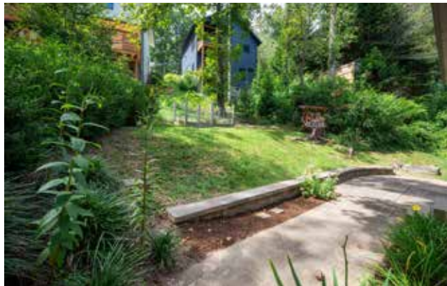
Small but Fabulous!