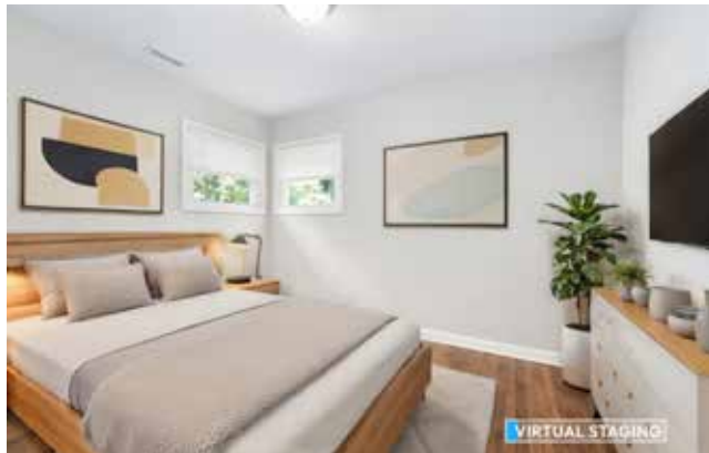
Virtually Staged Second Bedroom