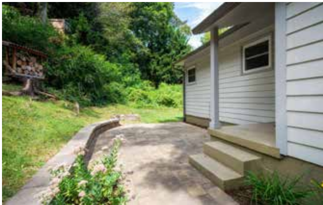
Places for Small Plantings Flank the Area near Steps