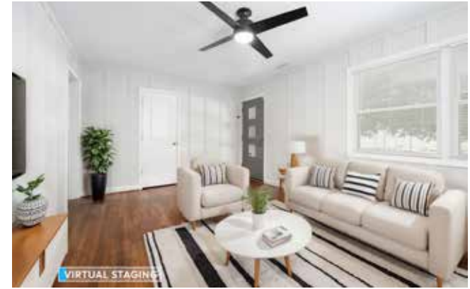
Virtually Staged Living Room