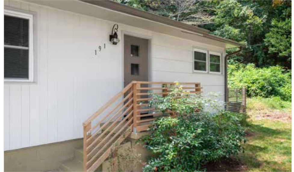
Clean Lines at Front Entry