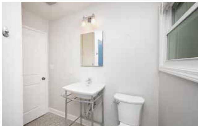
Bathroom Features Cool, Retro-Style Fixtures