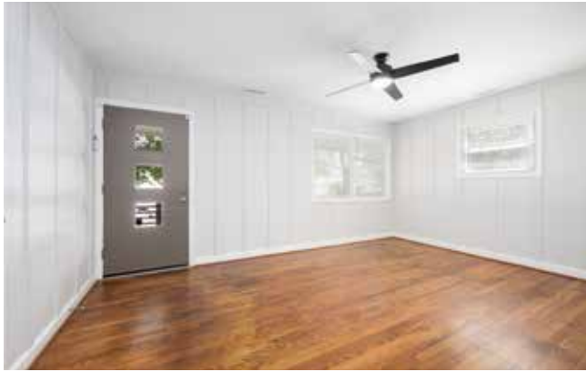
Light and Bright Living Room