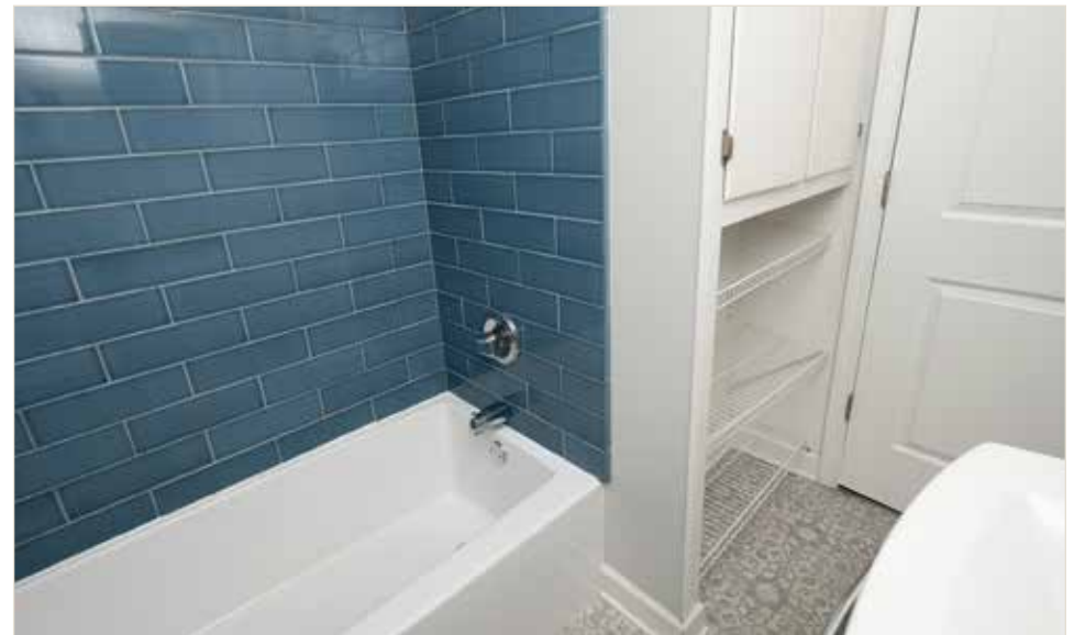
Stunning Blue Tile in the Bathroom