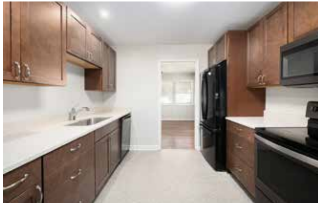
Great Galley-Style Kitchen