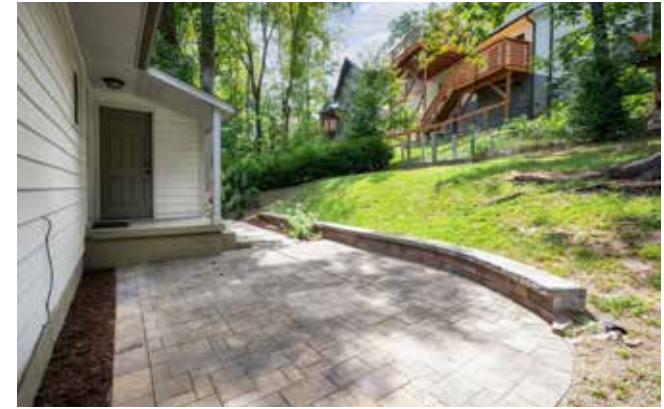
Great Paver Patio