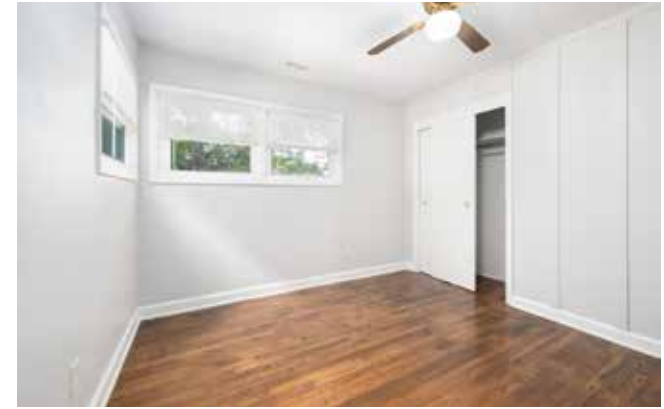
Good Bedroom Closet Space