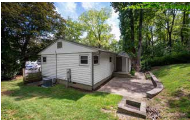
Back Yard Fire Pit Is Ready for Good Times