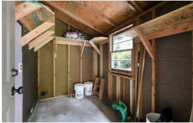
Storage Room off the Back Stoop