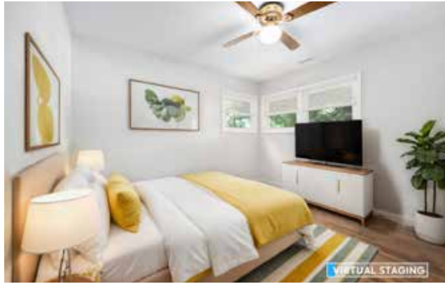
Virtually Staged First Bedroom