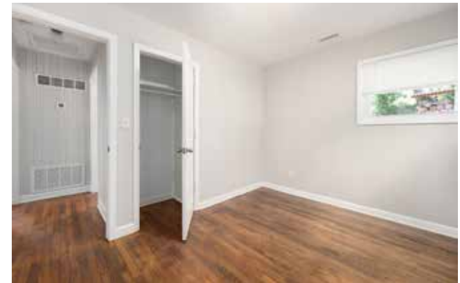
Second Bedroom Closet