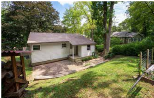
Covered Wood Storage for Fire Pit