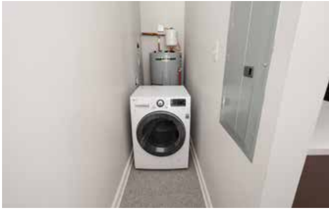
Washer/Dryer Combo Conveys