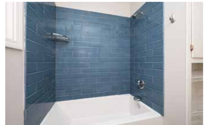
Fantastic Tiled Shower with Corner Shelf