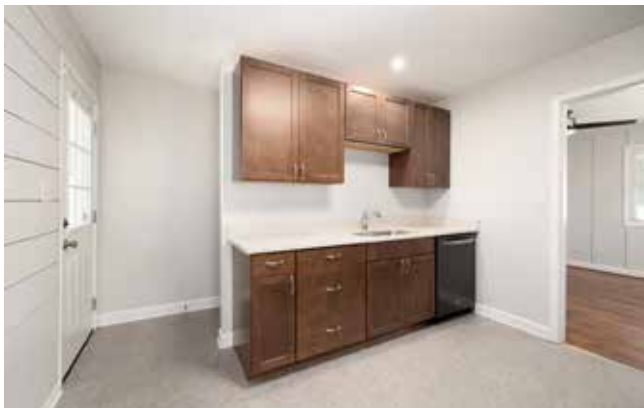
Plenty of Cabinets