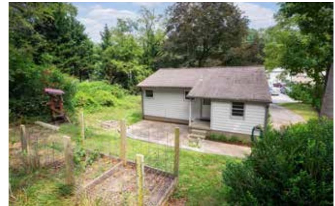
Back Yard and Raised Bed