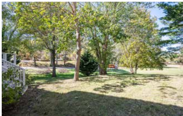
Property Backs to Greenspace