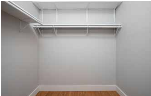
Primary Bedroom Closet