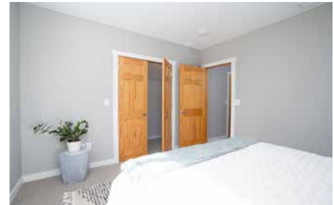
Second Bedroom Closet