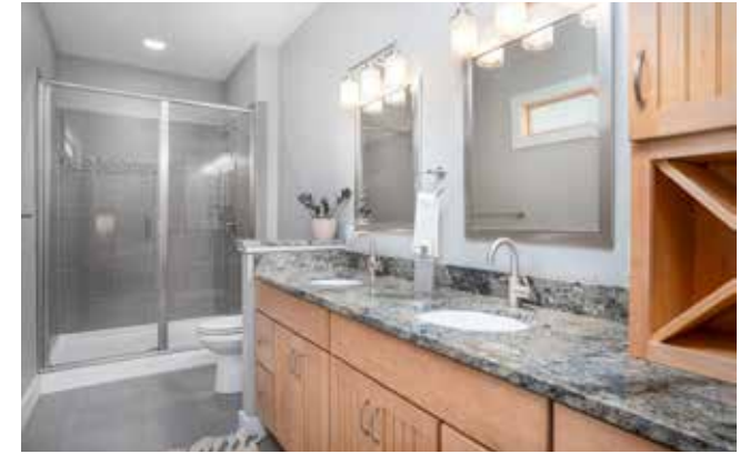
Primary Bath with Dual Sinks