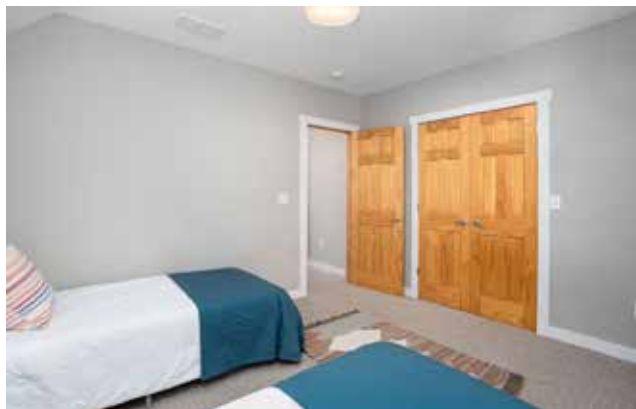
Third Bedroom Closet