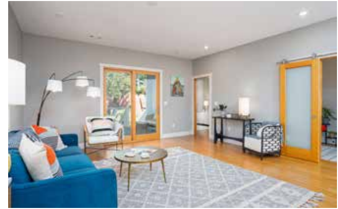
Cute and Modern