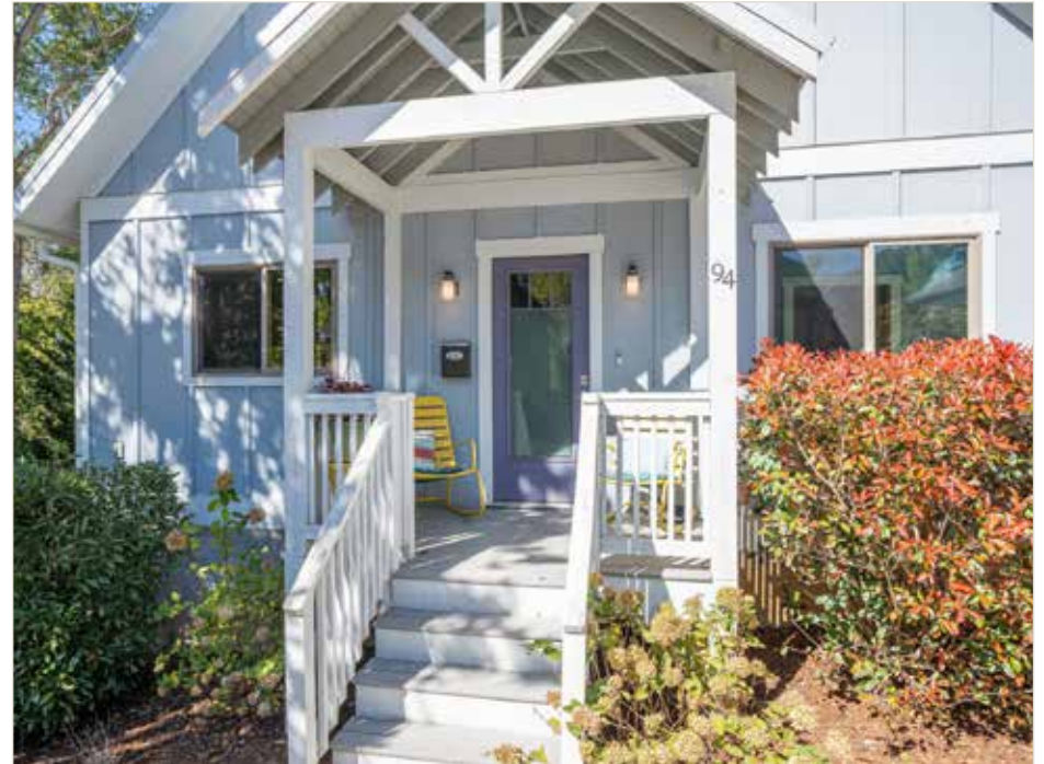
Adorable Covered Front Porch