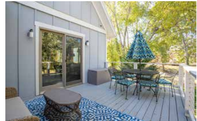
Trex Decking on Rear Porch