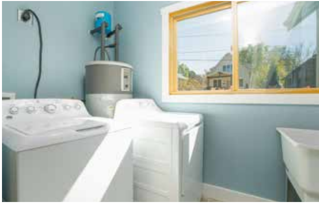
Laundry Room on Main Level