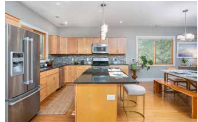
Perfect Kitchen Layout with Modern Light Fixtures