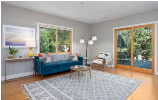
Living Room has Amazing Natural Light