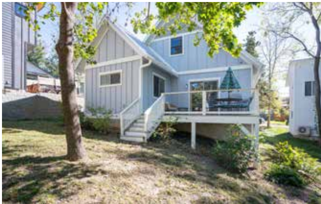
Rear View of Home and Rear Porch