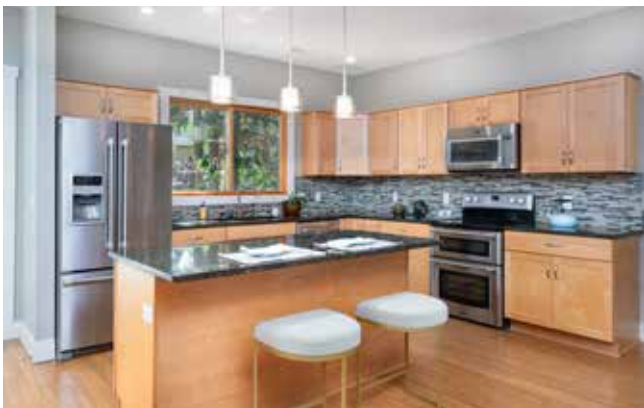
6' Island with Breakfast Bar