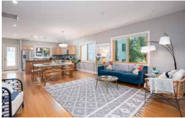
Beautiful Open Layout