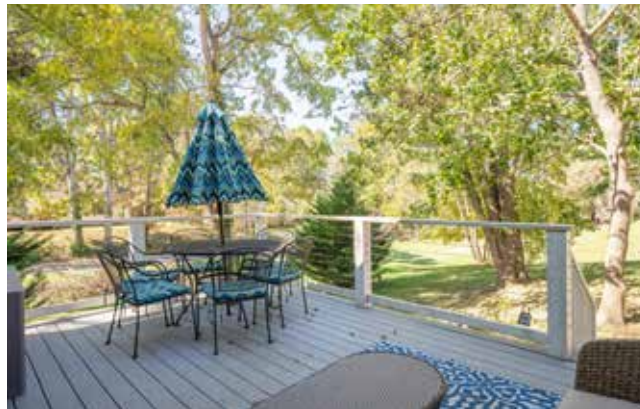
Perfect for Dining Al Fresco