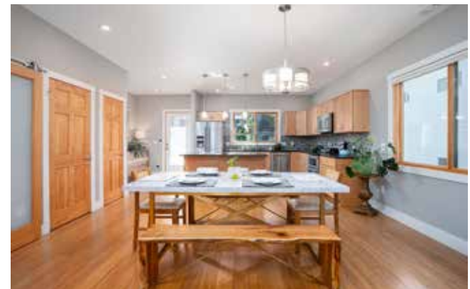
Room for Large Table