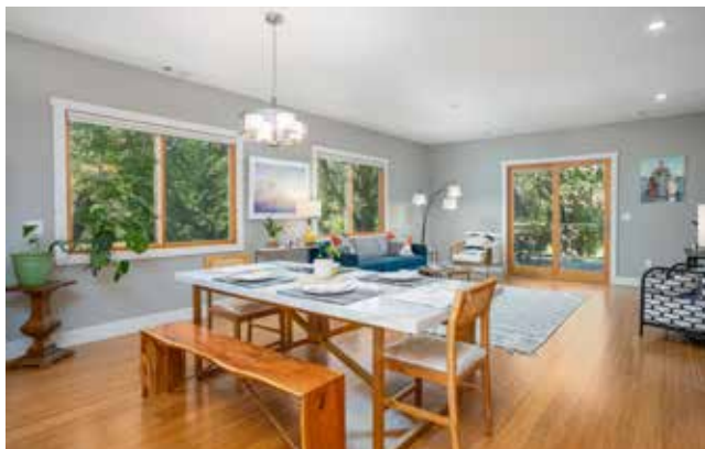
Dining Opens to Living Room and Rear Porch