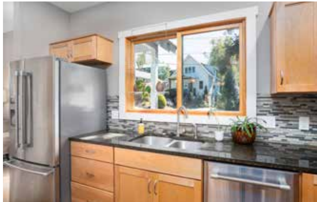
Kitchen with Stainless Steel Appliances