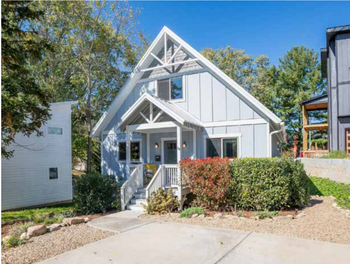
Charming Curb Appeal

Absolutely charming West Asheville Greenbuilt home with Gold Level certification. Extremely convenient location walkable to Haywood Road shops and restaurants. Tons of curb appeal with nice landscaping, an inviting covered front porch and metal roof. Main level has an open layout with 9' ceilings, wide plank bamboo floors and a sliding door leading to rear Trex deck. Kitchen is adorable and features soft-close cabinetry and a 6' island with breakfast bar and pendant lighting. Primary bedroom is on the main level with a gorgeous ensuite bath featuring dual sinks and a beautifully tiled shower. All closets are huge and there are two additional cozy bedrooms and a full bathroom upstairs. The main level also features a cute office with sliding doors, a powder room and a laundry room! Let's not forget the big backyard that backs up to greenspace. A truly remarkable home.