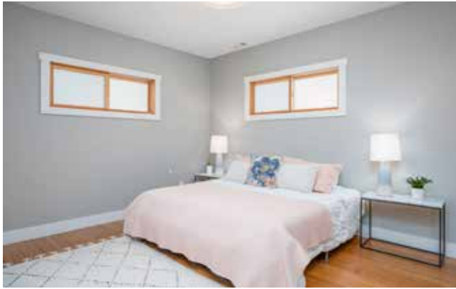
Primary Bedroom with Clerestory Windows