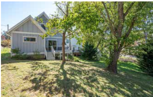
Huge Back Yard • Excellent for Pets or Play