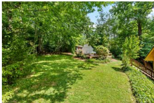
10 DANIEL LANE Charming Black Mountain Cottage Black Mountain, NC 28711