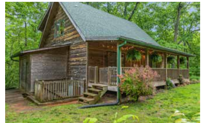
Durable Materials: Wood Siding, Architectural Roof