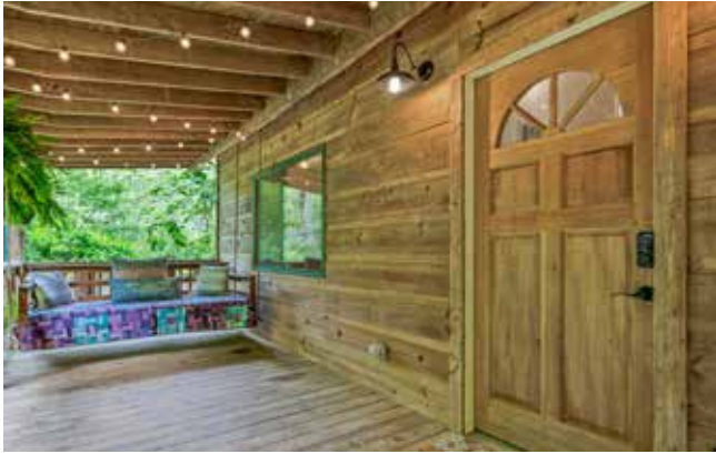
Quality Craftsmanship Welcomes You Home