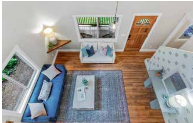
An Entertainer's Dream!