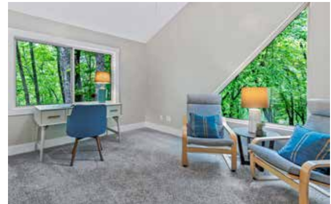
Loft Space with Many Possibilities