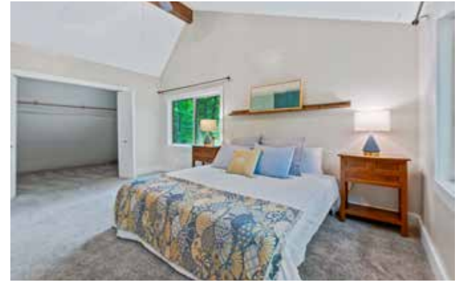
Primary Suite Features a Huge Closet and Exposed Beam