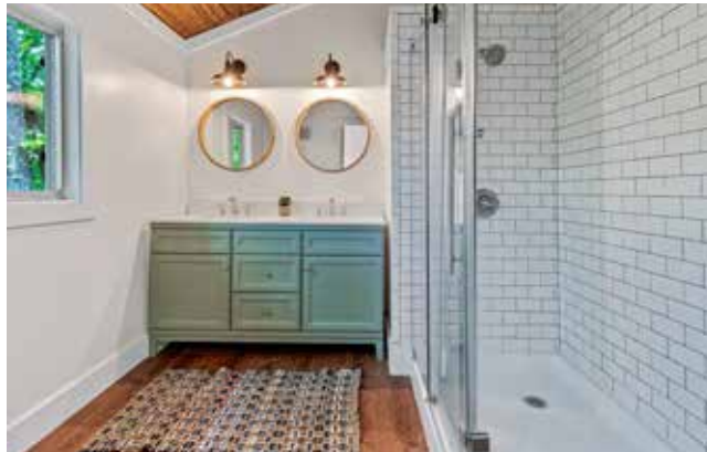
... a Quartz-Topped Vanity and a Tiled, Walk-in Shower