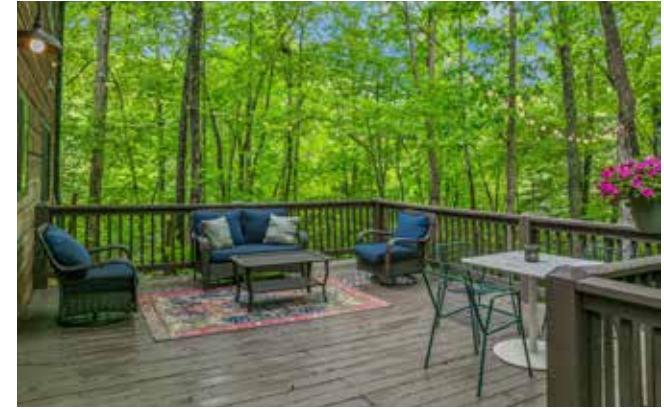
Long Summer Days Await