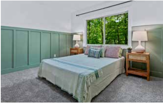
Bedroom Suite on Main Level