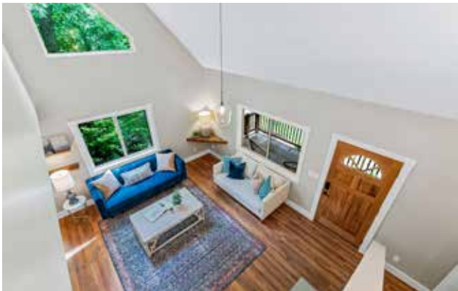
View from Second-Level Loft