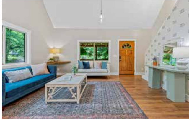
Lots of Space for Entertaining