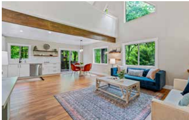
Open and Airy Floor Plan