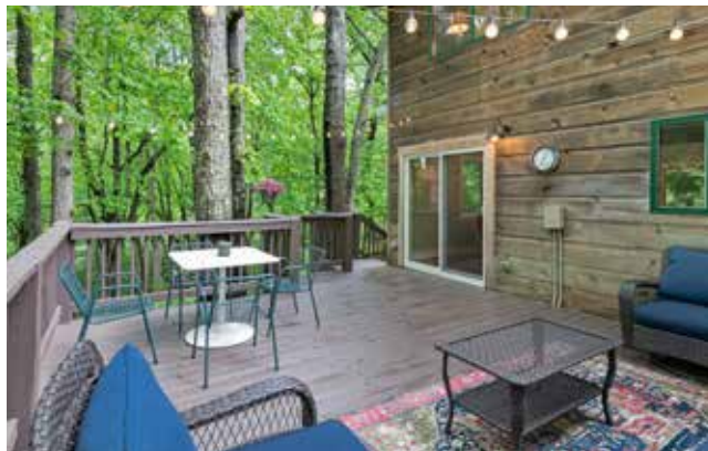
... and a Sunny Back Deck, Ready for Gatherings