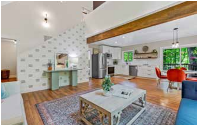
Stunning Exposed Beam Highlights Thoughtful Design.