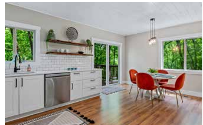
Back Deck Access