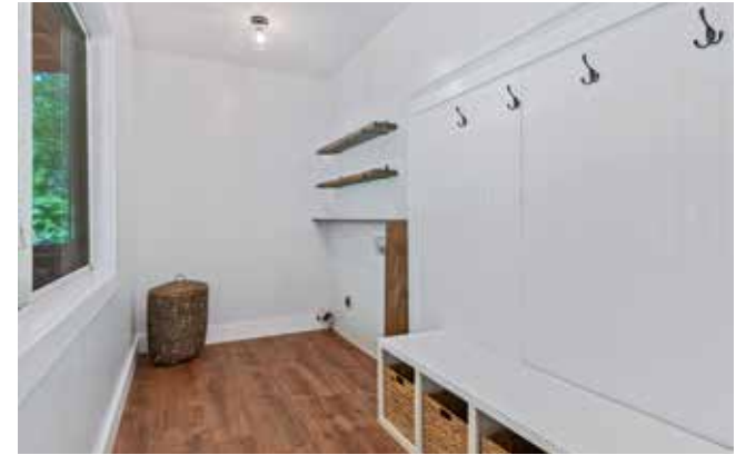
Mudroom and Laundry on Main Level