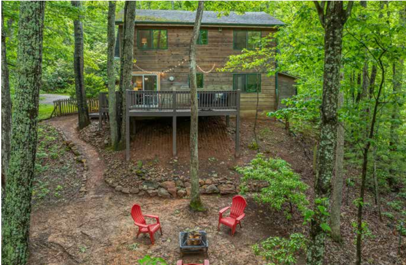
Healthy Outdoor Living Abounds