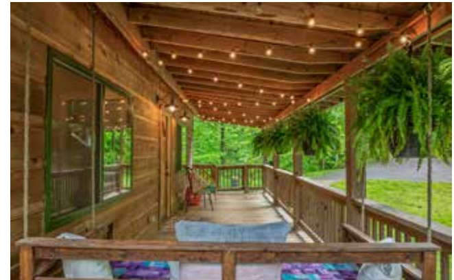
Outside Is a Southern-Style, Covered Front Porch ...