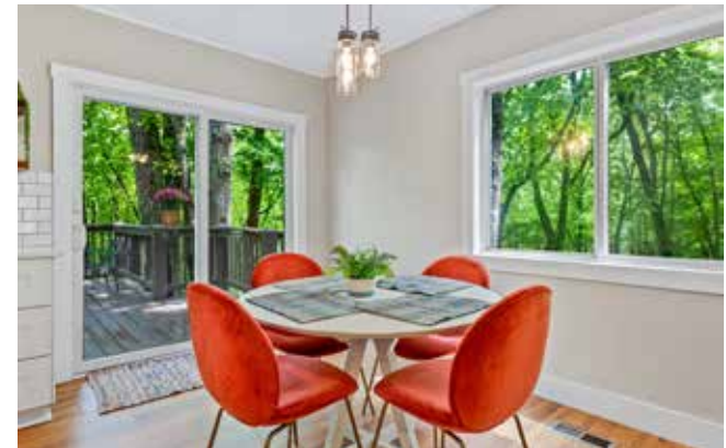
Dining Area off of Kitchen