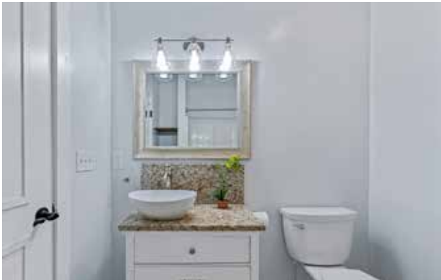
Ensuite Bathroom Features a Granite-Topped Vanity ...