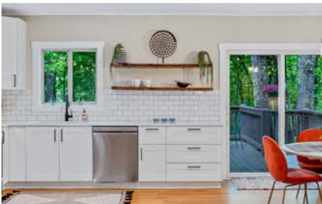
Subway Tile Backsplash and Floating Display Shelves