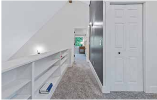
Hallway Connects Loft with Primary Suite