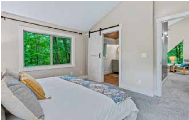
... Plus a Vaulted Ceiling and a Full Bathroom with...