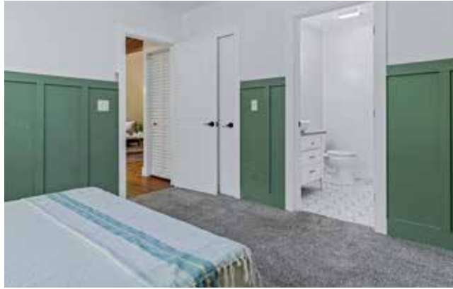
Ensuite Bathroom off of Main-Level Bedroom