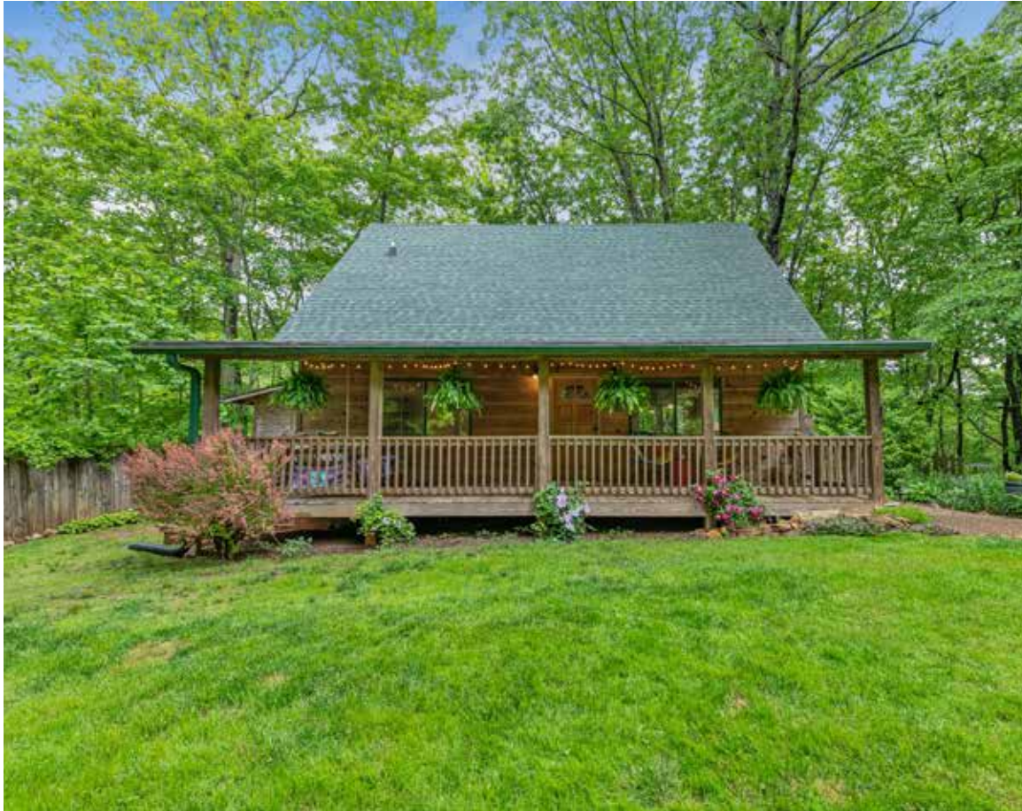
Great Primary or Second Home, Convenient to Downtown Asheville

Peace and tranquility await in this quintessential country cabin, nestled in a whimsical, mature wooded lot. Located in the rolling hills of Leicester and immersed in nature, this home boasts meandering walking trails, established areas for gardening, and a serene setting that washes away the stresses of everyday life. Fantastic opportunity for a primary home, vacation/second home — close to Patton Avenue amenities, and convenient to downtown Asheville. Entertain from the spacious living room, well-appointed kitchen, and sunny back deck, ready for grilling. Bedroom suite, mudroom, and laundry room on main level. Bright primary bedroom upstairs features a vaulted ceiling, exposed ceiling beam, huge walk-in closet, and an ensuite full bathroom. Spacious loft on the second level overlooks the living area and boasts many possibilities. Attached shed and walk-in basement/crawl space with lots of extra tool + toy storage. Plenty of parking for family and guests.