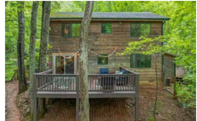
Mature Trees Frame Sunny Back Deck