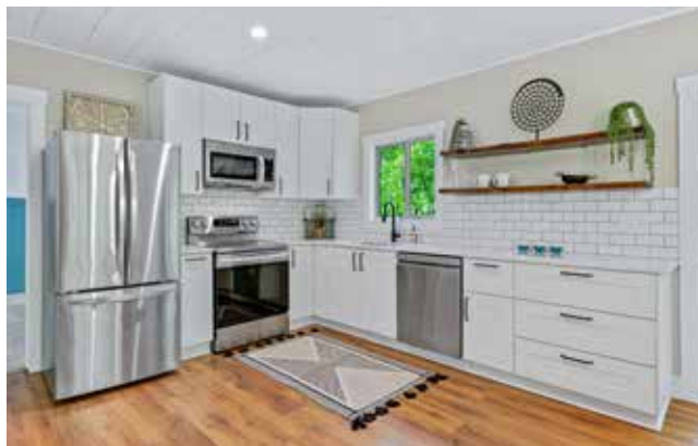
Well-Appointed Kitchen with Quartz and Stainless Steel