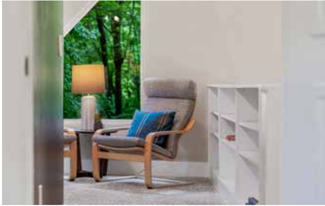
Cozy Spot for a Good Book