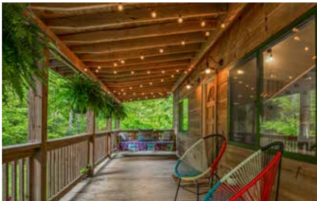
... with a Swing Bench/Bed and Room for Relaxing ...