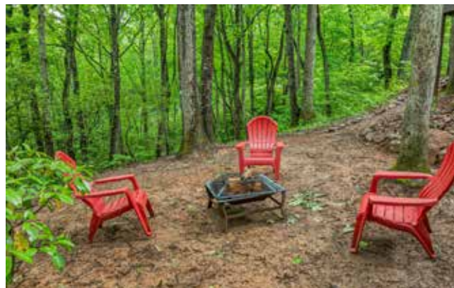
And a Cleared Area for a Fire Pit