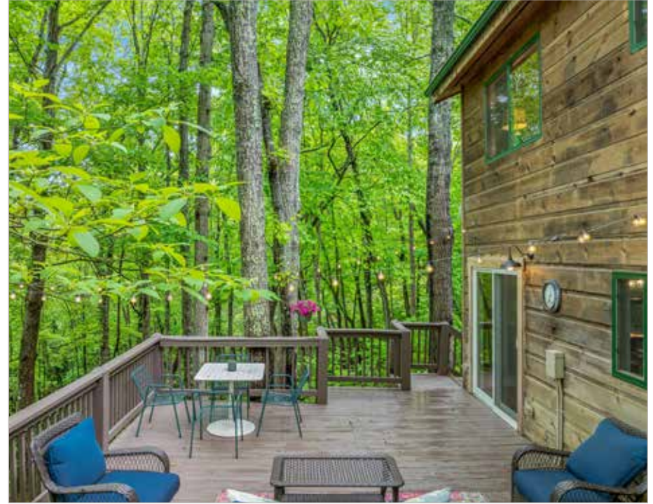
Lush Forest Surrounds the Home