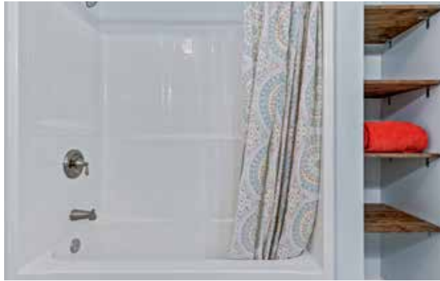
... Plus a Step-in Shower and Linen Storage