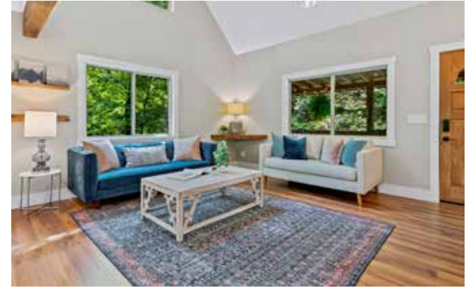
Living Room with Vaulted Ceiling