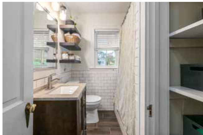
11 COLONIAL PLACE Traditional Cottage in Historic Colonial Heights Asheville, NC 28804