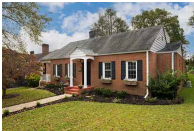
11 COLONIAL PLACE Traditional Cottage in Historic Colonial Heights Asheville, NC 28804