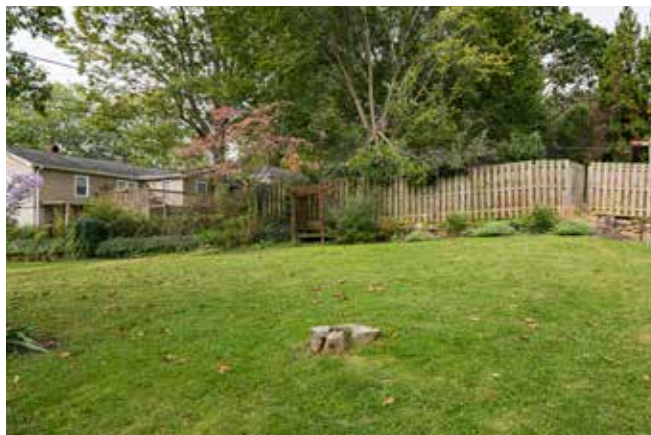
11 COLONIAL PLACE Traditional Cottage in Historic Colonial Heights Asheville, NC 28804