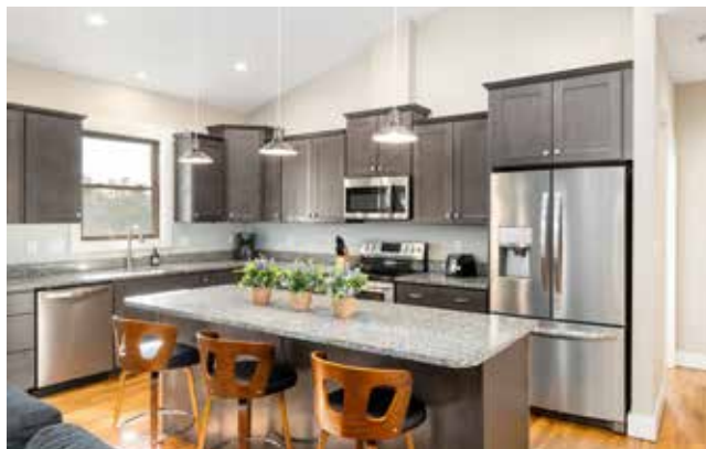
Sparkling Kitchen Features Granite and Stainless Steel