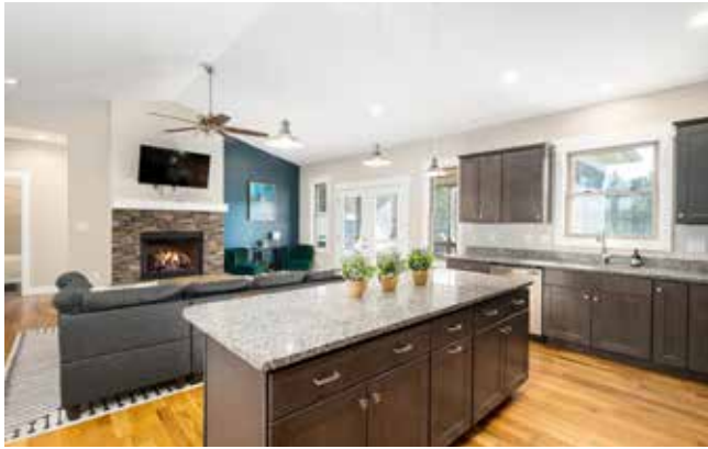
Space for Entertaining