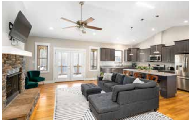
Spacious Living Room with Vaulted Ceiling and Deck Access