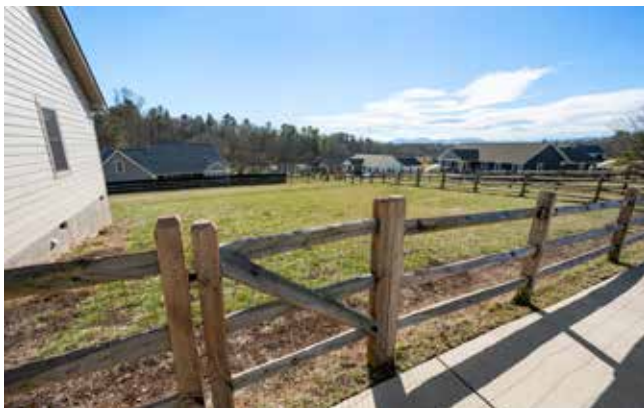
Fully Fenced Back Yard for Furry Friends