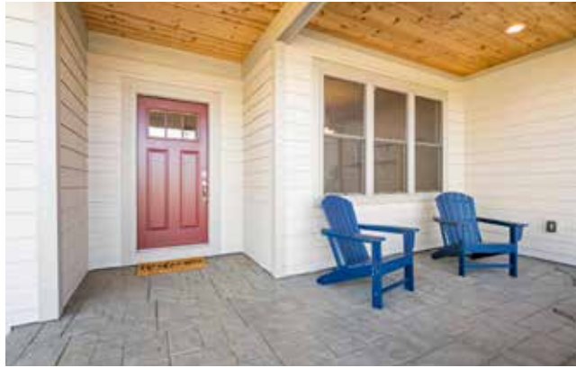
Covered Front Patio for Relaxing