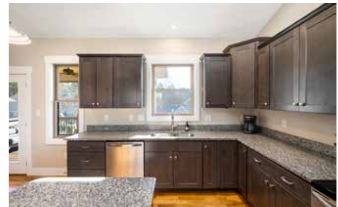
Lots of Cabinet and Counter Space