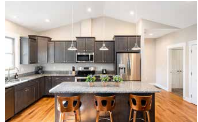
Large Island Connects Kitchen and Living Area