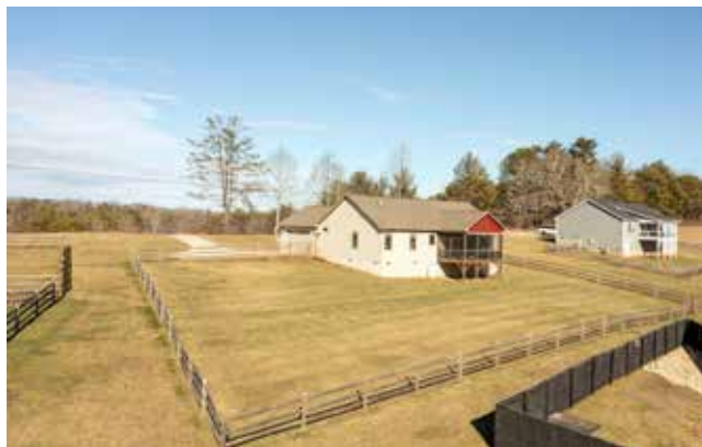
Lots of Sun • Perfect for a Home Garden