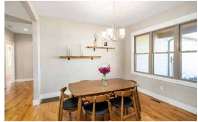
Triple Window Makes for a Lovely, Light-Filled Space