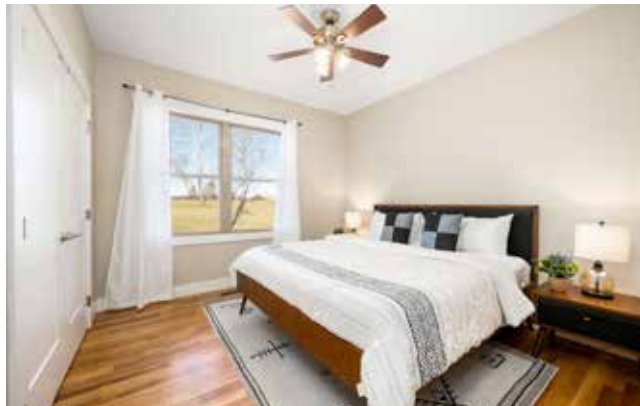
Bright Second Bedroom