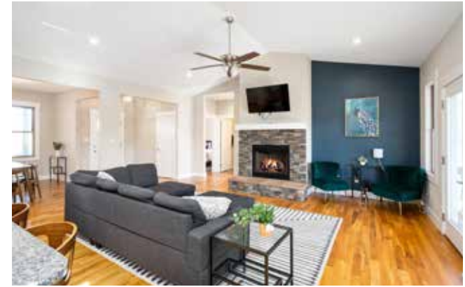
Stone-Surround, Gas Fireplace for Chilly Evenings