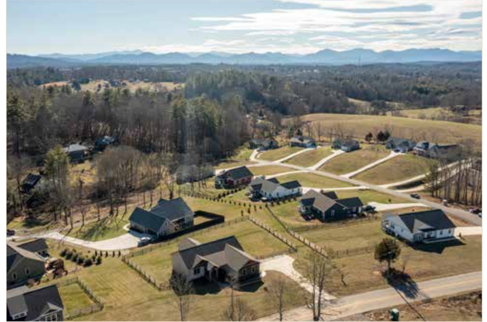
Stunning, Long-Range Mountain Views