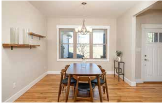
Dining Area Overlooks the Front Porch and Yard