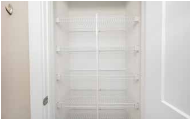
Large Linen Closet