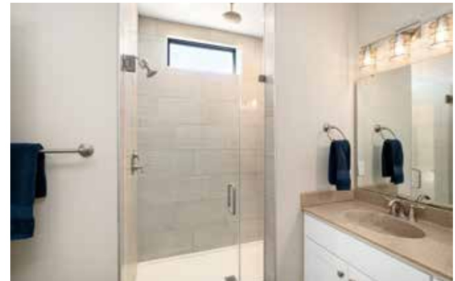
Tiled Walk-in Shower