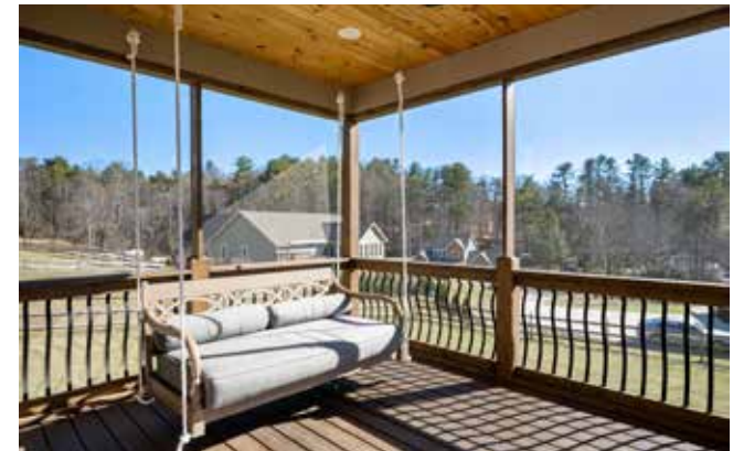
Swinging Bench for Lazy Days