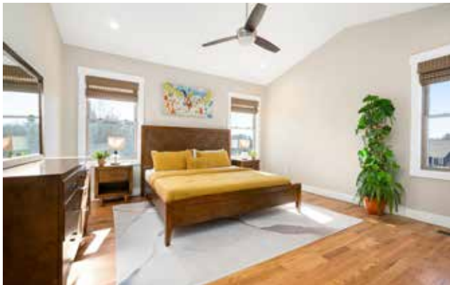
Primary Suite Features a Vaulted Ceiling