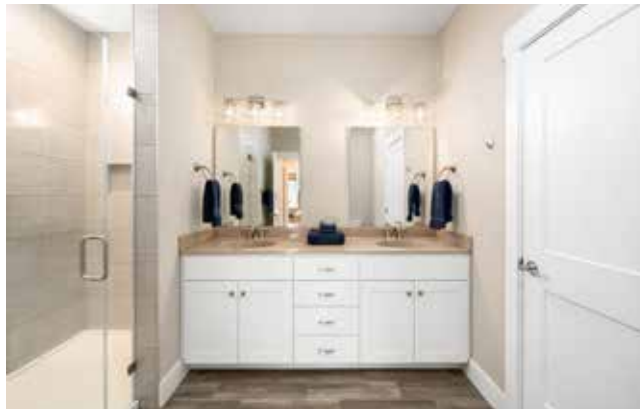
Double Vanity in Ensuite Full Bathroom