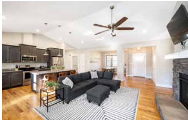
Open and Airy