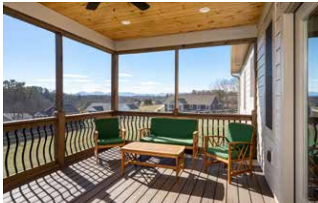
Screened Porch for Gatherings