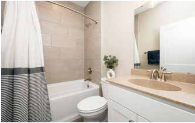
Second Full Bathroom