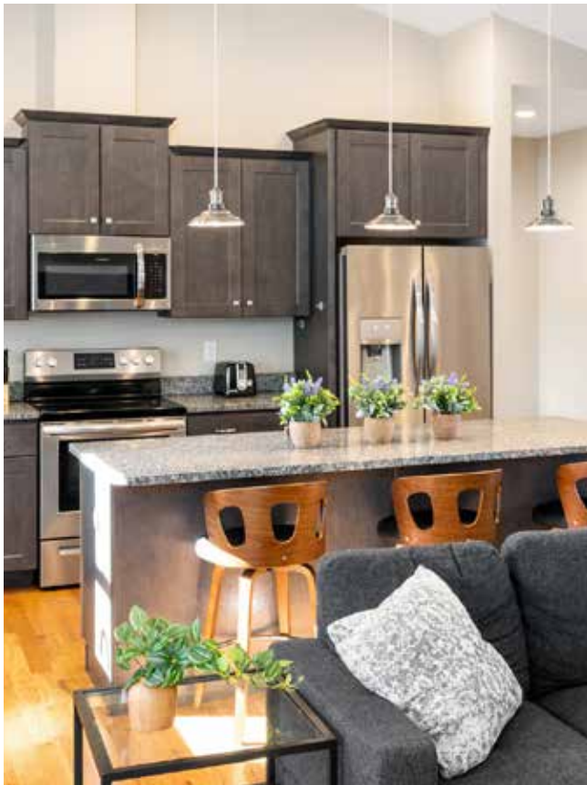
Stylish Finishes Highlight Thoughtful Design