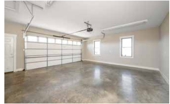
Oversized Two-Car Garage