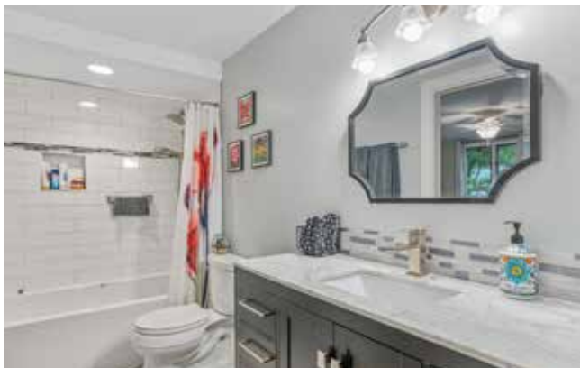
Remodeled Primary Bathroom