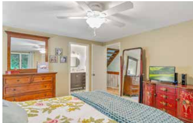
Primary Bedroom Suite on Main Level