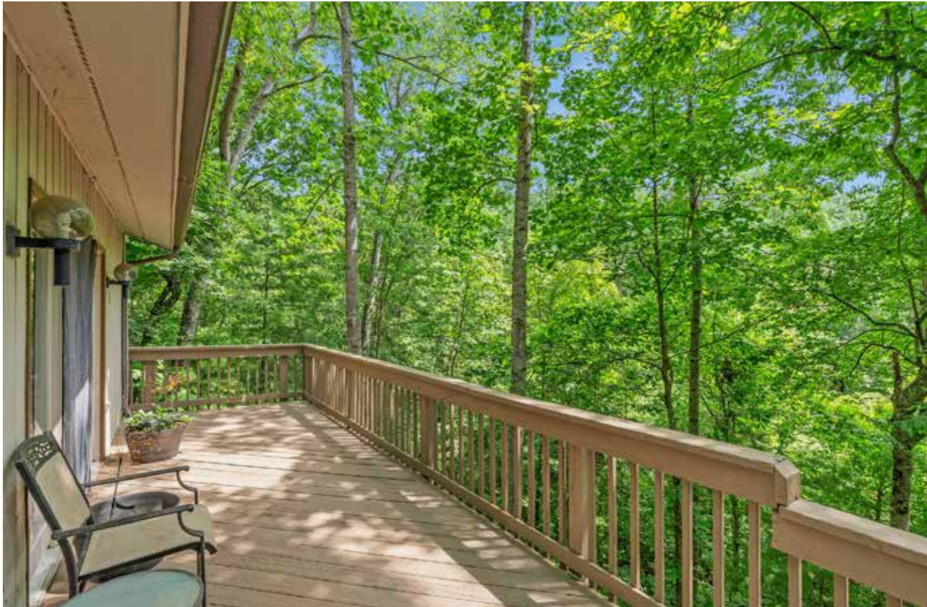
Relax in Privacy and Peace