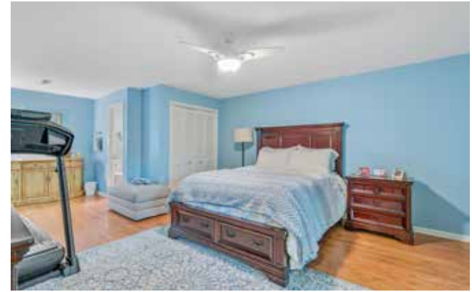
Lower-Level Bedroom Suite