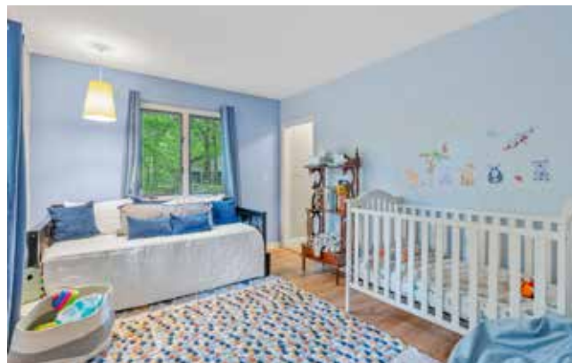
Guest Room or Nursery