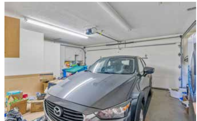
Lower-Level Garage and Storage