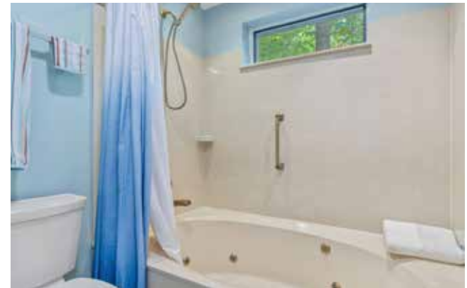
Bathroom Has a Jetted Tub