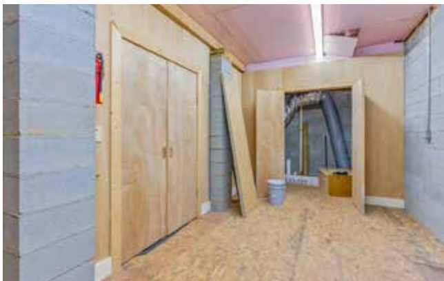
Tons of Storage in Lower-Level Mechanical Room