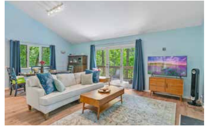
Living Room with New Floors ...