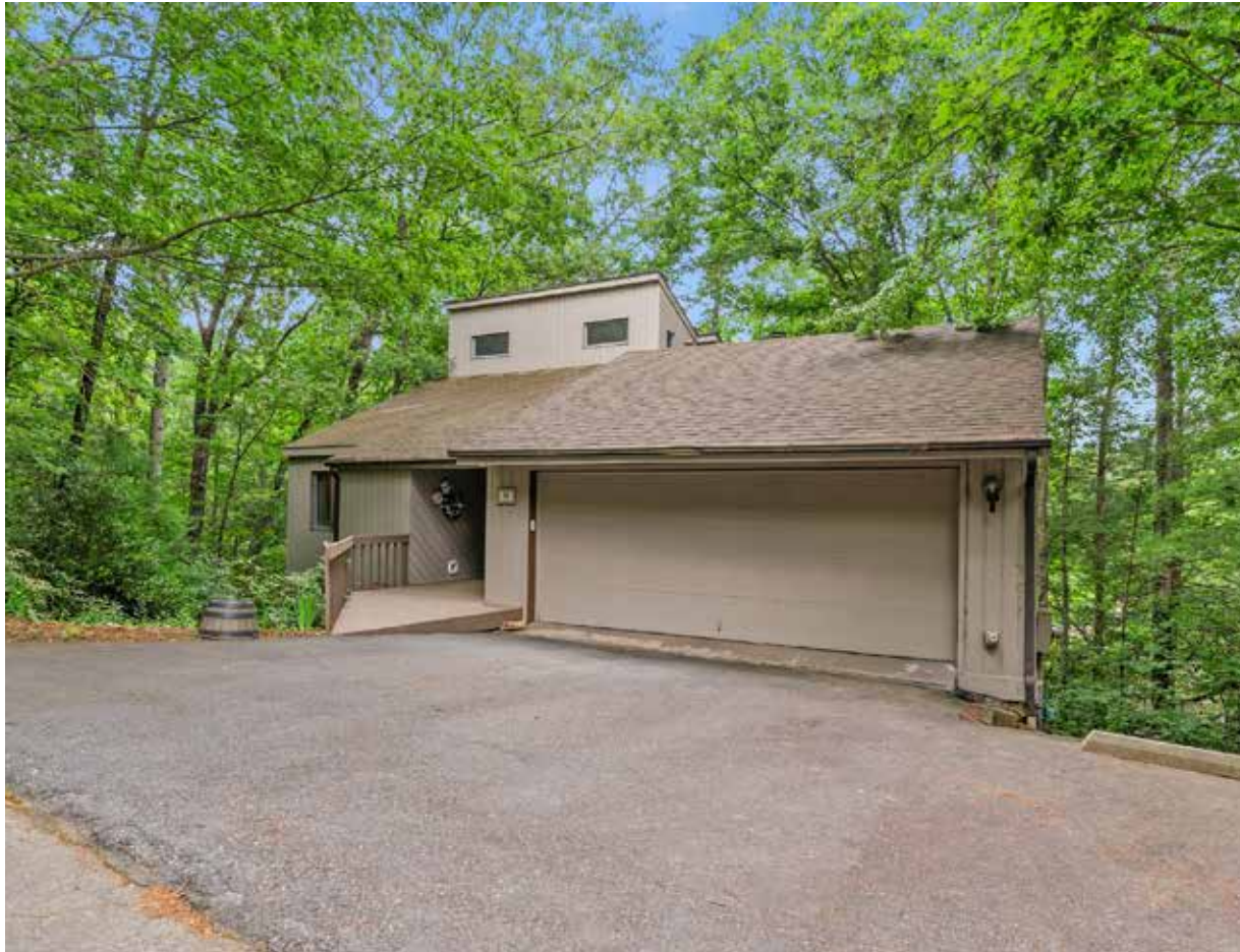
Large Garage with Extra Parking