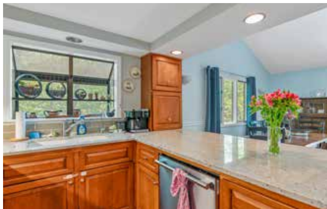
Kitchen Has Lots of Light