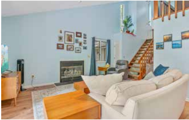
Crisp, Clean and Cozy