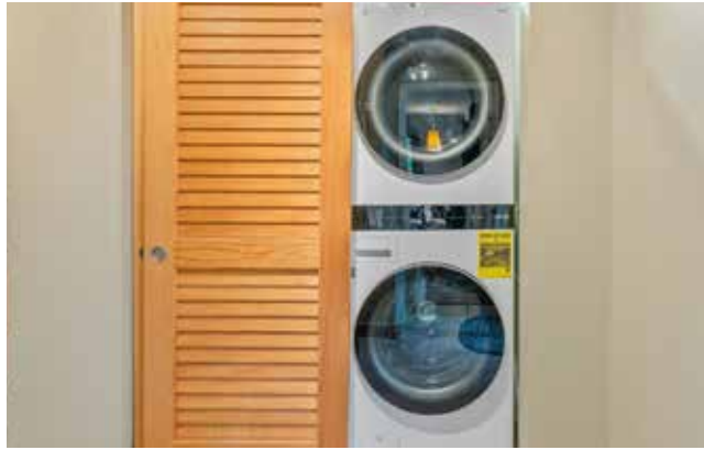
Washer and Dryer Convey