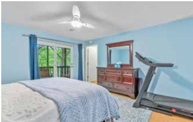
Lower-Level Deck Access