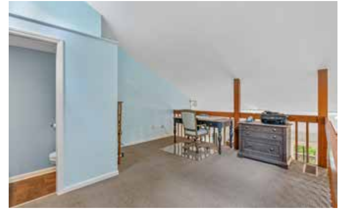
Loft Makes a Great Office