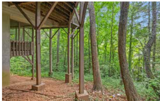
Below the Second Deck