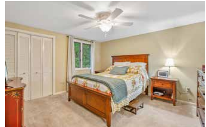
Double Closet • Plenty of Room for Furniture