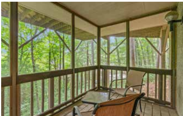
Screened-in Porch on Lower Level