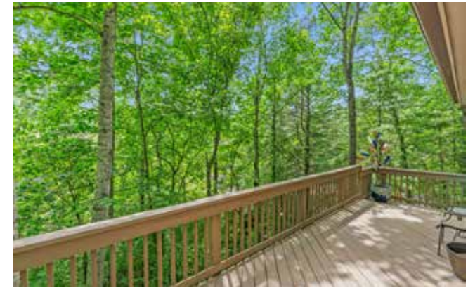
Deck Was Recently Painted