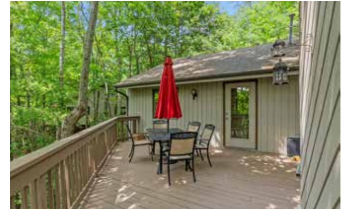
Multiple Outdoor Areas