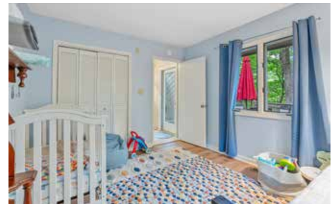
Double Closet • View of the Back Deck