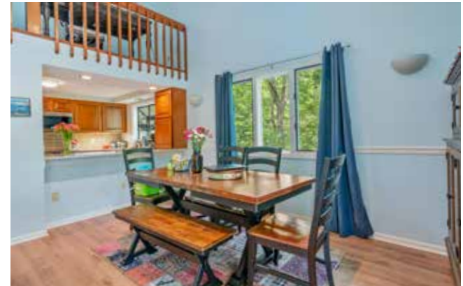
Kitchen with Passthrough