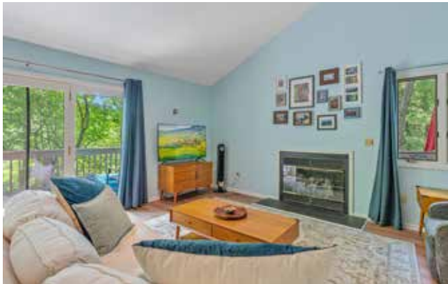
... and a Propane Fireplace