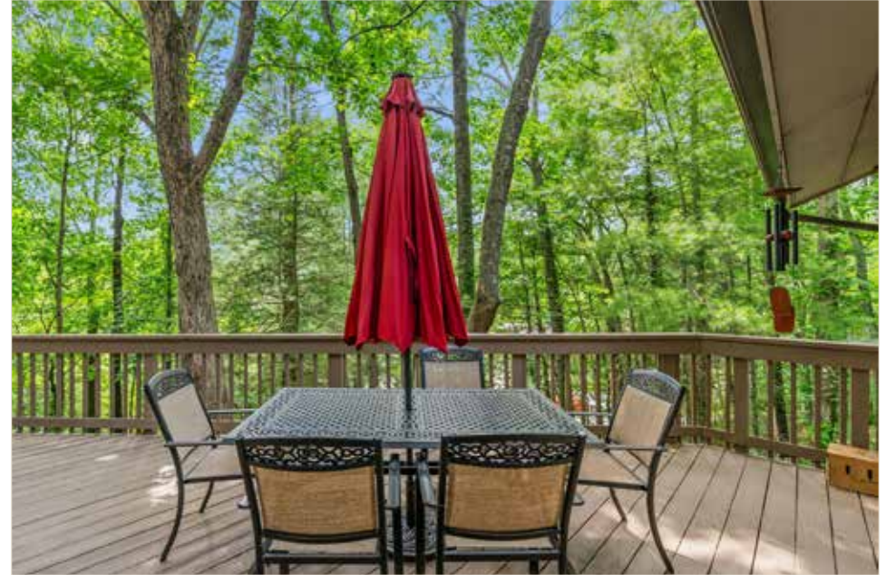
Deck in the Trees