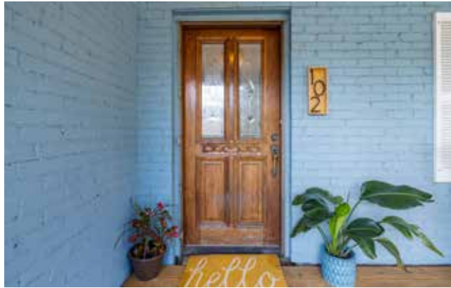
Hello! Come on in