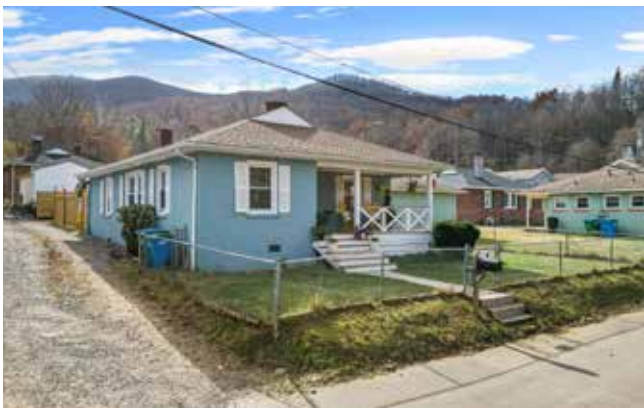
Shared driveway with great neighbors