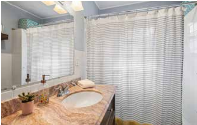
Granite counter top in bathroom