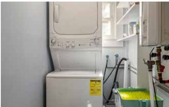
Laundry w/ newer washer dryer and tankless water heater