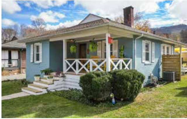
Welcome to 102 Campbell Street