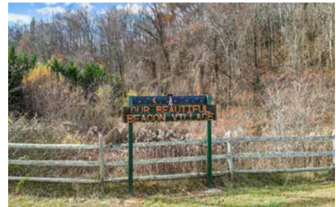
Come see the beautiful Beacon Village today!