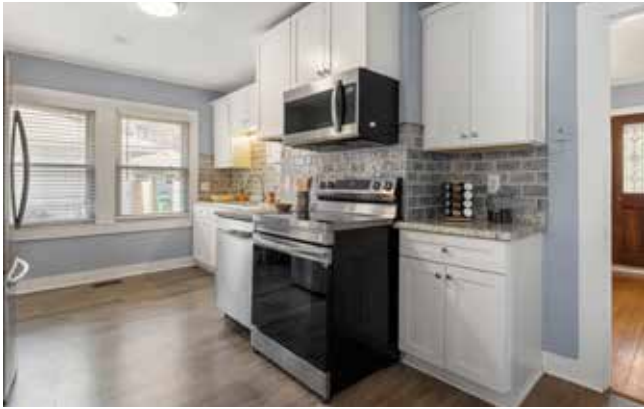
Updated kitchen • Subway tile • Stainless appliances