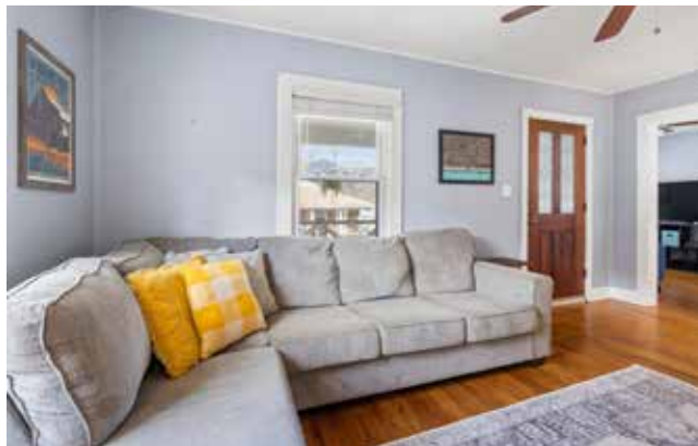
Nice and bright with original hardwood floors

102 CAMPBELL ST The Blue Bungalow...in Historic Beacon Village Swannanoa, NC 28778