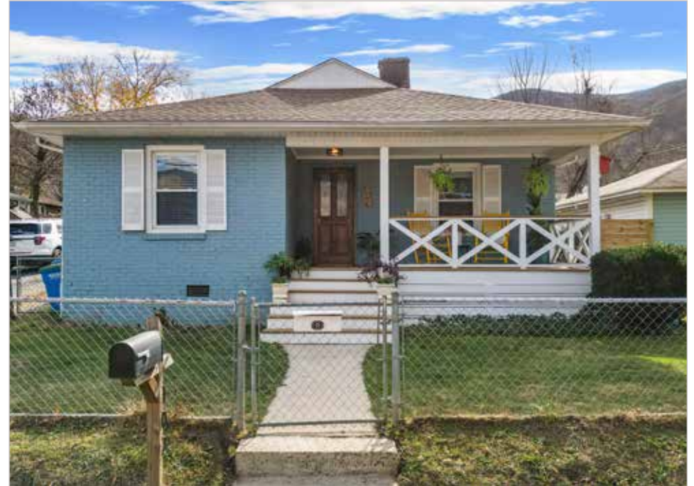
Historic Beacon Village Community • Swannanoa