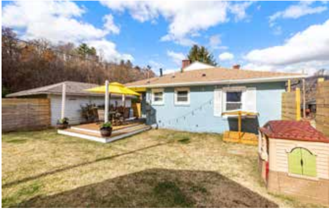
Check out that new roof!