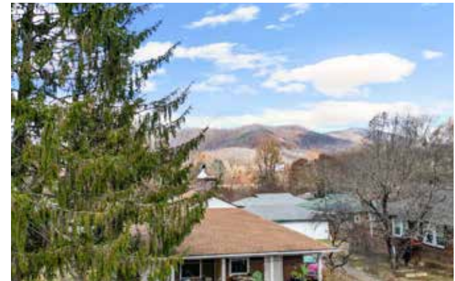
Northern views off the front of the house