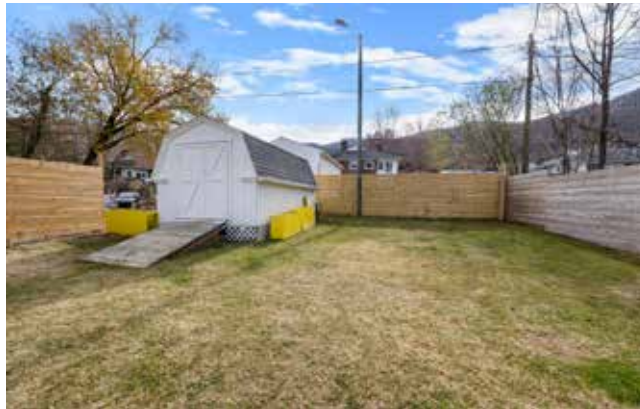
Plenty of storage in the outbuilding