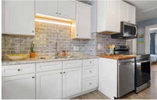
Newer cabinets, countertops and flooring