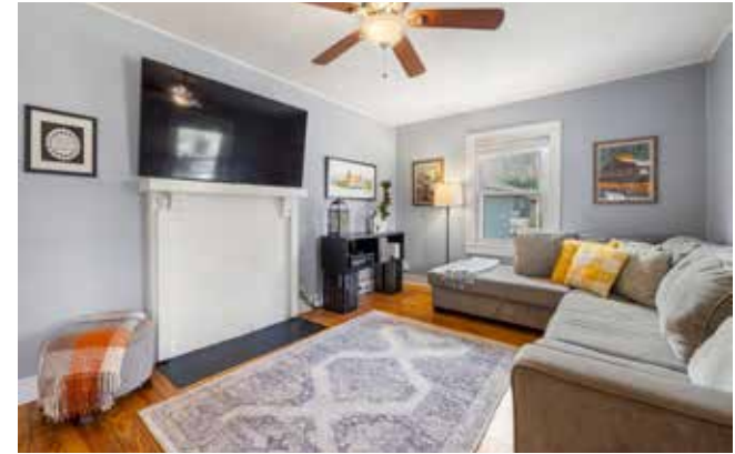
Living room area with original hearth