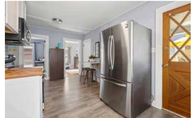
Kitchen leads out to great deck for entertaining