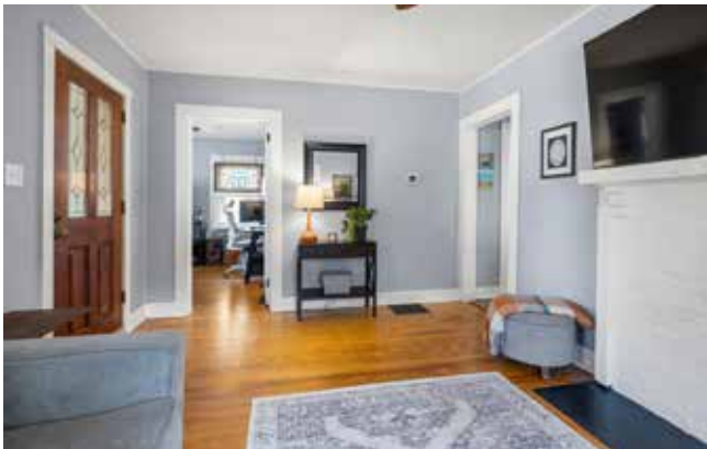
Living room looking into office