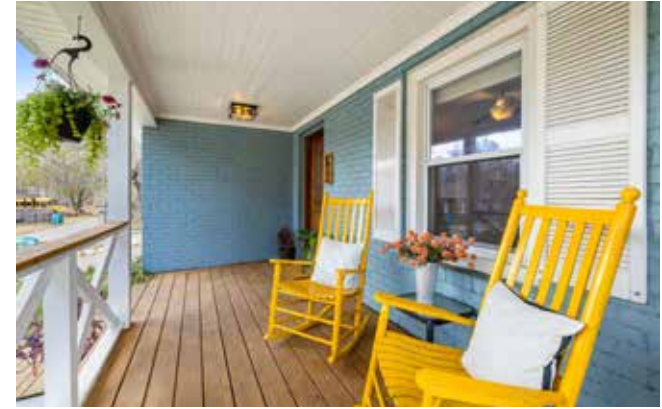
Take a seat on the rocking chair front porch