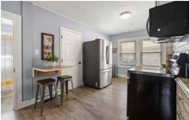
Laundry room and primary bathroom to the left