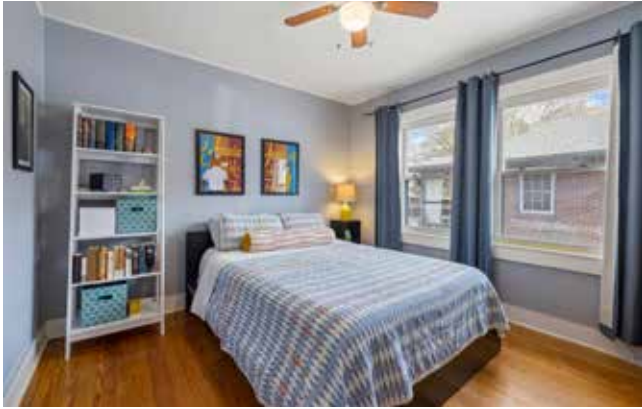
Light-filled primary bedroom