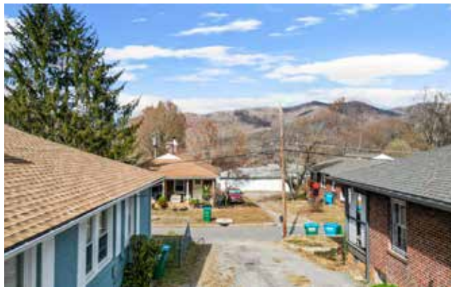
Looking north from top of the driveway