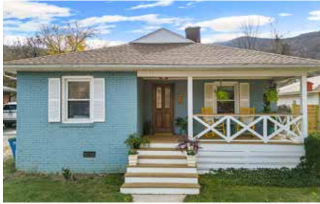
The Blue Bungalow