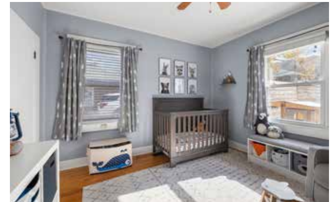
Another room with great natural light