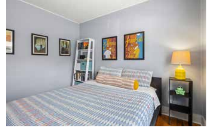
Cozy room with wood floors and trim