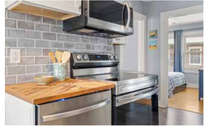
Handcrafted butcher block for added counter space