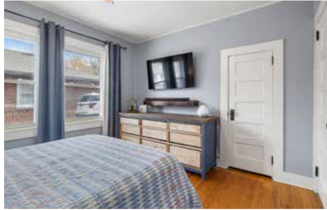
Primary bedroom facing closet