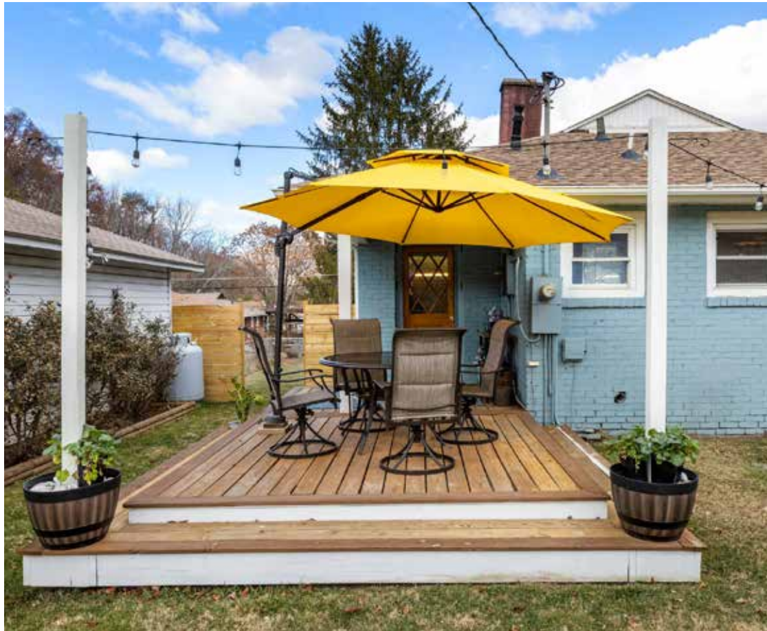
Perfect for Al Fresco Dining