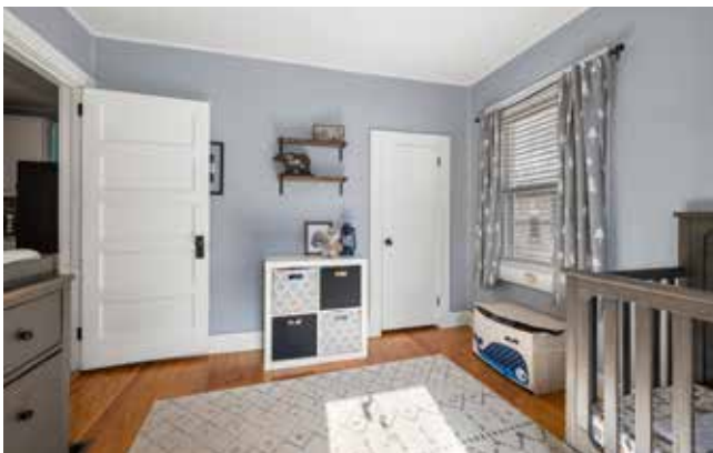
Second bedroom facing closet