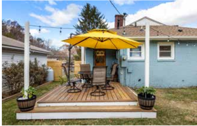
Cute planters and bistro lighting