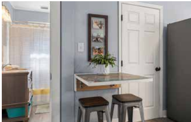
Convertible breakfast bar