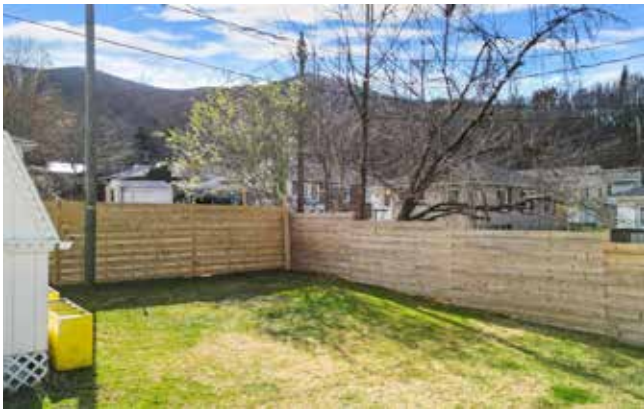
Easy-maintenance yard with views and new privacy fence