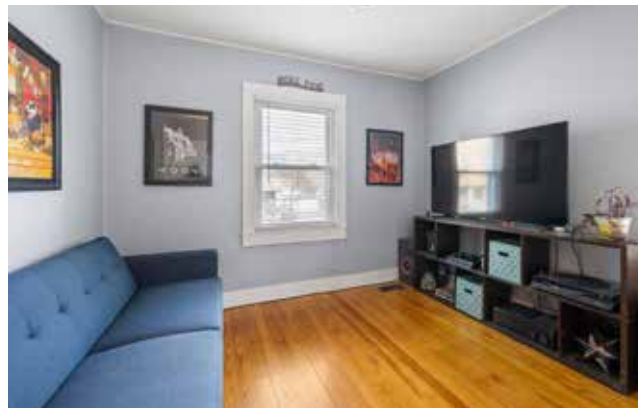
Front room is perfect for an office or den (no closet)

102 CAMPBELL ST The Blue Bungalow...in Historic Beacon Village Swannanoa, NC 28778