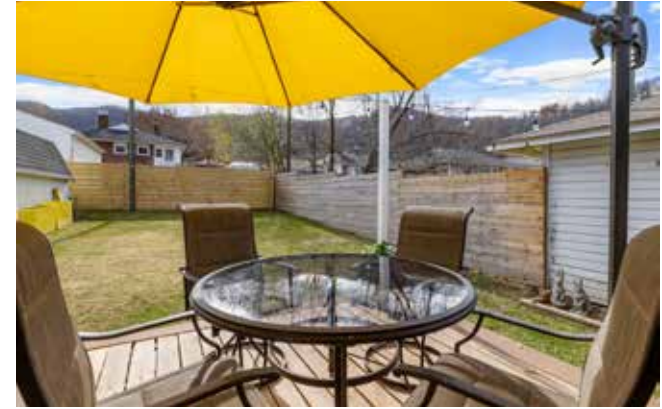
Perfect for morning coffee