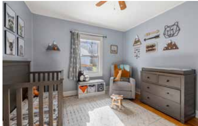
Adorable second bedroom