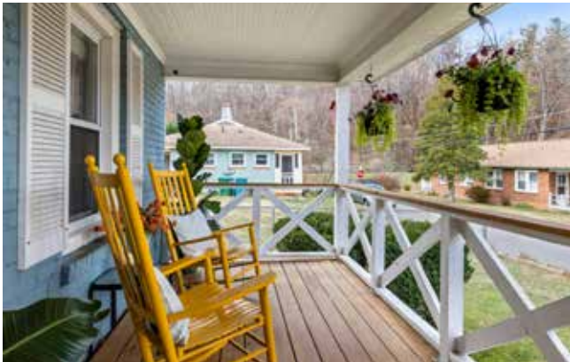
New front porch, railing, and steps