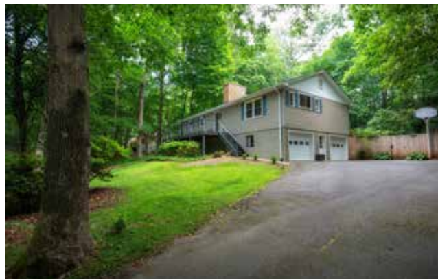
Attached Two-Car Garage