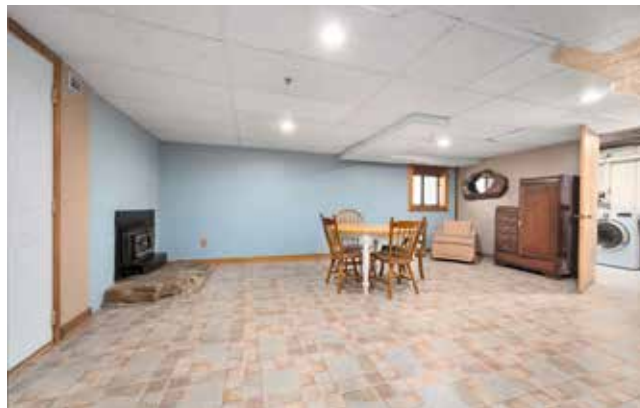
Basement Offers Many Possibilities