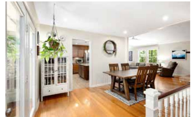
Dining Area off of Kitchen and Back Deck Access