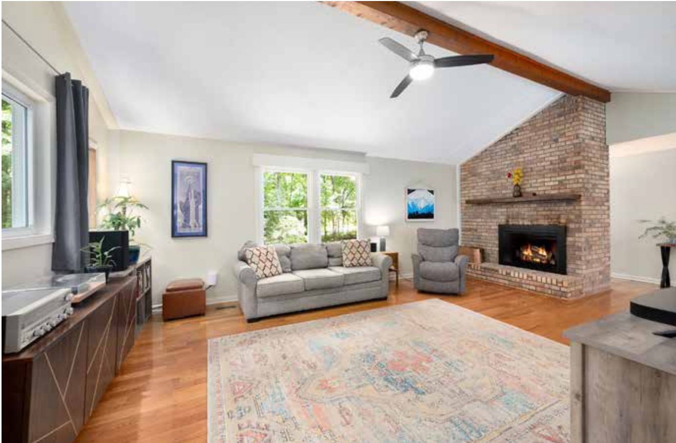
Open and Airy Living Room with Vaulted Ceiling