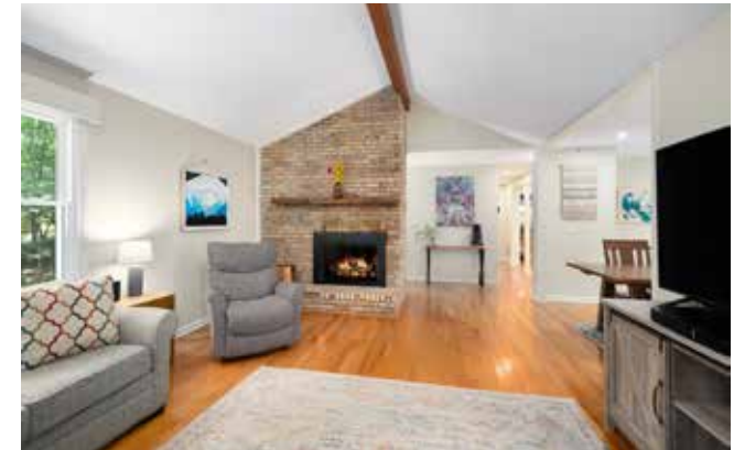
Exposed Beam • Brick-Surround, Wood-Burning Fireplace