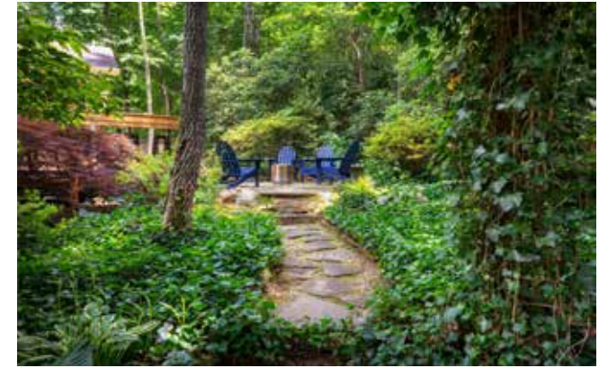
Paths Meander through Native Landscape