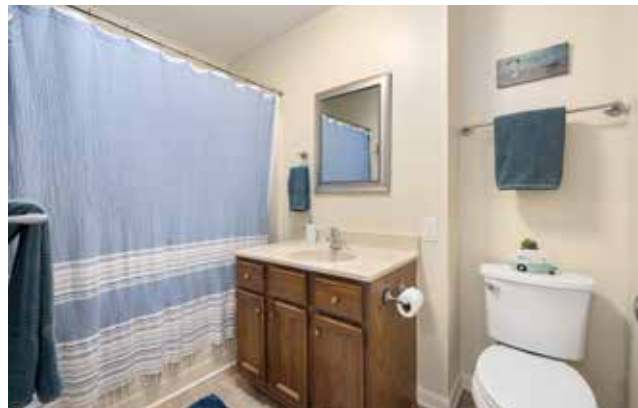
Full Bathroom on Main Level