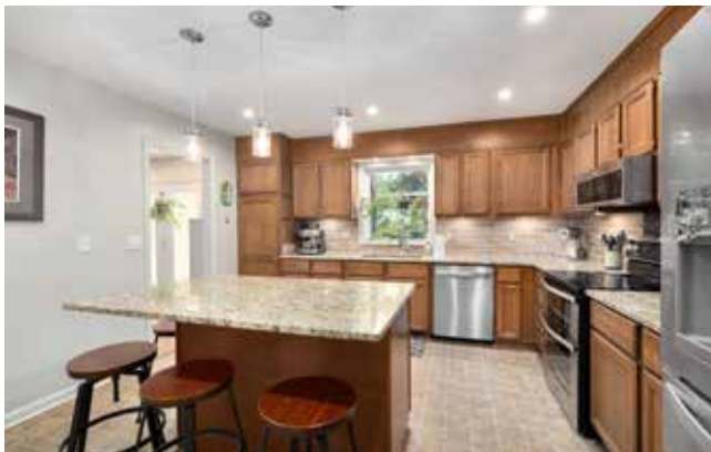
Chef's Kitchen Features Granite and Stainless Steel