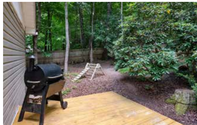
Easy One-Step Access from Back Patio