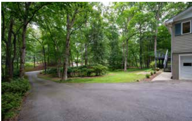
Plenty of Parking