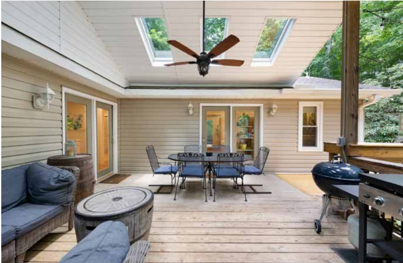
Outside Living, Rain or Shine