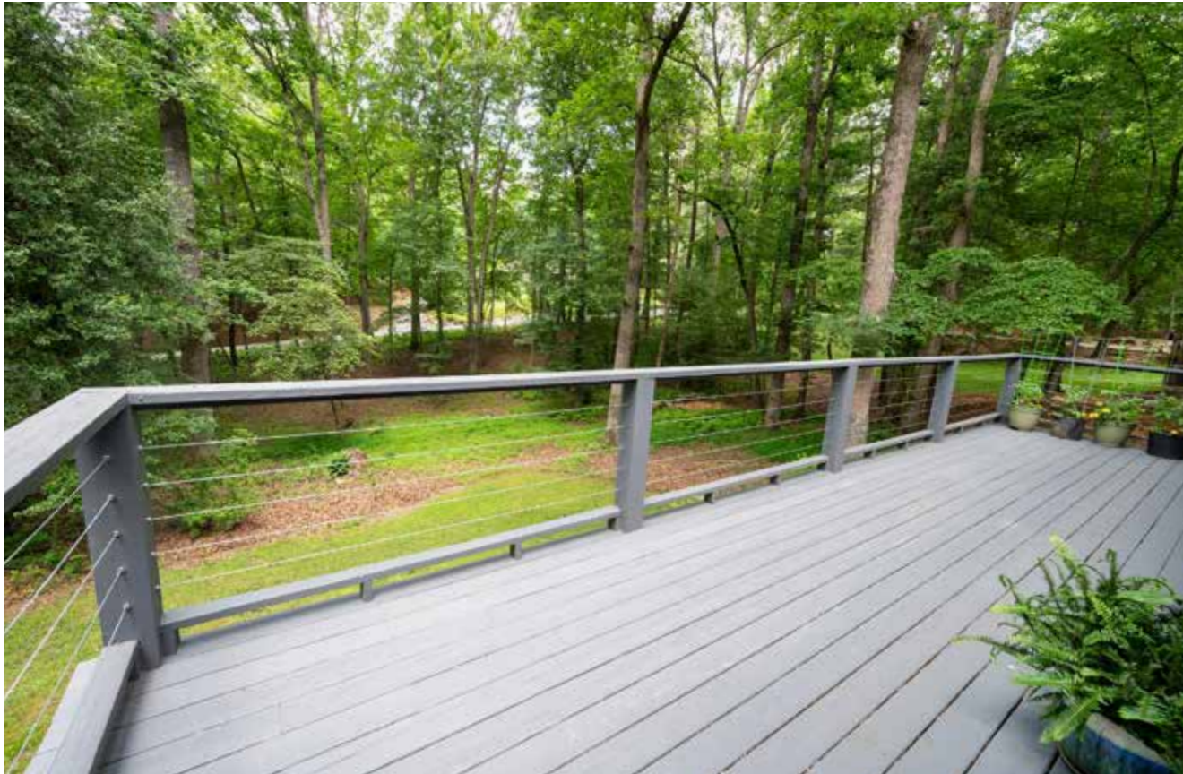
Expansive Front Deck