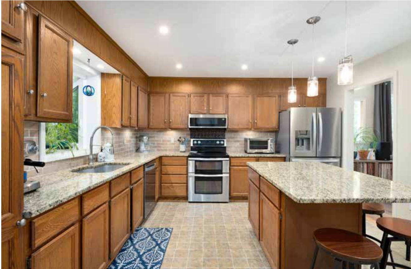
Lots of Cabinet and Counter Space