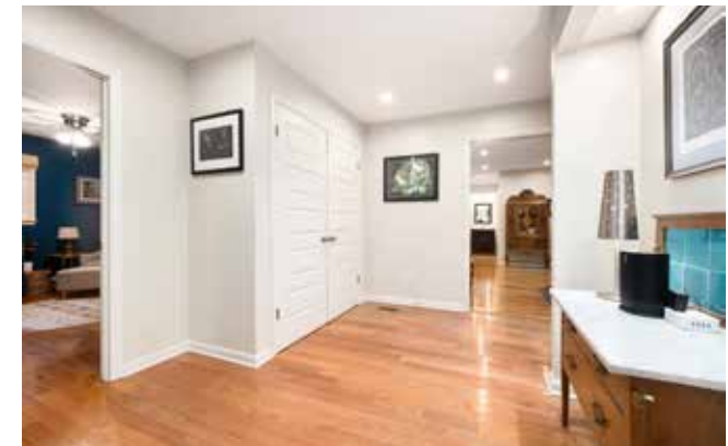
Hallway Connects Three Bedrooms