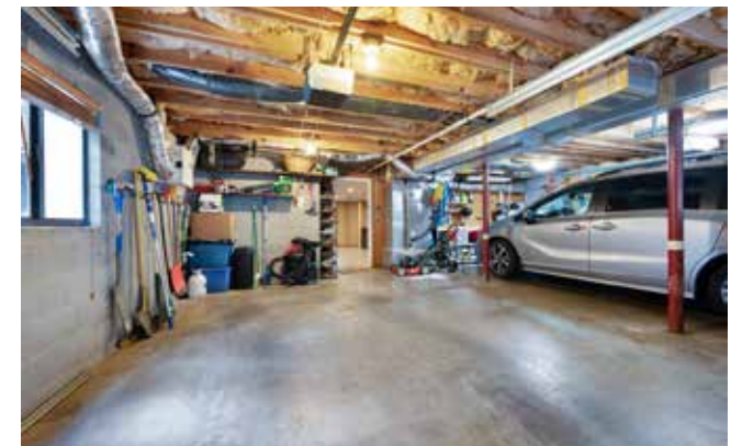
Plenty of Tool + Toy Storage