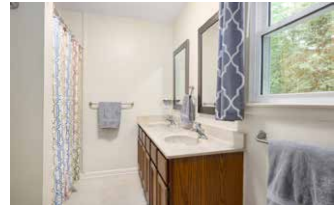
Double Vanity in Ensuite Bathroom