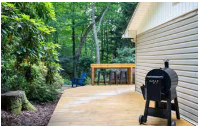
Sunny Patio, Great for Grilling