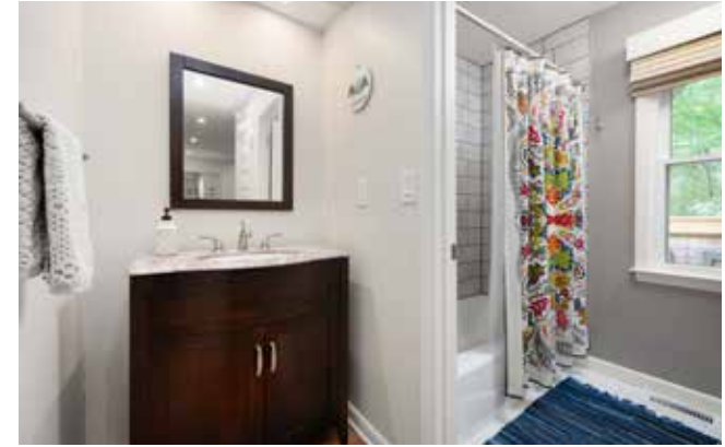
Bathroom with Tiled Shower + Tub