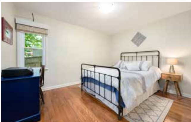
Bedroom with Yard View