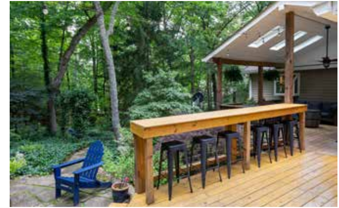
The Custom-Built Bar Is Perfect for Gatherings