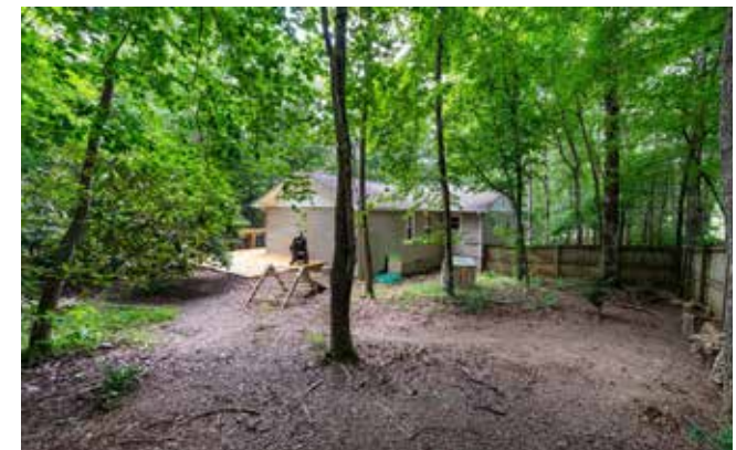
Room for Playing, Planting and/or Puttering