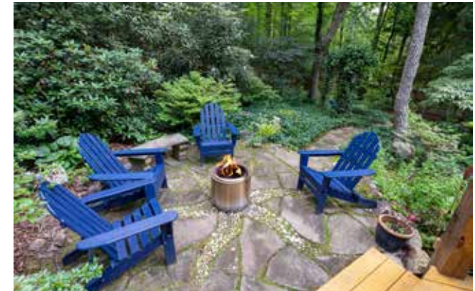
Potential Fire Pit for Chilly Evenings