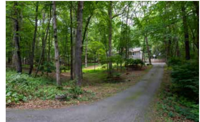
Home Sits off Bran Rick Road for Maximum Privacy