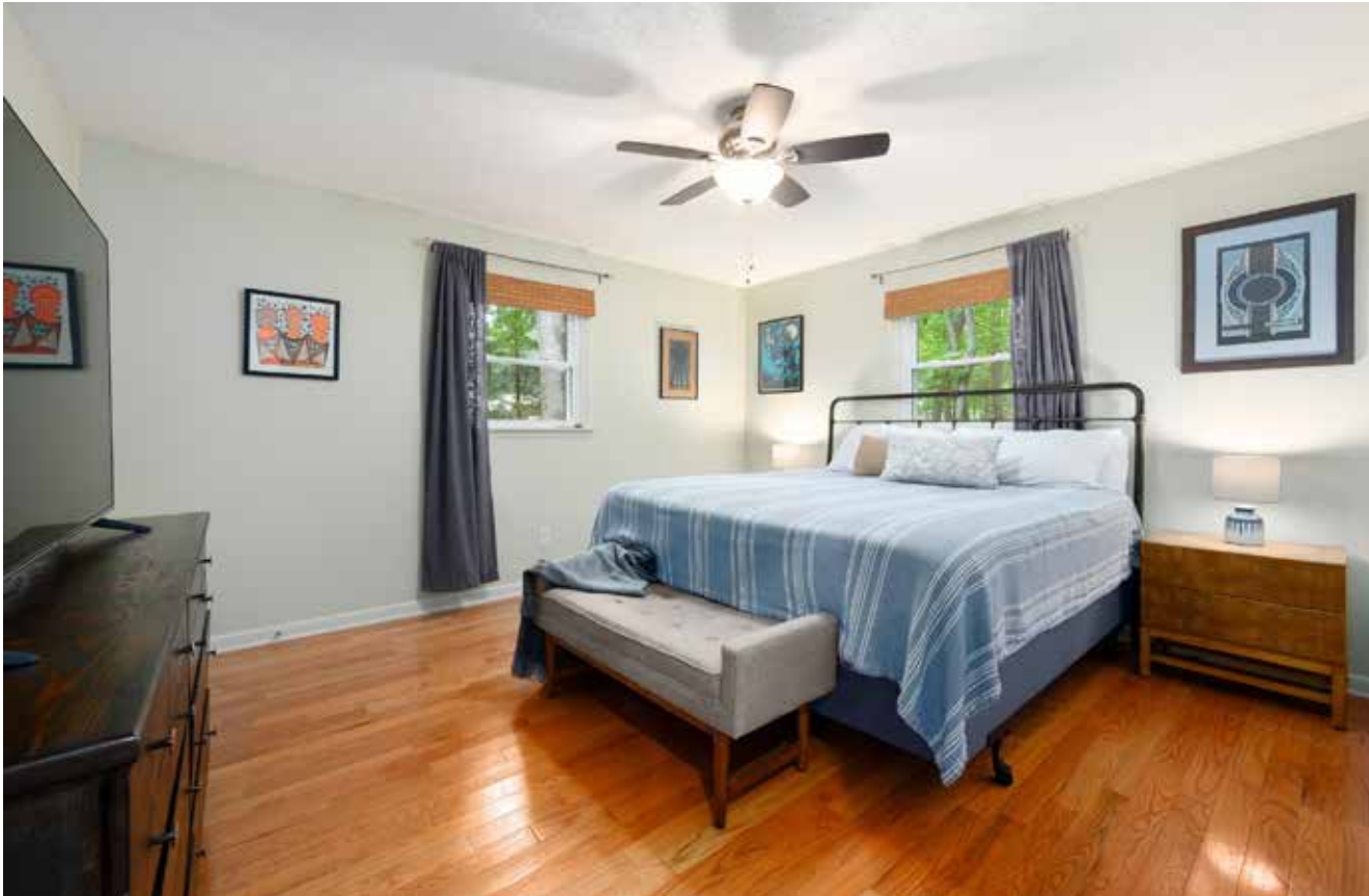
Primary Bedroom Features Ensuite Full Bathroom