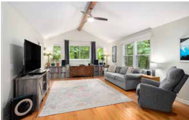
Space for Entertaining