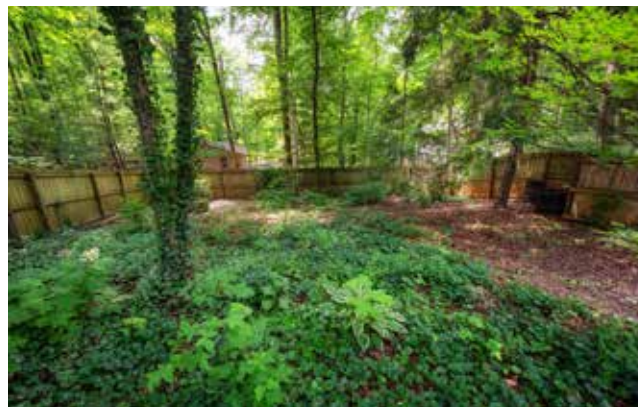
Huge and Fully Fenced Back Yard