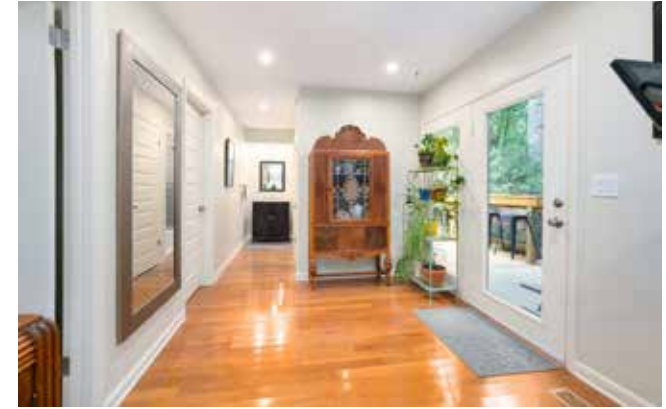
Bright Second Foyer (Back Deck Access)