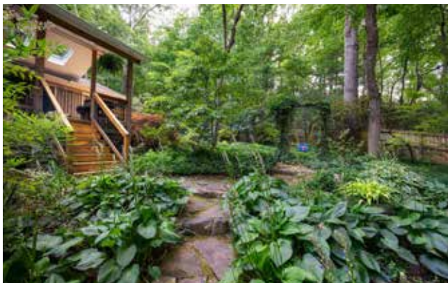
Bursting with Summer Foliage