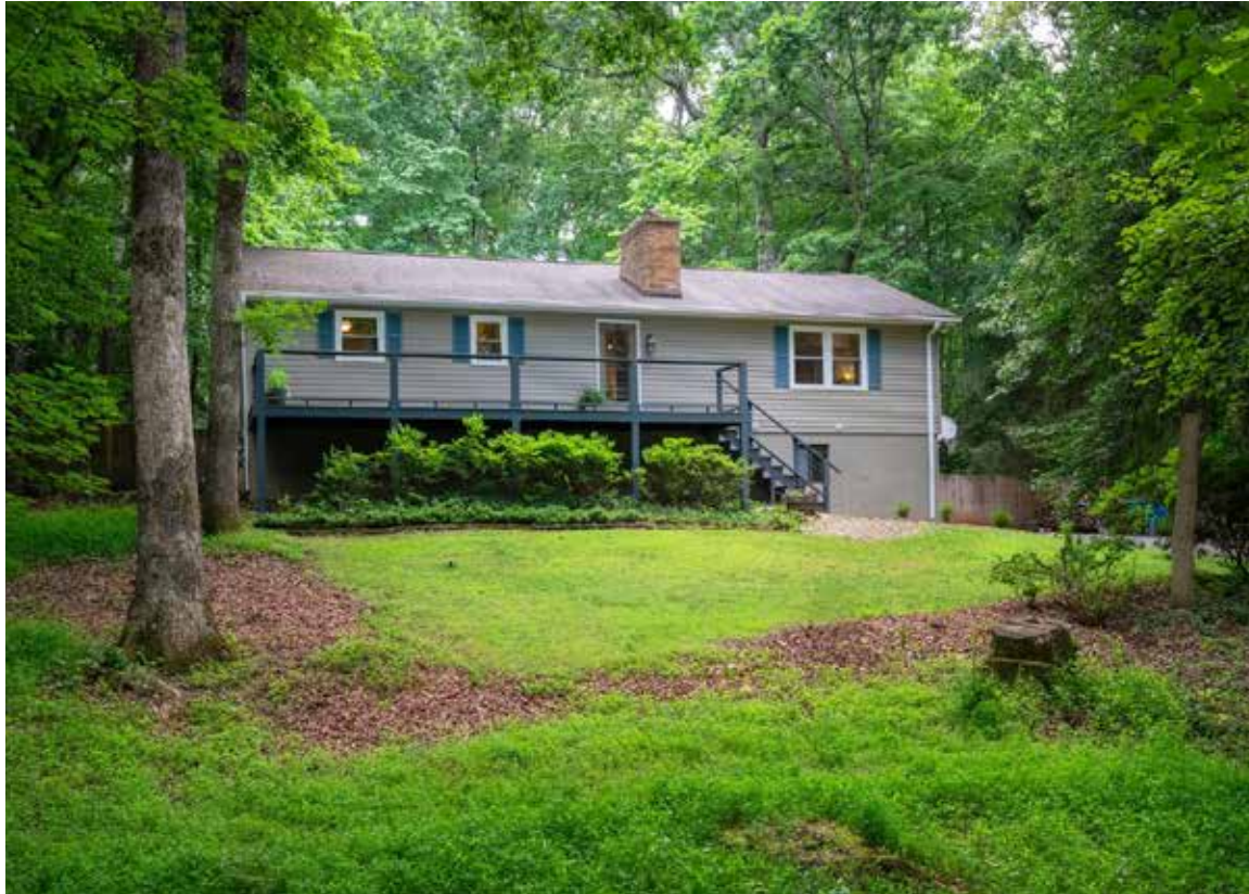
Durable Siding and Architectural Shingles • Located in a Quiet Neighborhood on a No-Through Street

Spacious Arden home on a large lot in Riverview Acres. Located on a no-through road and nestled between Asheville and Hendersonville, Riverview Acres boasts quiet streets, plus excellent proximity to many South Asheville amenities and two French Broad River parks (Glen Bridge River Park and Cocoran Paige River Park). Healthy outdoor living includes an amazing, fully fenced back yard, covered back deck with vaulted ceiling and skylights + sunny patio with custom-built bar, and a multitude of areas for gathering. Convenient main-level living features a spacious living room, chef's kitchen, large dining area, and bright primary suite. Hallway connects two more bedrooms and two full bathrooms. Finished basement (non-HLA), ready for entertaining, also has a laundry room and lots of great storage. Attached two-car garage with space for tool + toy storage, and plenty of extra parking.