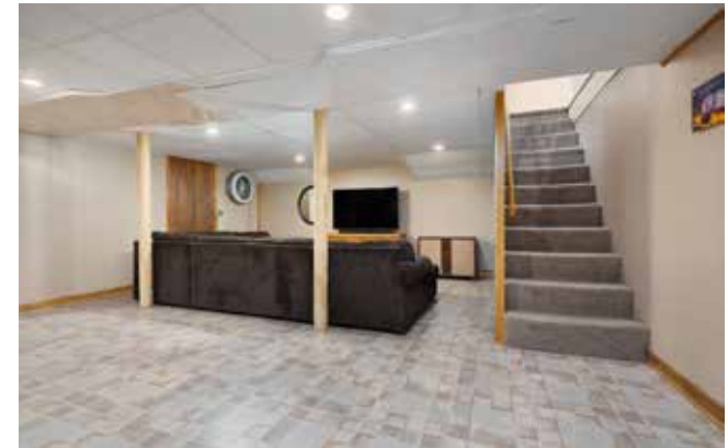
Recreation Room in Basement