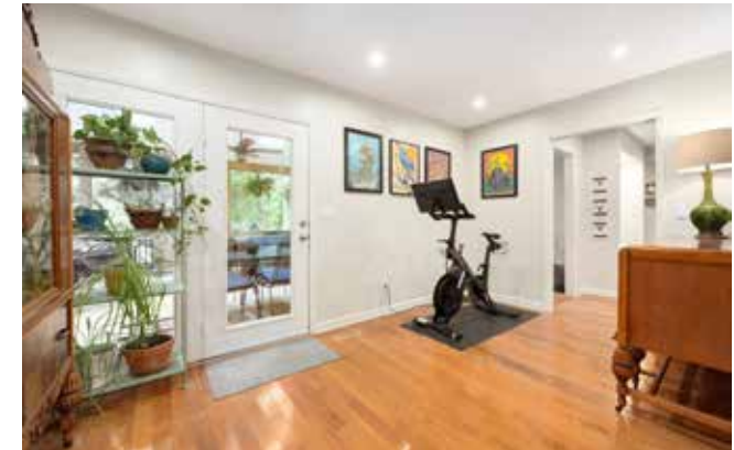
Gleaming Hardwood Floors