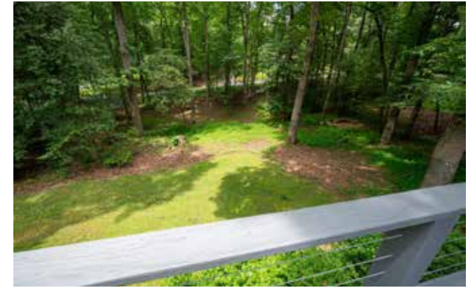
Soaring, Mature Trees Shade the Home