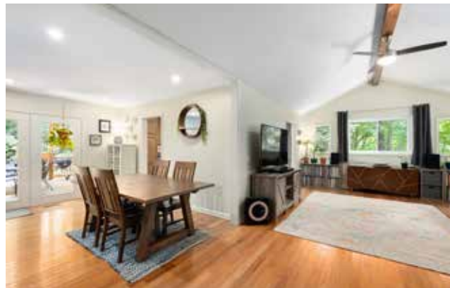
Open, Flowing Floor Plan