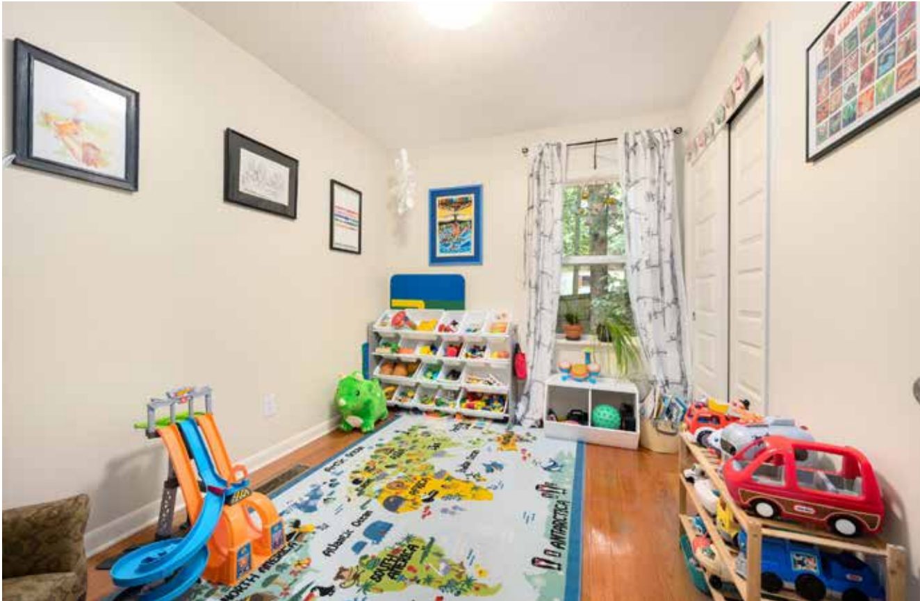
Bonus Room Could Make a Great Home Office