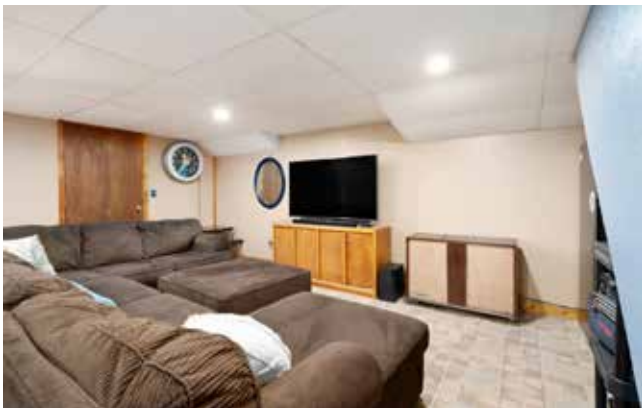
Great Space for Relaxing