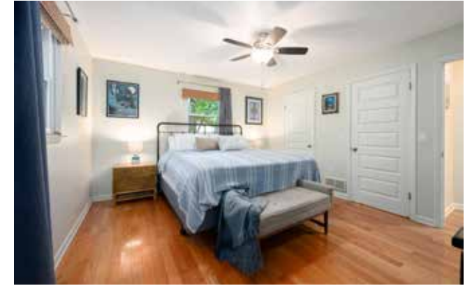
Two Closets in Primary Suite