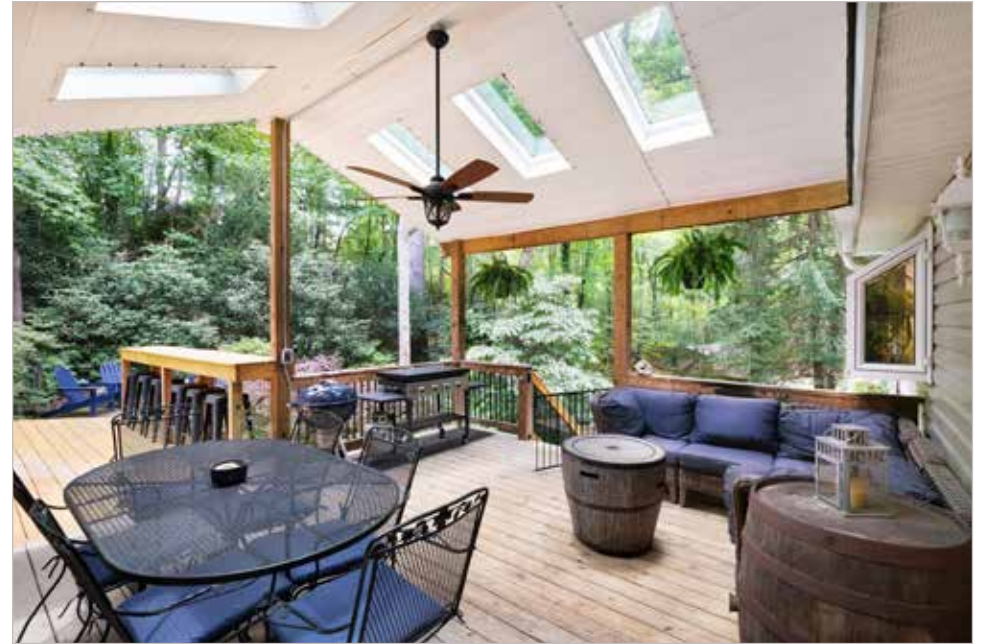
Back Deck with Vaulted Ceiling and a Multitude of Skylights