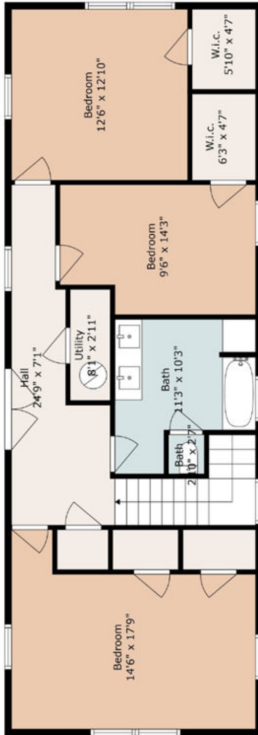
MAIN HOUSE: UPPER LEVEL