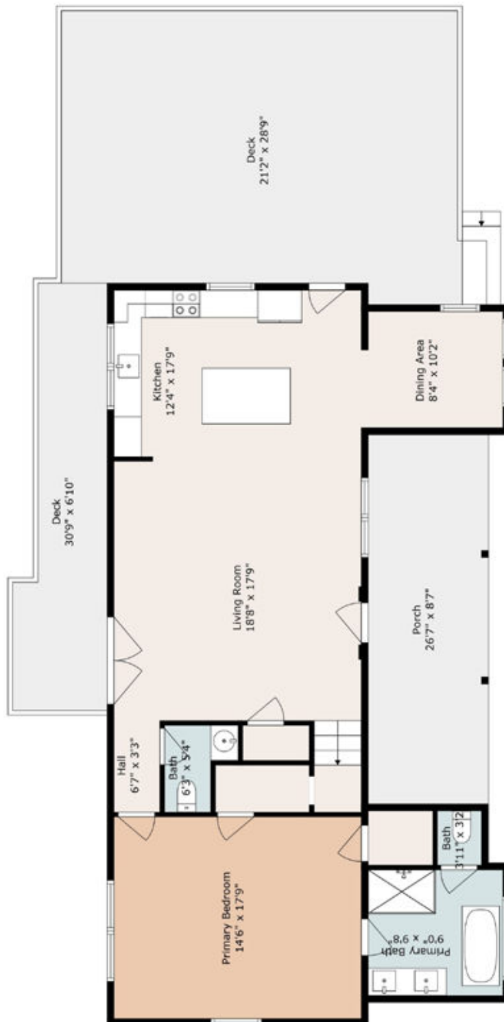
MAIN HOUSE: MAIN LEVEL