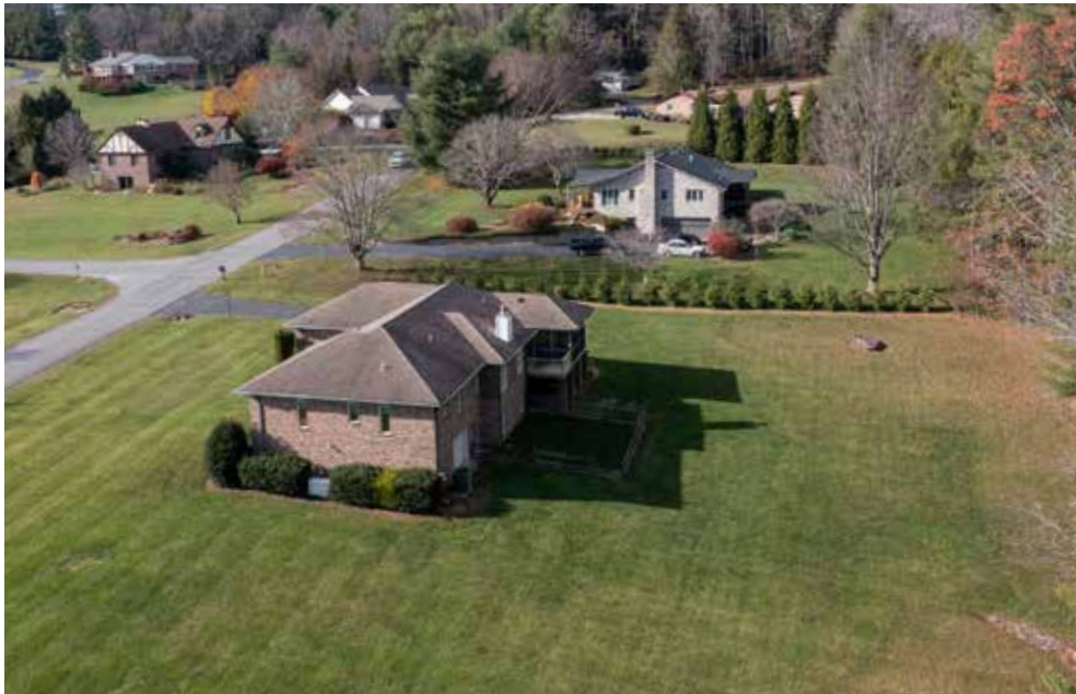
In a Gorgeous Location ...