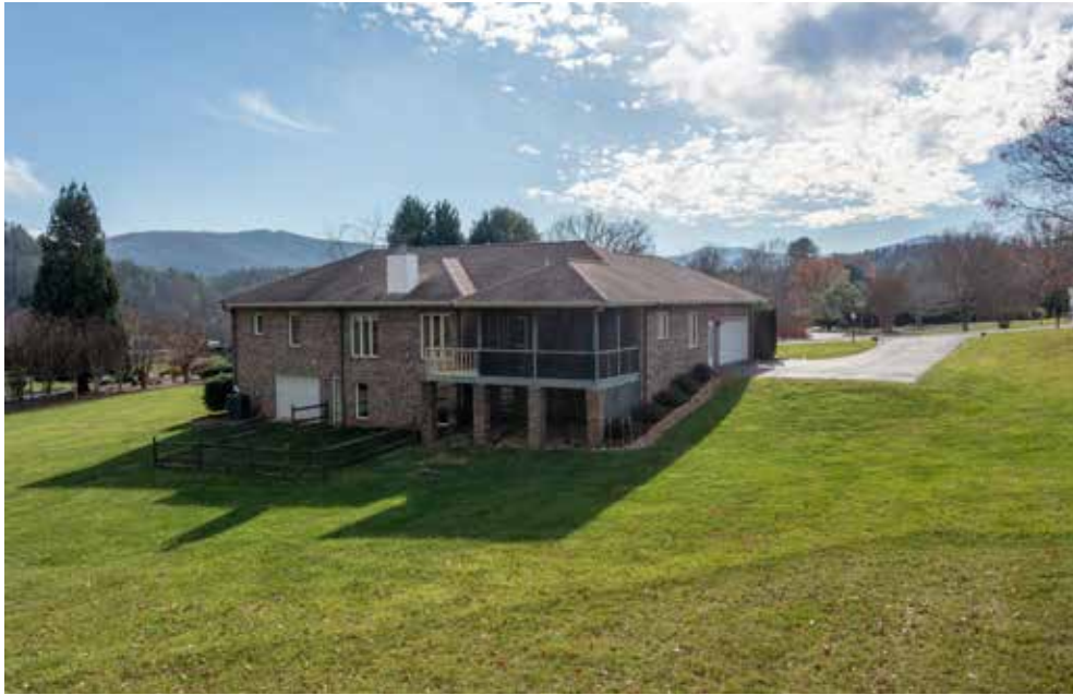
Built Like a Tank!