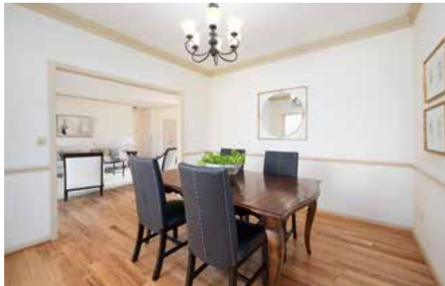
Living Room Opens to Formal Dining Room