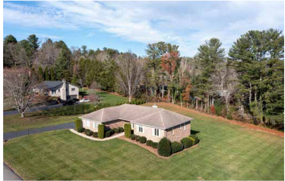
On a Large Sunny Lot