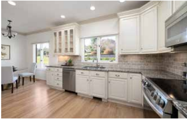
Spacious Kitchen ...