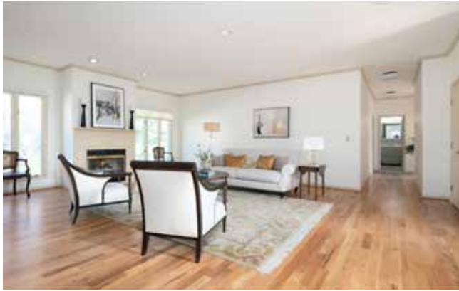
Spacious, Light-Filled Living Room