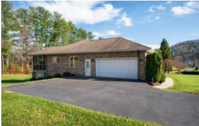
Lots of Driveway Parking, Too