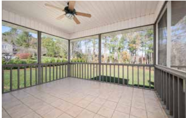
Large, Screened-in Porch