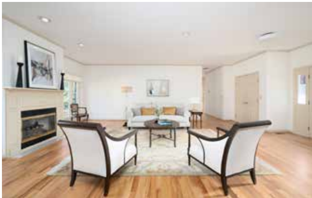
Airy and Bright