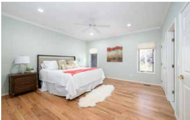
Spacious Primary Suite