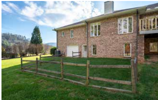
Fenced Area for Pets