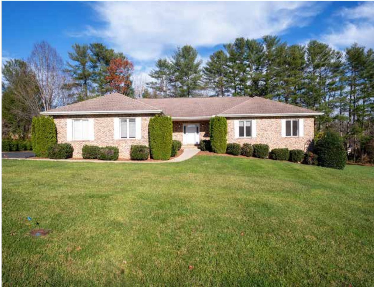
Welcome to 14 Beaumont Drive!

Exceptional property in Beaumont Estates on a 1.15-acre, mostly level lot. Recent HVAC replacement, deck, kitchen appliances, refinished floors, and popcorn ceilings removed throughout. Excellent layout features a spacious living room with a gas fireplace, a formal dining room, three bedrooms, 2.5 bathrooms, an eat-in kitchen, and a laundry area, all on the main level, with nine-foot ceilings throughout. Big windows, light and views! Relax in the large primary suite with a dual vanity and step-in shower. Huge basement offers a full bathroom, a family room, and bonus rooms, including a workout room with a new gym floor, a workshop with a garage door, and tons of storage space. Screened-in porch for enjoying mild, sunny days. Other great features include a whole-house generator, a central vac, an oversized garage with extra storage cabinets, and a large driveway that can accommodate parking for multiple cars.