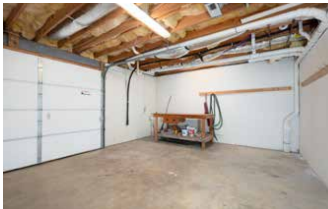
... and Its Own Garage