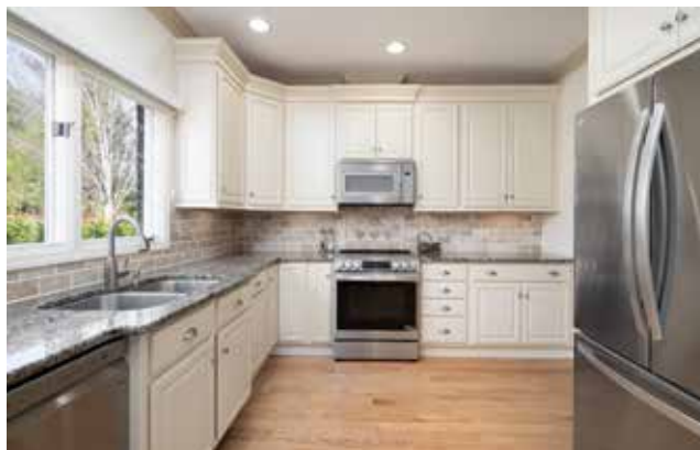
... with Tons of Cabinets and Countertop Space ...