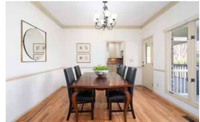
Dining Room with Porch/Deck Access