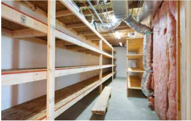
Tons of Storage in Basement and throughout Home