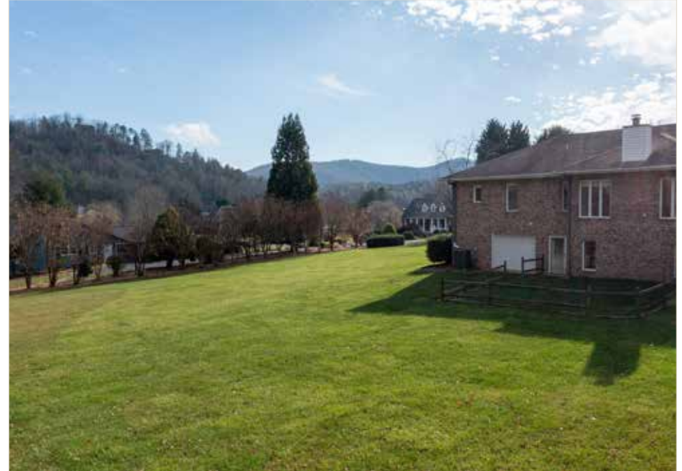
Surrounded by Mountain Views