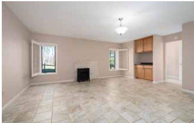
Basement Includes a Family Room ...