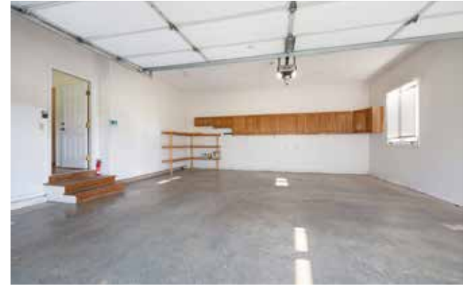
Lots of Extra Storage