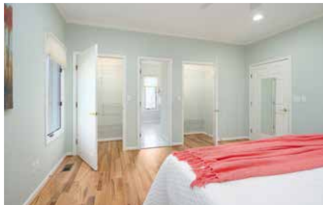
Ample Closets Throughout