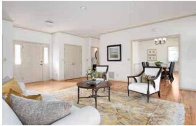
Nine-Foot Ceilings throughout Main Level