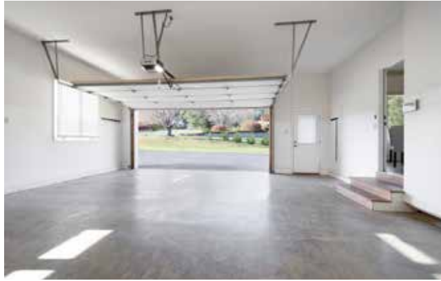
Oversized Main-Level Garage