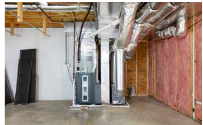
New HVAC Unit