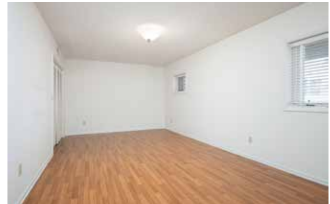
... a Workout Room with a New Gym Floor ...