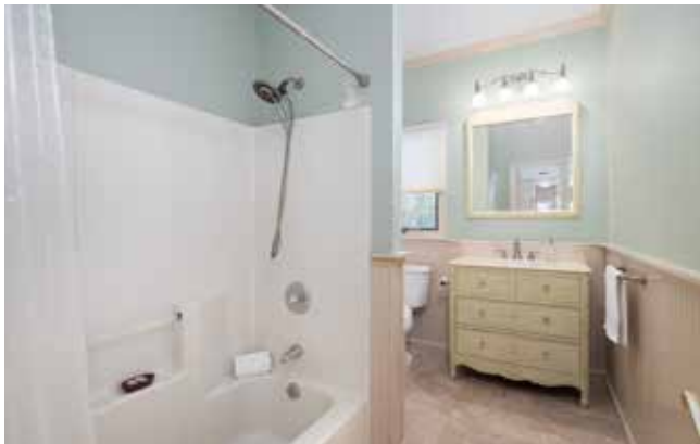
Secondary Full Bathroom