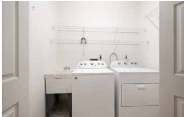
Main Level Also Features a Laundry Area and ...