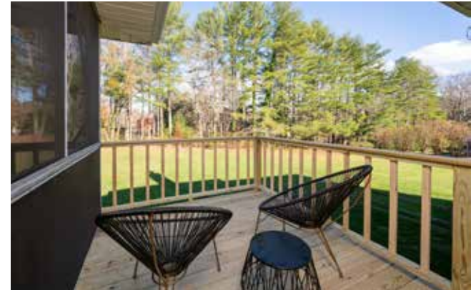
Newly Rebuilt Deck, Perfect for Morning Coffee