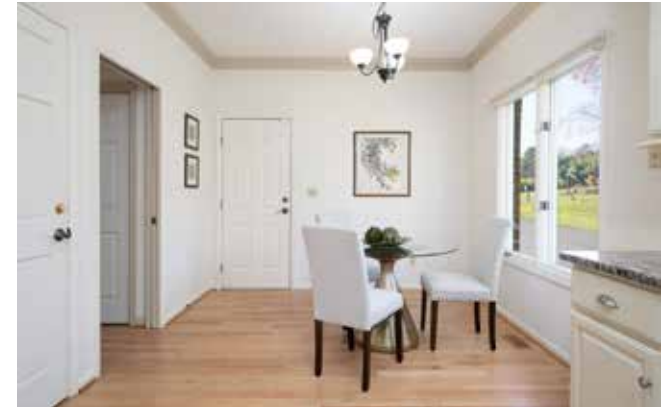
... and a Breakfast Nook ...