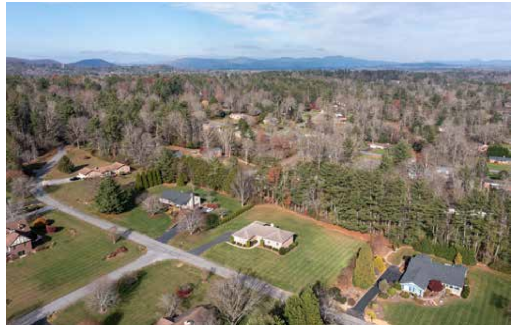
... with Room to Breathe