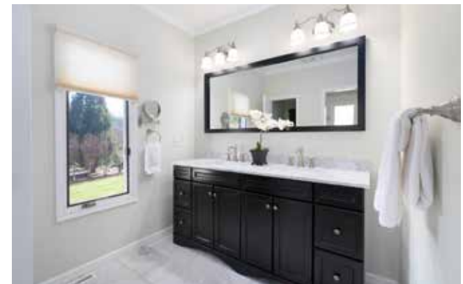
Dual Vanity in Primary Suite Bathroom