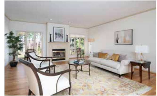
Gas Fireplace for Chilly Weather