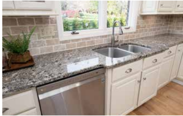
... Offers Granite Countertops ...