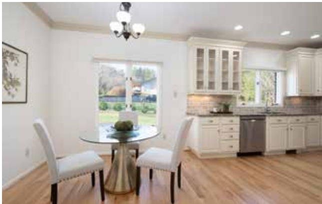
... with Lots of Light and a Lawn View