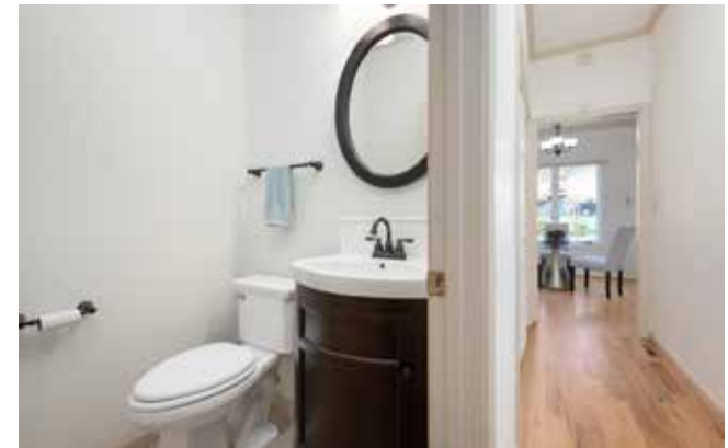
... a Conveniently Located Powder Room