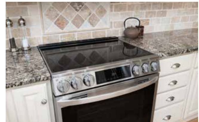
... and Newer Kitchen Appliances