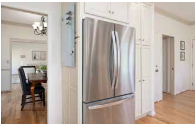
Formal Dining Room Is Also Adjacent to Kitchen ...