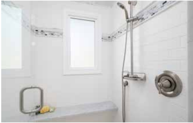
Beautiful Tile Work in the Primary Shower