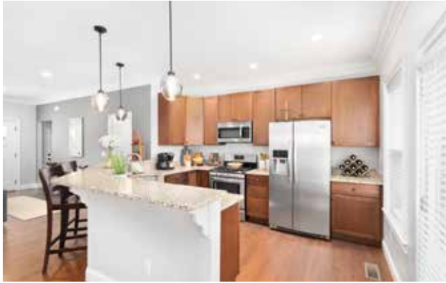
Kitchen with Gas Range