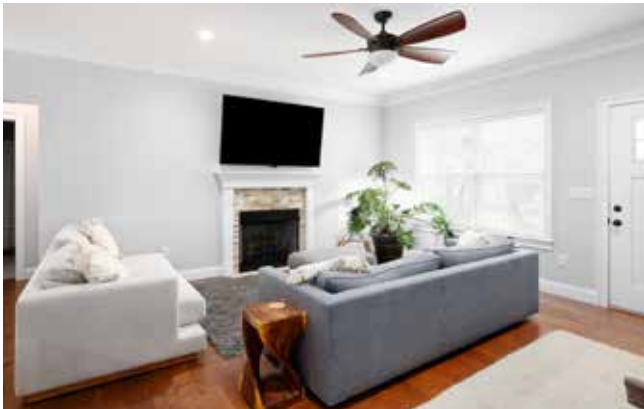
Living Room with Gas Logs