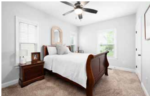
Front Guest Room