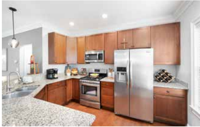
Lots of Countertop Space