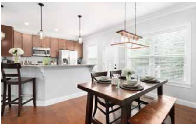
Dining Area Is Adjacent to Kitchen