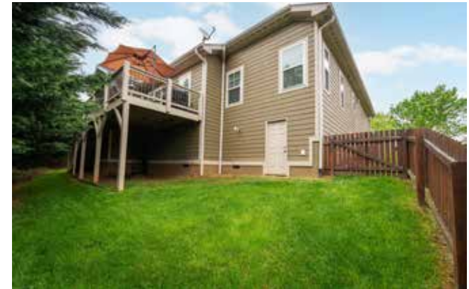
Fenced-in Backyard with Crawl Space Access