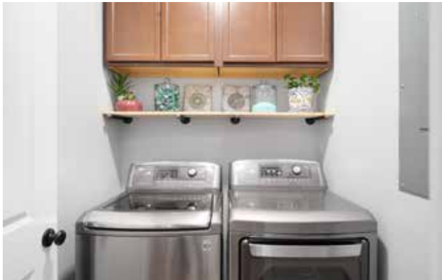
Laundry Room with Storage Cabinets