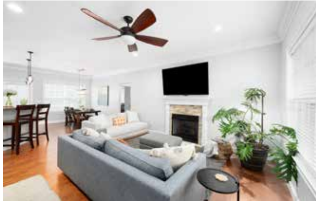
Open-Concept Floor Plan