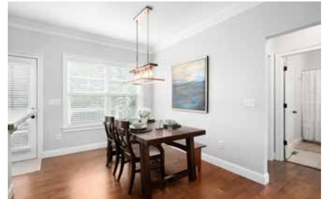
Dining Area with 9-Foot Ceilings