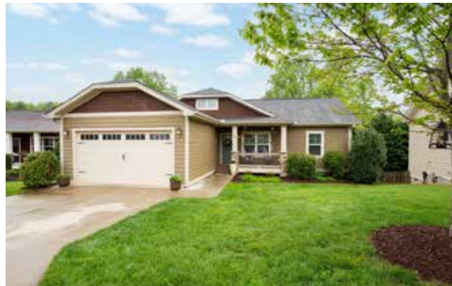
Covered Front Porch

46 ASHER LANE Immaculately Maintained Cottage Arden, NC 28704