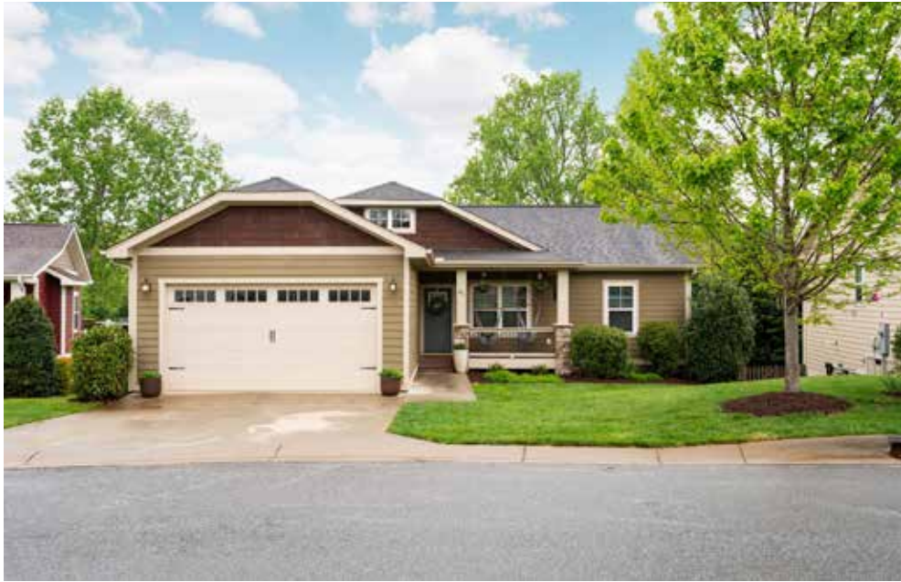
Level Yard with Mature Landscaping