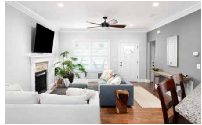
Living Room with Wood Floors