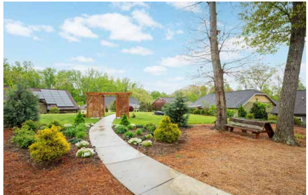
Community Sidewalks for Leisurely Strolls