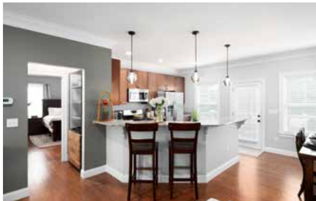
Bar Top-Style Counters

46 ASHER LANE Immaculately Maintained Cottage Arden, NC 28704