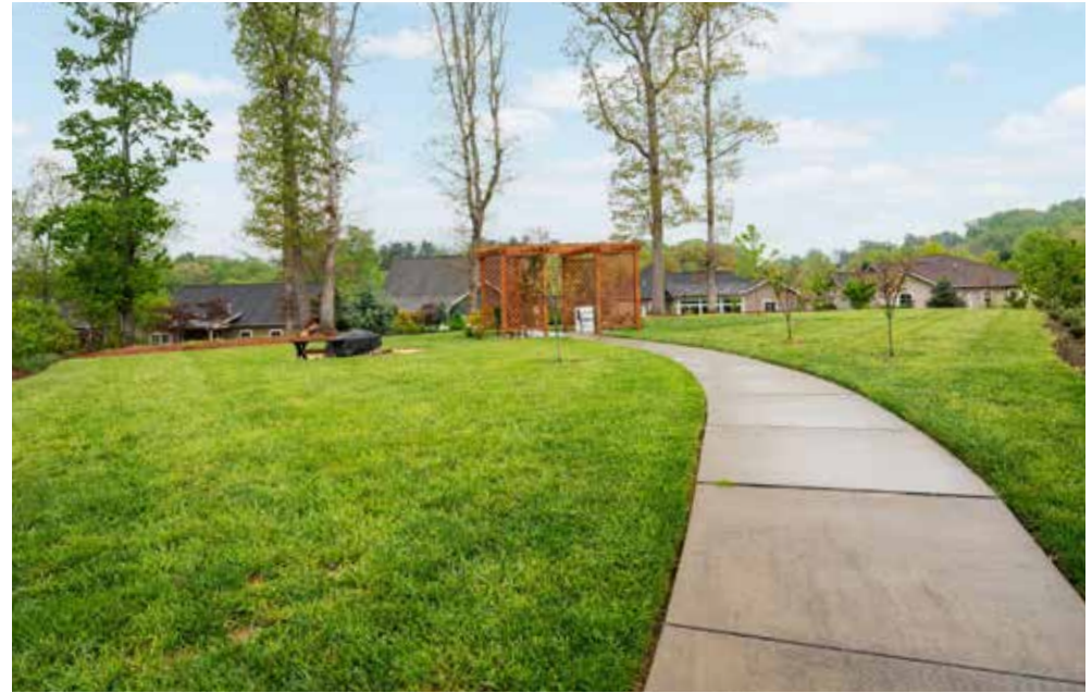
Shared Green Space with Fire Pit