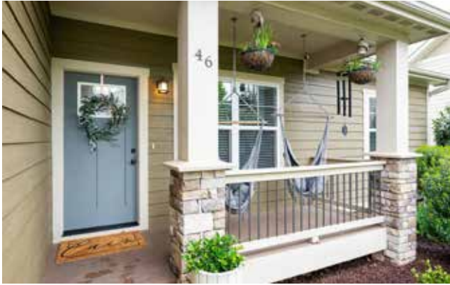
Covered Front Entry