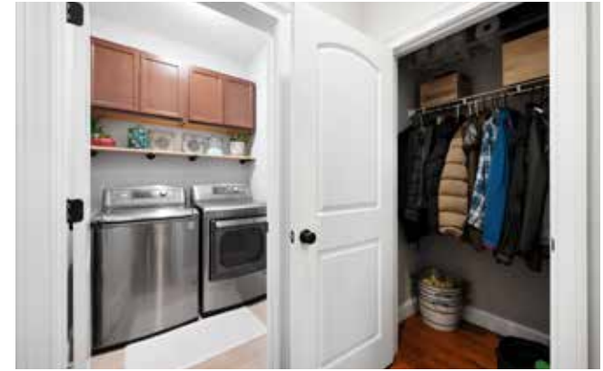
Large Coat Closet