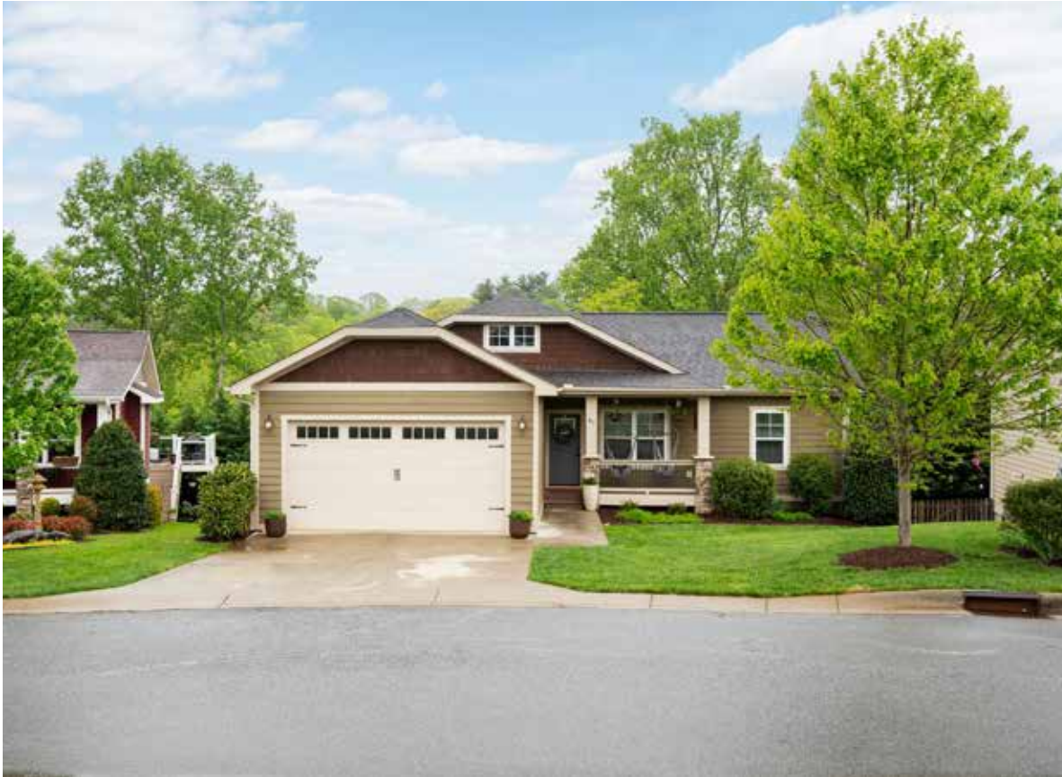
Beautiful Cottage with Two-Car Garage

Come see this immaculately maintained home in The Cottages of Glenn Oaks neighborhood. The open floor plan offers a large, modern kitchen with granite countertops, stainless steel appliances, a gas range and a spacious dining area. The main living space features engineered wood floors, a natural gas fireplace, and lots of daylight. The primary bedroom boasts a walk-in closet and ensuite bathroom with a double vanity. Enjoy coffee or entertain guests on the private back porch which connects to the fenced-in back yard. This home also has ample storage in the two-car garage, as well as the standing-room crawl space accessed from the back of the home. Don't miss this incredible move-in-ready home convenient to Biltmore Park and all south Asheville has to offer. Neighborhood has shared green space and a fire pit, plus sidewalks and streetlights for evening walks.