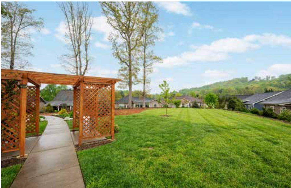
Neighborhood Amenities Include Pergolas with Bench Seating