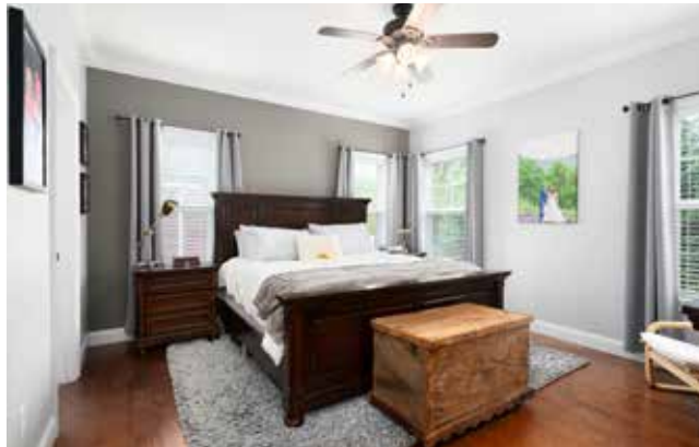
Large Primary Bedroom Suite