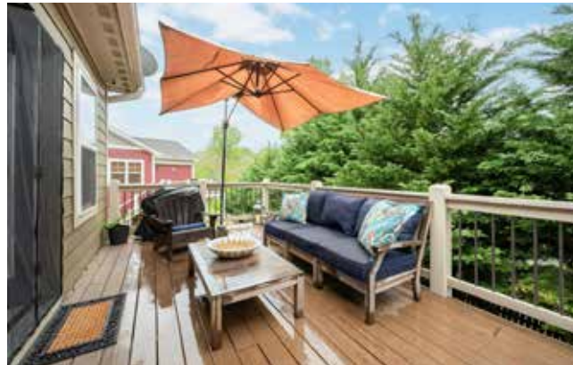
Private Back Deck