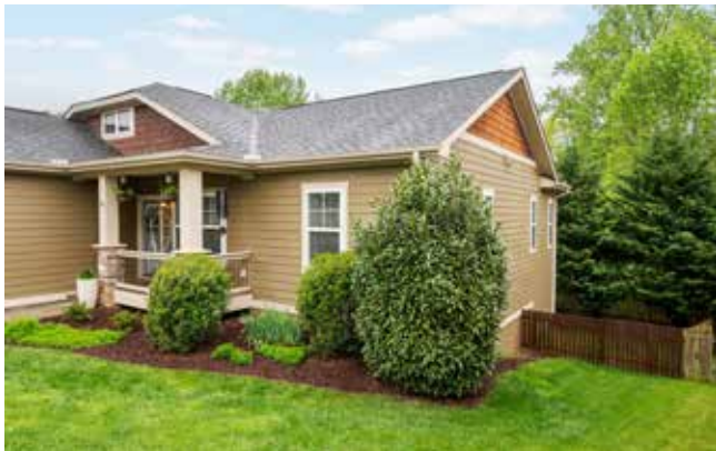
View of the Fenced-in Backyard from the Front