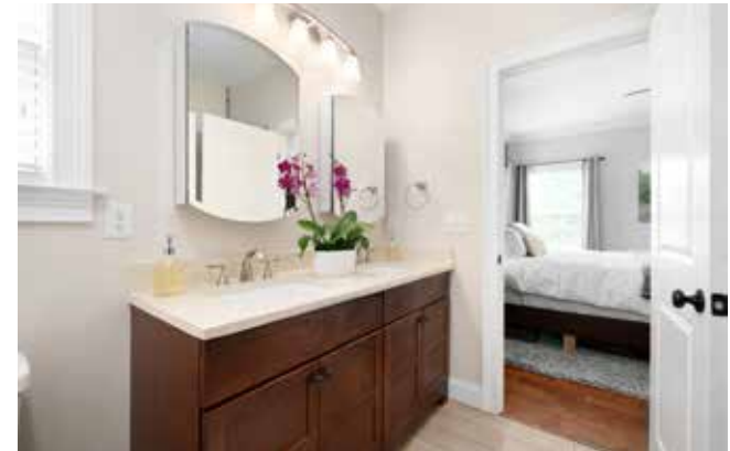
Ensuite Bathroom with Double Vanity