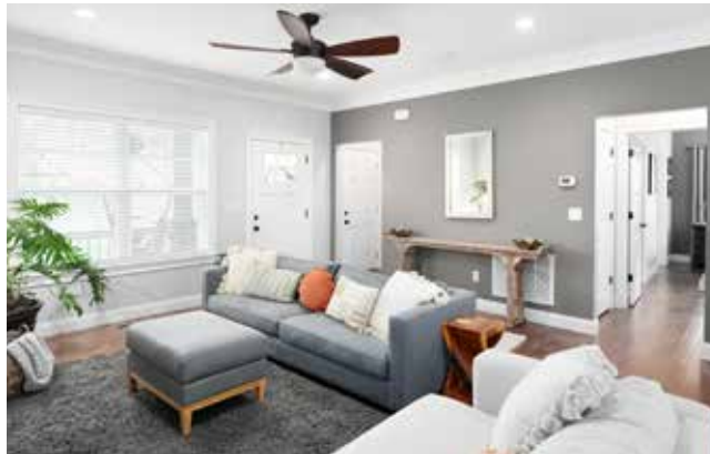
Lots of Natural Lighting