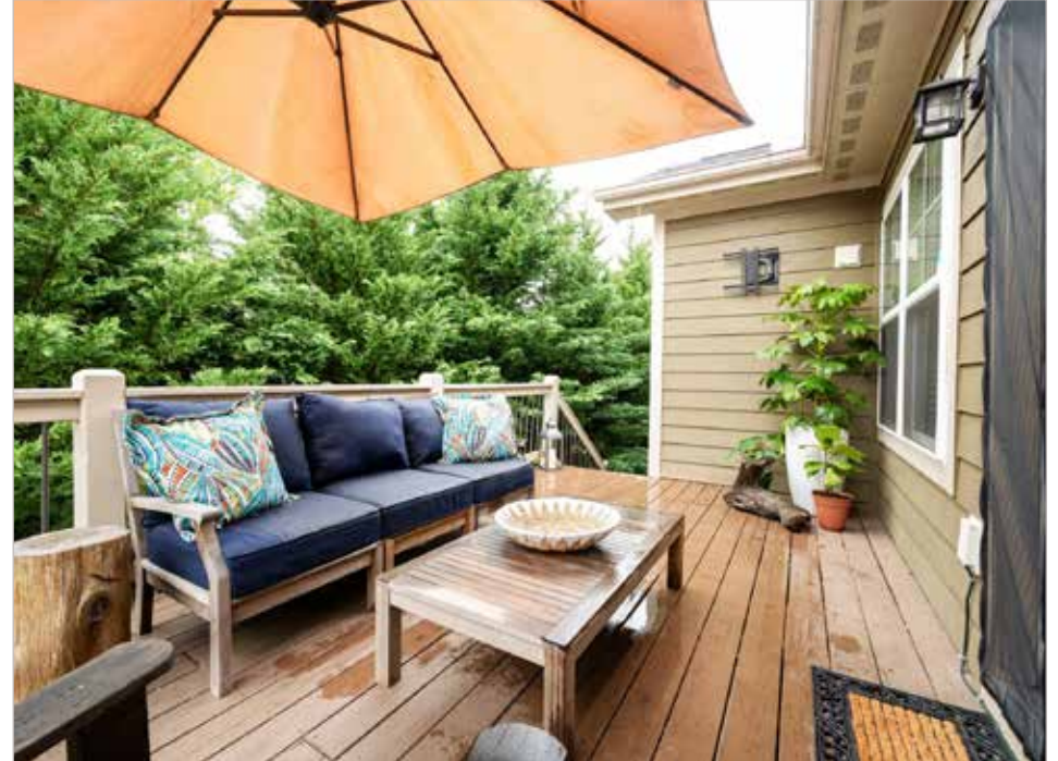
Private Back Porch with Yard Access