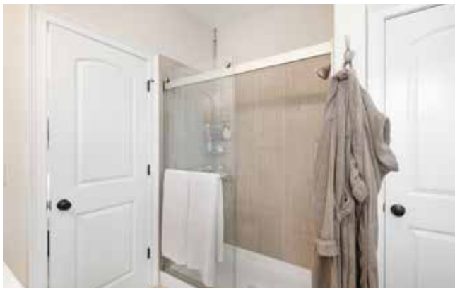
Tiled Shower/Tub Enclosure