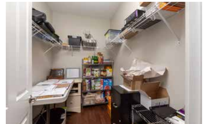
Large Closet with Ample Storage