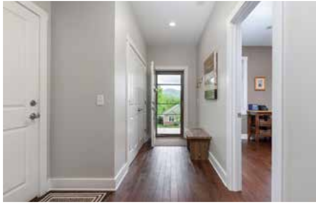
Entryway with a View