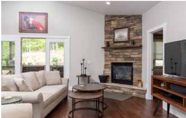
Gas Log Fireplace with Rock Veneer