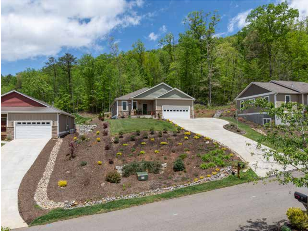
Cozy Bungalow, Perched on the Knoll

Welcome to Bee Tree Village Cliffside, a peaceful neighborhood nestled in the Swannanoa Valley. This well-maintained gem boasts year-round views, and is located just ten minutes from Black Mountain and fifteen minutes from downtown Asheville. You will love sitting on your front porch and enjoying the breathtaking Appalachian Mountain views. Tucked away in the Bee Tree Community, this house combines low-maintenance, one-level living in a peaceful mountain setting. This home is equipped with stainless steel appliances, granite countertops in the kitchen and bathrooms, and a new tankless hot water heater. The main living/dining room opens up to the screened-in back porch, a perfect area to kick back and relax. The newly installed full-sun raised beds are perfect for a summer vegetable and/or flower garden. The two-car garage has additional built-in storage. Enjoy the amenity of the exterior lawn care, provided by the neighborhood HOA.