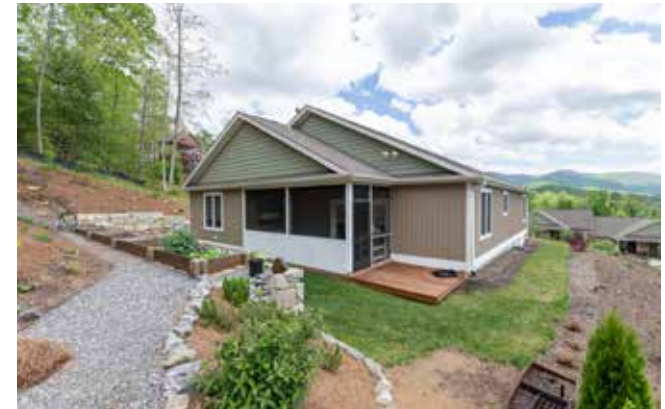
Back Yard with Long-Range Views