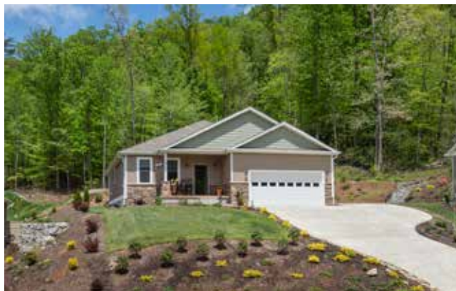
Well-Maintained Front Yard • Extra Parking in Driveway