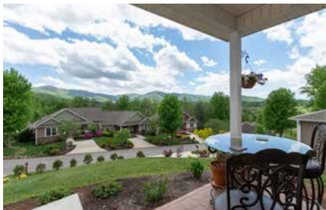
Stunning Front Porch Short- and Long-Range Views