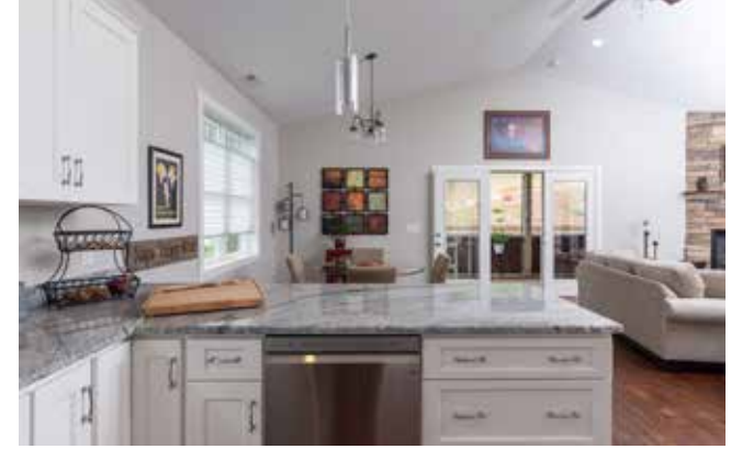
Indoor/Outdoor Living with Direct Patio Access