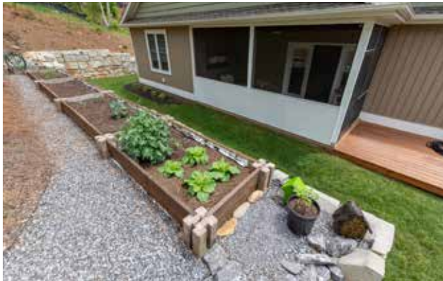
Full-Sun Gardening Area