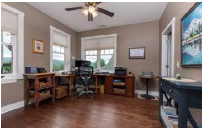
Office or Bedroom with Breathtaking View