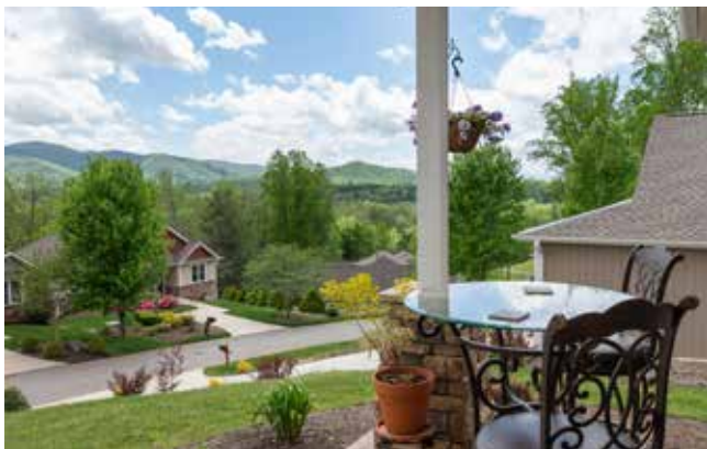
Enjoy Coffee with a View from the Covered Front Porch