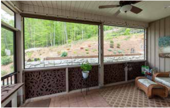
Screened-in Porch Overlooks Raised Garden Beds