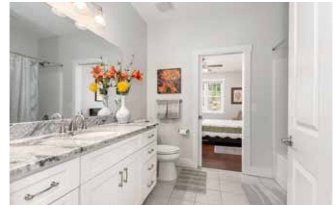
Large Full Bathroom with Hall and Bedroom Entrances