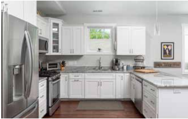
LG® Stainless Steel Appliances with Gas Oven/Range