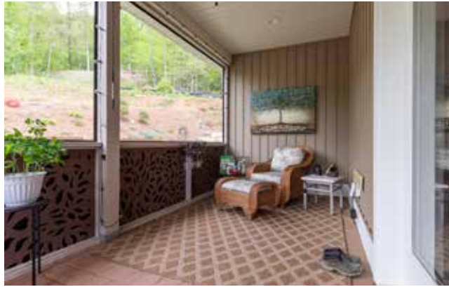
Relax in Bug-Free Comfort