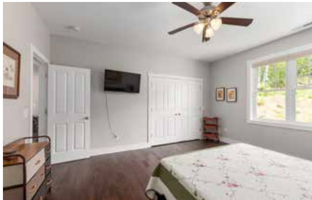
Double Closet • Soft Light from Double-Hung Window