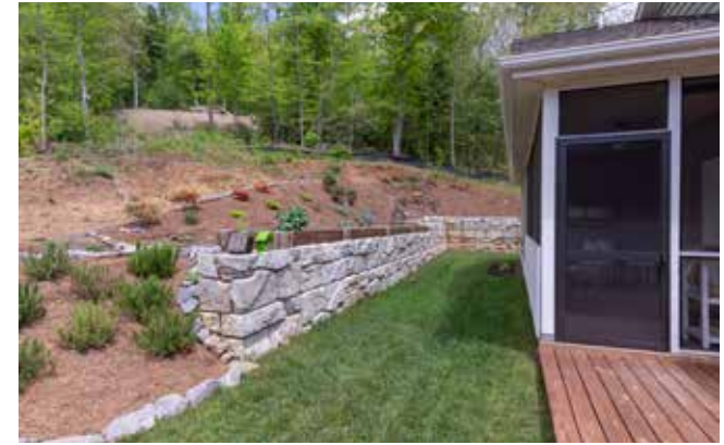
Lovely Manicured Back Yard