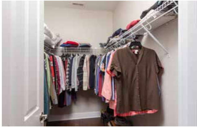
Primary Suite Walk-in Closet