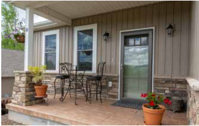
Covered Front Porch