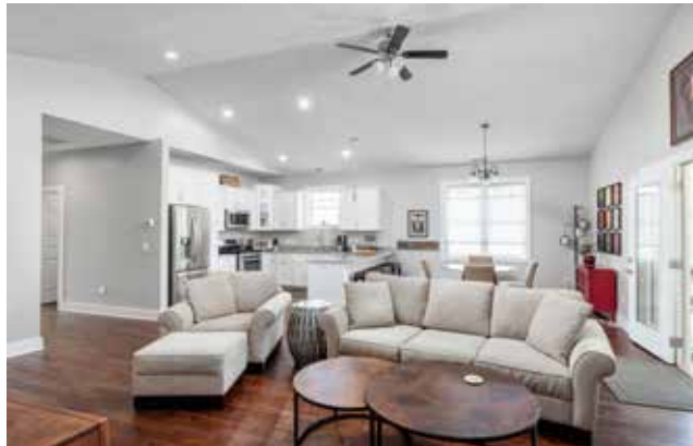
Perfect Space for Entertaining