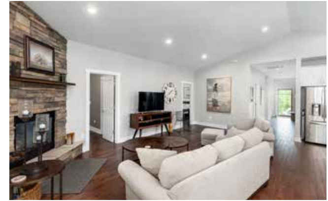
Open Floor Plan Great Room