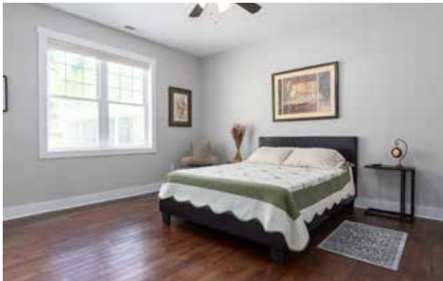
Spacious Guest Bedroom