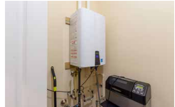
Gas Tankless Hot Water Heater