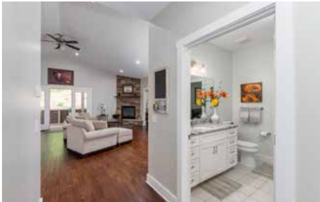
Hall Bathroom Entrance