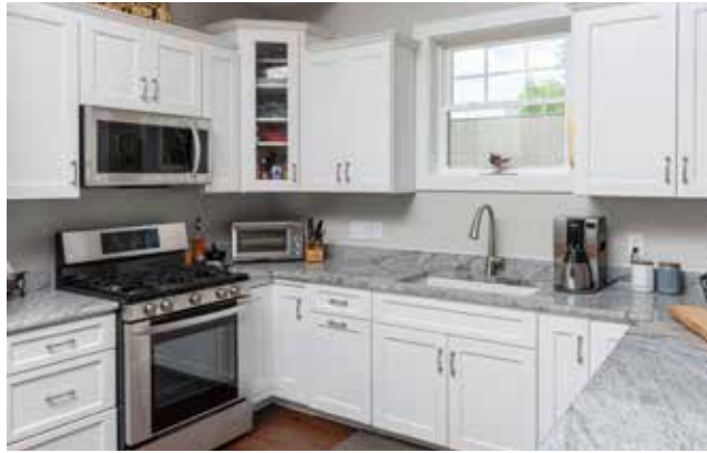
Plenty of Counter Space and Fresh White Cabinets