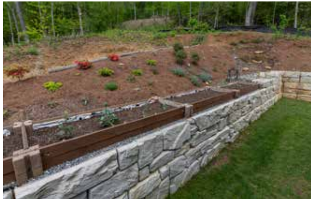
Raised Beds on Retaining Wall Await Your Green Thumb