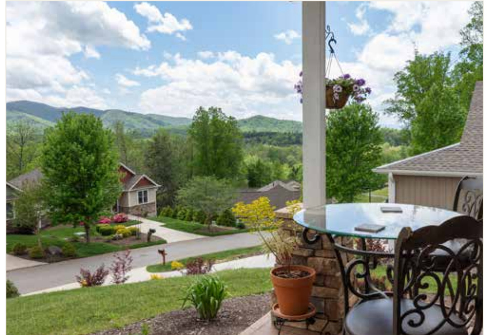
Breathtaking Vistas from the Covered Front Porch