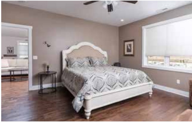
Large Primary Suite with Engineered Wood Floors