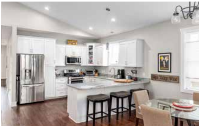
Spotless Kitchen with Breakfast Bar