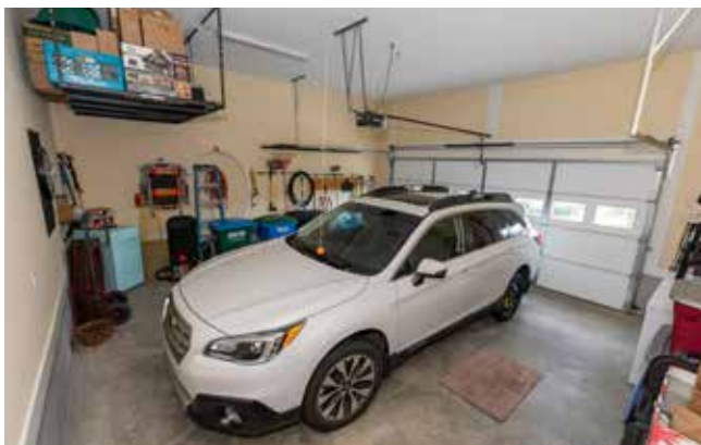
Two-Car Garage with Additional Built-in Storage