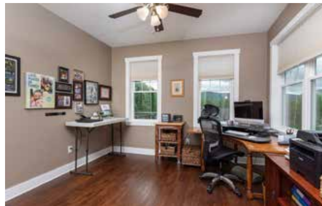
Lovely Office with Mountain Vistas