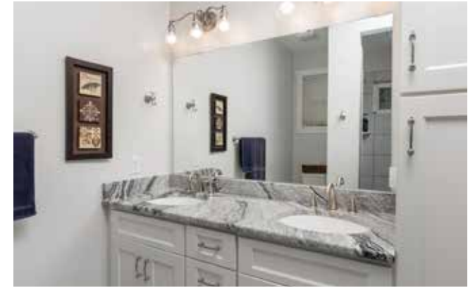
Primary Bathroom with Double Vanity, Walk-in Shower