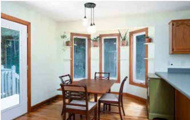
Dining Area with Large Windows