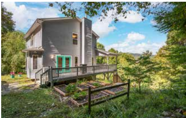
Beautiful Home Nestled in the Mountains