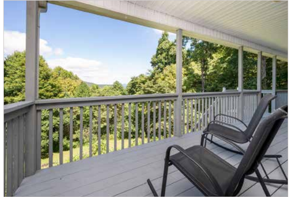
Views from Covered Porch