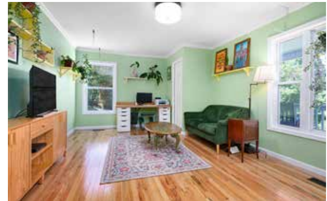
Main-Level Bedroom Converts to Office or Media Room