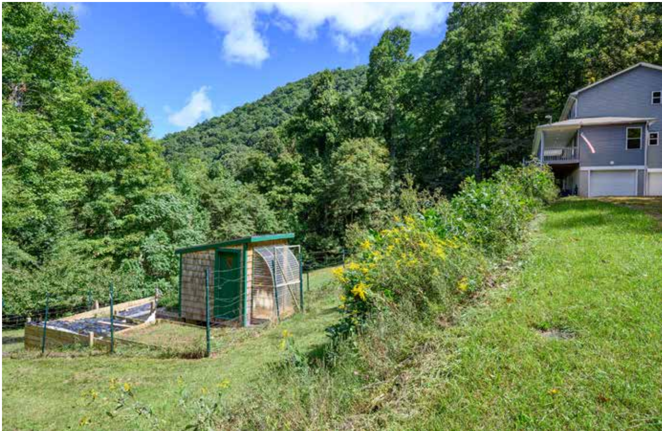
Greenhouse with a View!