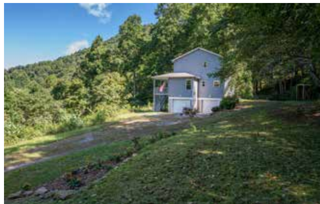
Plenty of Parking