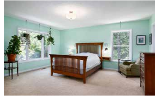
Upstairs is the Primary Bedroom with Walk-in Closet