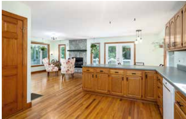
Kitchen Opens to Dining and Living Areas