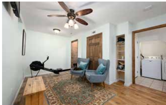
Downstairs Flex Space