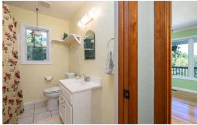
Main-Level Full Bathroom