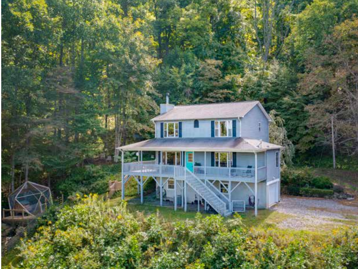
Welcome Home to 1747 Secluded Valley!

Natural light and mountain views bathe this 4BD/3BA home in a cozy section of Little Pine in Madison County. Tucked into a setting with close-up and long-range views, you share the area with Sandy Bottom Trail Rides, Blue Heron Whitewater, and Little Pine Creek. The home's open floor plan includes bedroom options on main and upper levels. Spacious kitchen includes plenty of counter/cabinet space and a walk-in pantry. Enjoy flexspace in the lower level with a full bathroom, garage, and workshop. Mountain views from the main level, as well as two upper level bedrooms. Outdoor living includes a spacious yard, fruit trees, blueberries, raspberries, strawberries, raised beds, greenhouse, duck coop with electric fence, fire pit, and wraparound porch. Other features include tankless hot water heater, hardwood floors on main, and a wood-burning fireplace. Current owners lovingly updated this home in 2017 and it shows! The county and HOA each maintain a portion of the road. No short-term rentals allowed.