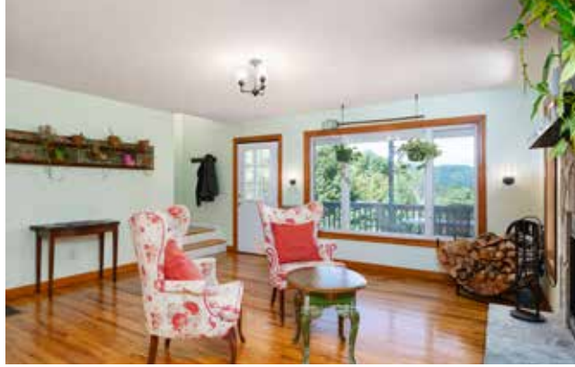
Welcoming Entry into Living Area