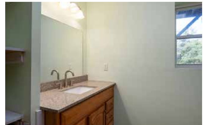
Downstairs Full Bathroom