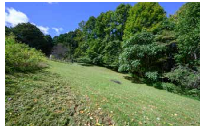
Yard Is Perfect for Gardening, Pets, and/or Kids