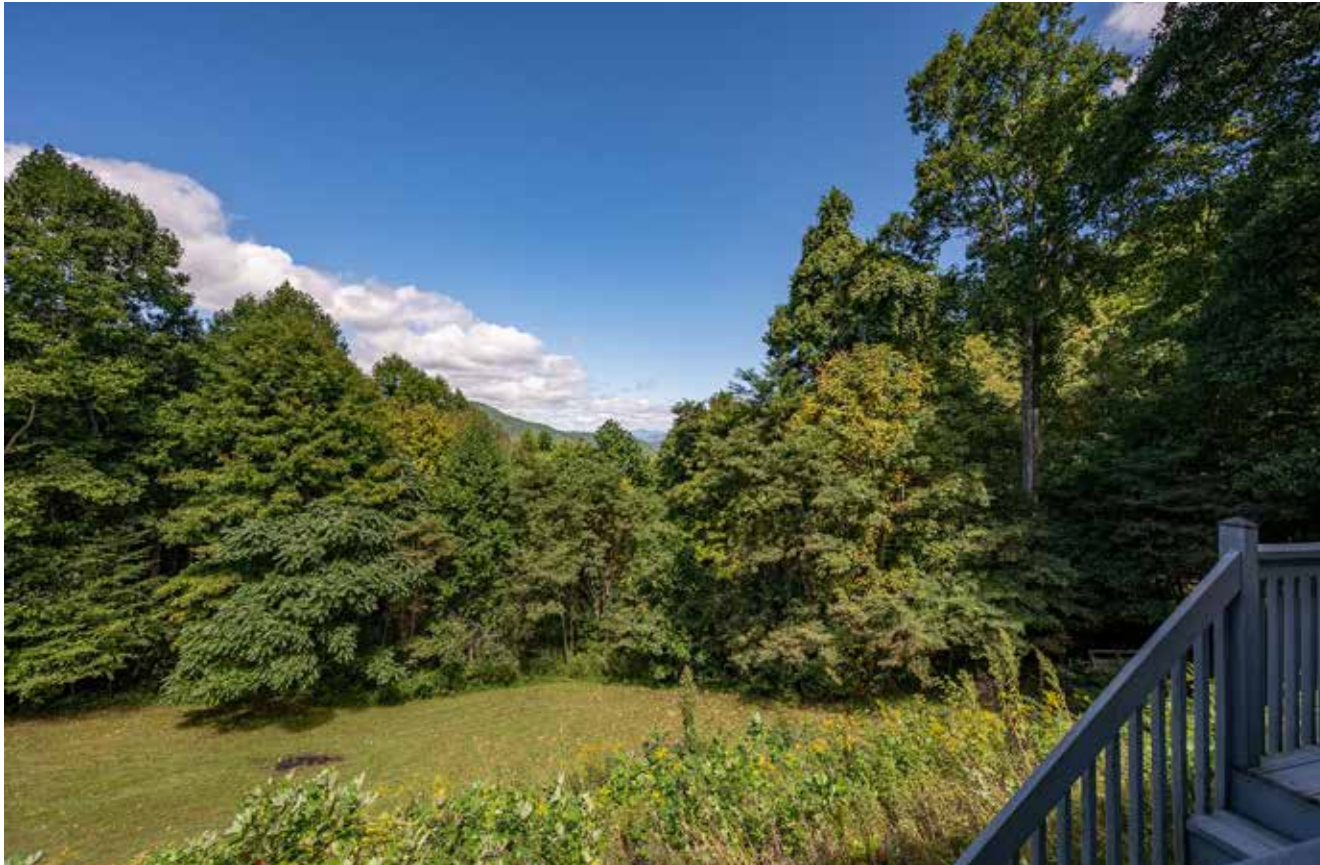
Wooded Setting with Mountain Views