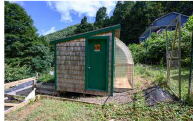
Greenhouse Conveys with Property