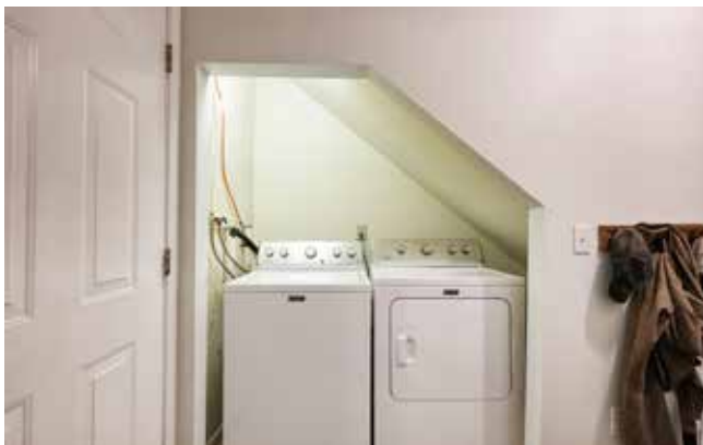
Laundry on Lower Level Under Stairs