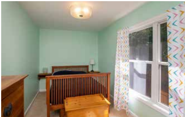
One of Two Guest Rooms Could Double as an Office