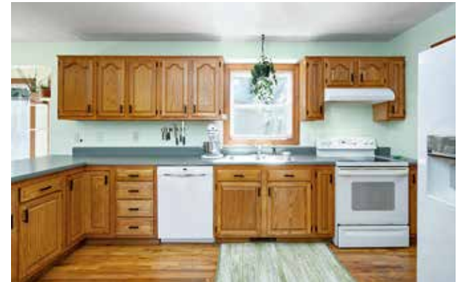
Large Kitchen with Plenty of Cabinet and Counter Space