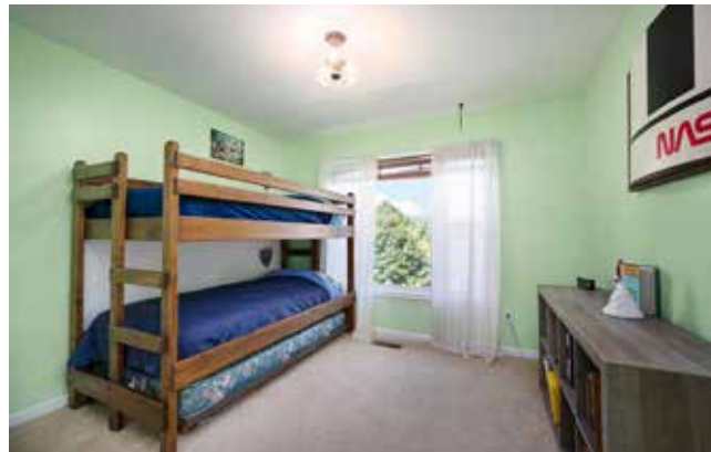
Upstairs Guest Room with Mountain Views