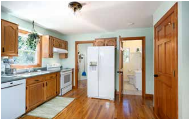
Walk-in Pantry and Full Bathroom off Kitchen