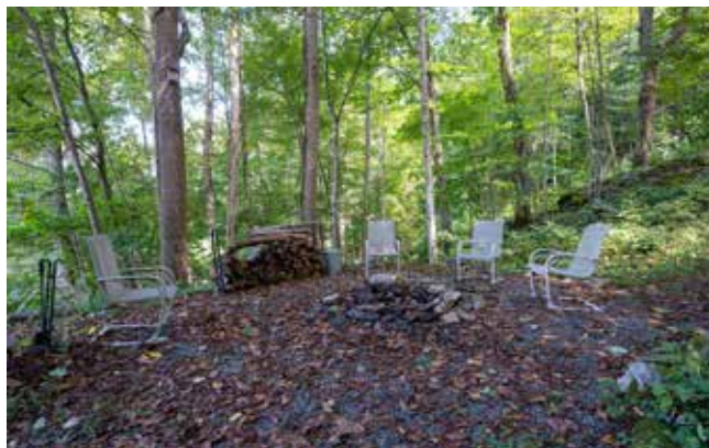
Warm Up Next to Your Fire Pit on Chilly Evenings