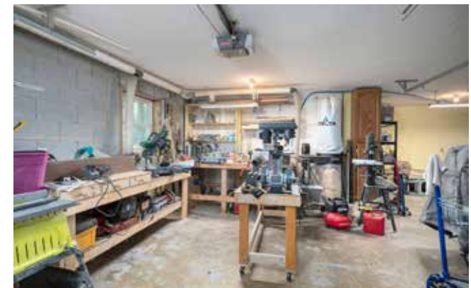
Garage Includes Workshop Space