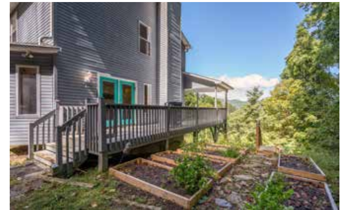
Raised Garden Beds