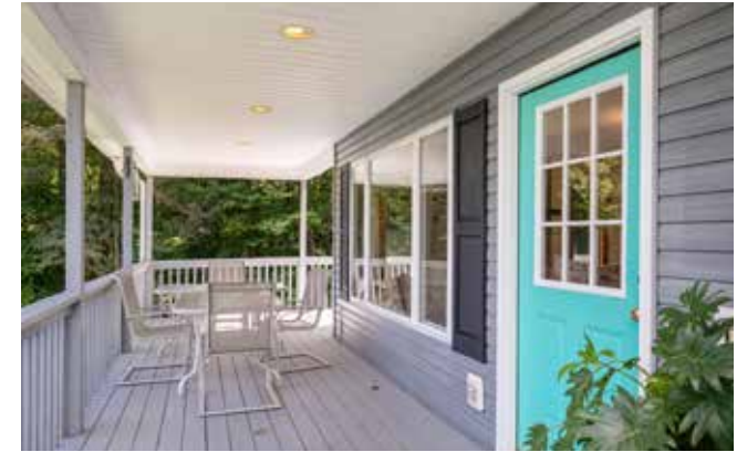
Wraparound Porch Includes a Covered Portion