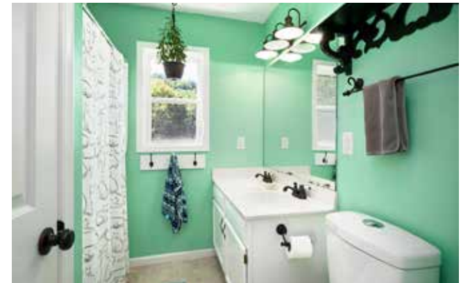
Upstairs Full Bathroom