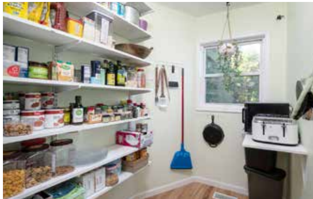
Walk-in Pantry with Plenty of Space