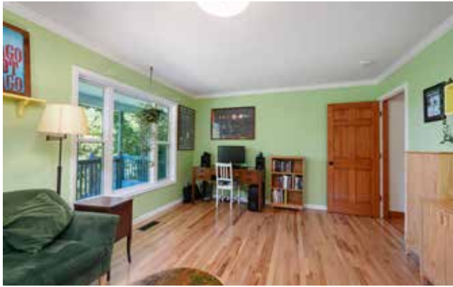
Large Windows with Lots of Natural Light