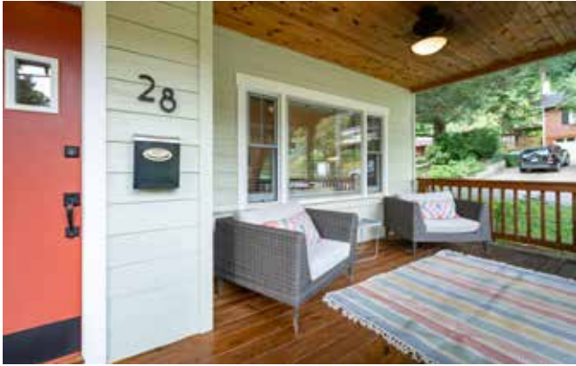
Front Porch with Beadboard Ceiling and Fans