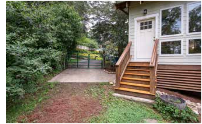
Gate to Rear Yard and Exposed Aggregate Parking Pad