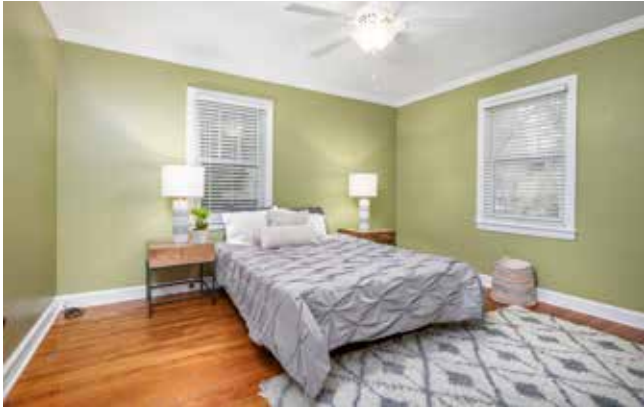
Main-Level Guest Bedroom