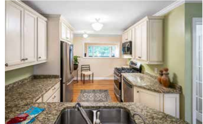
View of Living Room, Front Porch, and Yard Beyond