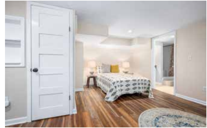
Lower-Level Guest Suite Sleeping Space