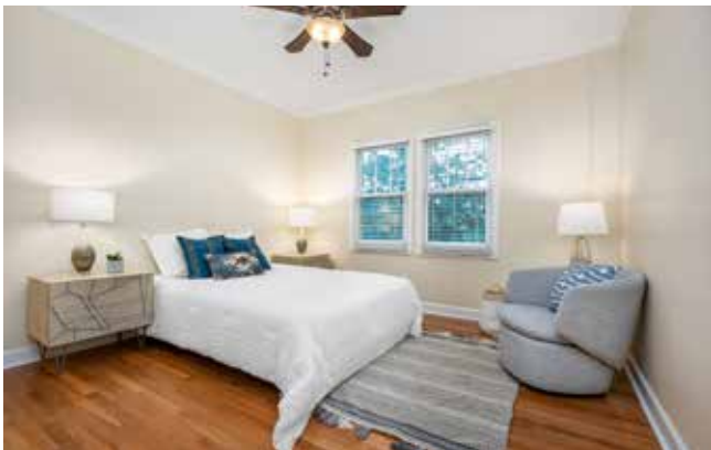
Main-Level Primary Bedroom Suite