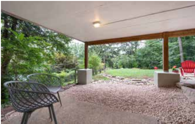
Lower-Level Guest Suite Covered Patio