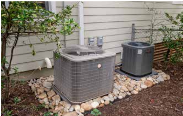
Multiple HVAC Systems