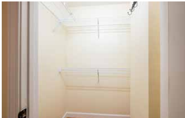
Closet in the Main-Level Primary Suite