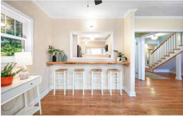
Breakfast Bar with View through Kitchen to Front Window