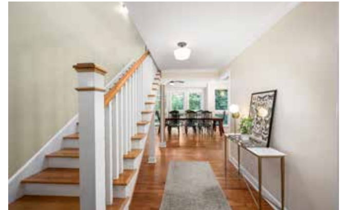
View to Dining Room from Living Room