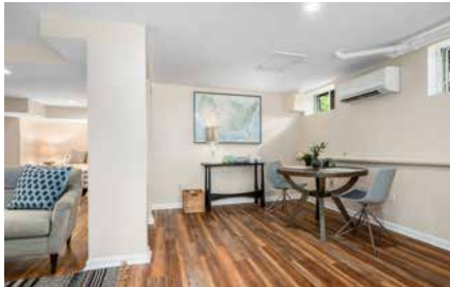
Lower-Level Guest Suite Dining Area