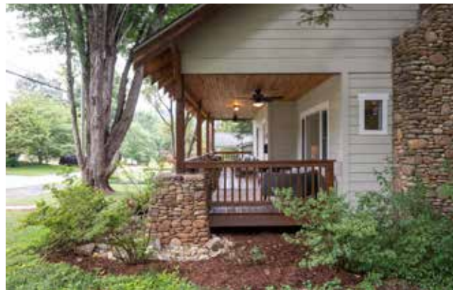
Side View of the Front Porch