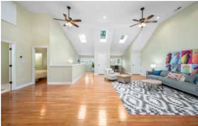
Upper-Level Great Room with Vaulted Ceiling and Skylights