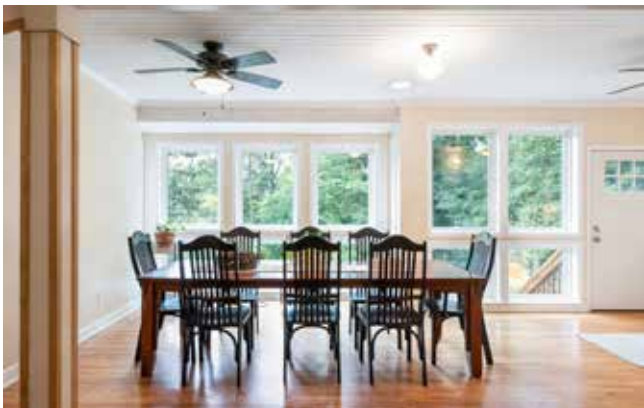
Bright, Cheery Main-Level Dining Room