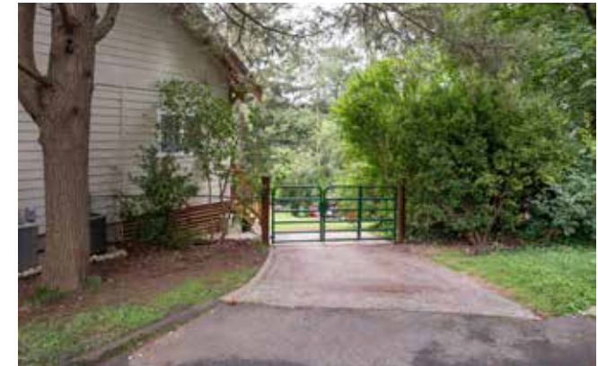
Parking Pad at End of Mt. Vernon Circle