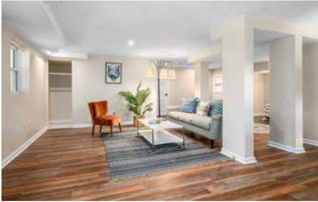
Lower-Level Guest Suite Living Room