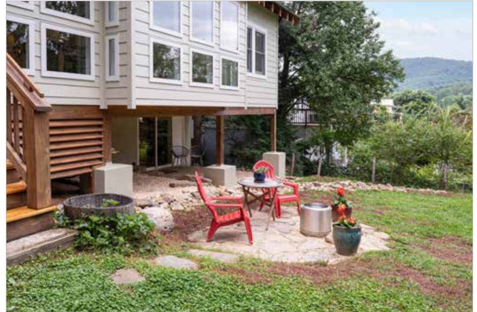
Rear Yard Stone Patio with Room for Fire Pit or Chimenea