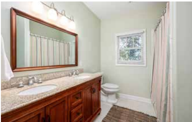
Upper-Level Guest Bathroom