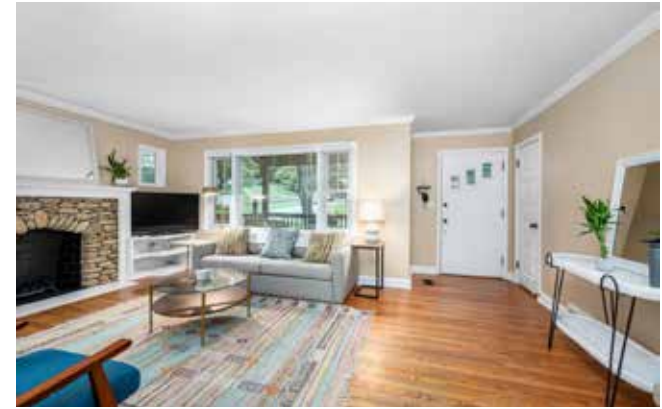
Living Room with River Rock Gas Fireplace and Built-ins