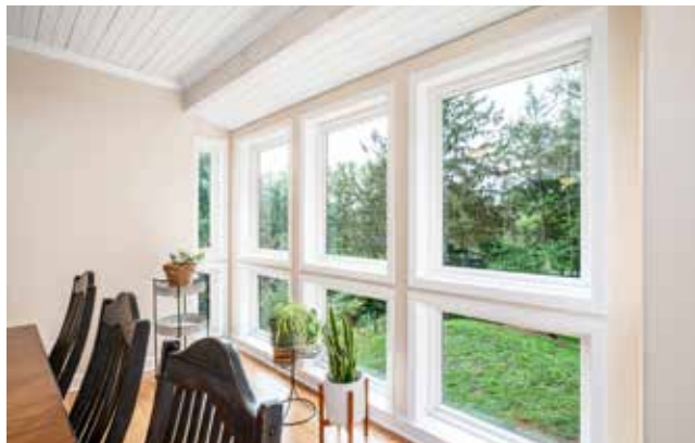
Wall of Windows Imparts Great Natural Light