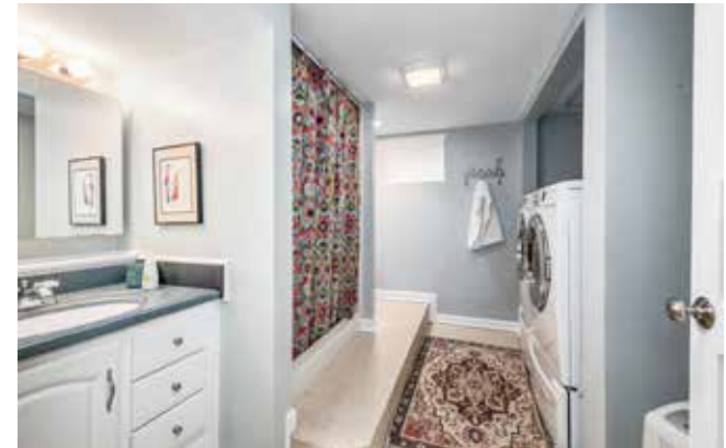
Guest Suite Laundry Room