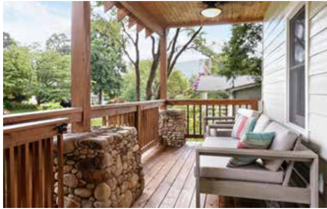
Front Porch Views with River Rock and Rafter Tails