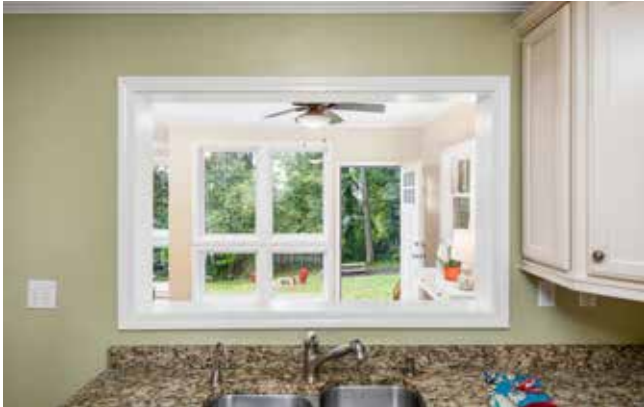
View from Kitchen Sink