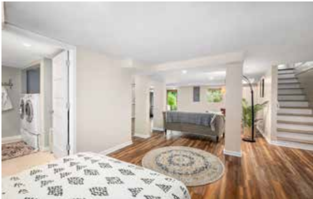
Guest Suite View from Sleeping Area