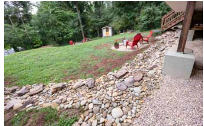
Rear Yard View from Lower-Level Patio