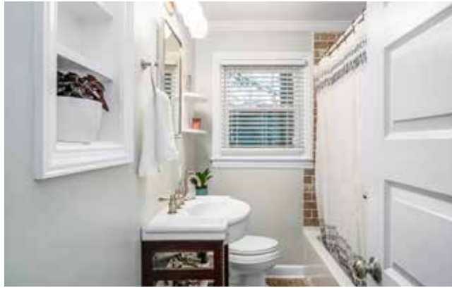
Main-Level Guest Bathroom