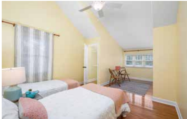
Upper-Level Guest Room • High Ceiling and Tons of Light