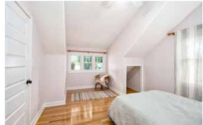
Second Upper-Level Guest Room with Sitting Area