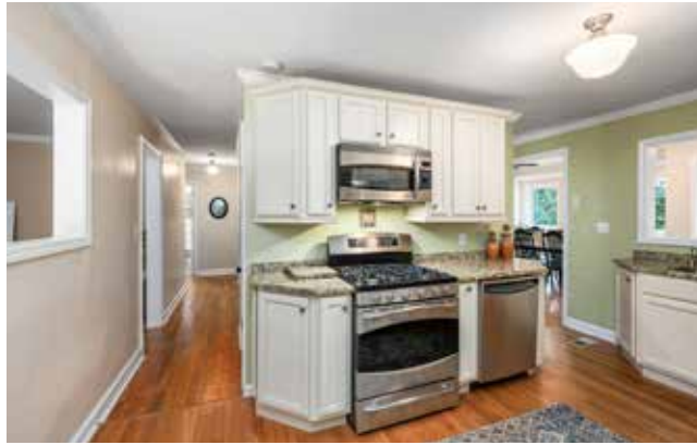
Centralized Kitchen • Access Living or Dining Rooms