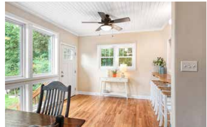
Dining Room Connects to Bar at Kitchen Window