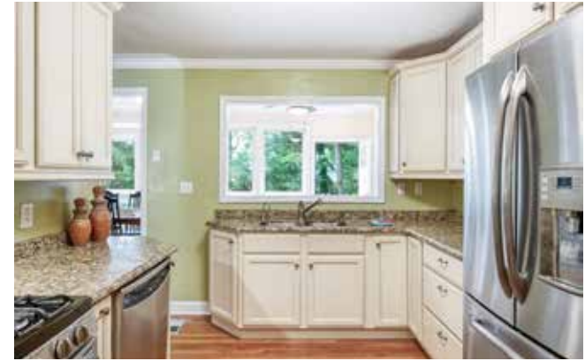
Kitchen View of Dining Room