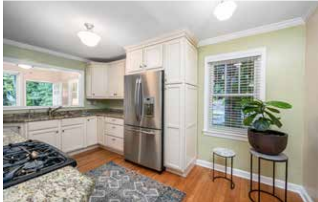
Granite Counters, Stainless Appliances, Schoolhouse Lights