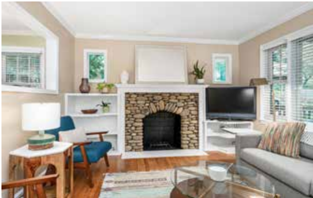
Main-Level Living Room with Many Golden Ratios