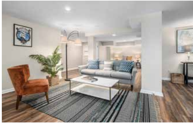
View of Sitting Area, Looking toward Sleeping Space