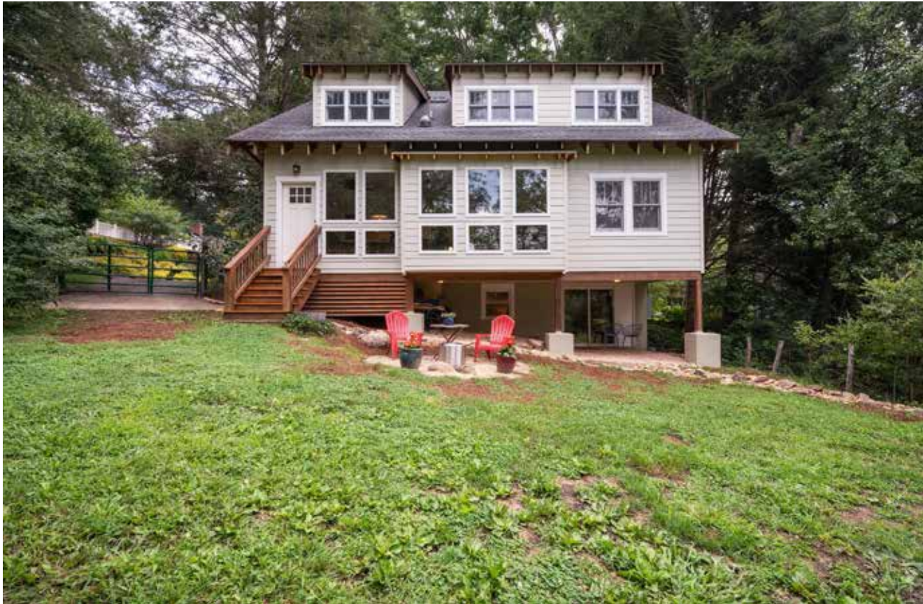
Exterior View • Rear of Home