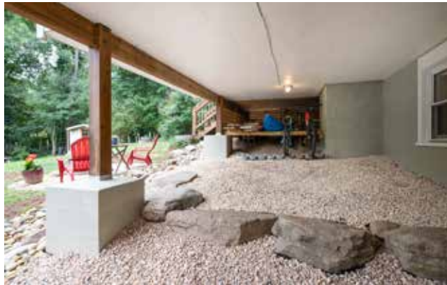
Lower-Level Exterior Storage