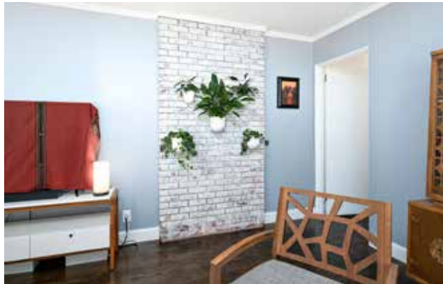
Original Interior Brick Wall Brings Warmth to the Room