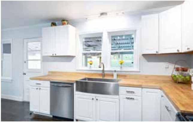
Updated Kitchen • Butcher Block Counters, Farmer's Sink