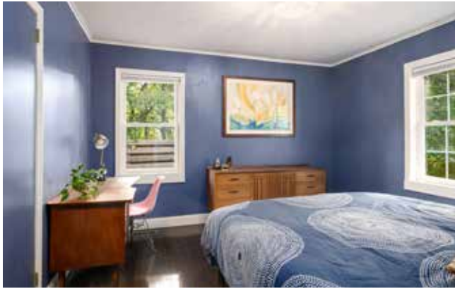
Bedroom with Space for Desk