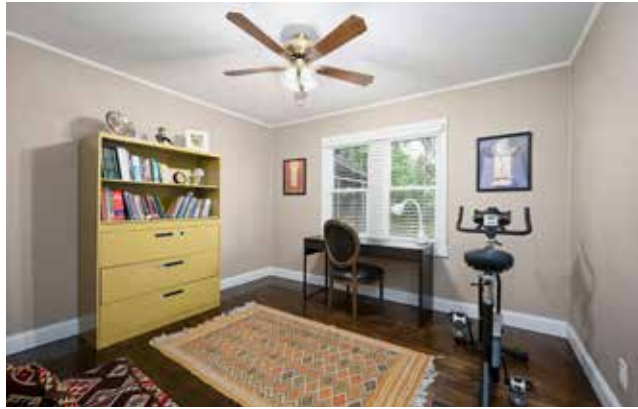
Main-Level Bedroom, Perfect for Home Office