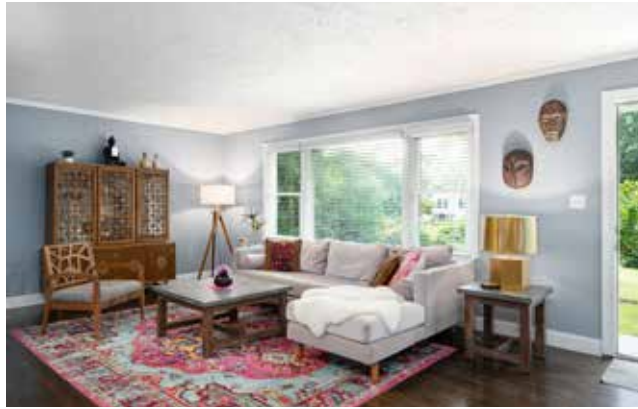
Sun-Filled Living Room with Large Picture Window