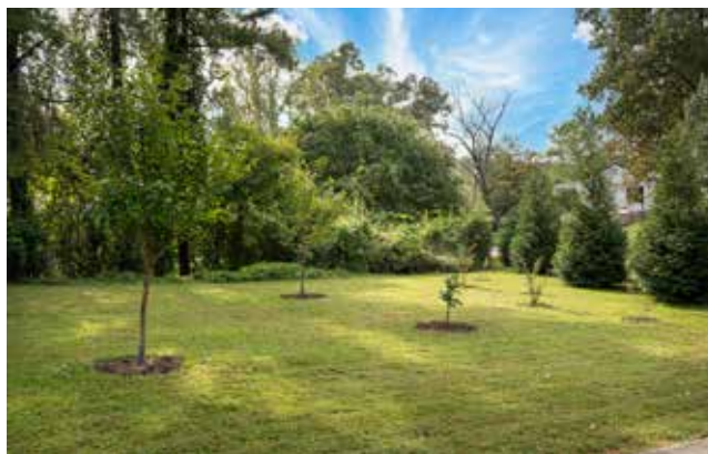
Delightful Landscaping Includes Fruit Trees, Edible Shrubs

38 REESE ROAD Renovated Ranch Home in Haw Creek Asheville, NC 28805