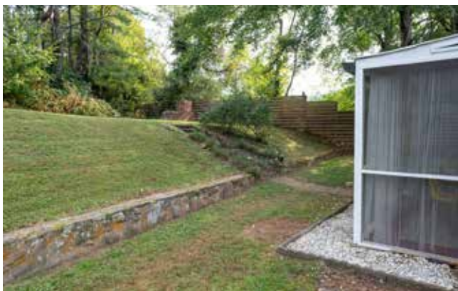
Gentle Slope Connects Lower and Upper Back Yard