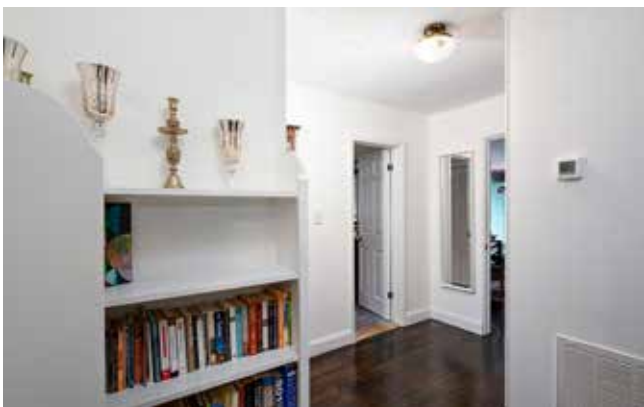
Hallway Joins Three Bedrooms, Bathroom, Linen Closet