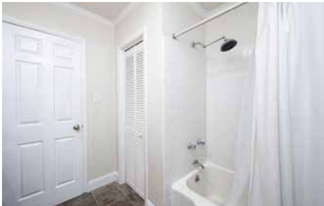
Tiled Shower with Original Hardware and a Linen Closet