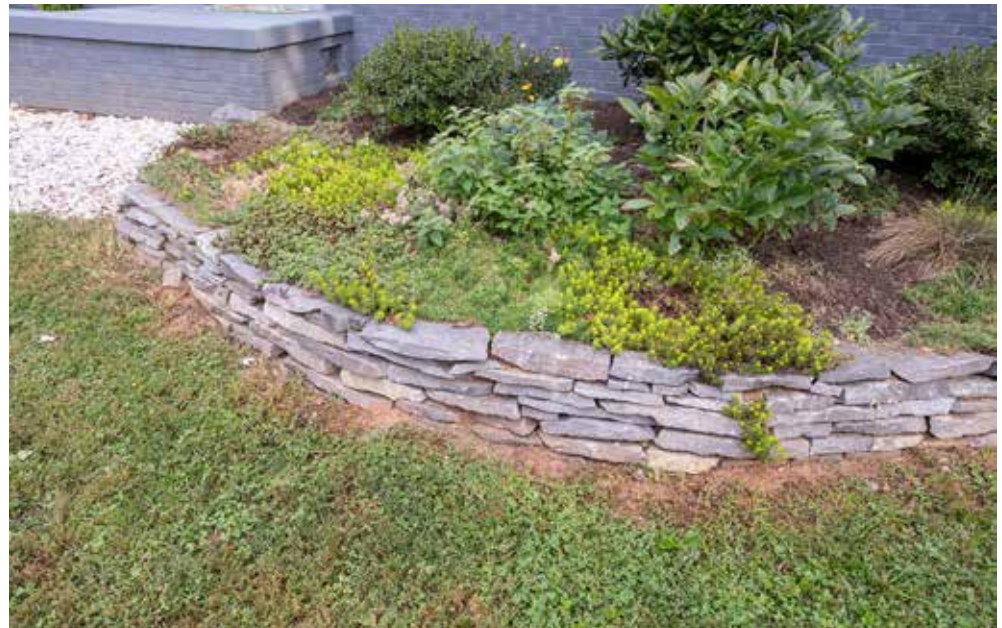
Stacked Stone Plant Beds Adorn the Front of the Home