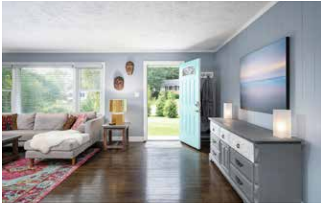
Inviting Entry Welcomes You Home