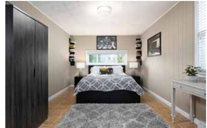
Primary Suite Features Stunning Parquet Floors