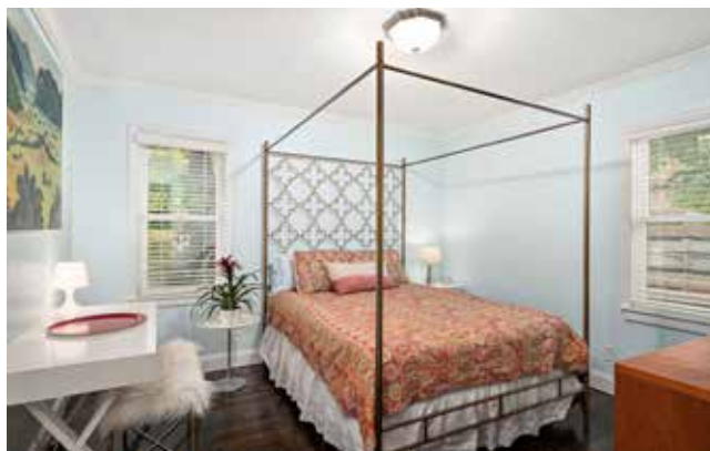
Bedroom with Private View