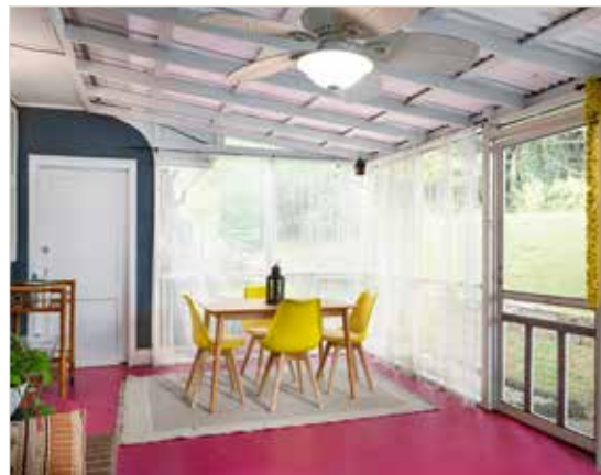
Al Fresco Dining Awaits