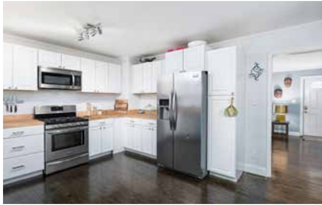
Stainless Steel Appliances • Ample Cabinet Space