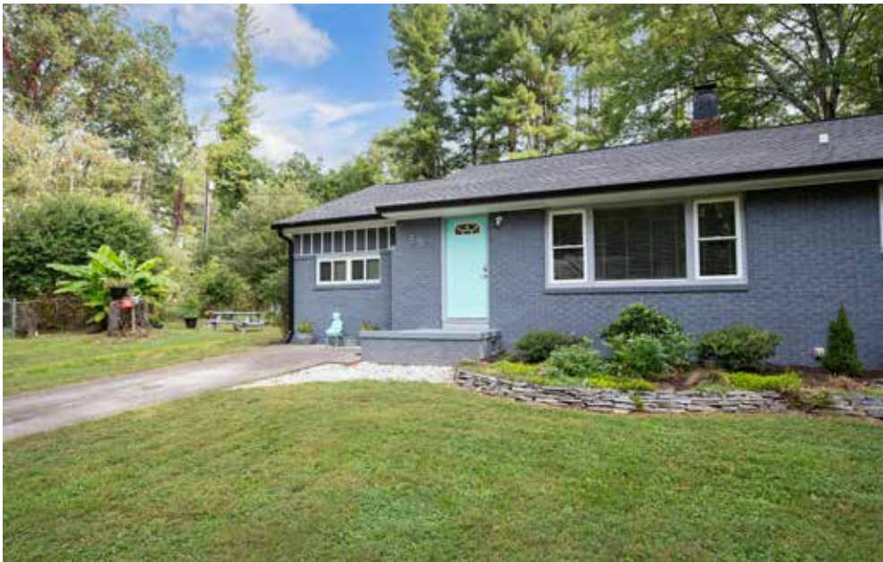
Fresh Exterior Paint and a 30-Year Roof