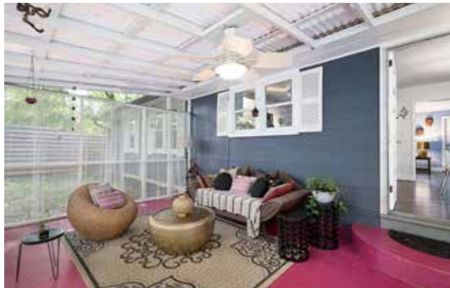
Open-Air Screened Porch for Afternoon Tea