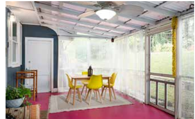
Al Fresco Dining Awaits