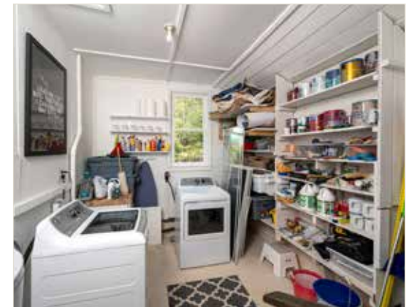
Laundry/Utility Room with Plenty of Storage