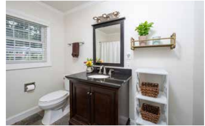
Second Bath Is a Mix of Modern and Original Fixtures