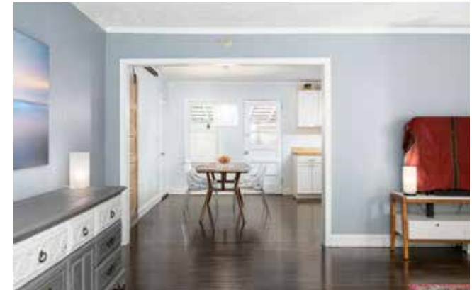
Wide Doorway Connects Living Room/Kitchen/Dining