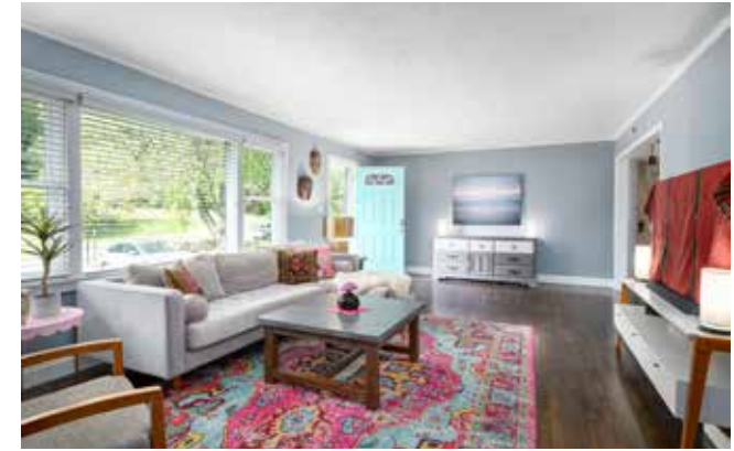
Lots of Space for Entertaining