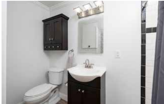
Ensuite Primary Bathroom