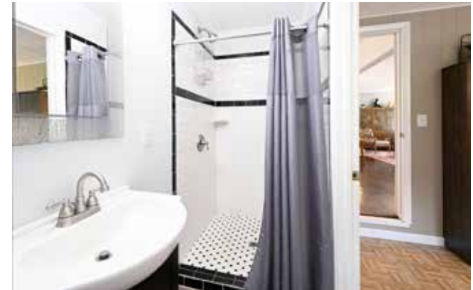
Walk-in Tiled Shower