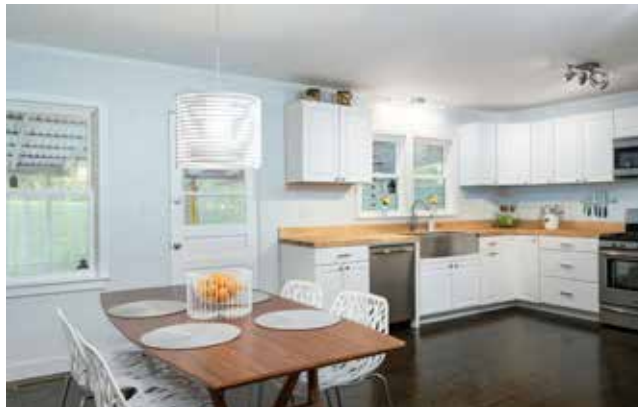
Porch Access from the Kitchen

38 REESE ROAD Renovated Ranch Home in Haw Creek Asheville, NC 28805