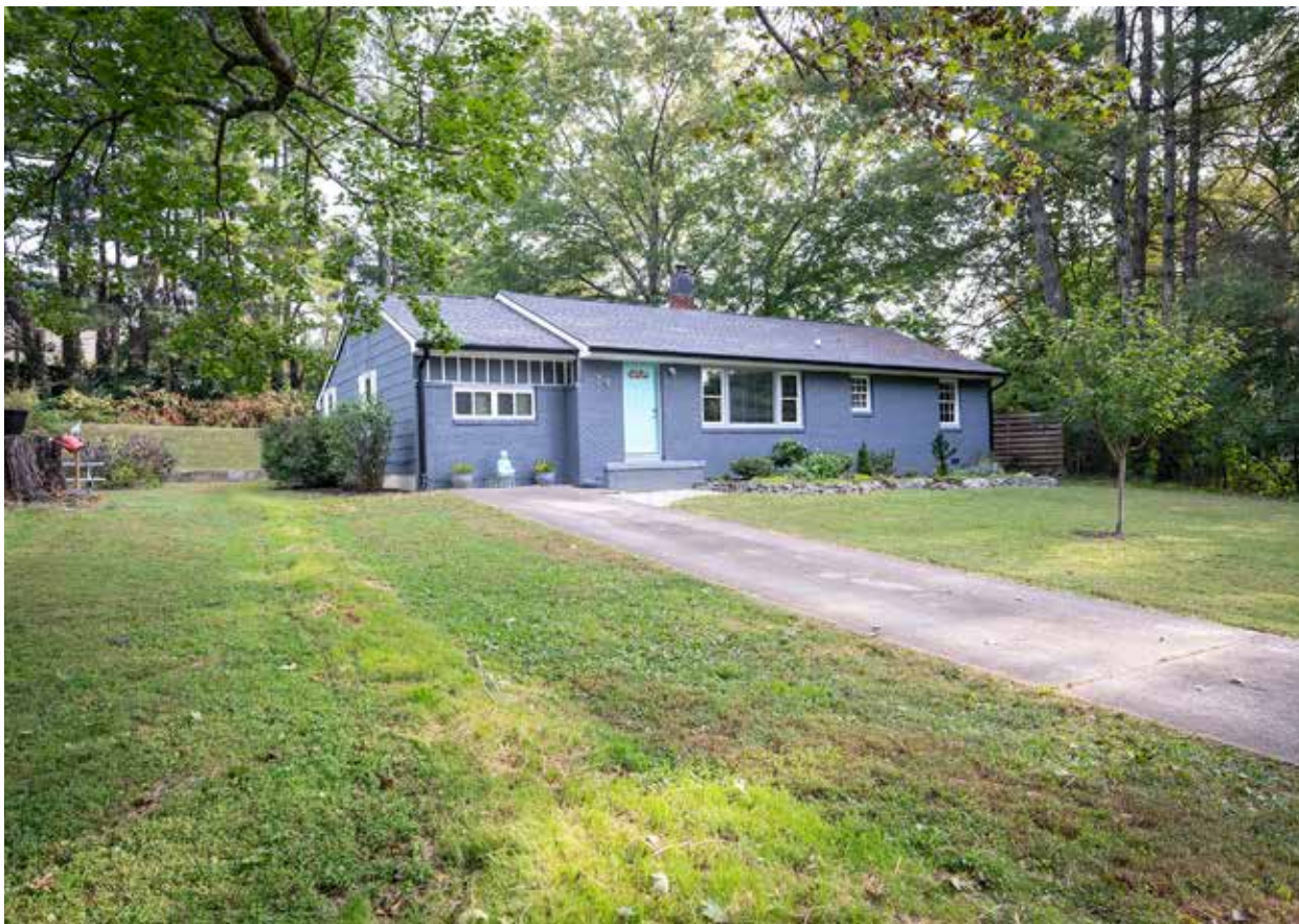
Great Curb Appeal

Beautifully renovated modern ranch home in Haw Creek with a large sunny yard perfect for gardening and excellent proximity to the best that Asheville has to offer. Hike from your house to the Mountains-to-Sea Trail or hop in your car and be downtown or on the Blue Ridge Parkway in minutes. Major updates in 2017 include a new roof, gas furnace, air conditioning, hot water heater, renovated kitchen and bathrooms, replacement windows, privacy fence, updated fixtures, paint, and more. Original wood floors, crown molding and built-ins. Chef's kitchen features butcher block countertops, stainless appliances, farmer's sink, five-burner gas range and lots of cabinets and counters. Relax with friends or enjoy dinner on the spacious screened porch that opens to the gorgeous and private half-acre yard. Flat and gently sloping yard boasts established perennials and edible landscaping. Space for an accessory dwelling unit. Too many details to name!