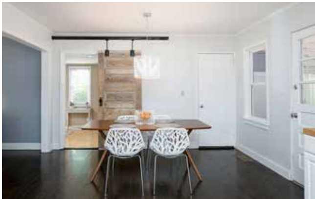
Dining Area off of the Kitchen