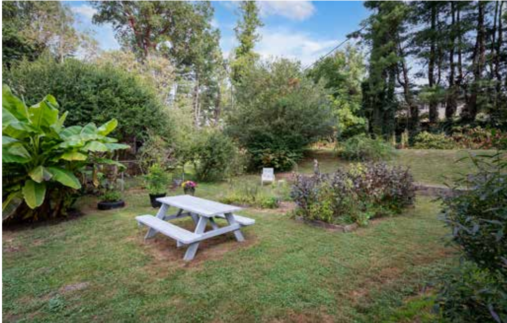
Lovely Gathering Space Among Established Organic Garden Beds