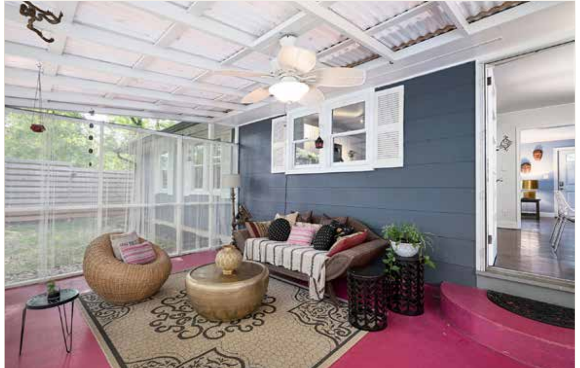
Open-Air Screened Porch for Afternoon Tea