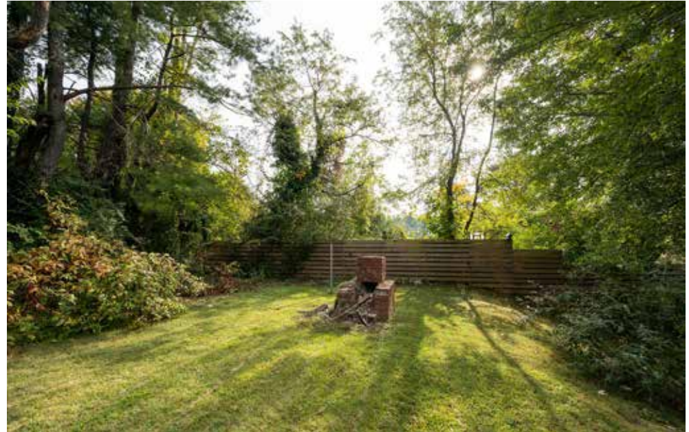
Level Outdoor Space Gets Great Sun