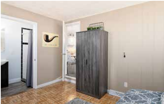
Gorgeous Built-in Armoire