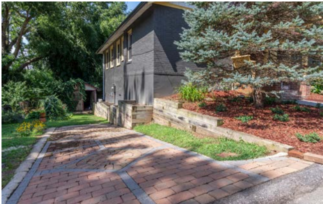
Two Driveways and Planter Boxes