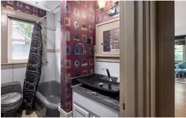
Both Baths Remodeled