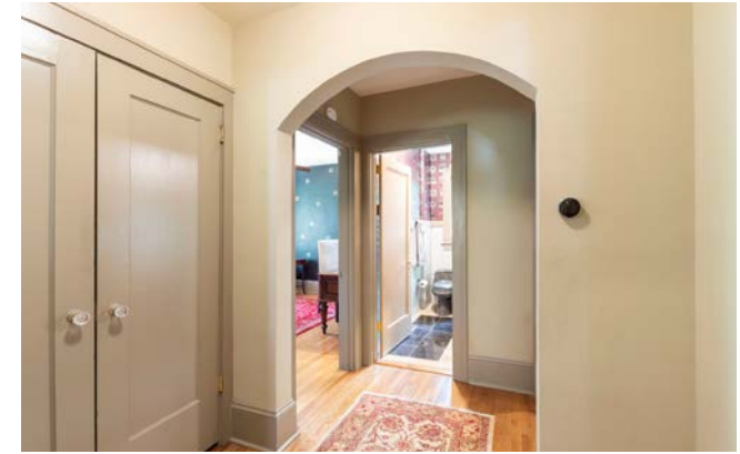
Special Architectural Features