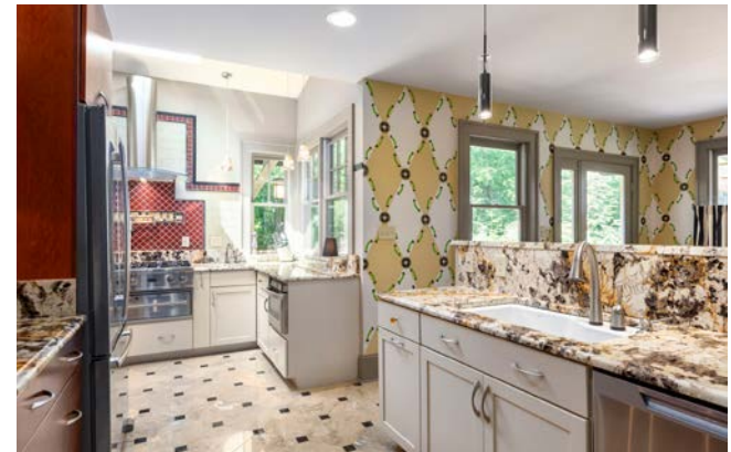
Two Sinks with Touchless Faucets