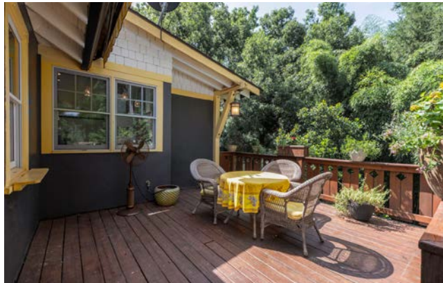
Surrounded by the Trees