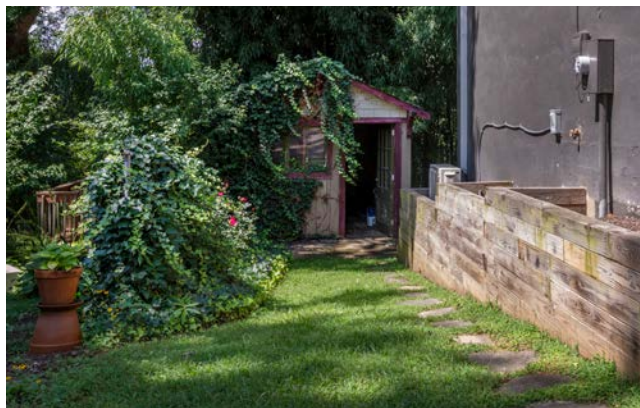
Garden Shed for Storage