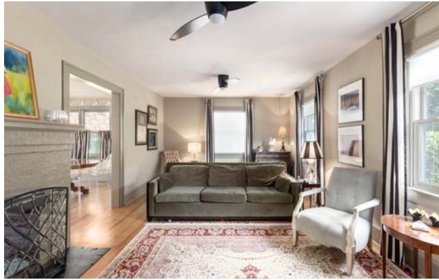
Abundant Natural Light