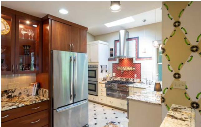
Stunning Kitchen Remodel