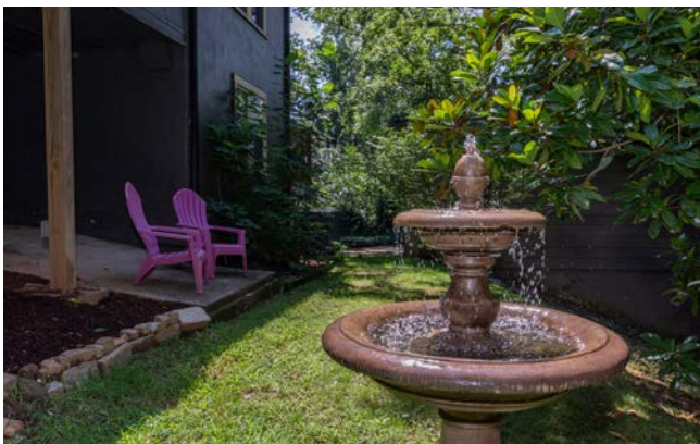
Come Listen to the Relaxing Fountain