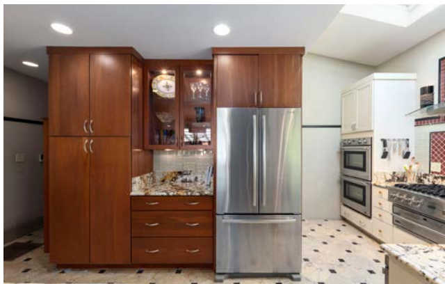
Marble Tile and Double Ovens