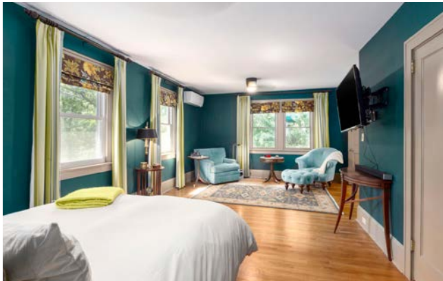
Spacious Primary Bedroom Suite