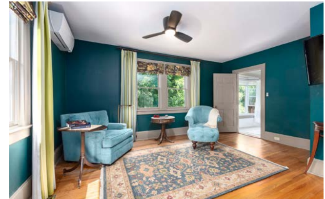
2019 Mini-Split in Primary Suite