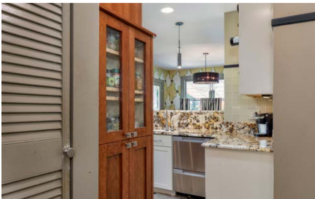
Plenty of Cabinetry