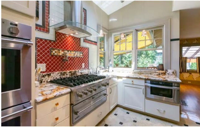
Gorgeous Granite Countertops and Tile Backsplash