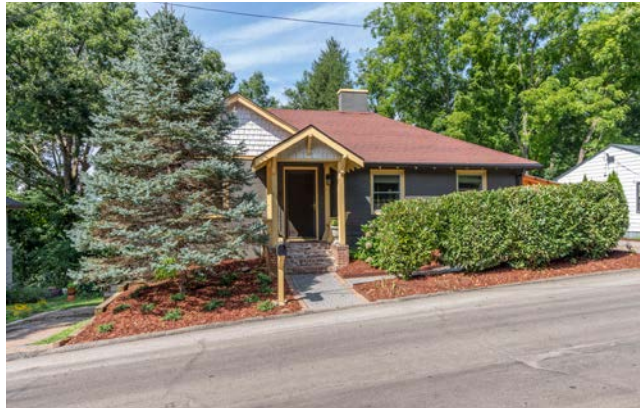
Meticulously Maintained Home