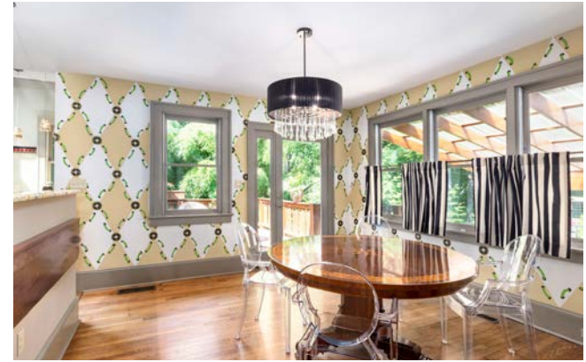
Most Windows Replaced in Home