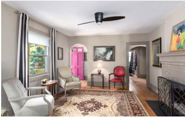
Move In Ready - Minutes to Shopping