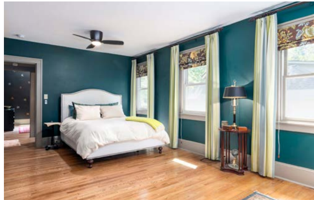
Original Hardwood Floors