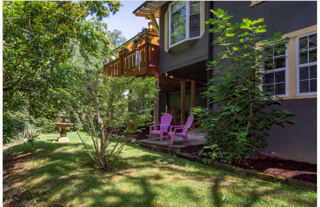
Incredible Privacy in the Backyard