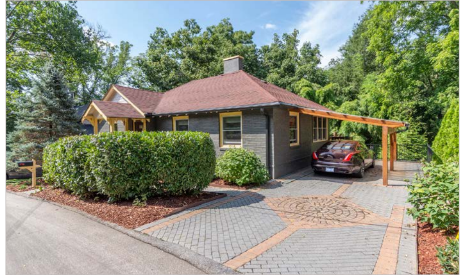
One-Car Carport and Paved Driveways