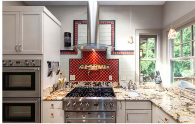
Viking Six-Burner Cooktop and Warming Drawer