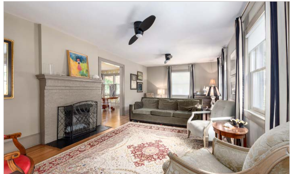
Inviting Living Room with Gas Fireplace