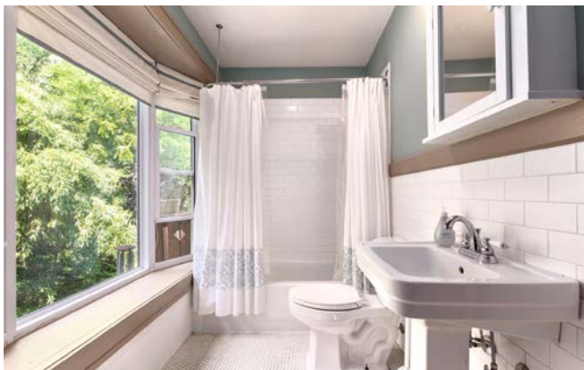
Bright White Remodeled Primary Bath