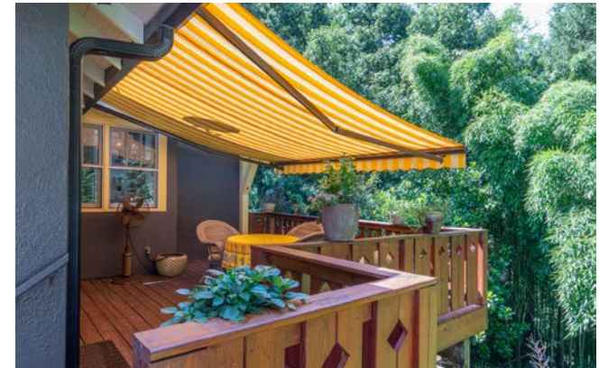
Perfect Spot to Relax Under the Awning