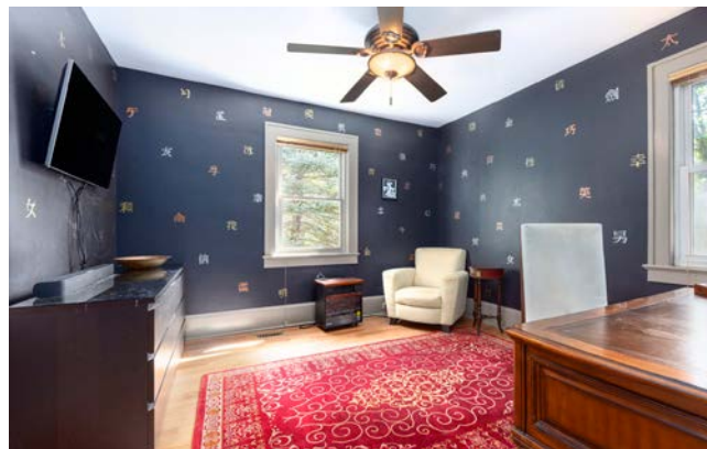
Beautifully Painted Bedroom Office