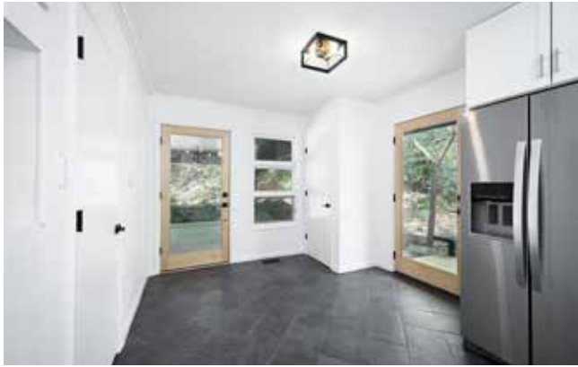
Carport and Side Patio Access from the Kitchen