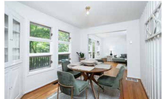
Dining Room, Ready for Your Next Gathering