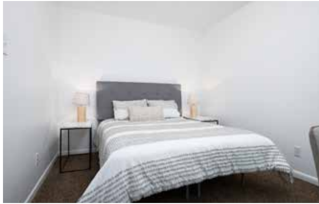
Third Bedroom Upstairs ...