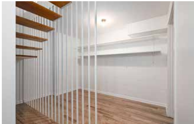
Bonus Area in Basement