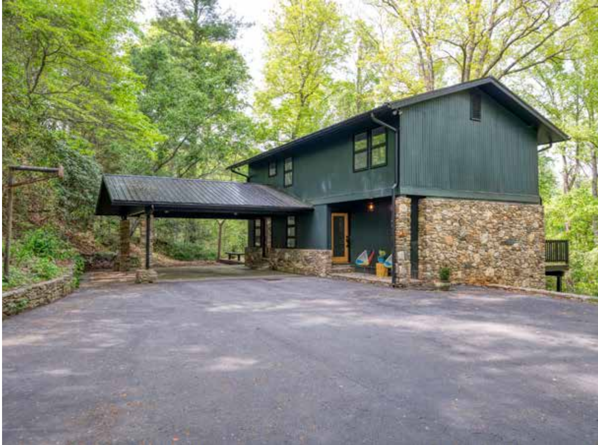
Plenty of Parking, Including a Two-Car Carport

Stunning mountain contemporary home in popular South Asheville with many updates in popular South Asheville. Set in an idyllic natural setting with excellent proximity to the best that Asheville has to offer. Mere minutes to downtown, the Blue Ridge Parkway and Biltmore Park, this home is in the county on the edge of city limits, making it perfect potential for a whole-house vacation rental. Renovations include a fully remodeled kitchen with quartz counters and stainless appliances, new metal roof, fresh interior and exterior paint, oversized gutters, and new light fixtures. Designed for entertaining, the main level features the gleaming kitchen, bright dining room, living with back balcony access, and a cozy sitting room with a gas fireplace. Three bedrooms and two full bathrooms on second level include the primary suite with wooded views and ensuite bathroom. The finished basement features a large bonus room (not a bedroom because of 3 BR septic permit), powder room, second bonus room, sitting area, and a sunroom surrounded by nature. Two-car carport with covered main-level access.