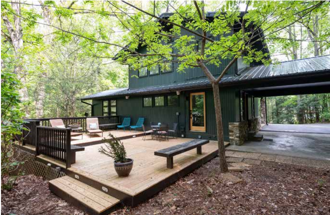
Abundance of Outdoor Space • Side Patio Has Lots of Room for Gatherings