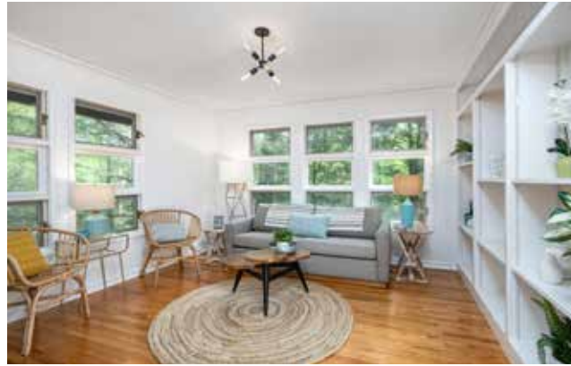
Bright Sitting Room with Built-in Display Shelves ...