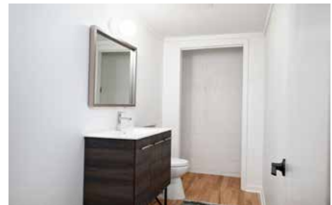
Powder Room in Basement