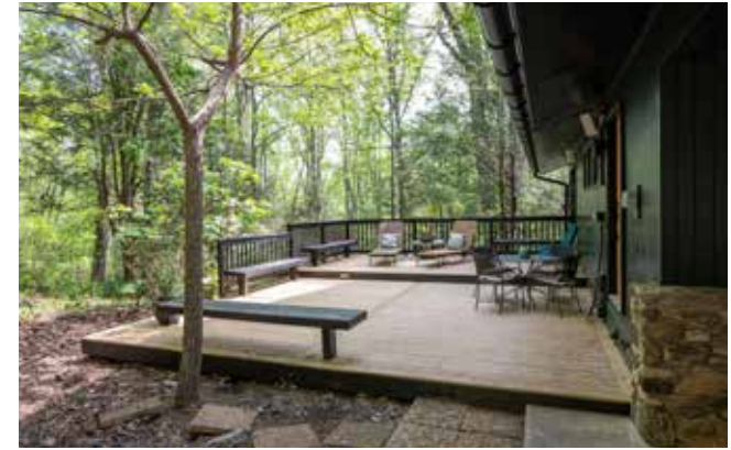
Re-Decked Patio Provides the Perfect Spot to Relax