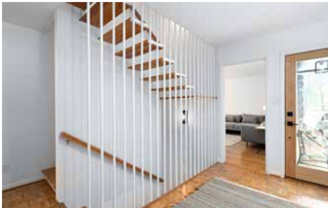
Mid-Century Inspired Design with Floating Stairs