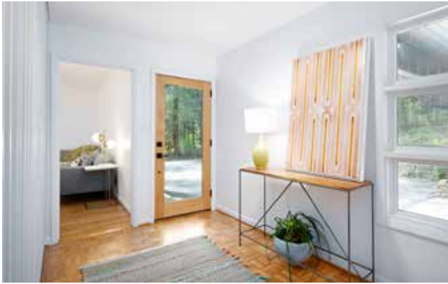
Full-Light Front Door, Beautiful Parquet Floors at Entry