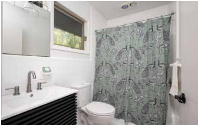
Second Upstairs Full Bathroom