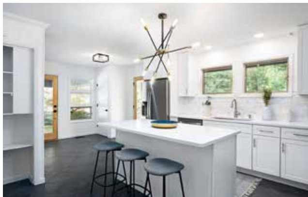
Stunning Sputnik Hovers above the Island Breakfast Bar