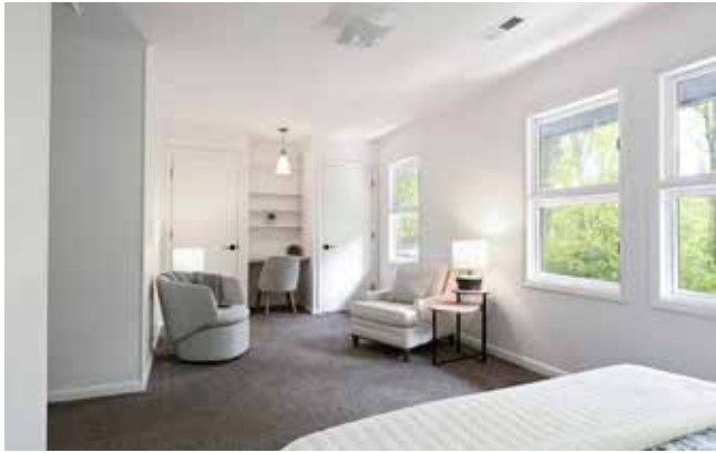
... plus Two Closets and a Desk Nook