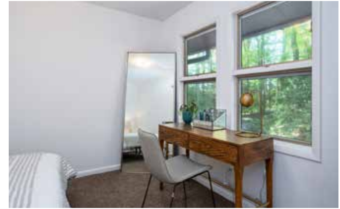
... with Space for a Small Desk