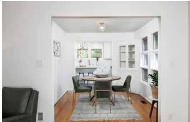
Great Flow through the Home