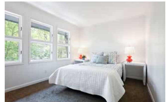
Second Upstairs Bedroom with Private Views ...