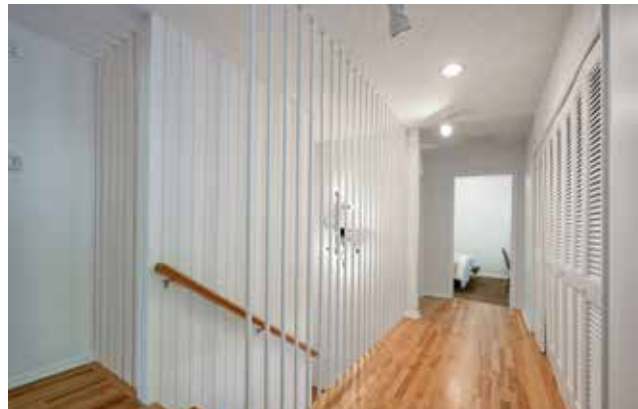
Second-Level Hallway Connects Three Bedrooms