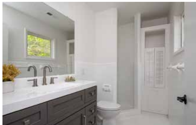
... and a Remodeled Ensuite Full Bathroom