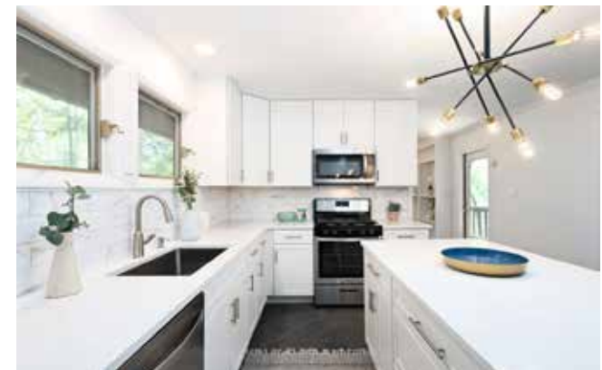
Lots of Cabinet and Counter Space