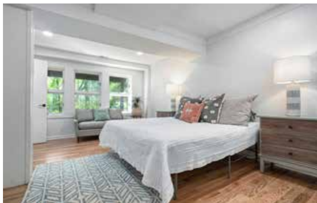
Spacious Basement Bonus Room Overlooks Yard