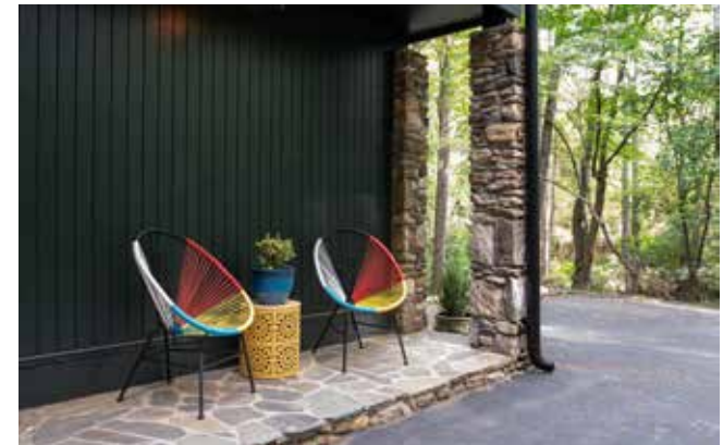
Have Your Morning Coffee with a Side of Birdsong ...