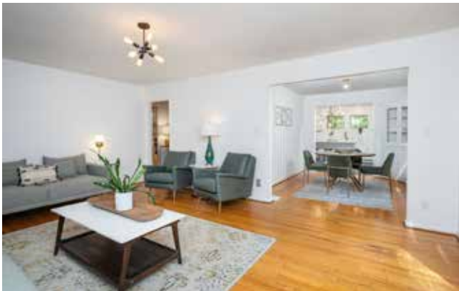
Great Space for Entertaining