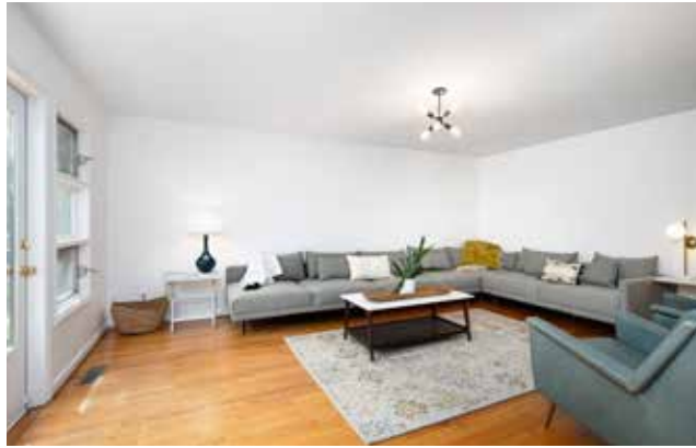
Cozy Living Room