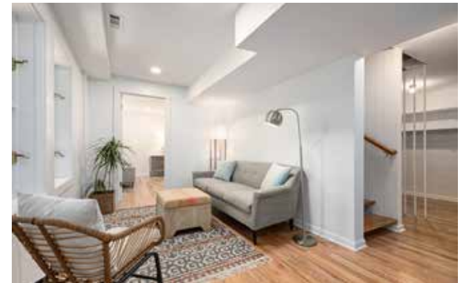
Sitting Room • Ready for a Good Book