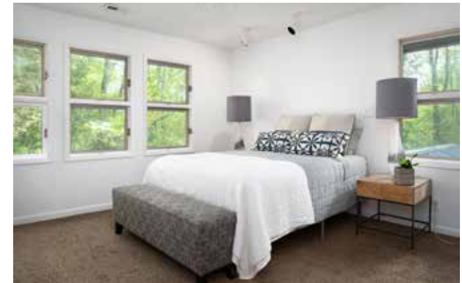
Primary Bedroom Features Wooded Views ...