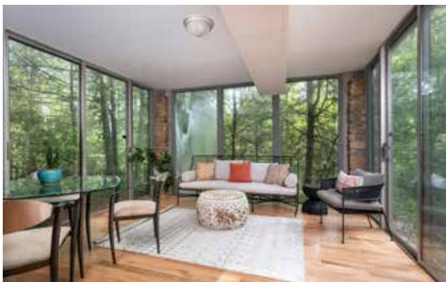
Sunroom (Unheated) with Floor-to-Ceiling Windows