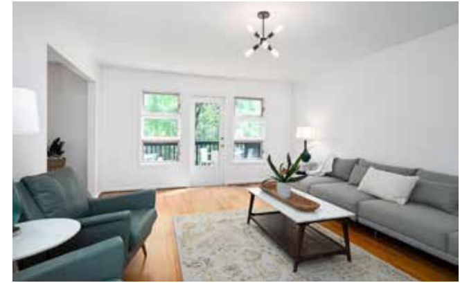
Back Balcony Access from the Living Room