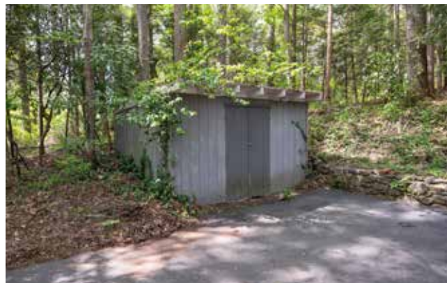
Storage Shed for Tools and Toys