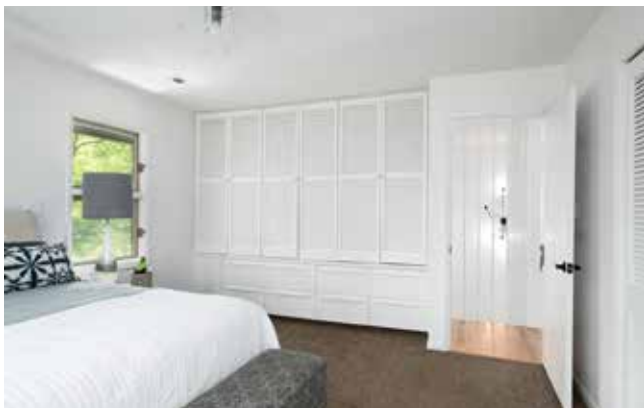
... Built-in Closet and Storage Drawers ...