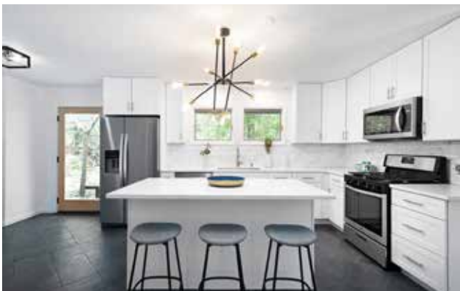
Kitchen Features Quartz Countertops and Tile Backsplash