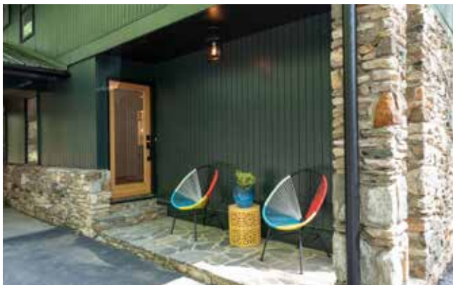
... on the Covered Front Porch