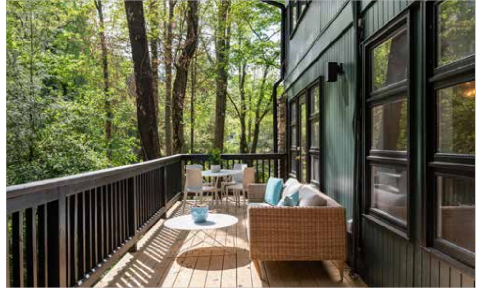
Back Balcony Sits Among Mature Trees