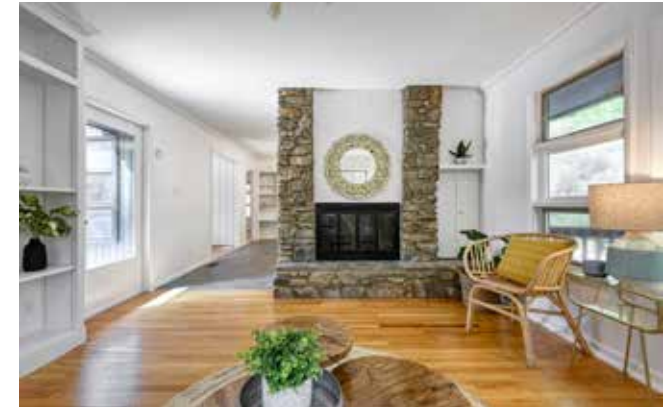
... and a Stone-Accent Gas Fireplace