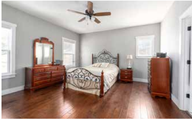
Serene, Spacious Main Bedroom