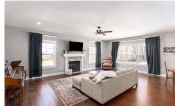
Light and Bright