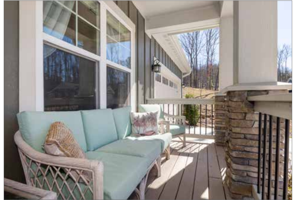
Relaxing Front Porch, Perfect for Morning Coffee