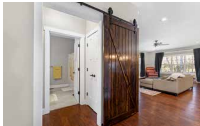
Barn Doors Add a Touch of Rustic Elegance