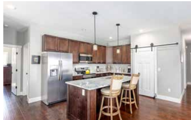
Gorgeous Kitchen with Island