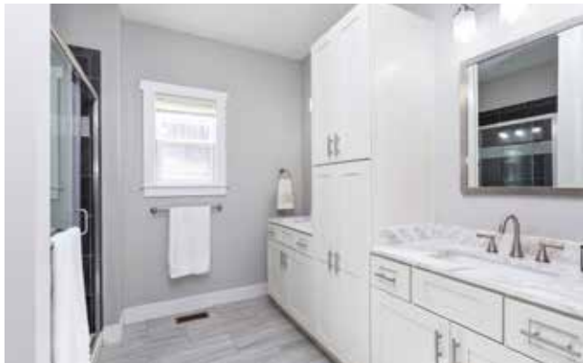
Light and Bright Ensuite Bathroom