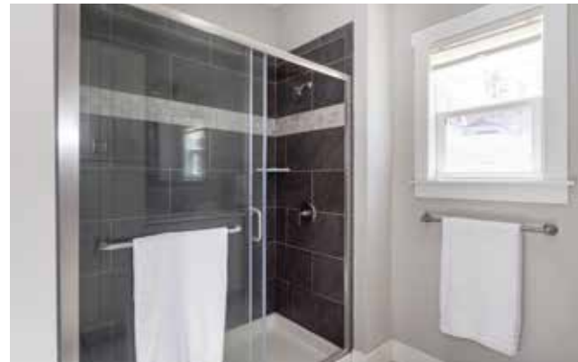
Tiled Shower with Glass Enclosure