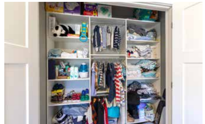
A Place for Everything and Everything in Its Place