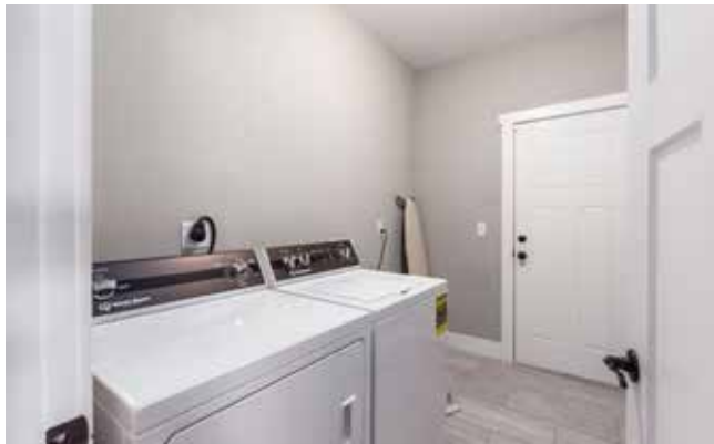
Mudroom with Speed Queen Laundry off Garage