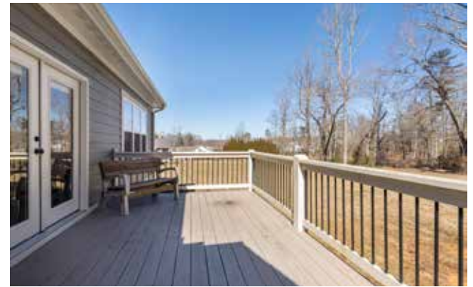
Back Deck off Living Room