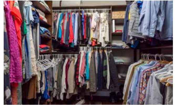
Closet Closet in Main Bedroom