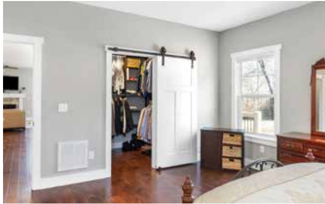
Custom Walk-in Closet with Barn Door