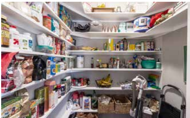
Inside the Space-Saving Walk-in Pantry