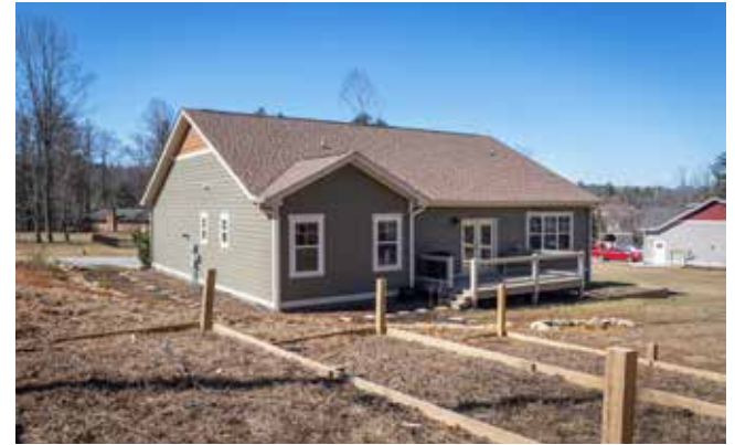
Back Yard with Raised Beds