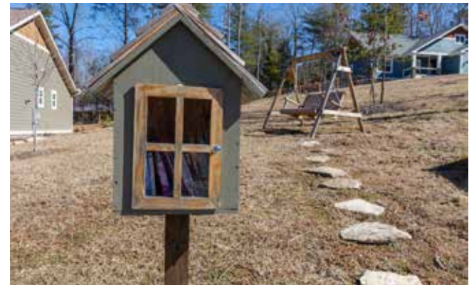
Little Lending Library at Edge of Property