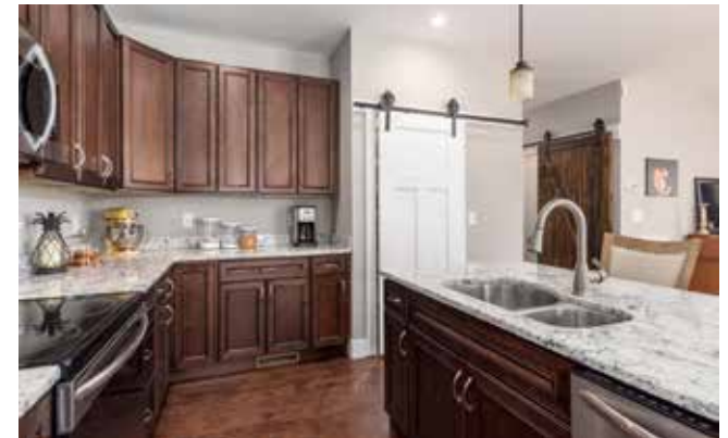
Custom Pantry with Barn Door