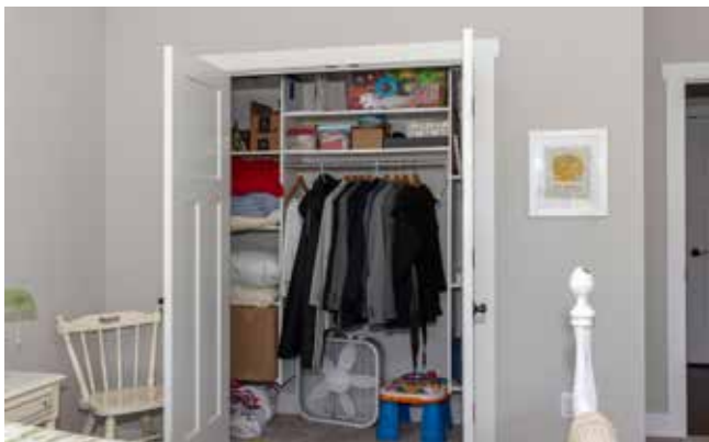
Roomy Closet in Guest Bedroom