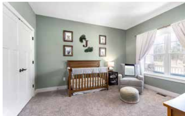
Third Bedroom, Currently Used as Nursery