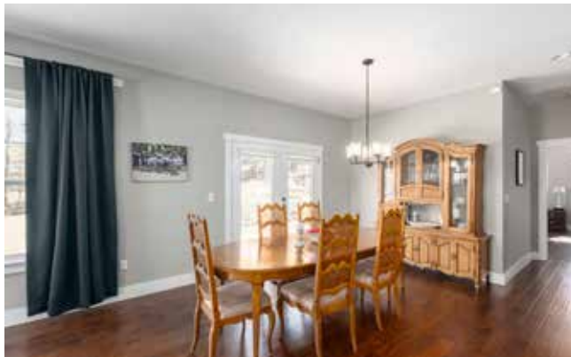
Spacious Dining Area with Room for a Large Table