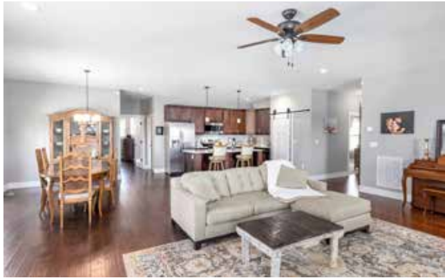
Open Floor Plan for Gatherings with Friends and Family