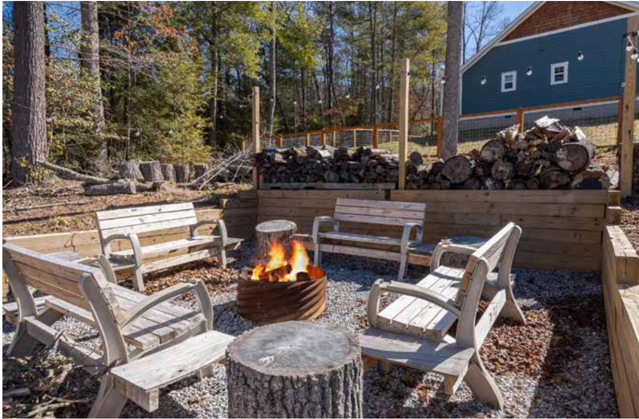
Firepit for Summer Nights