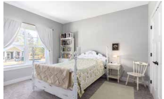
Airy Guest Bedroom