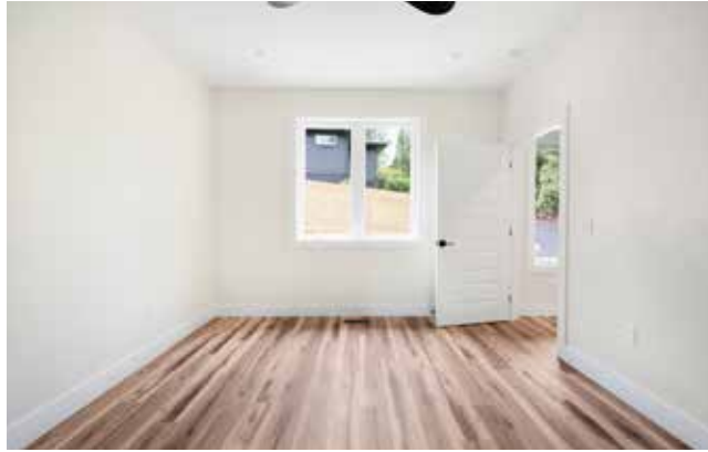
Bright Dual-Pane Slider Window