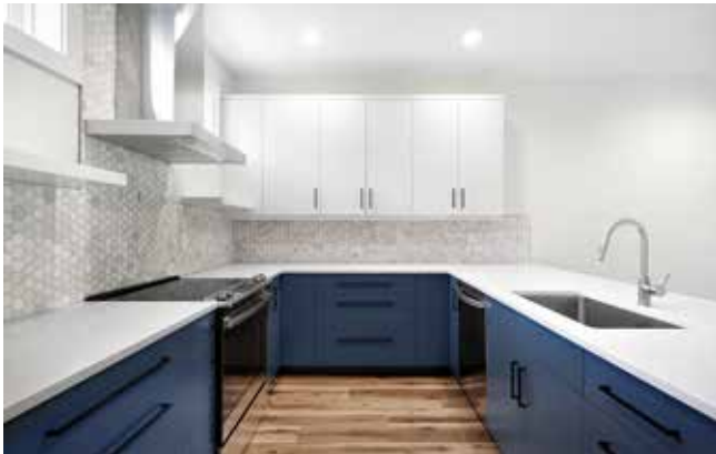
Quartz Countertops and Stainless Steel Vent Hood