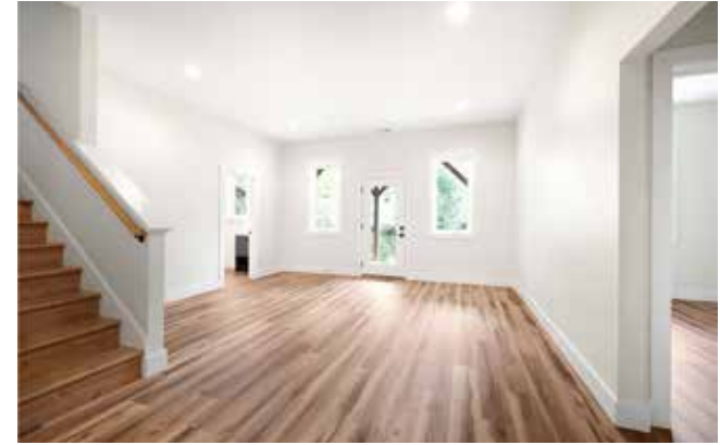
Full-Daylight, Walk-out Basement