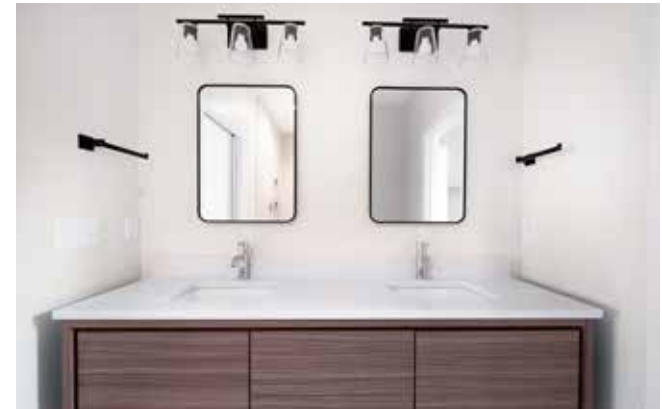
Modern Lighting and Plumbing Fixtures