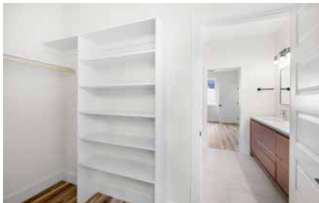
View of Bathroom, Bedroom from Walk-in Closet