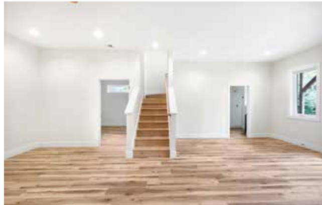
Airy Space with Bedroom and Bath • Perfect for Guests