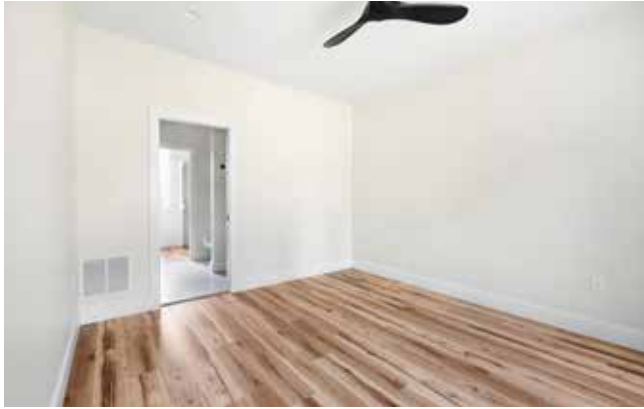
Cheery Primary Bedroom with Ensuite Bathroom