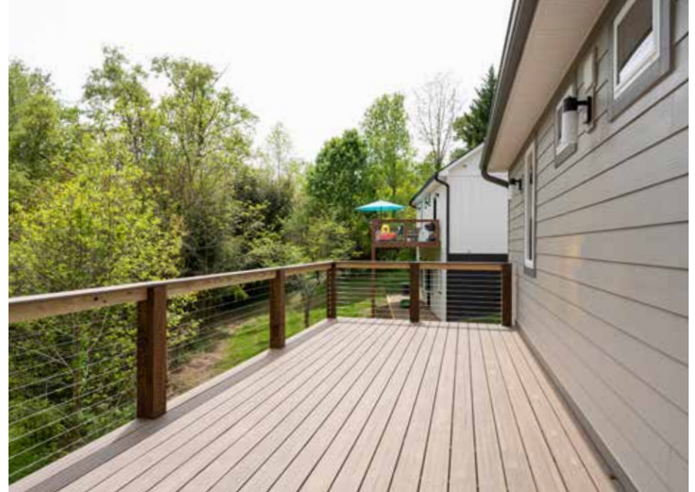
Hang Out on the 30' x 10' Deck • Perfect for Barbecues