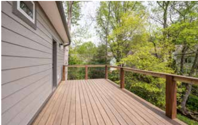
Trex Decking Provides Durability