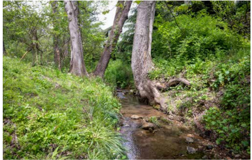
New Hobby: Looking for Salamanders!