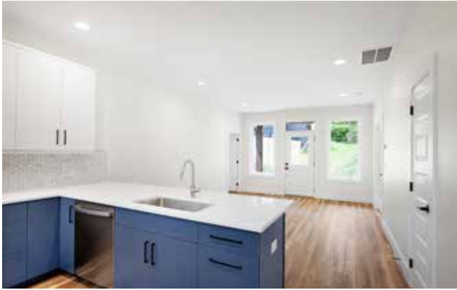
Plenty of Natural Light from Entry