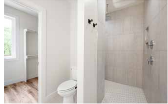
Ensuite Bath with Dual-Head Shower, Walk-in Closet