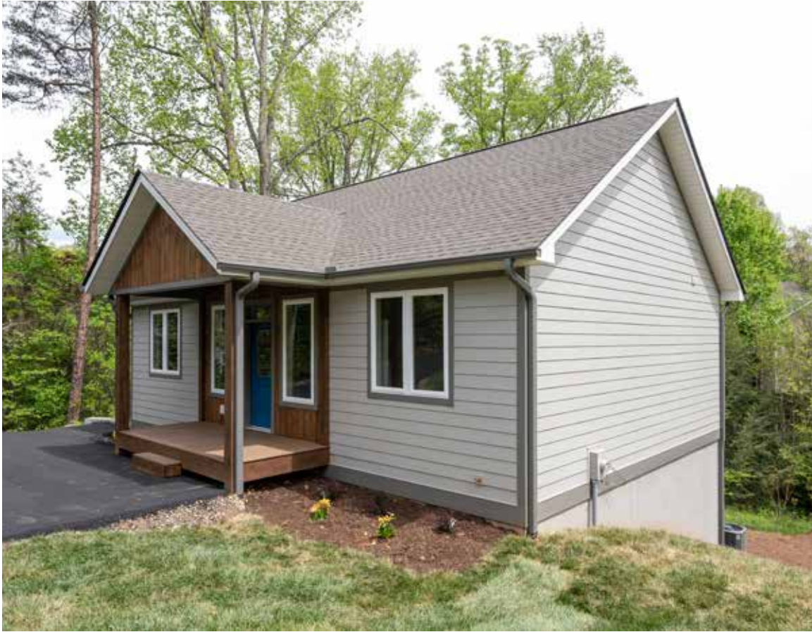
Fresh Sod • Great Solar Potential

Award-winning builder Meinch Construction is offering another quality Energy Star home just 5 minutes to downtown, yet nestled off the road and tucked away on a private lot. The layout offers a main level with a living/dining area, open-plan kitchen, flex room, full bath, and laundry nook. Primary bedroom on main level is connected by an exquisite walk-in shower with two shower heads and a double vanity. The large walk-in closet has ample custom shelving. Kitchen opens to a 30-foot, high-quality, low-maintenance balcony with a view of Haw Creek. The interior has stainless steel appliances, modern backsplash, and custom-built, soft-close cabinetry, handmade by a local artisan. The floors are finished with a durable and high-performance waterproof vinyl. It has 9-foot ceilings and large windows throughout, plus covered outdoor access from the basement family/recreation room. The bedrooms have plenty of natural light and share a full bath, with storage space tucked into auxiliary areas.