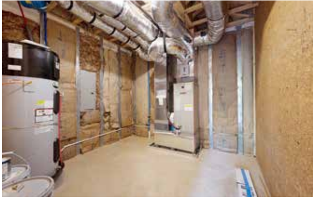
Basement Utility Room and Storage Area