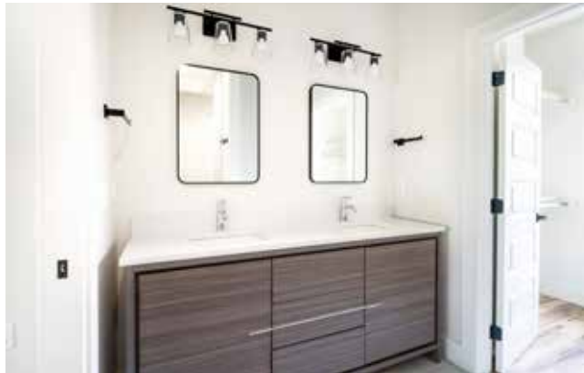
Roomy Double Vanity