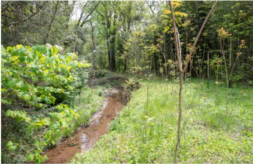
Haw Creek Runs through the Back Yard