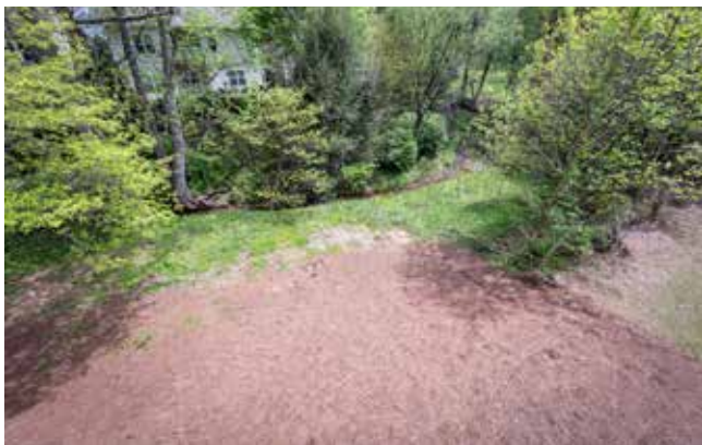
Back Yard with Views of the Creek