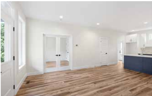
Flex Space off Kitchen • Potential Fourth Bedroom/Office