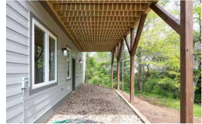
Patio Offers a Respite from the Summer Sun