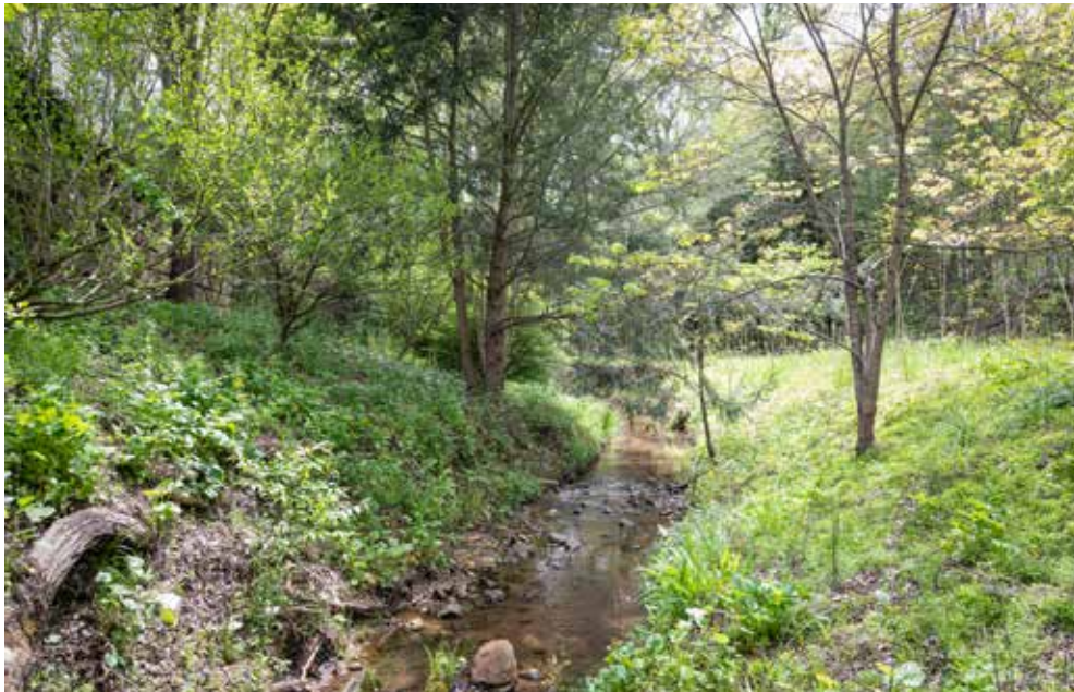
Or Simply Enjoy the Sounds of the Gently Gurgling Creek