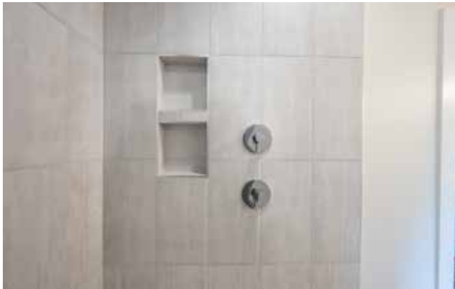
Shower Has Built-in Toiletry Nooks