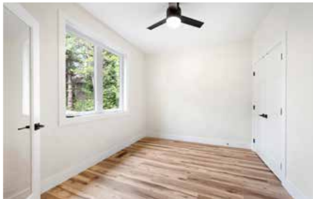
French Doors and Large Windows