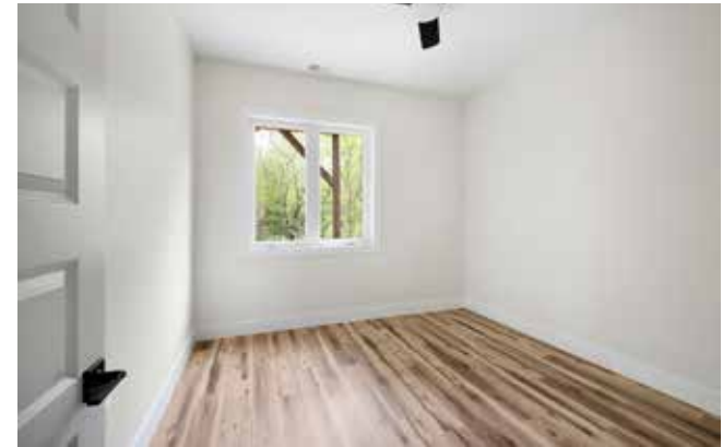
Basement Bedroom with Large Slider Window