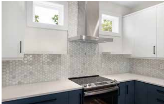
Classic Hex Tile Backsplash • Glass Cooktop