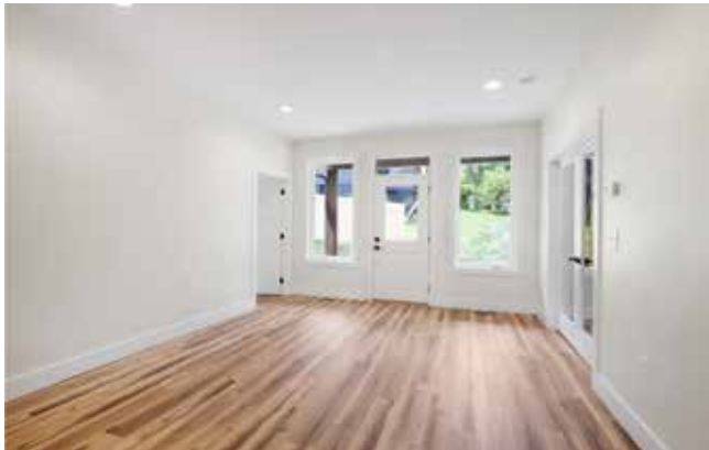
High Ceilings Continue on the Lower Level