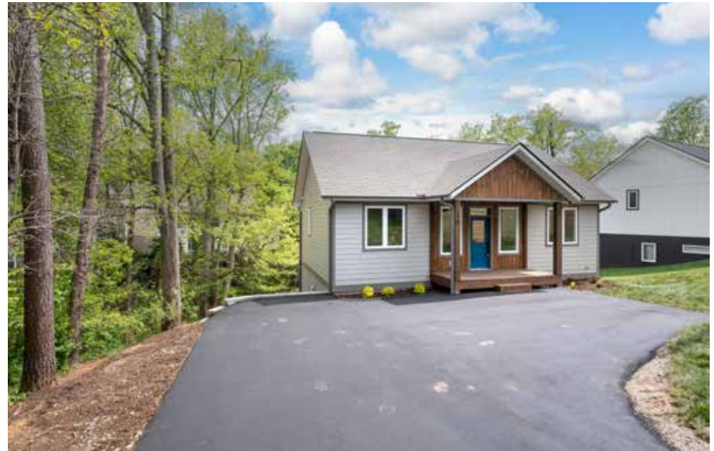
Driveway Provides Plenty of Parking Area