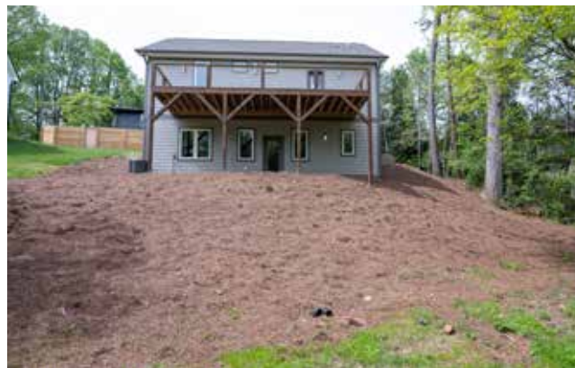
View of Back Yard from Creekside