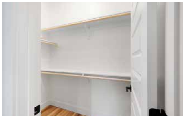
Closet with Solid Shelving