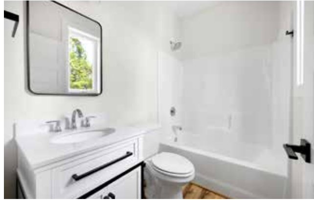
Second Full Bath on Main Level