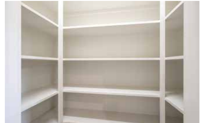
Custom Shelving in Pantry