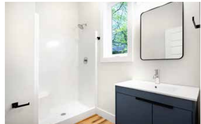
Full Bath Downstairs