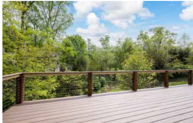
Huge, Sunny Spot for Relaxing