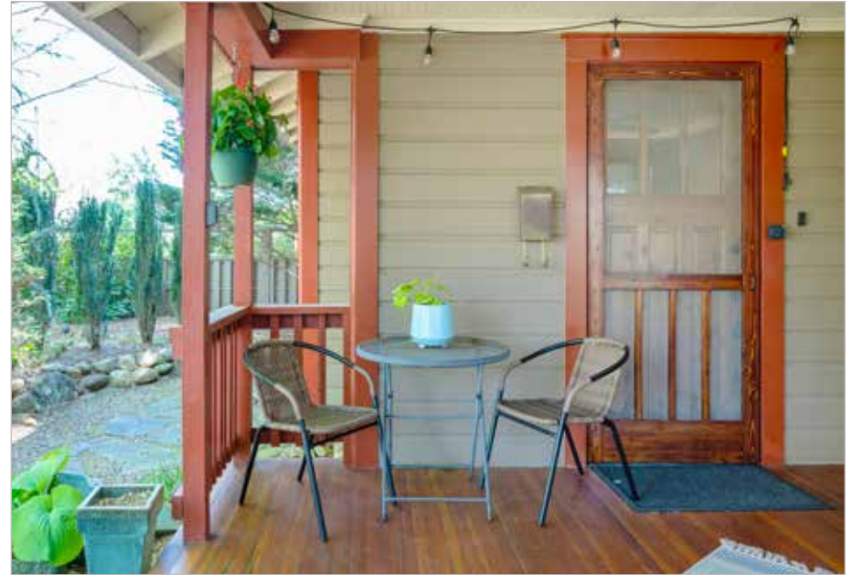
Covered Front Porch Overlooks Garden