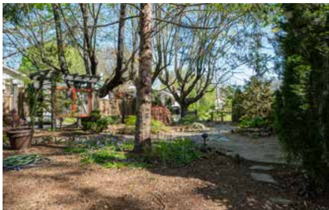
Thoughtful Landscape Design

86 MITCHELL AVENUE Classic West Asheville Bungalow Asheville, NC 28806