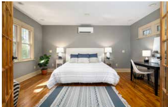
Bright Third Bedroom Addition