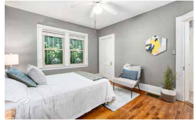
Ample Closet Space in the Primary Bedroom