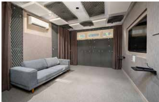
Host Movie Night in the Soundproofed Cinema Room

86 MITCHELL AVENUE Classic West Asheville Bungalow Asheville, NC 28806