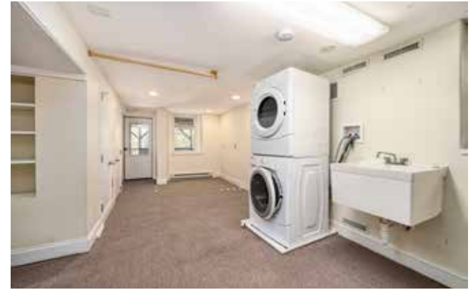
Finished Basement has Laundry and Utility Sink