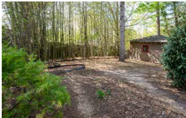
Fenced Yard, Ideal for Furry Friends