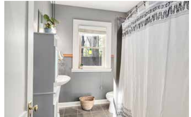
Second Full Bathroom on Main Level