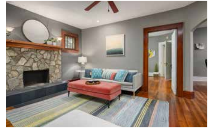
Cozy Living Room with Stone Fireplace (Non-Functional)