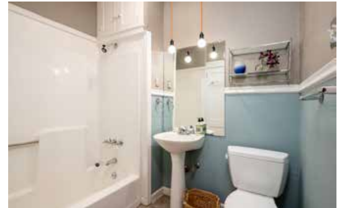
Bathroom Connects to Primary Bedroom