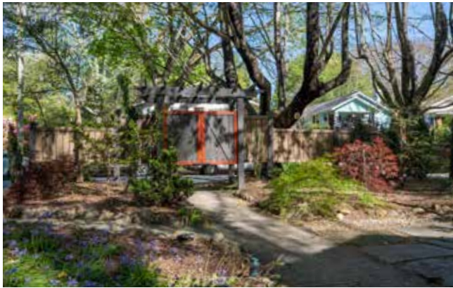
Custom Swinging Gate Welcomes You Home