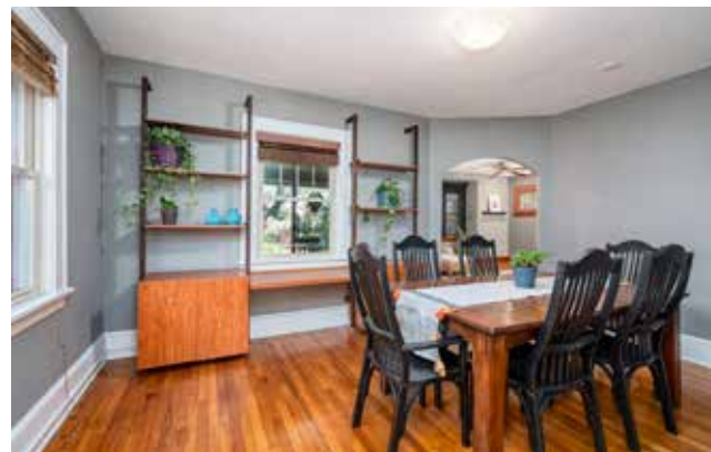
Display Shelves and Cabinets for Storage

86 MITCHELL AVENUE Classic West Asheville Bungalow Asheville, NC 28806