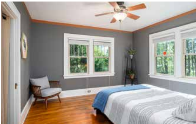
Second Bedroom with Ceiling Fan