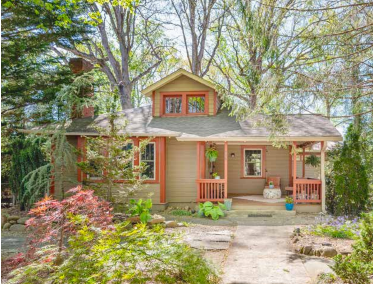
Mature Trees and Shrubs Highlight Secret Garden

Renovated and expanded bungalow in the heart of walkable West Asheville! Perfect location — just a stone’s throw from some of the area’s most popular shopping and dining. Japanese-influenced swinging gate opens to a ‘secret’ garden with mature landscaping. Outdoor living opportunities abound with a spacious covered front porch, sunny back deck, lower-level patio, and a fully fenced back yard. 3 beds and 2 baths on the main level include the primary bedroom. Dining area offers a relaxing space to gather with family and friends. Finished basement space not included in the square footage (ceiling <7’) has an exterior entrance and also provides access to the professionally soundproofed movie/media room. Detached garage is perfect for auto, tool and toy storage. Renovations include a remodeled kitchen, main-level bedroom + basement addition, replaced heating and cooling systems, replaced windows, and much more. Too many updates to list!