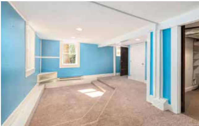
So Many Possibilities in the Finished Basement