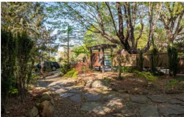
Meandering Stone Pathways