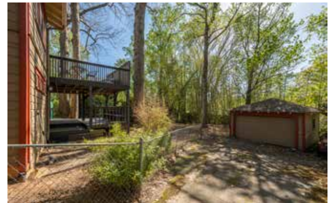
Lots of Outdoor Living and a Detached Garage