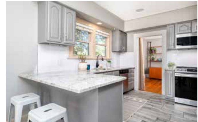
Extended Counter with Breakfast Bar