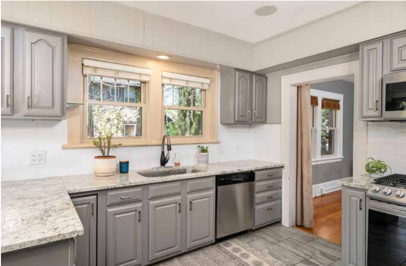
Renovated Kitchen Features Gorgeous Granite