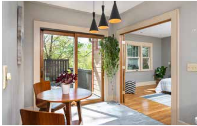
Back Deck Access