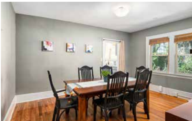
Formal Dining Room with Space for Large Table