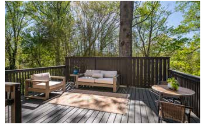
Surrounded by Mature Trees