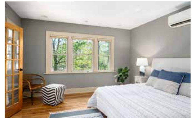
Large Windows for Abundant Natural Light