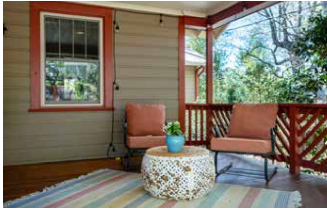
Peaceful Place to Relax