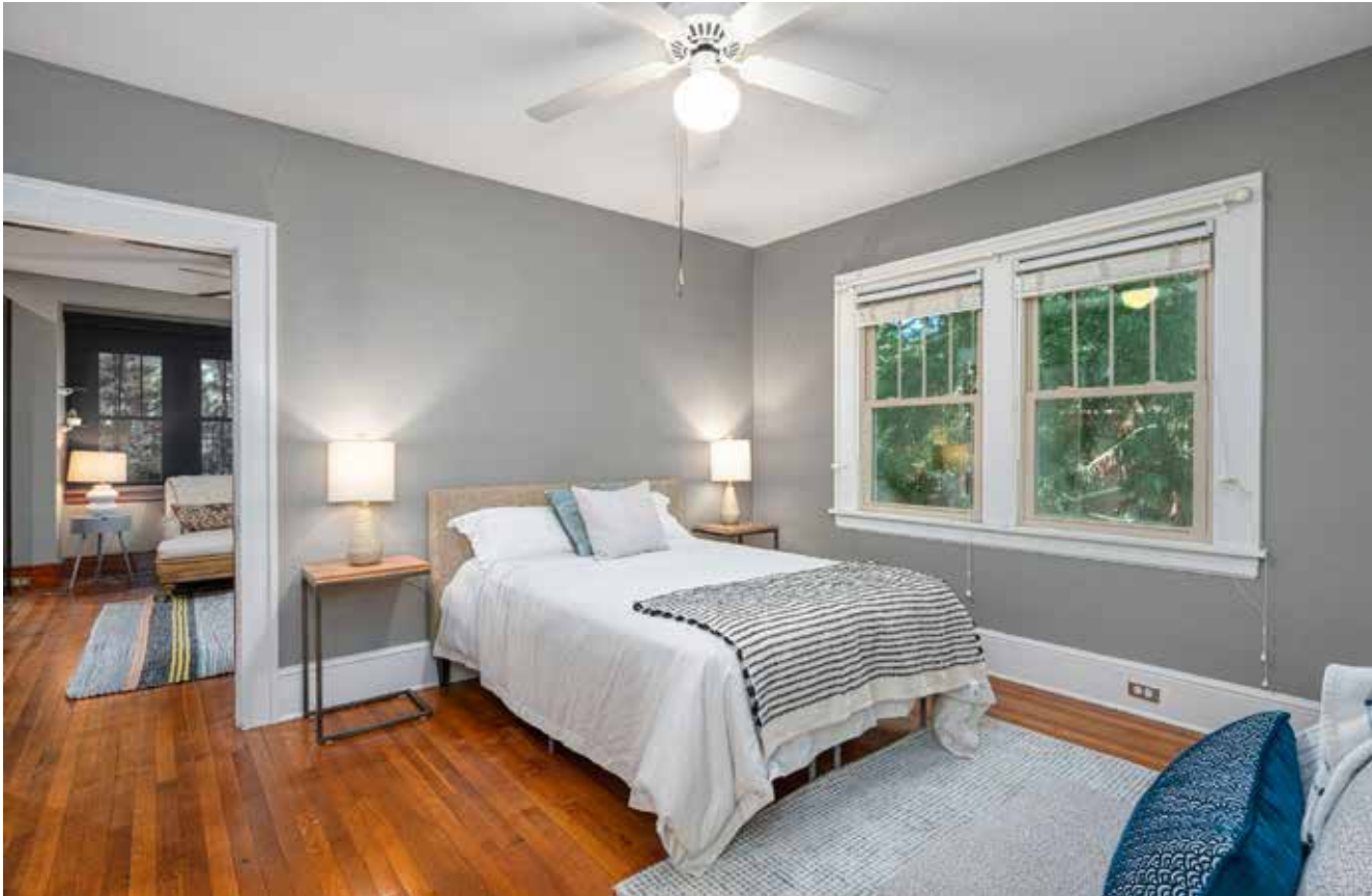
Primary Suite Gets Great Natural Light