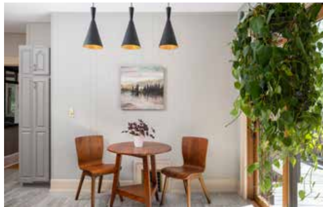
Dining Nook off of Kitchen