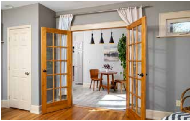
French Doors Connect Third Bedroom to Breakfast Nook