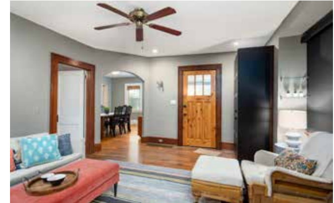
Arched Doorway Connects Living Room + Dining Room