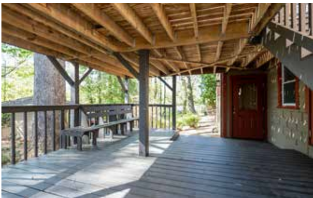
Access Door (Right) to Soundproofed Cinema Room