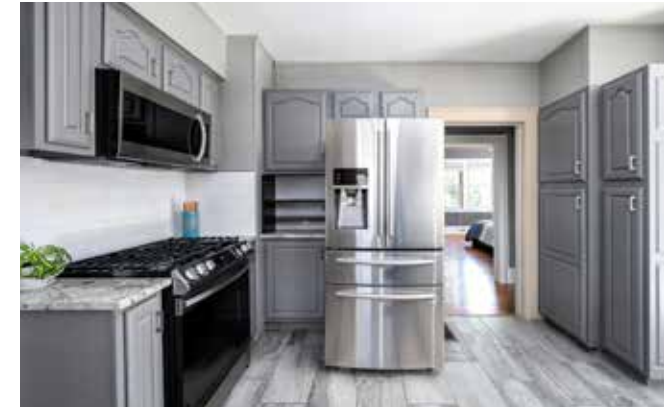
Lots of Cabinet Space and Stainless Steel Appliances