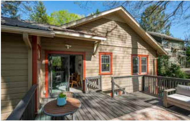
Sunny Back Deck, Perfect for Grilling and Gathering