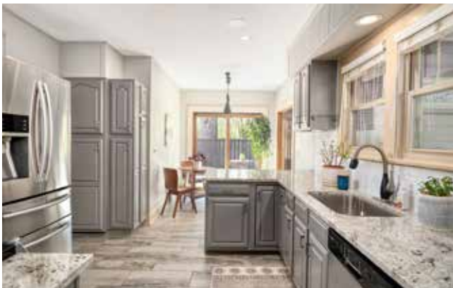
Excellent Flow through the Home