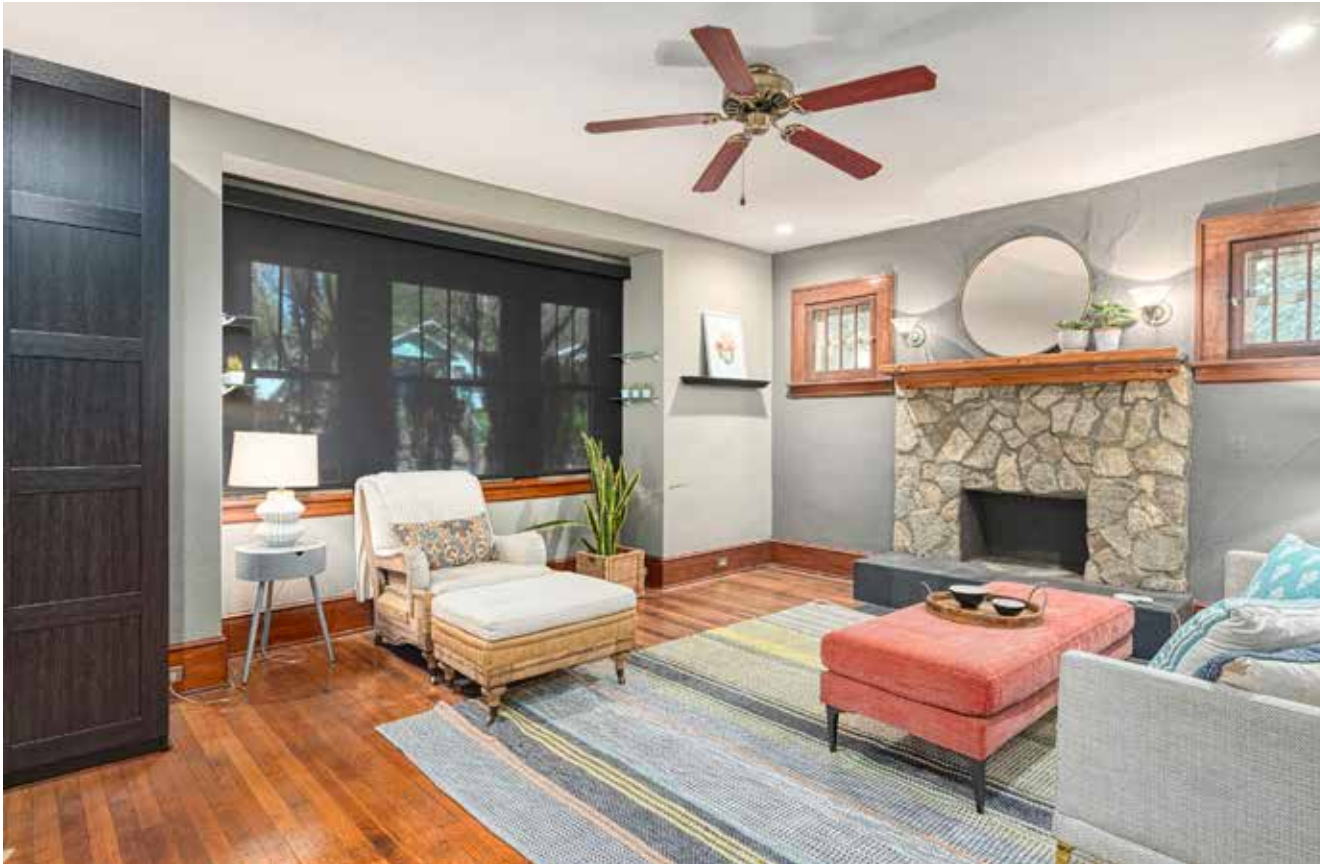
Great Space for Entertaining