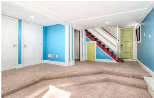
Plenty of Closets for Storage