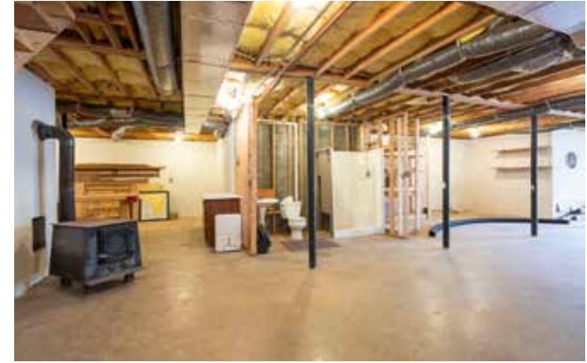
Plumbed Bathroom in Basement