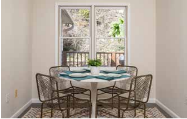
Eat-in Breakfast Nook