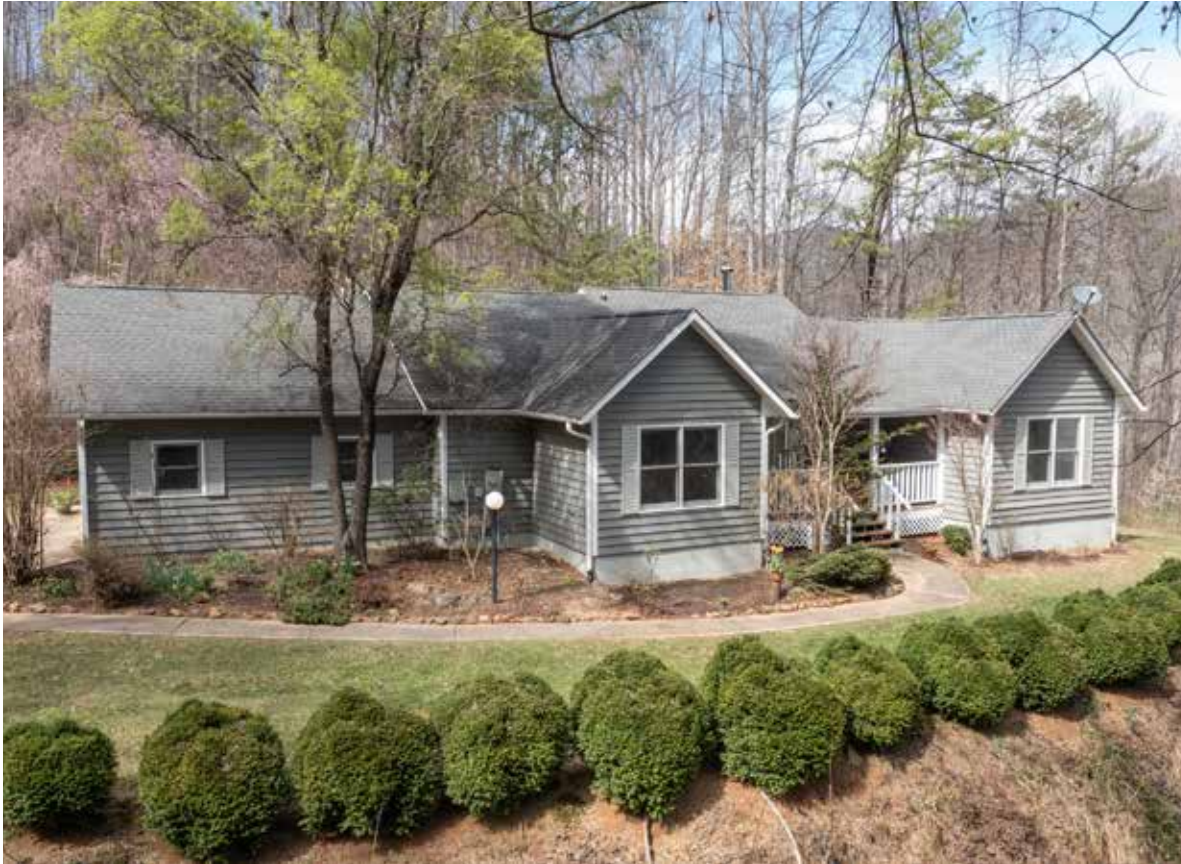
Newly Painted Home

Beautiful, move-in-ready ranch home on more than four acres offers a private retreat just minutes from I-40 and downtown Asheville. This home has many updates including new carpet, fresh interior and exterior paint, and some appliances. Level entrance from garage leads you into the kitchen where you'll find a flowing and spacious floor plan. The kitchen has a new stove, vent hood, and dishwasher, and is framed by the formal dining room and breakfast nook. The living room is an entertainer's paradise with vaulted living room ceilings, wood stove, and access to back deck. The primary bedroom features a walk-in closet, double vanity sinks, large tub, and French doors to deck. All bedrooms have wonderful natural light and great views. Large, unfinished basement has high ceilings and a plumbed bathroom already in place! This is great space for expanding your livable footprint. Home is equipped with 25 MB internet service.