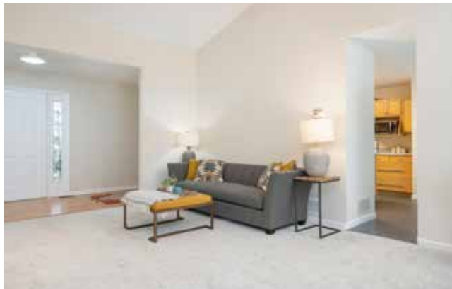
Central Living Room Has Vaulted Ceiling