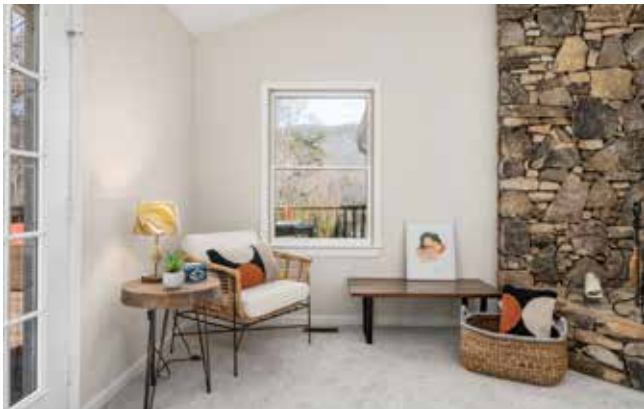
Great Spot to Relax