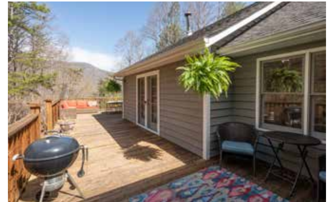
Back Deck Access from Living Room, Primary Bedroom