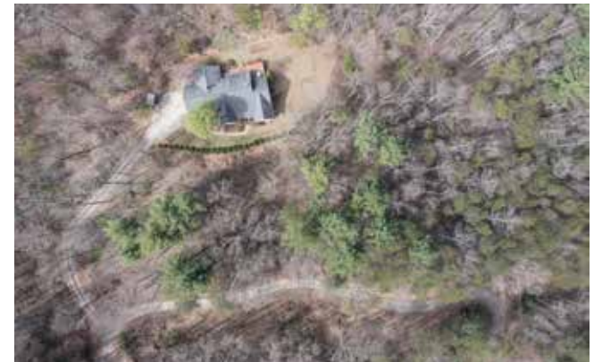
Home Sits on Level Knoll