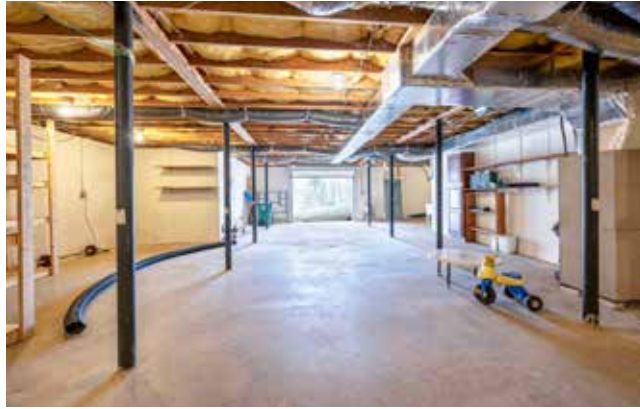
Expand Your Living Space