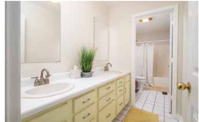
Ensuite Primary Bathroom