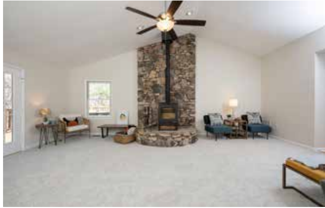
Stone Hearth Centerpiece