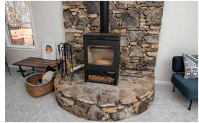
Wood-Burning Stove in Living Room