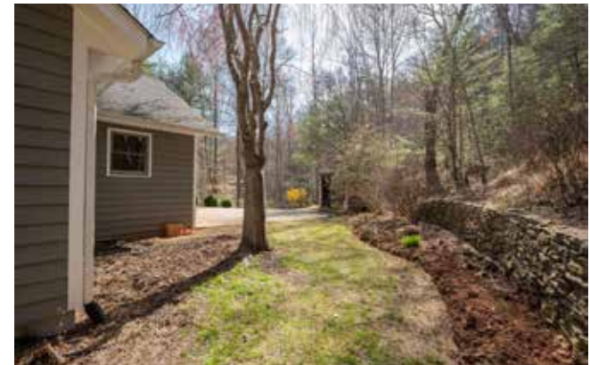
Established Garden Beds and Rock Wall