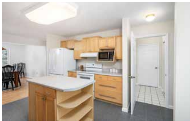
Garage Hallway Access