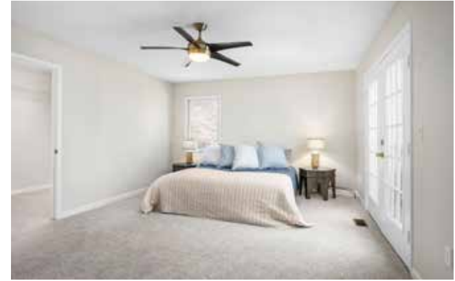
Bright Primary Bedroom with Deck Access