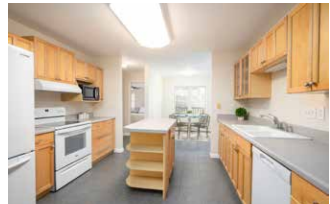
Bright Kitchen with New Appliances