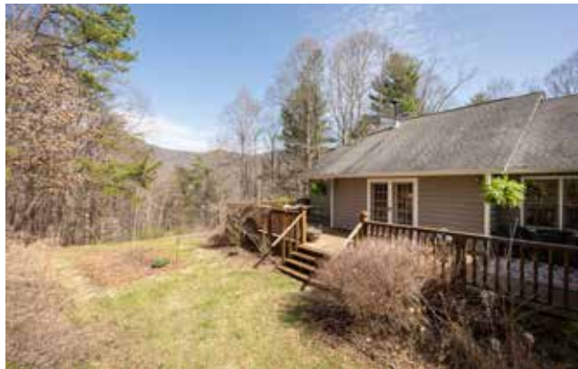
Great Spot to Garden or Relax