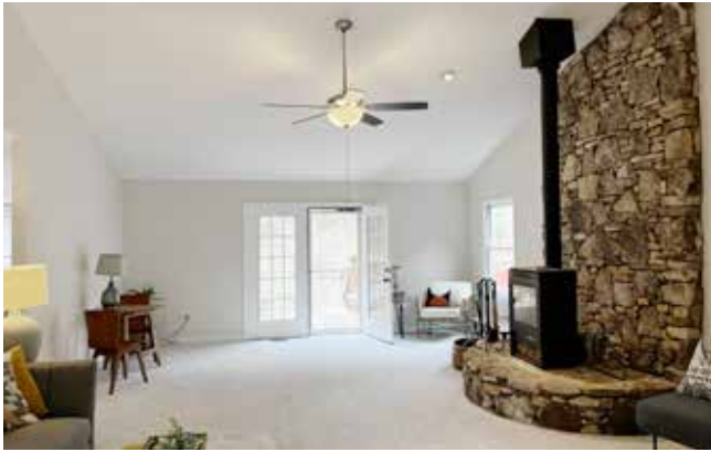
Large Living Room