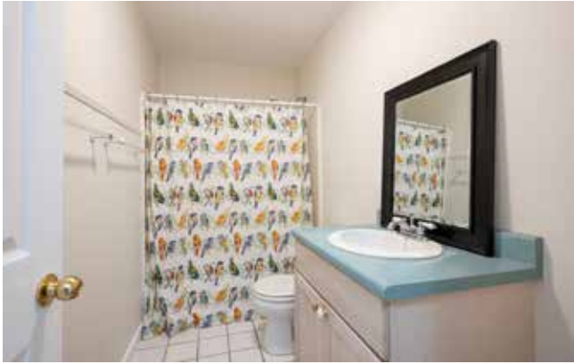
Second Bathroom • Tub/Shower Combo