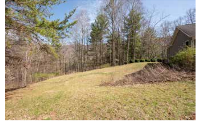
Side Yard, Ideal for Pets and Play