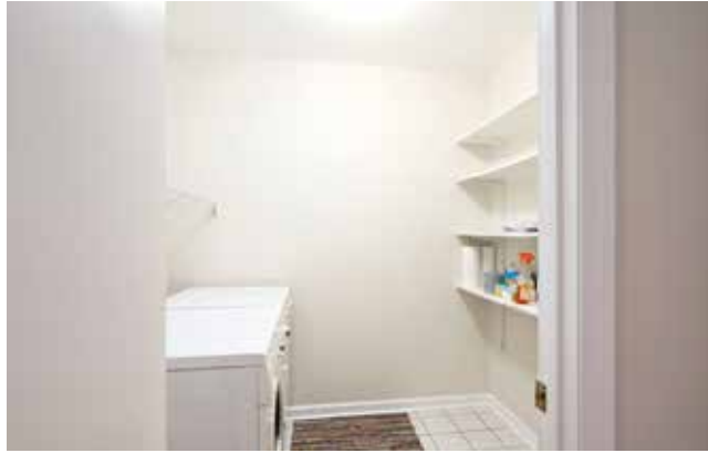
Laundry Room off Kitchen