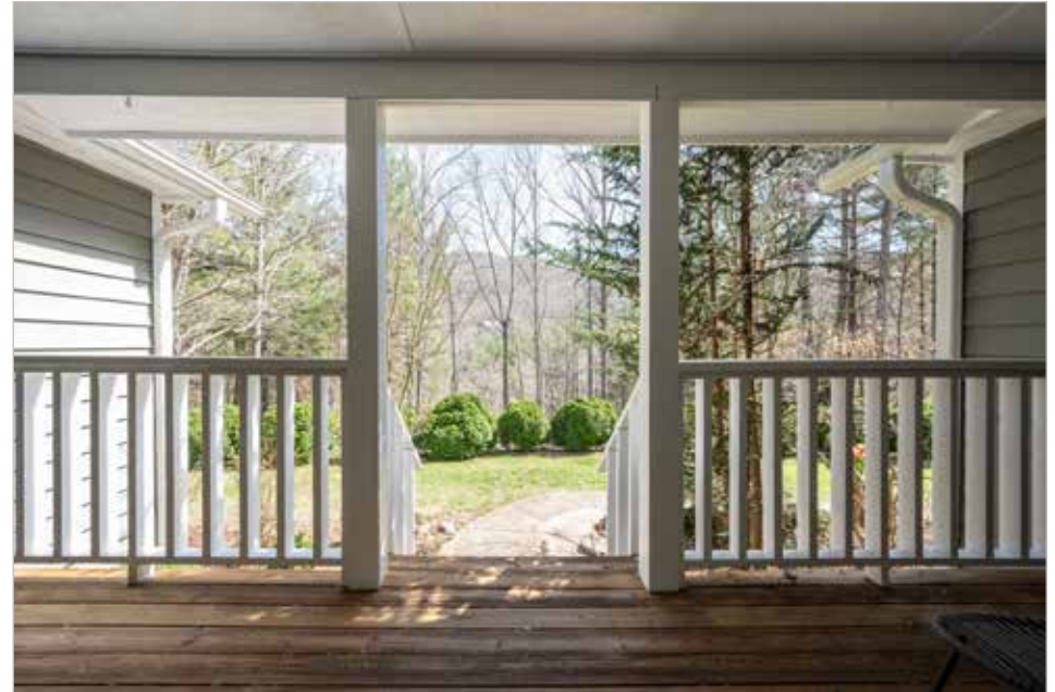
Covered Front Porch with Winter Views