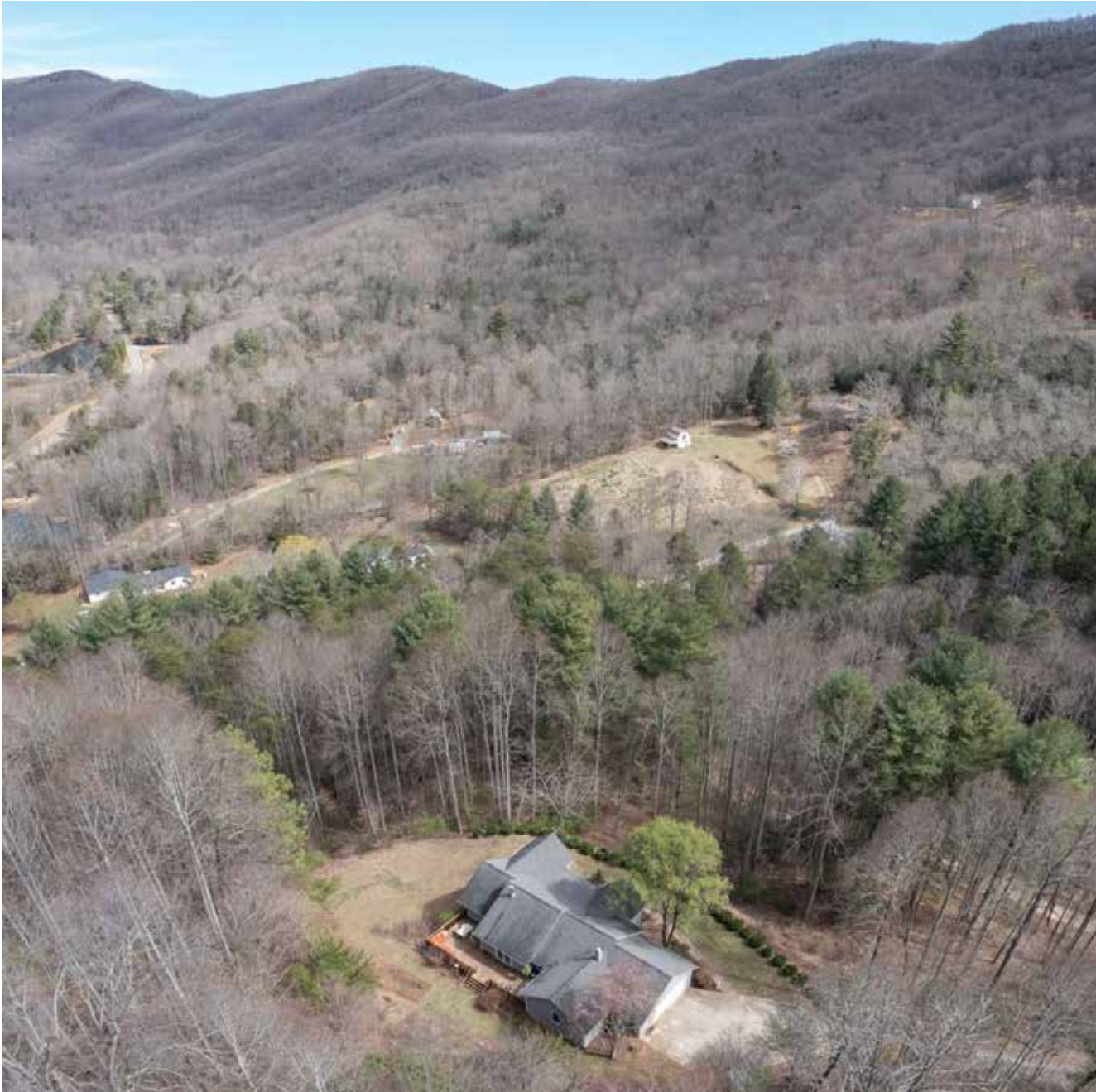
Tucked Away on 4+ Acres of Privacy