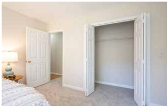
Good-Sized Closets with Shelf