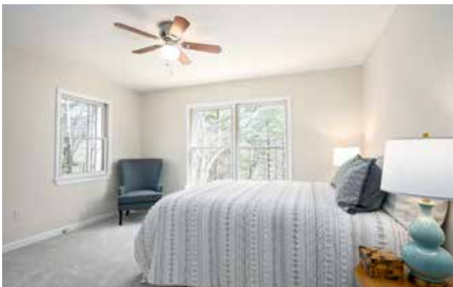
Great Views from Sunny Second Bedroom