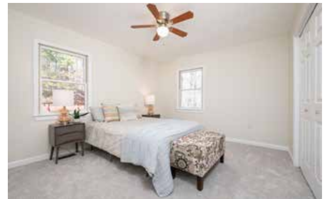
Ceiling Fan and Light in Each Bedroom