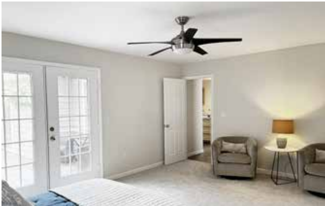
French Doors Add to the Bright and Light Primary Suite