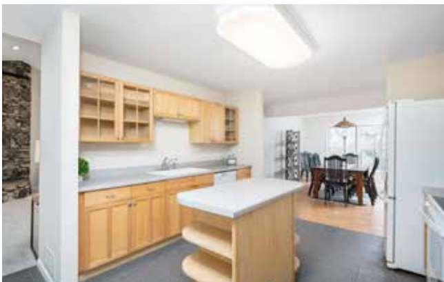
Convenient Kitchen Island • Ample Cabinet/Shelf Space